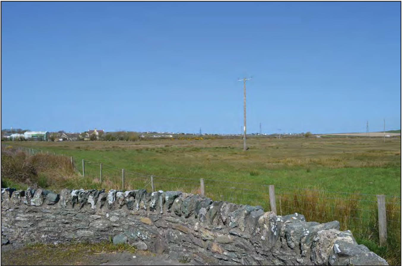
Plate 293: Route of proposed road improvement, viewed from the A5 to the SE, looking NW across fields E of Valley crossroads.