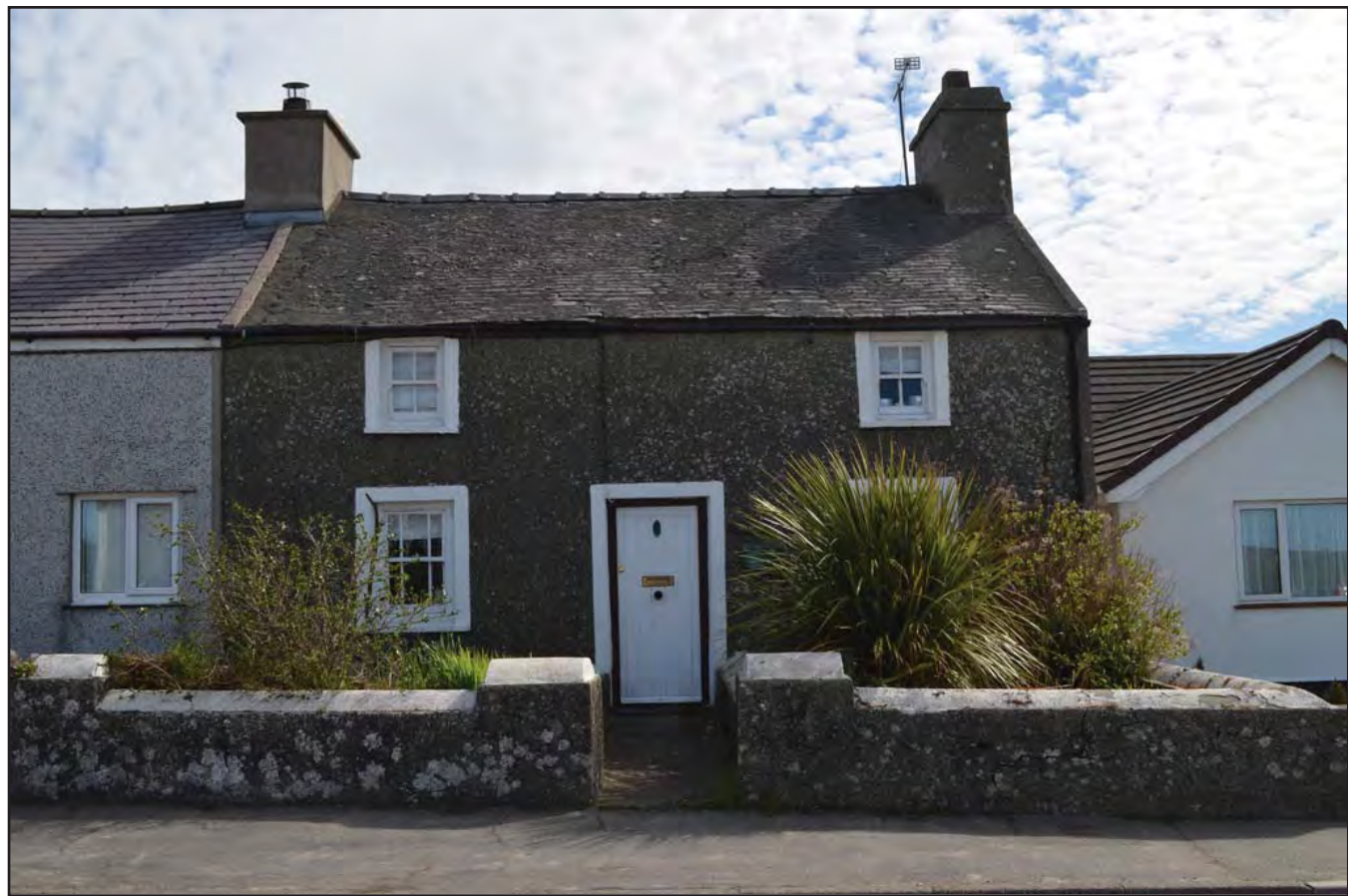
Plate 074: Asset 087, Bryn Glas, viewed from the SE.