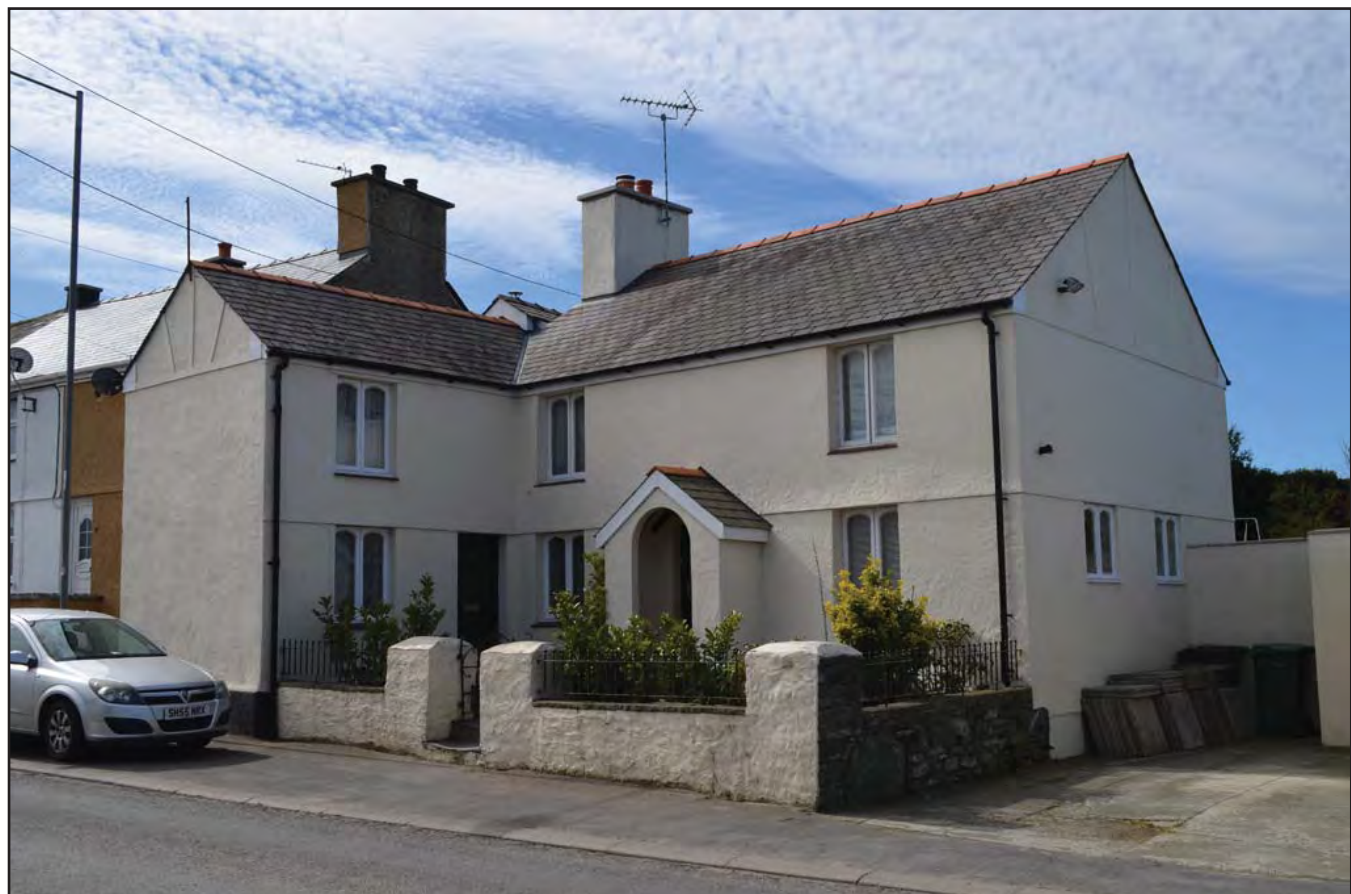
Plate 070: Asset 082, Berth, viewed from the N.