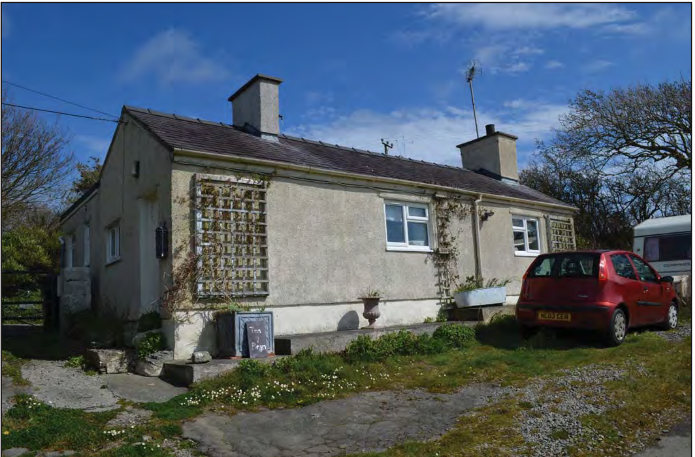
Plate 110: Asset 123, Tan-y-bryn, viewed from the W.