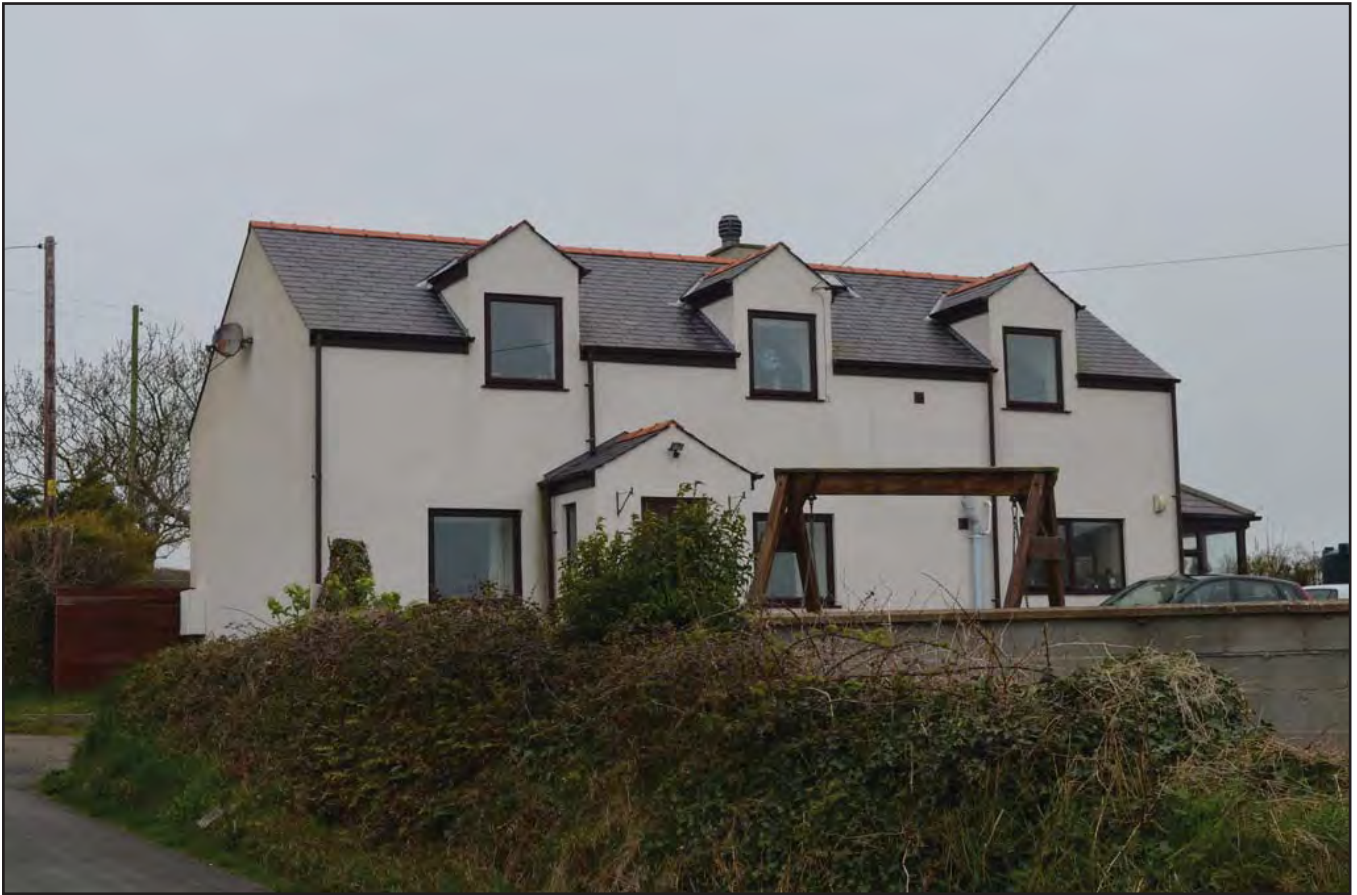
Plate 139: Asset 155, Rallt Goch, viewed from the SE.