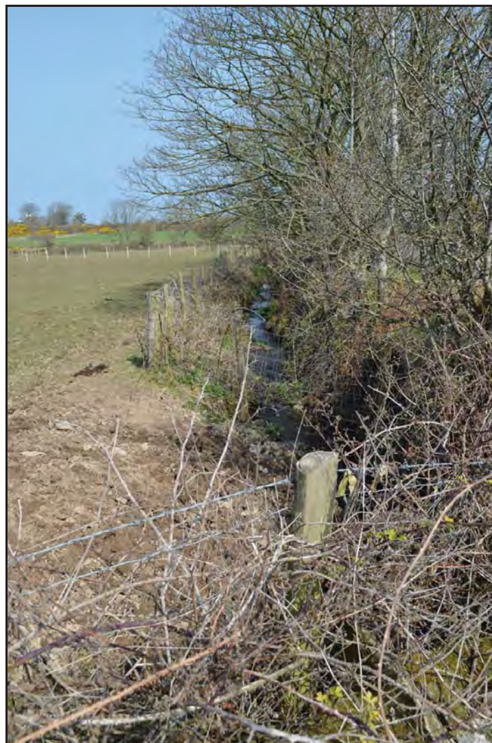
Plate 222: Asset 246, tail race at Melin Ty'n y Felin, viewed from the S.