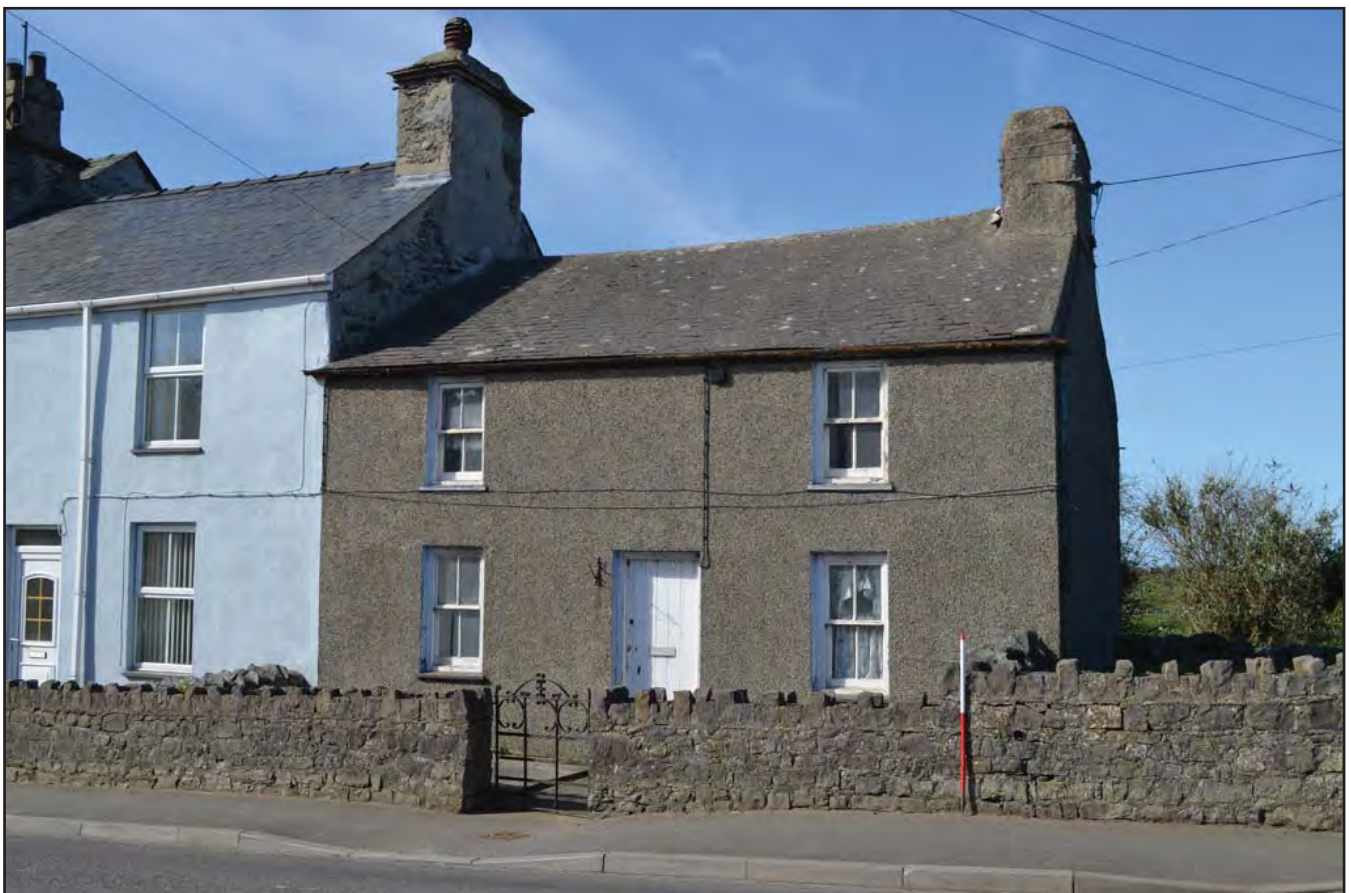
Plate 084: Asset 097, Cross Keys (former Llanfatraeth Smithy) , viewed from the NE.