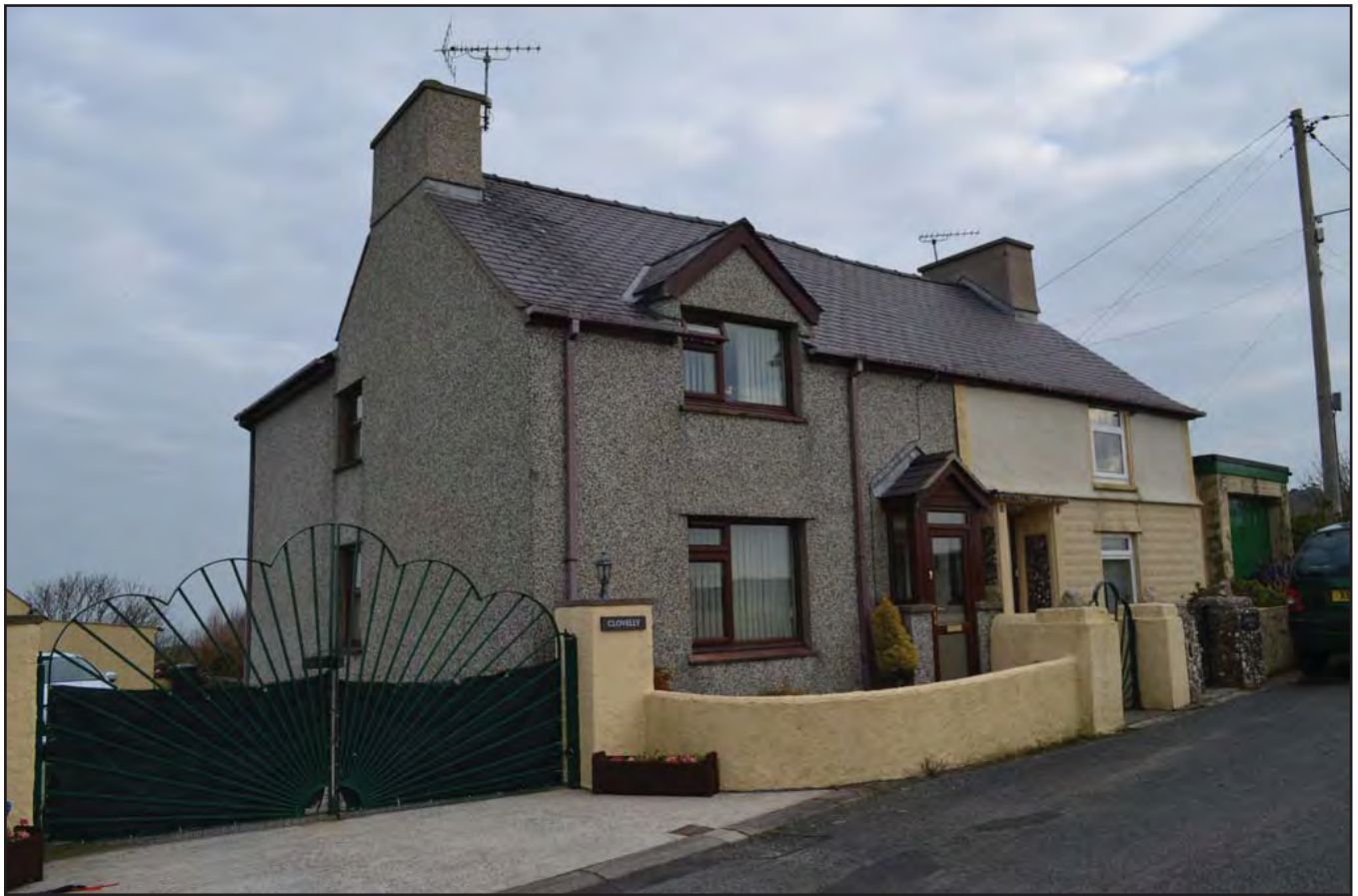
Plate 289: Asset 319, Clovelly and Pentregof Bach, viewed from the SW.