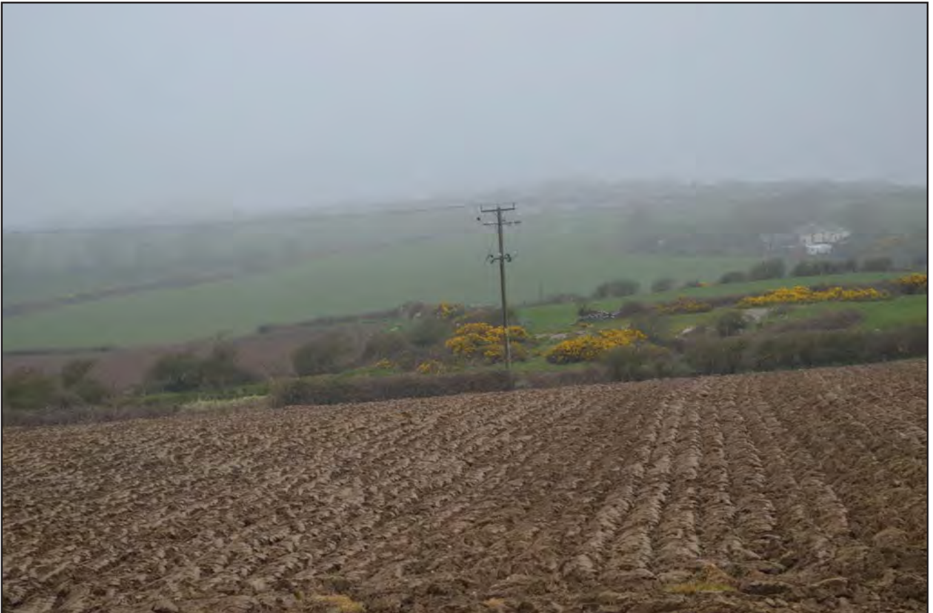
Plate 138: Asset 154, site of Ty Gadwgan, viewed from the SE.