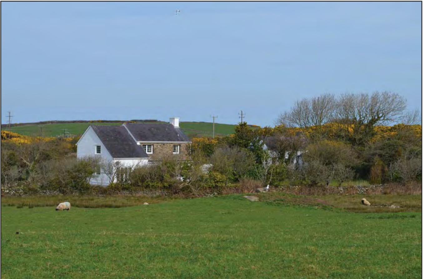
Plate 256: Asset 283, Ty'n-y-Mynydd, viewed from the SE.