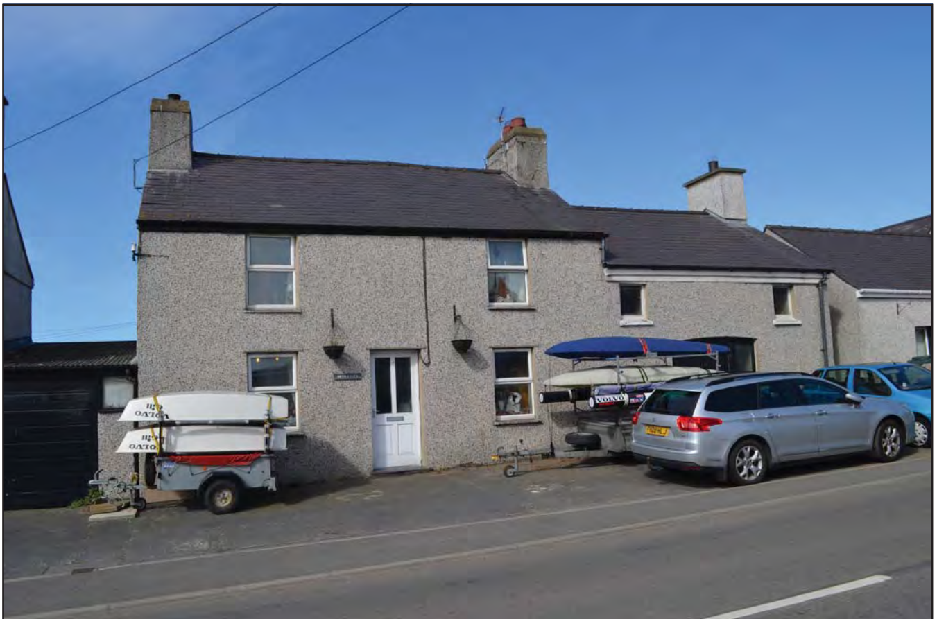
Plate 080: Asset 093, Bryn Celyn, viewed from the E..