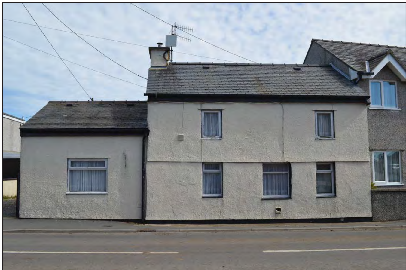
Plate 064: Asset 073, Hen Efail, viewed from the WSW.