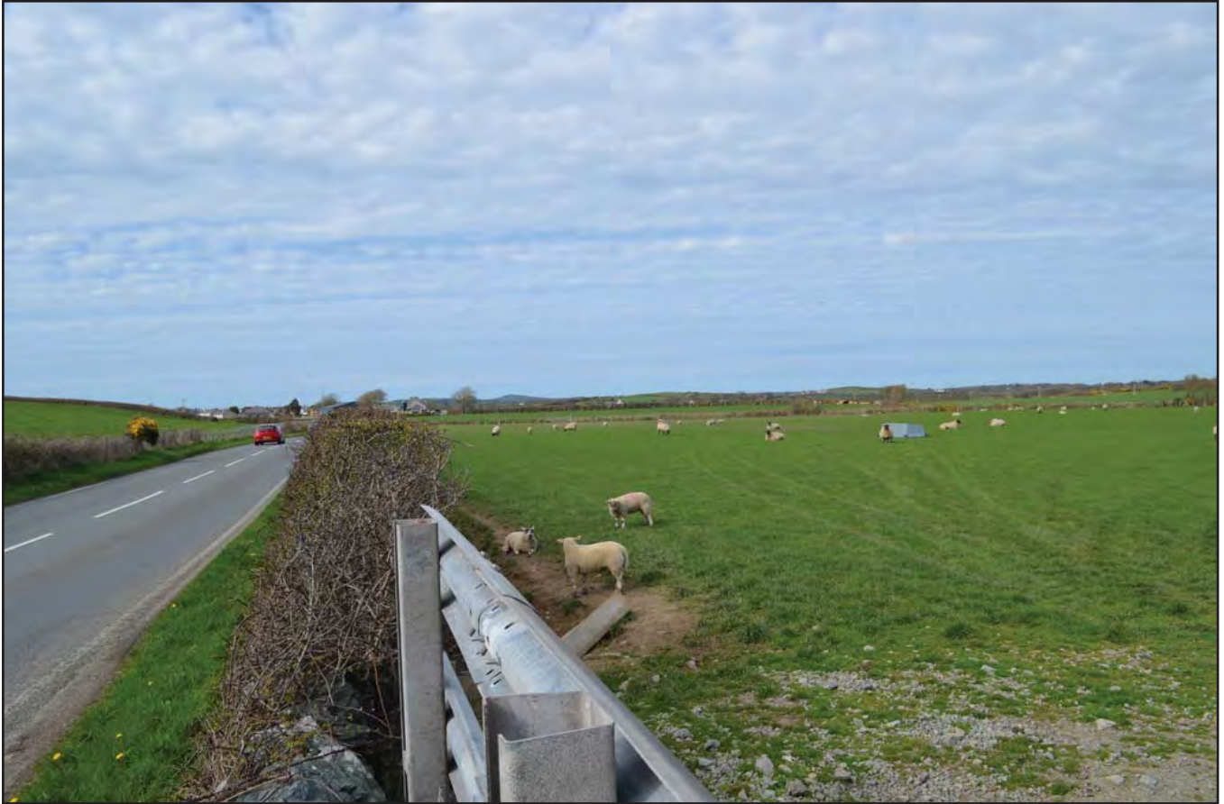
Plate 301: Route of proposed Llanfachraeth bypass as it rejoins A5025 to the S, viewed from the S, NE of Asset 42.