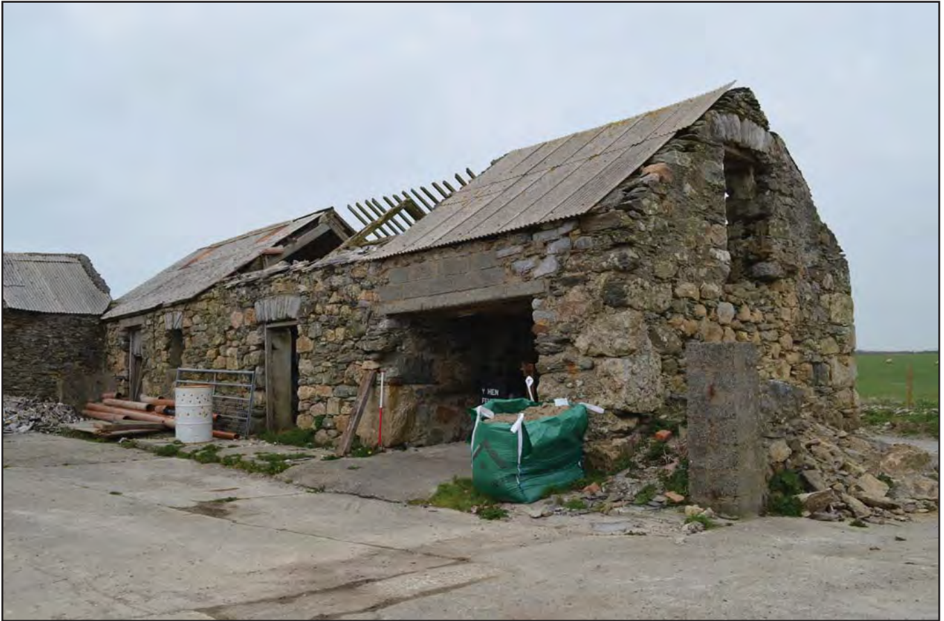
Plate 173: Asset 190, Bodhelen outbuildings, viewed from the SE.