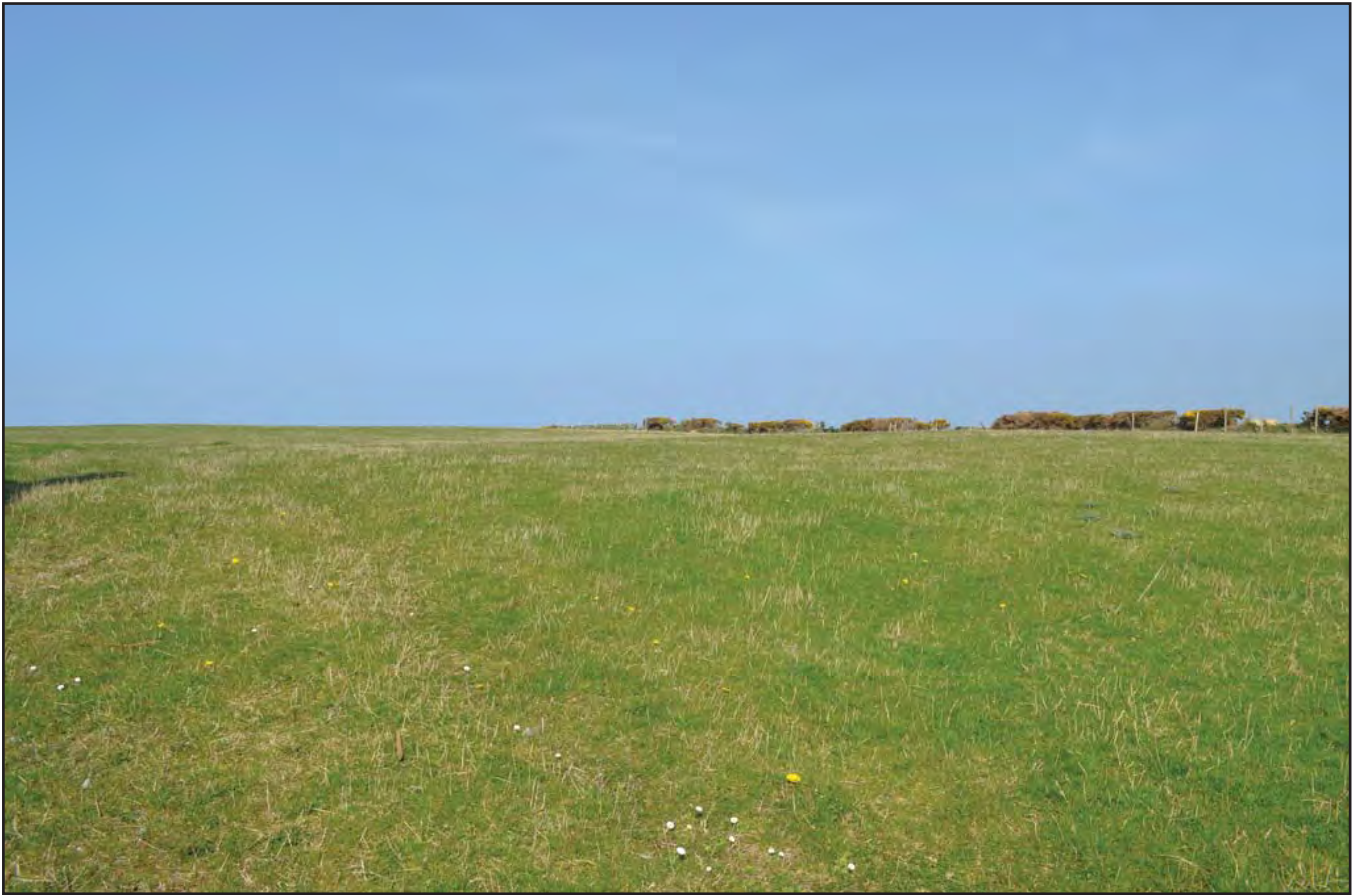
Plate 207: Asset 230, site of Early Christian Burials, Llanrhuddlad, viewed from the Gateway at SE corner of field, viewed from the SW