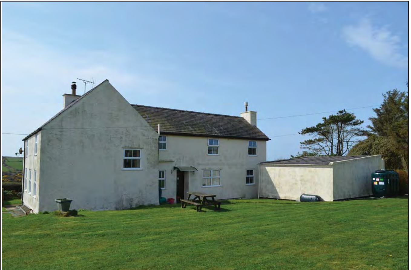
Plate 186: Asset 208, Aber Pwll, viewed from the NE.