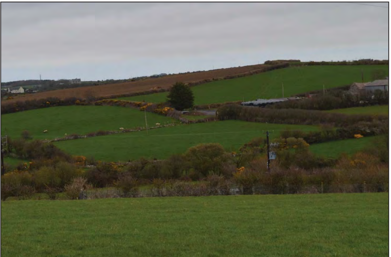
Plate 170: Asset 187, site of Early Christian Burial Ground, Hen Shop and ruined building W of Berth, viewed from the SW.