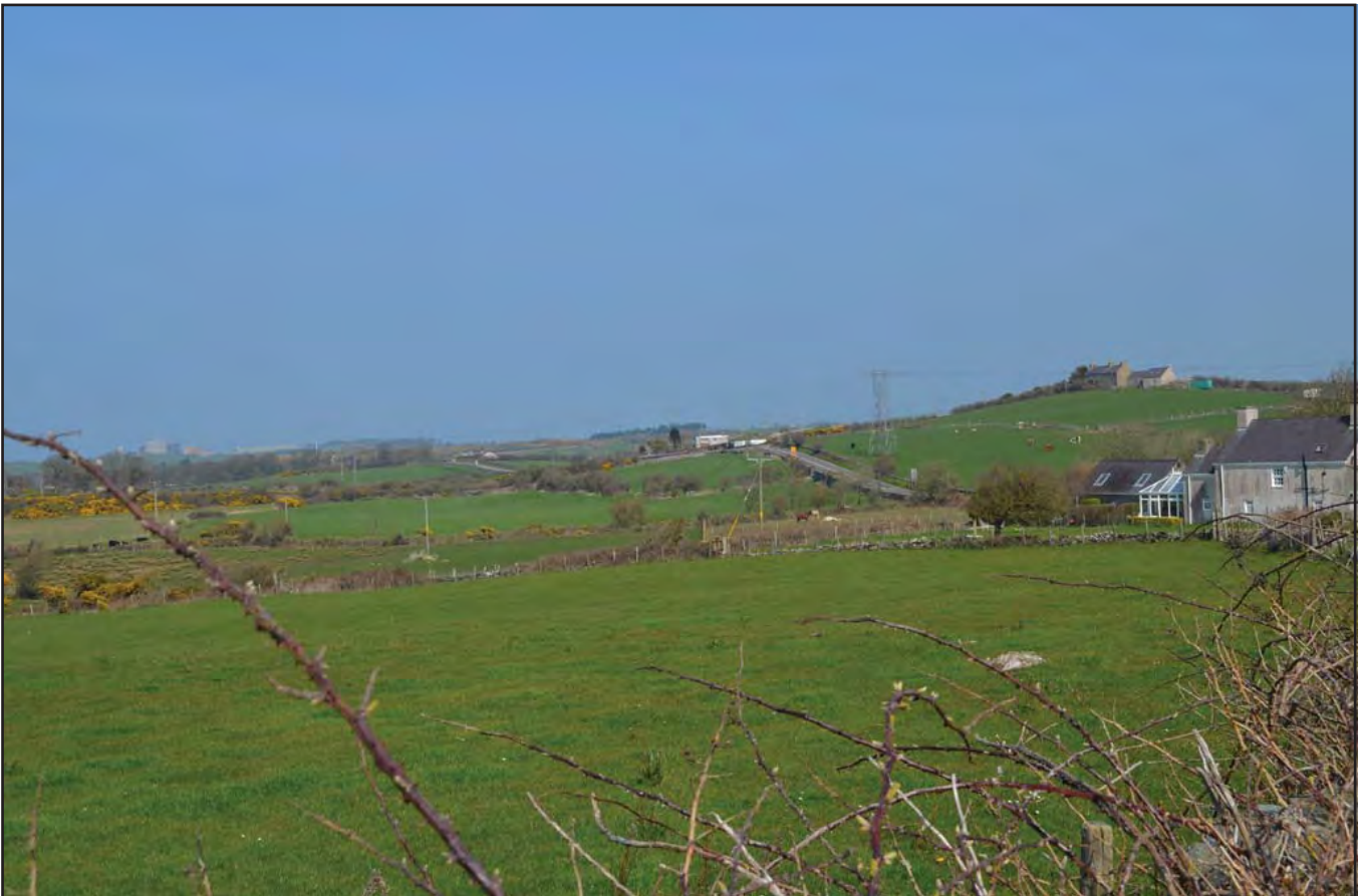
Plate 322: Route of proposed road improvement W of Ty'n y Felin looking from SW to NE, viewed from NE of Asset 237.