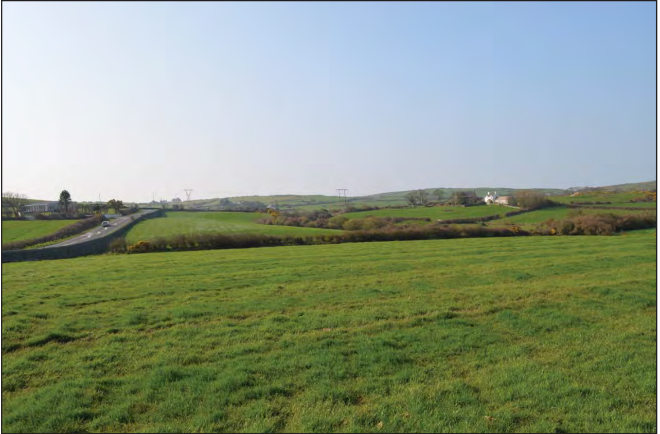
Plate 327: Route of proposed road improvement, looking from N to S, viewed from field SSW of Cefn Coch.