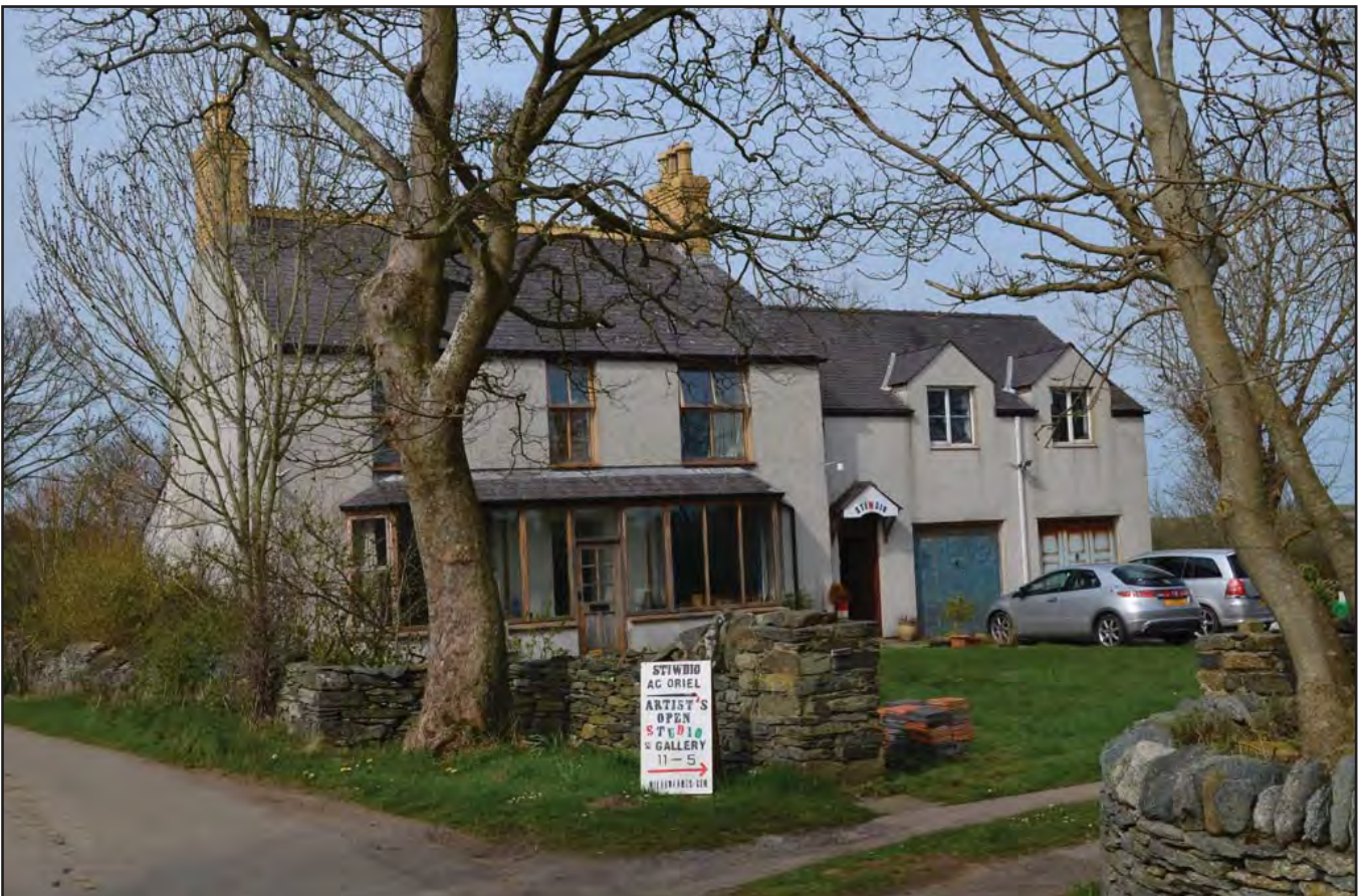
Plate 248: Asset 276, Ty-n-felin, viewed from lane to the ESE.