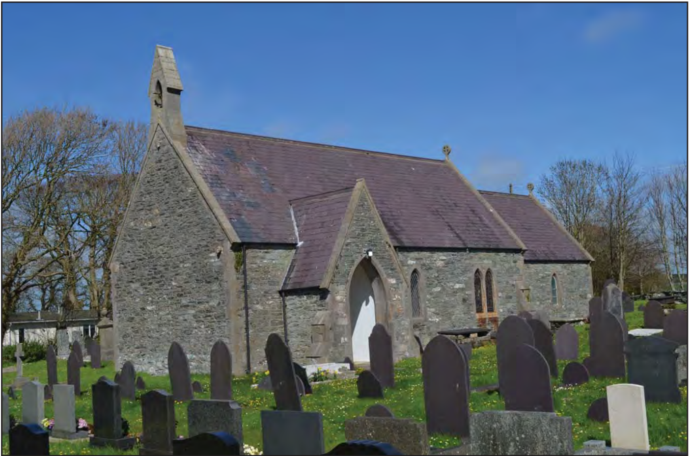
Plate 101: Asset 114, St Machraeth's Church, viewed from the SW.