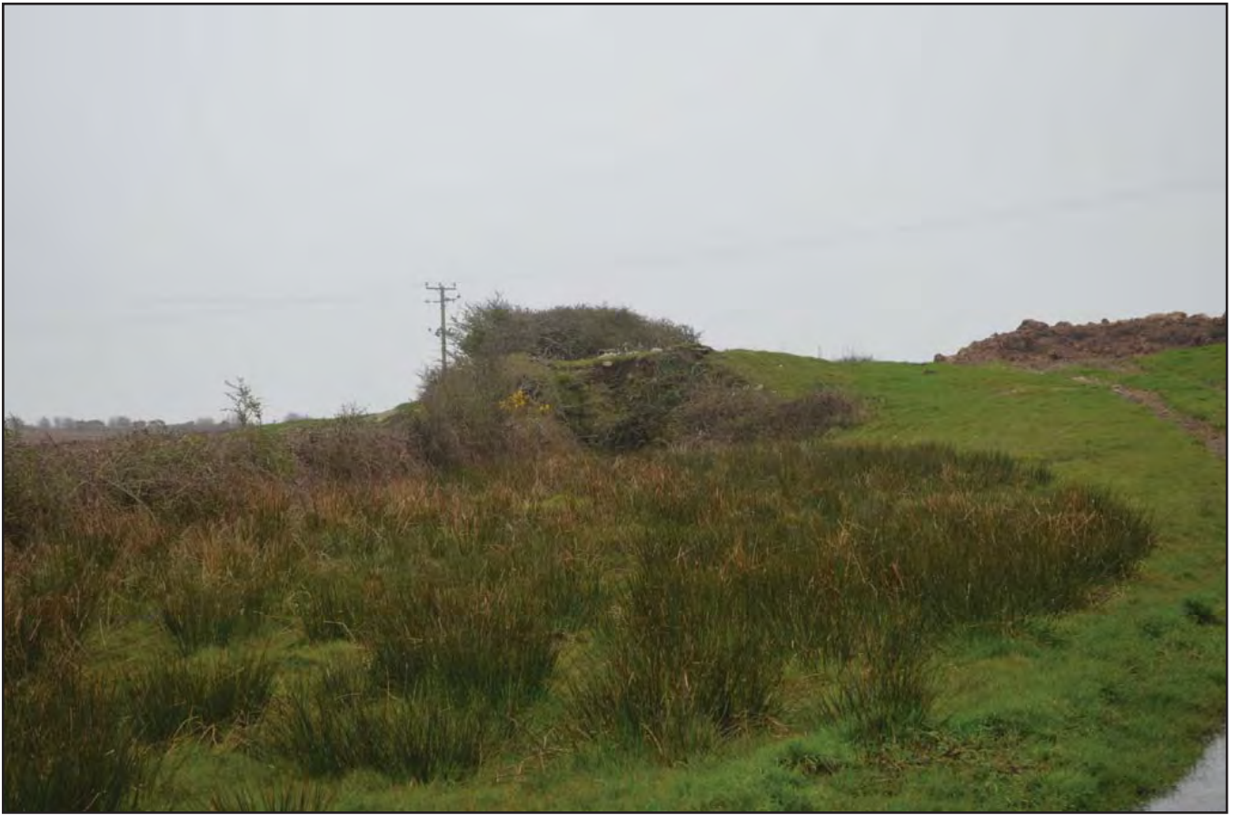
Plate 137: Asset 153, disused lime kiln NW of Black Lion Inn, viewed from the NE.