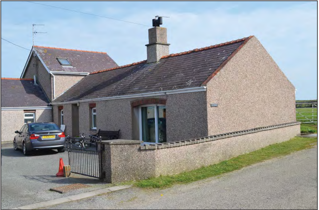
Plate 197: Asset 220, Sin Nombre, viewed from the SW.