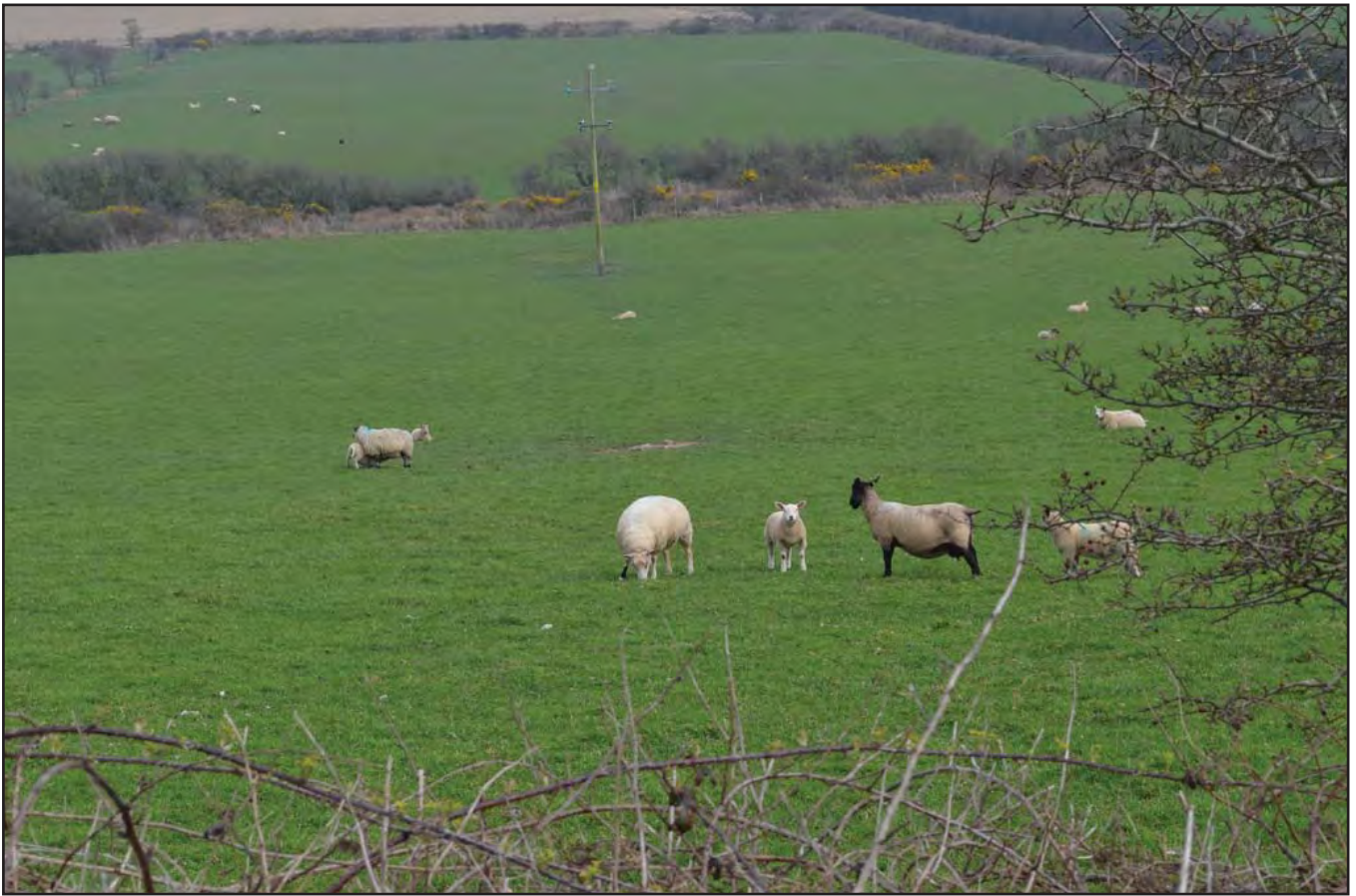
Plate 177: Asset 197, well E of Bryn Maethlu, viewed from the W.