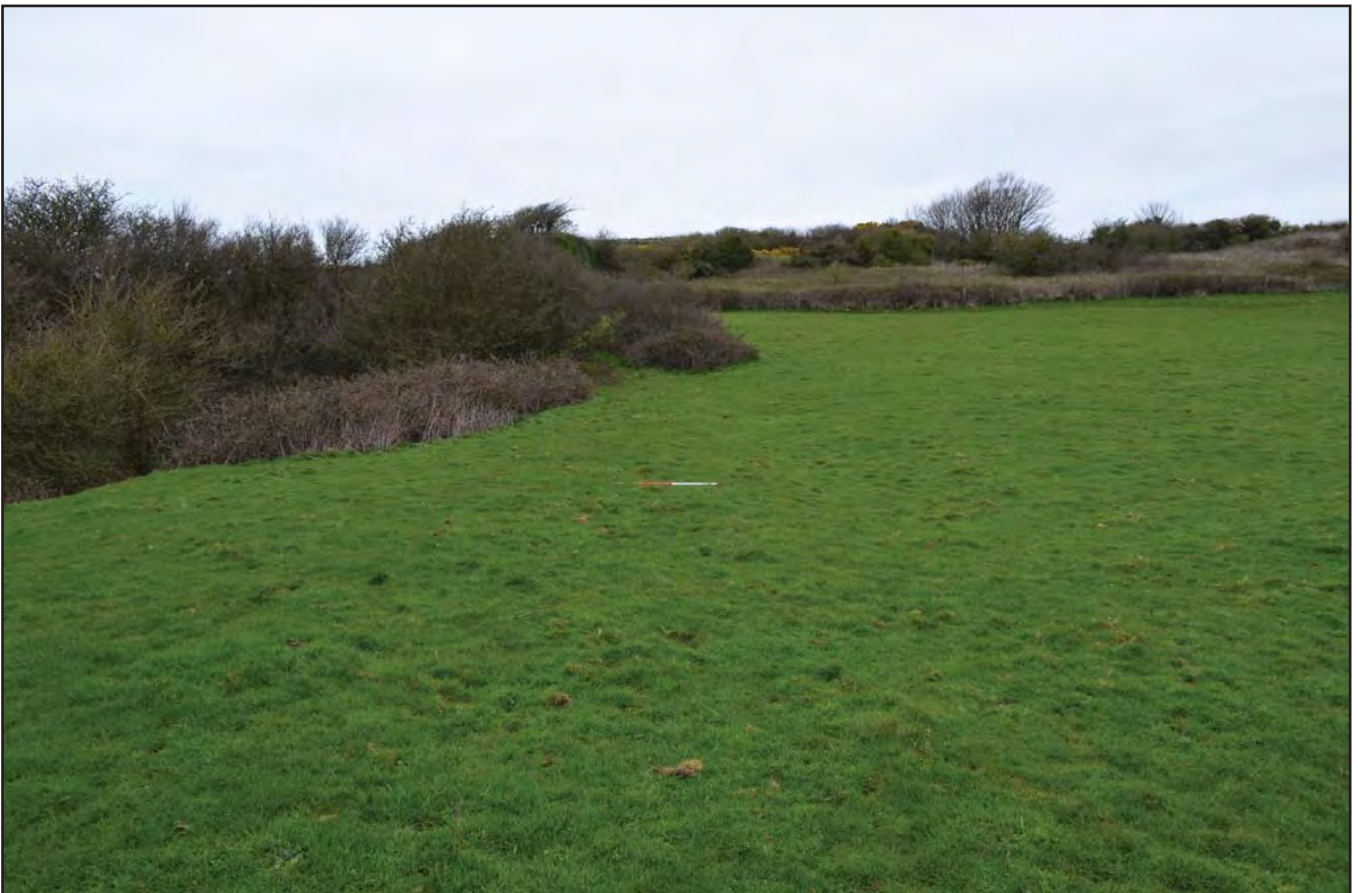
Plate 164: Asset 180, trackway to the northwest of Ty'n-yr-Ardd, viewed from the SE.