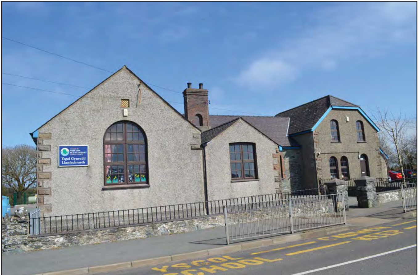
Plate 097: Asset 110, Ysgol Gynradd Llanfachraeth, viewed from the NW.