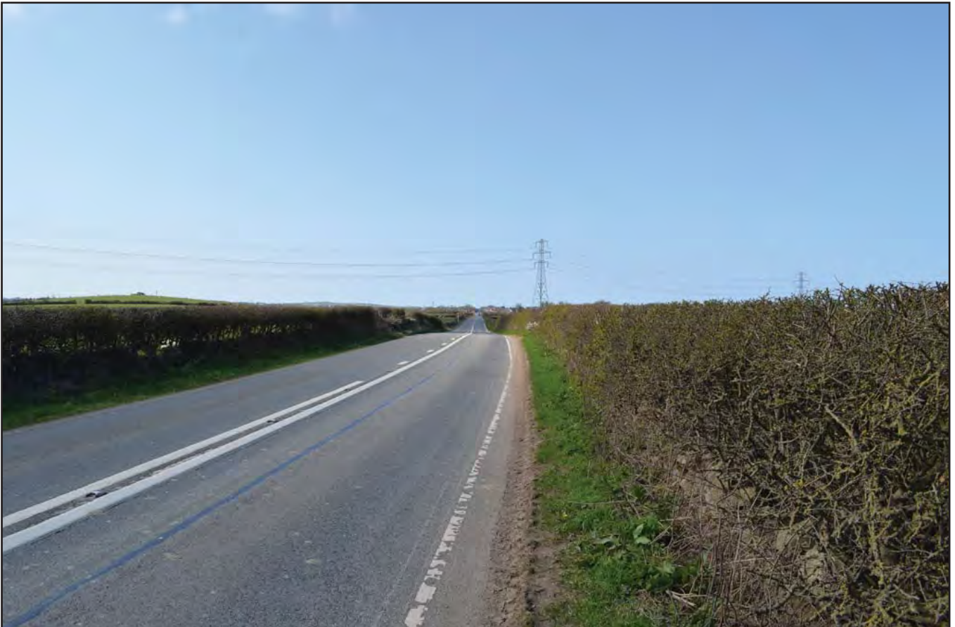
Plate 292: Asset 322, route of old 'Post-road' under current A5025, SE of Tyddyn y Gof, viewed from the NE.