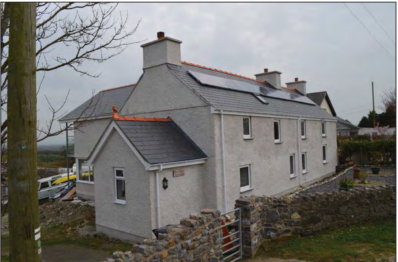
Plate 172: Asset 189, Bod Halen Farmhouse, viewed from the NW.