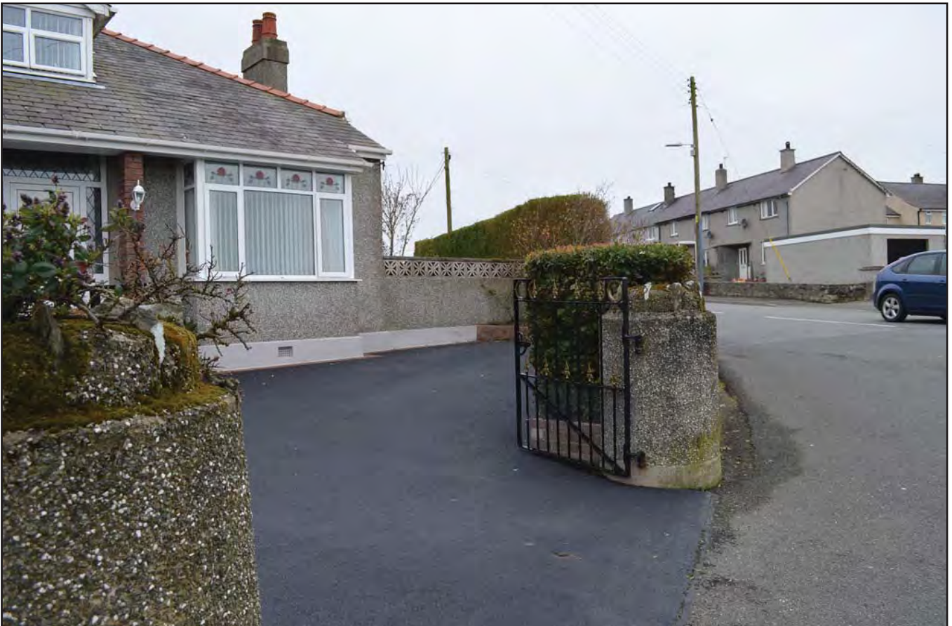
Plate 156: Asset 171, site of building W of Smidde Wen, viewed from the NE.