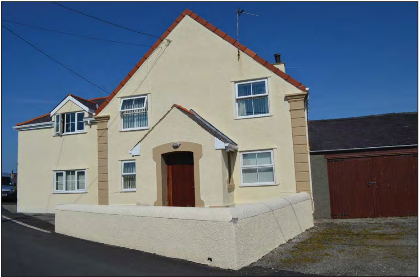
Plate 267: Asset 297, Bethania Chapel, viewed from the SE.