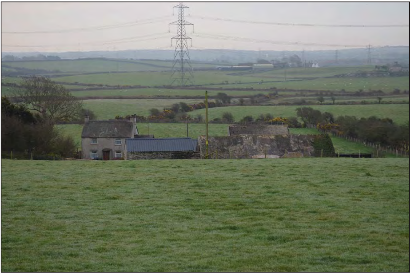
Plate 291: Asset 321, Gwyddelyn Fawr, viewed from the N.