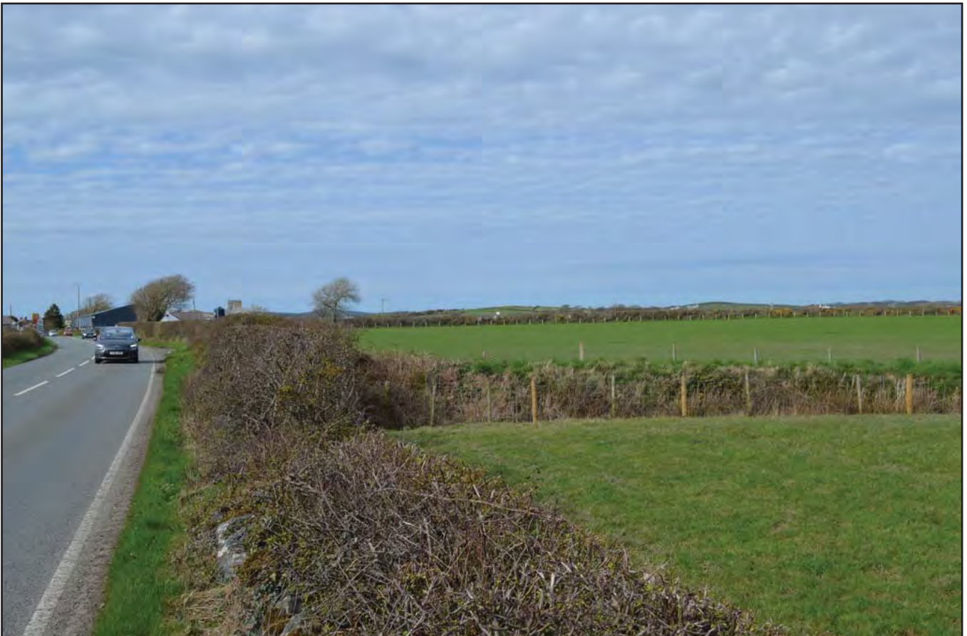
Plate 302: Route of proposed Llanfachraeth bypass as it rejoins A5025 to the S, viewed from the S, S of Asset 43.