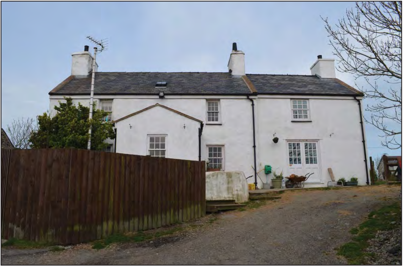
Plate 193: Asset 216, Tyddyn Waen, viewed from the SE.