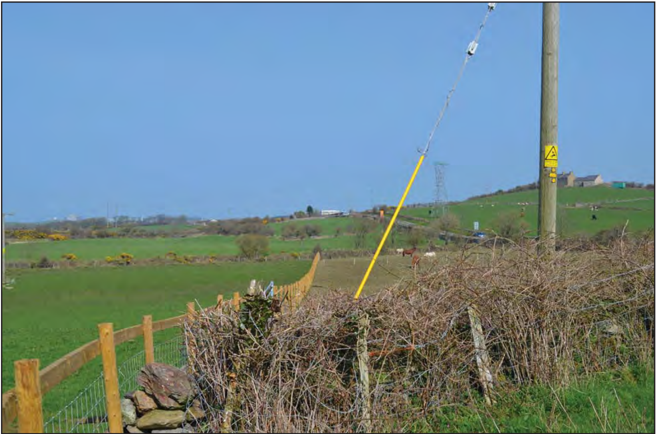
Plate 323: Route of proposed road improvement, viewed from field W of Ty'n y Felin looking from SW to NE.