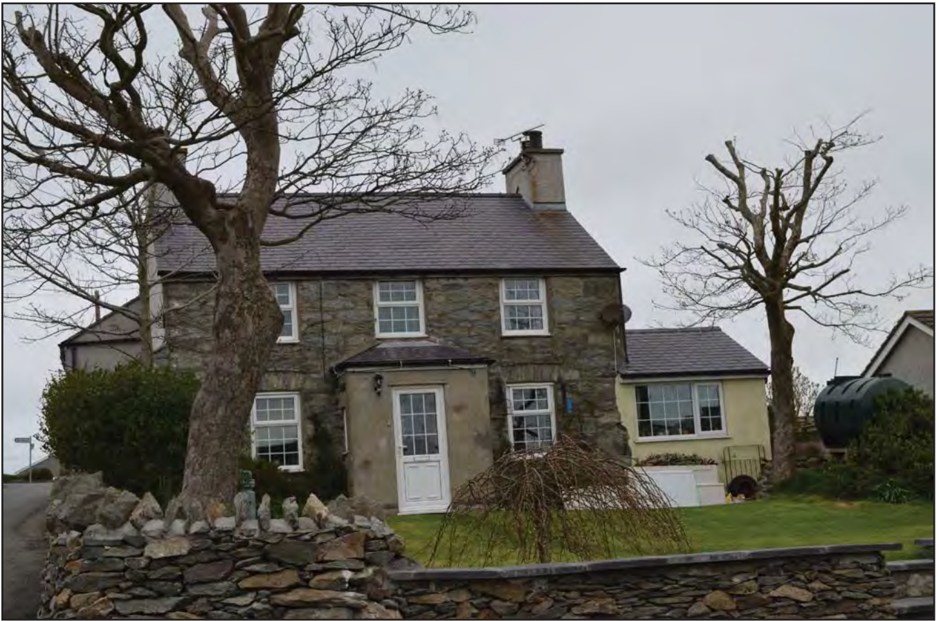
Plate 157: Asset 172, Brynllwyd, viewed from the SE.