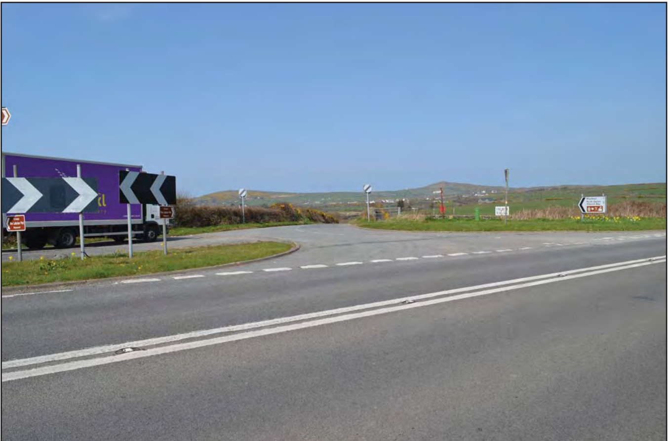
Plate 316: Route of proposed road improvement, junction of A5025 and road to Rhydwyn, viewed from the SE.