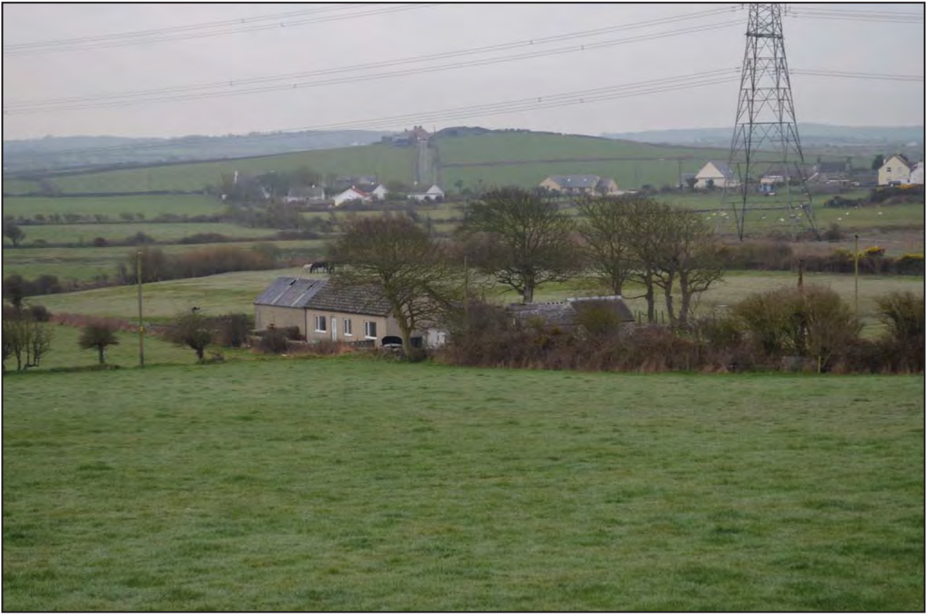
Plate 285: Asset 314, Gwyddelyn Bach, viewed from the NE.