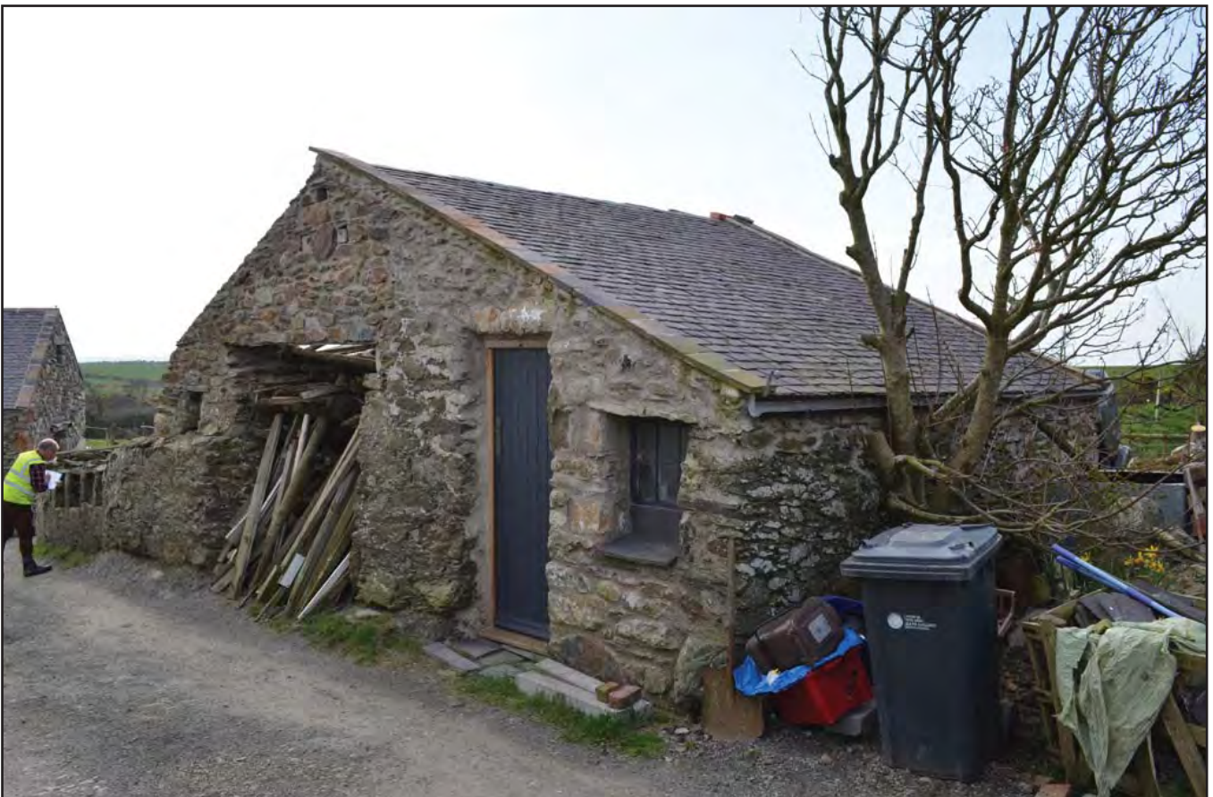
Plate 192: Asset 215, buildings to the south of Tyddyn Waen, viewed from the NW.