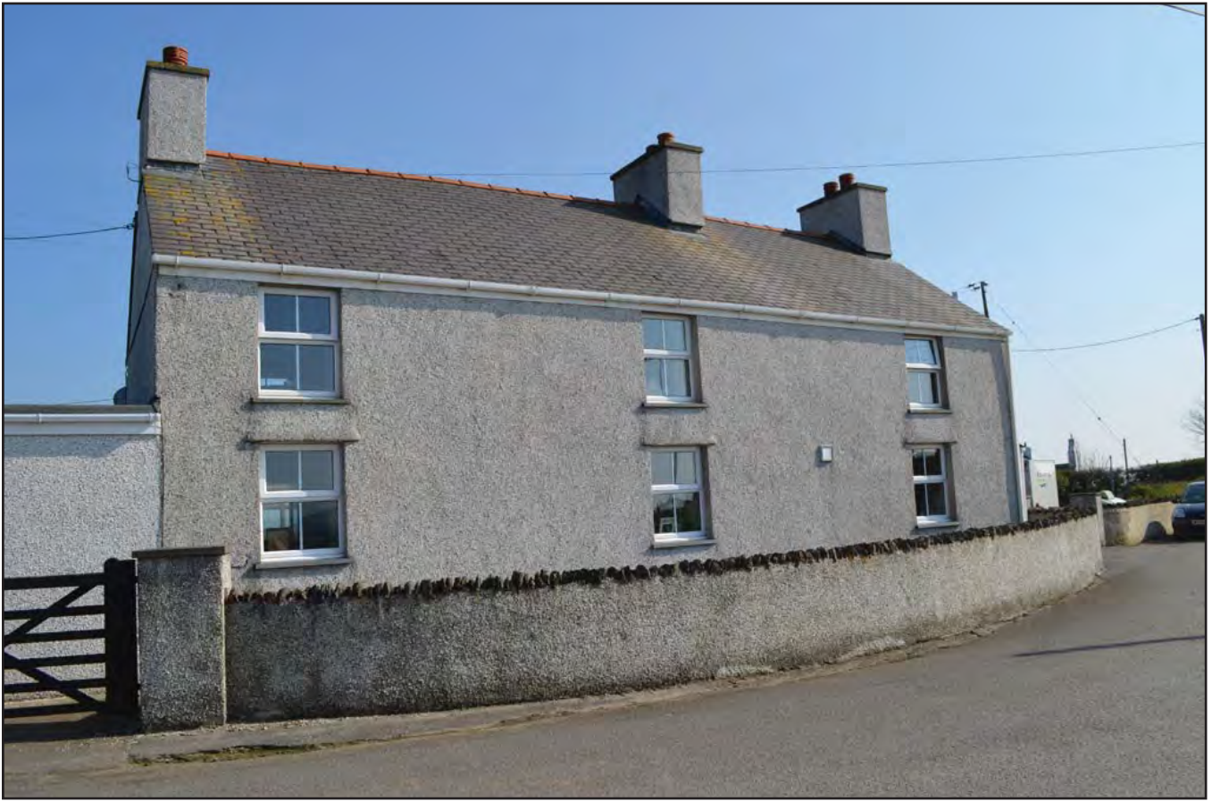
Plate 199: Asset 222, Ty'n-gongl, viewed from the NW.