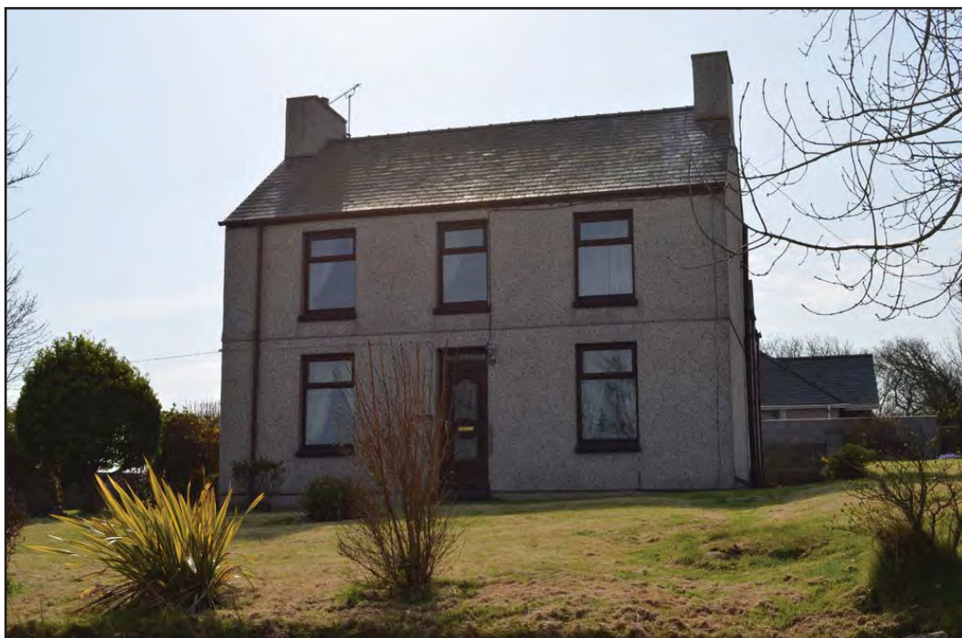
Plate 196: Asset 219, Ty'n-lon, viewed from the NNW.