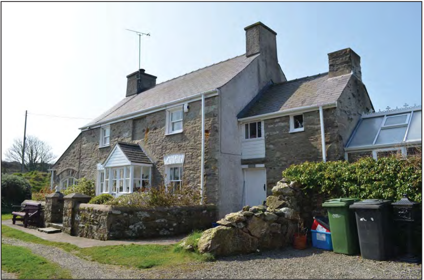
Plate 217: Asset 242, Ty'n Felin, viewed from the NE.