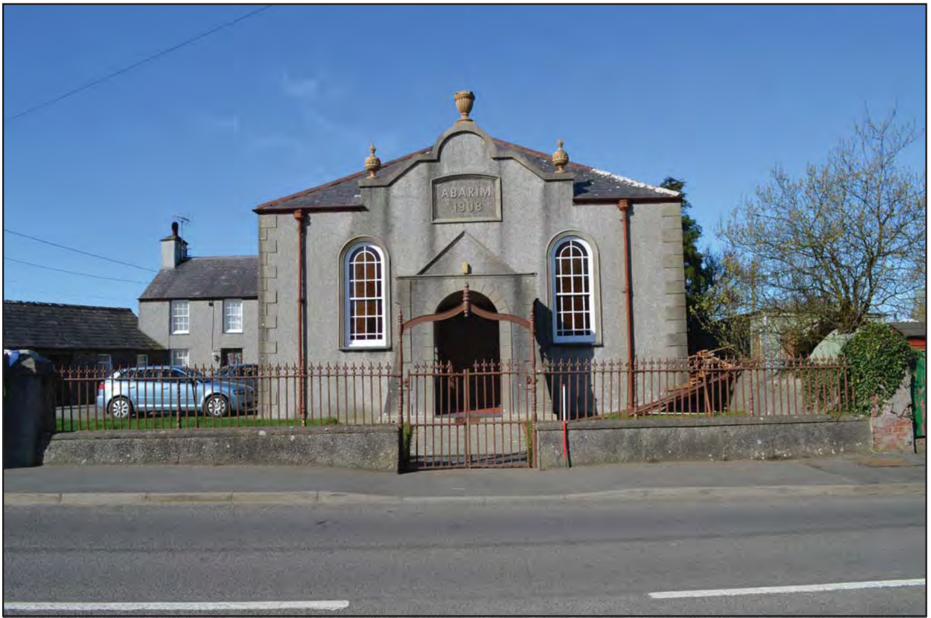
Plate 087: Asset 100, Capel Abarim, viewed from the E.