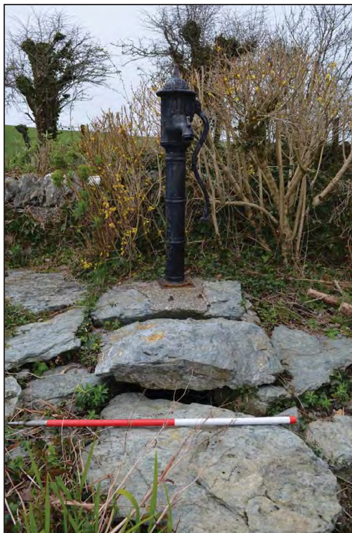
Plate 146: Asset 160, pump/ well at Tan-y-Bryn, viewed from the S.