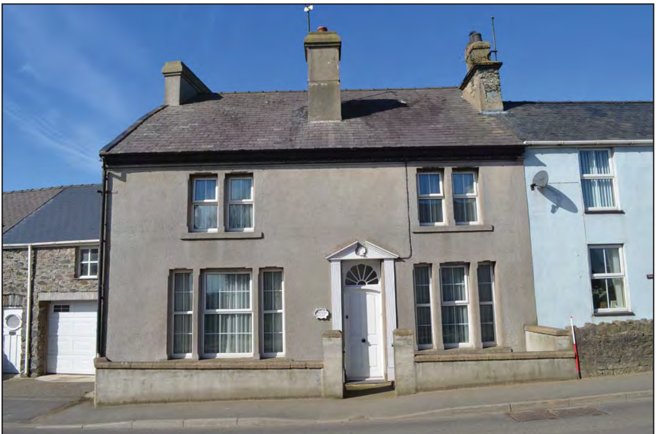
Plate 082: Asset 095, Preston House, viewed from the E