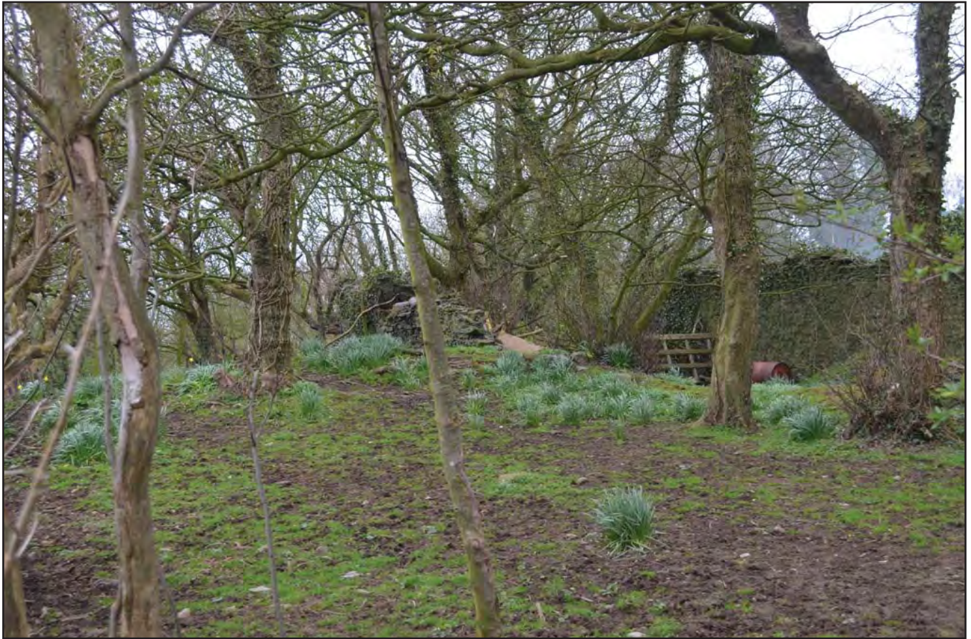
Plate 235: Asset 261, ruined building part of outer perimeter wall NW of Cefn-coch, viewed from the SW.