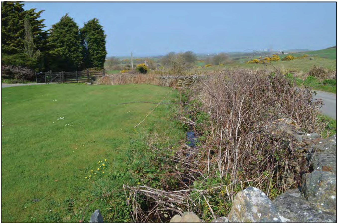
Plate 215: Asset 239, head race at Melin Ty'n y Felin, viewed from the S.