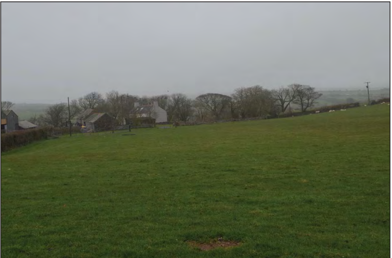
Plate 140: Asset 156, site of Building to the S of Fadoch Frech, viewed from the SW.