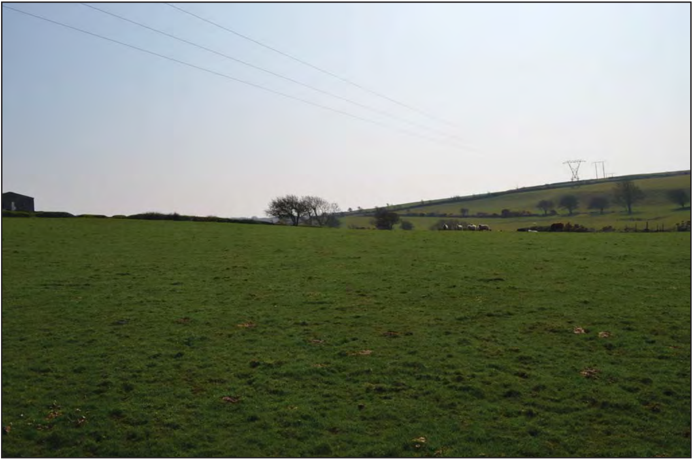
Plate 223: Asset 248, site of House NW of Melin Ty'n y Felin, viewed from the NW.