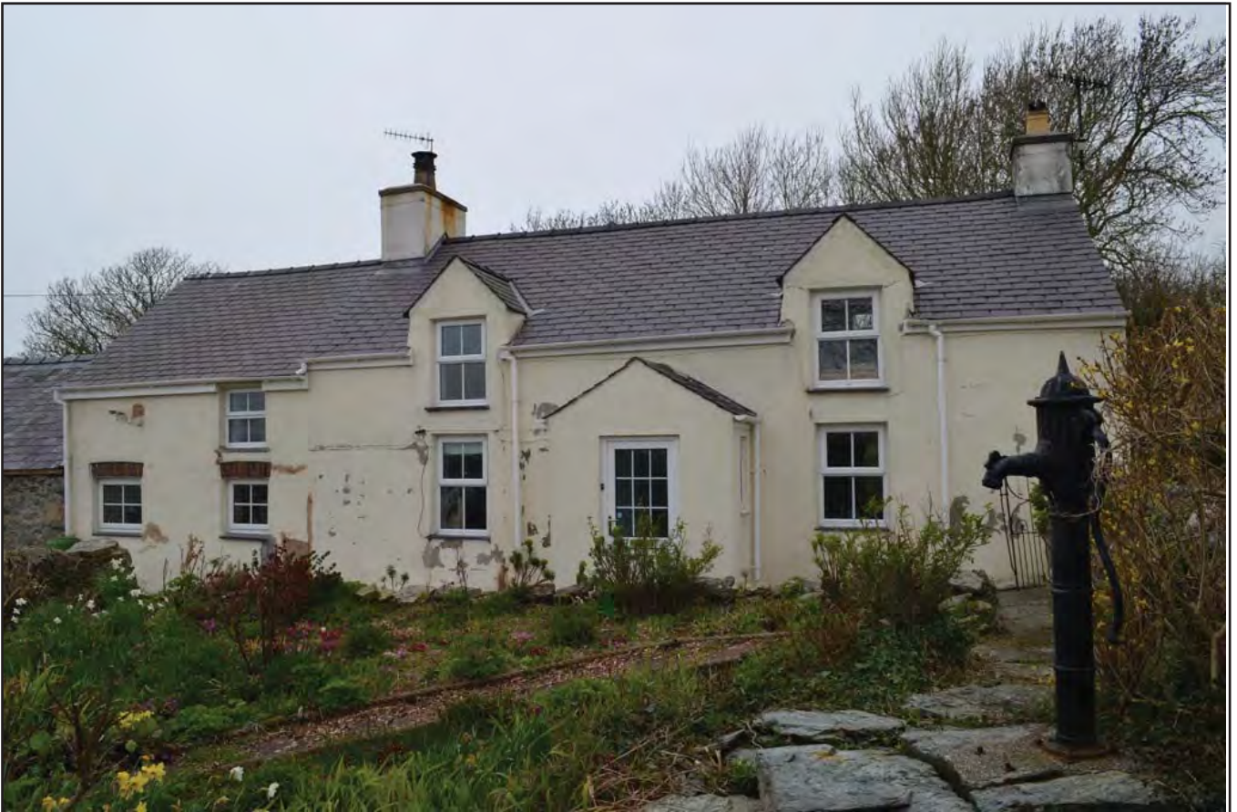
Plate 142: Asset 158, Tan-y-Bryn, viewed from the NE.