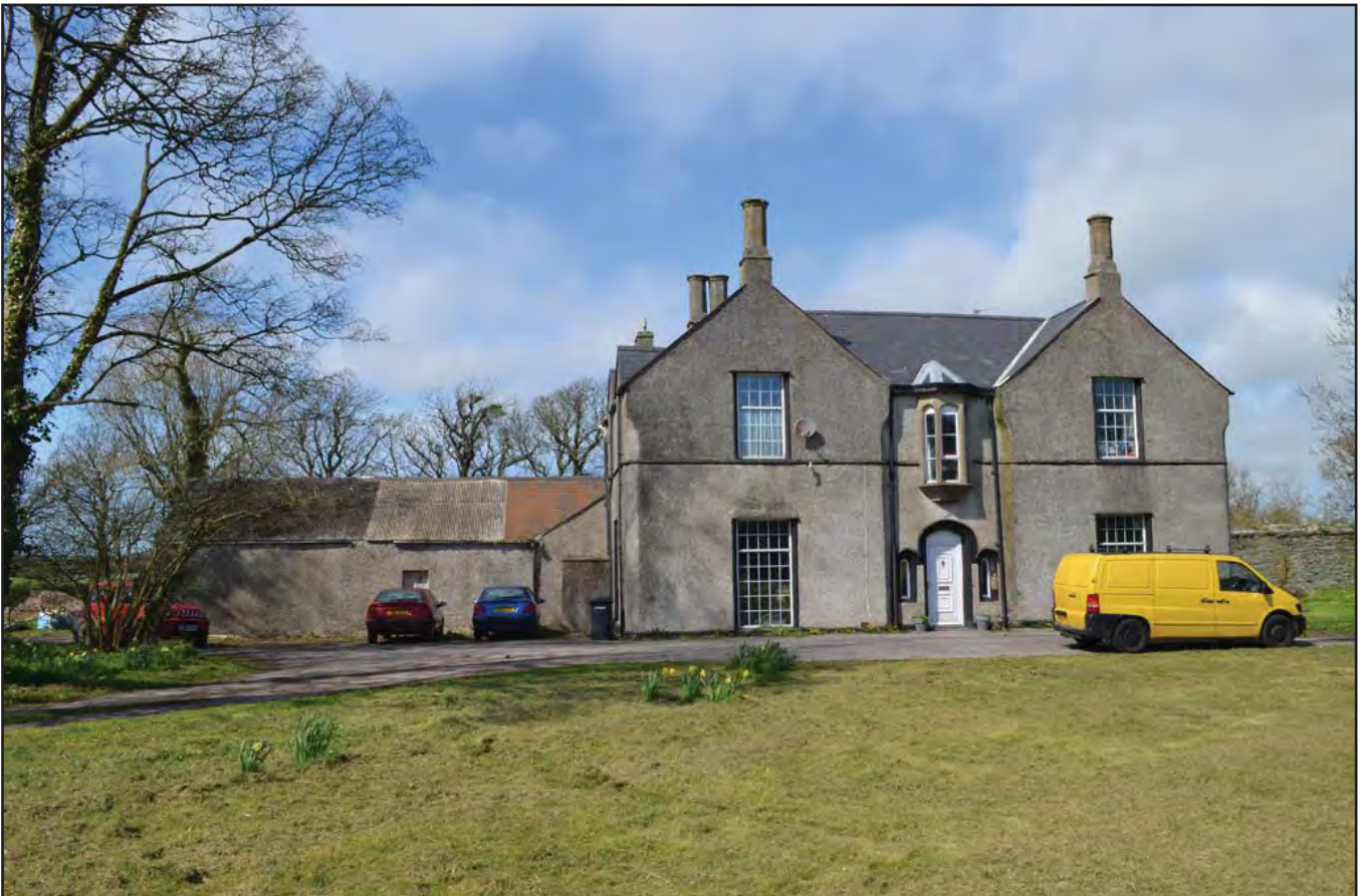
Plate 102: Asset 115, The Rectory north of St Machraeth's Church, viewed from the SE.