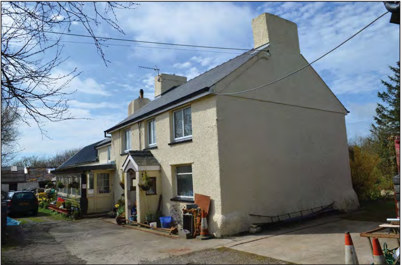
Plate 115: Asset 128, Tyddyn-y-waen, viewed from the NE.