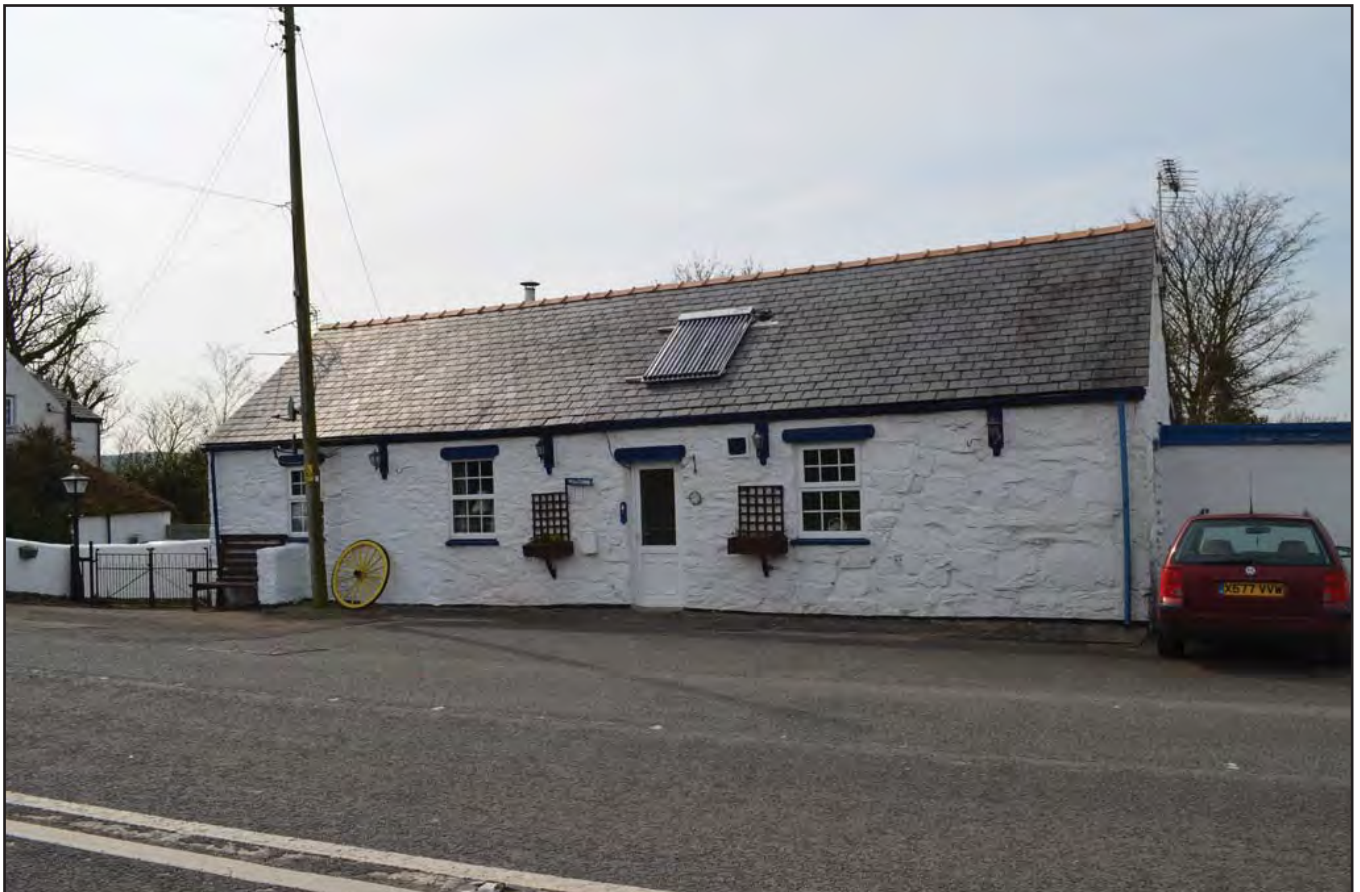
Plate 240: Asset 267, Pandy, viewed from the NE.