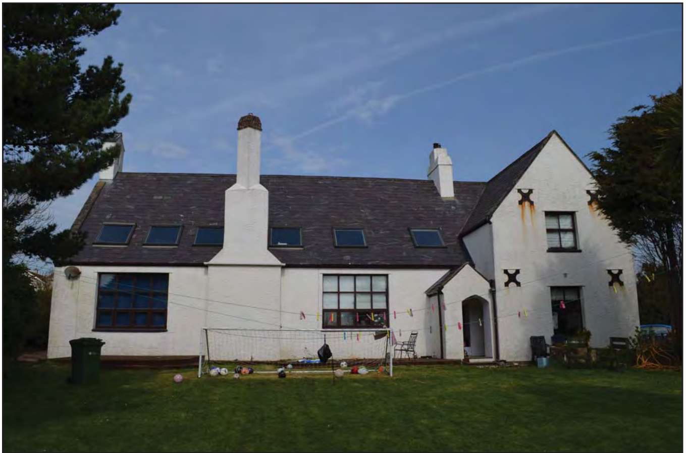
Plate 187: Asset 209, Ysgol Pedair, viewed from the SE.