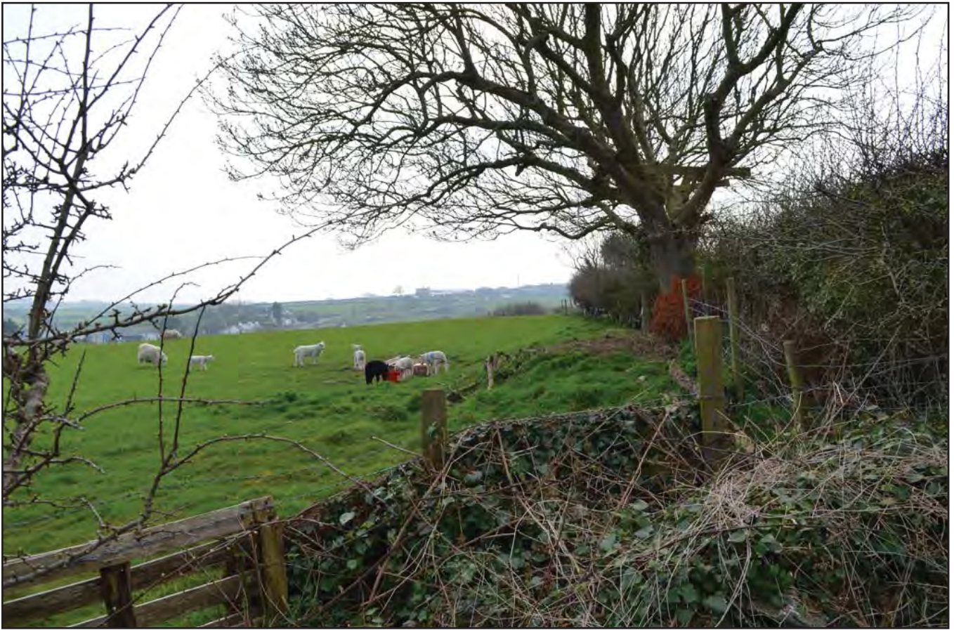
Plate 175: Asset 192, site of Building SE of Bryn Maethlu, viewed from the N.