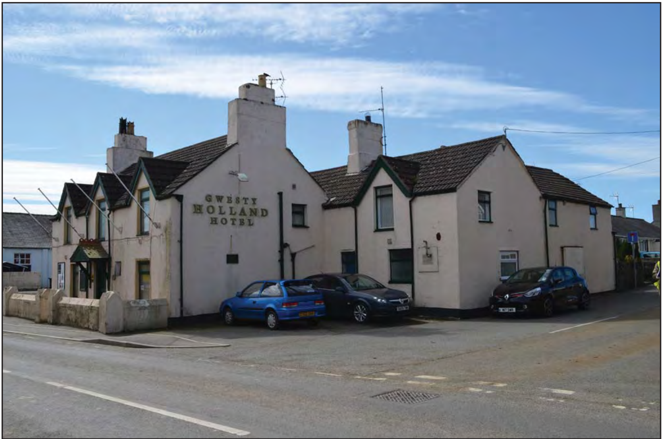
Plate 059: Asset 068, The Holland Hotel, viewed from the N.