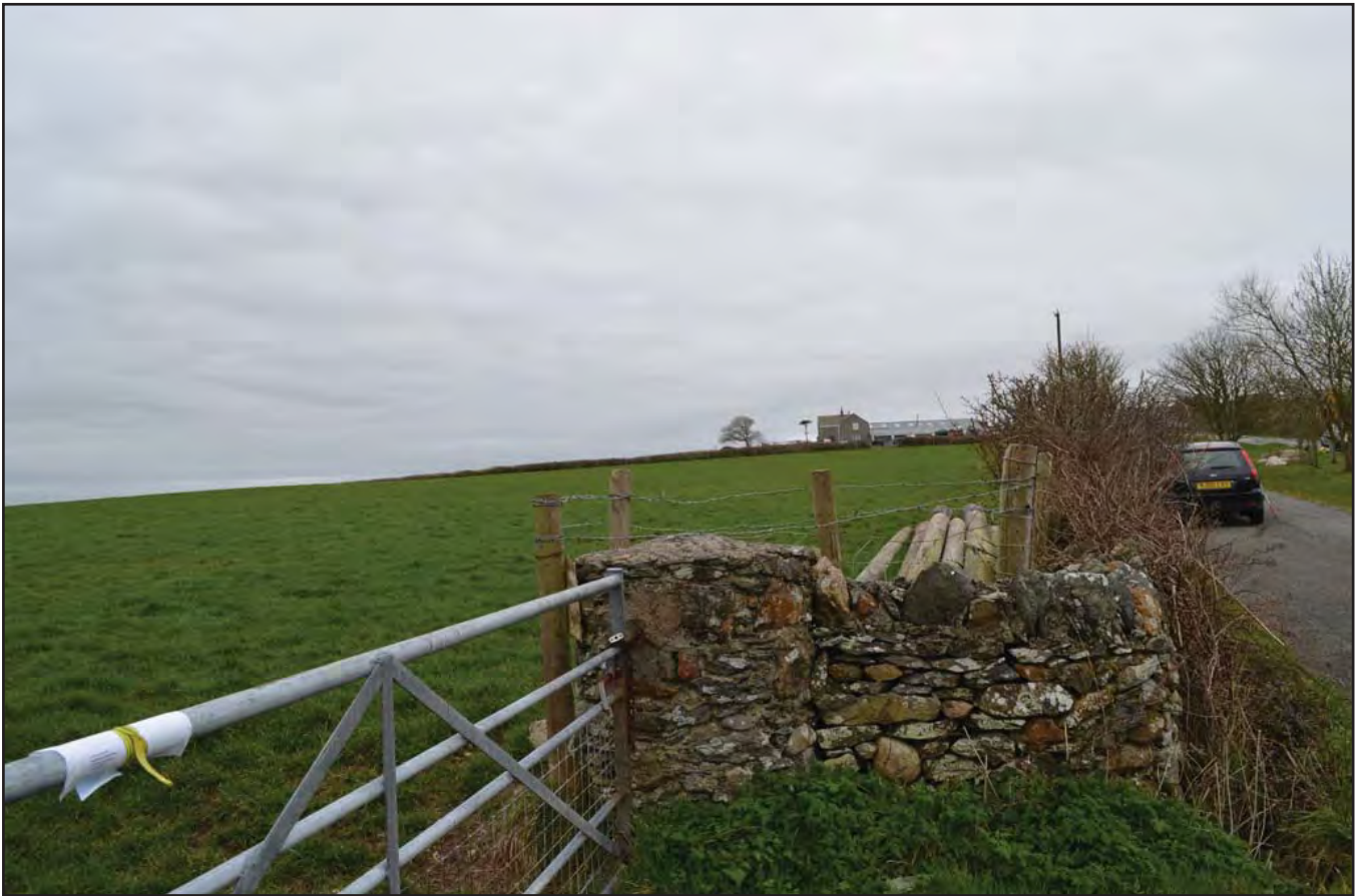
Plate 311: Route of proposed Llanfaethlu bypass, looking S from layby at Ty'n-y-buarth across fields to NE of Rhos-ty-mawr.