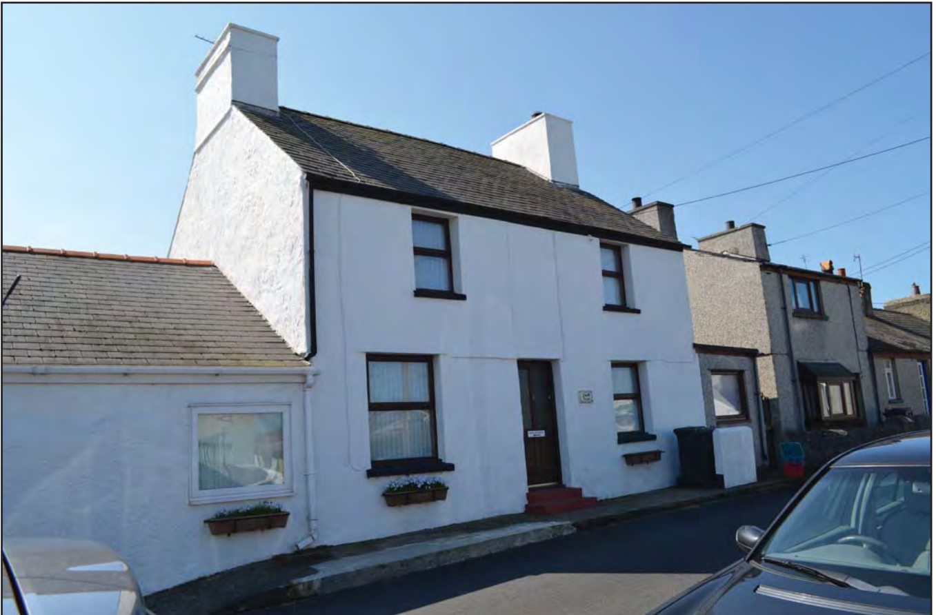
Plate 270: Asset 300, Howth House, NW end of four building terrace at Tregelle, viewed from the ENE.