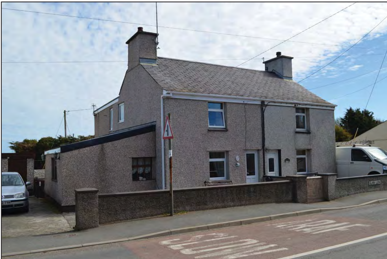
Plate 067: Asset 077, 1 & 2 Glan Llyn, viewed from the W.