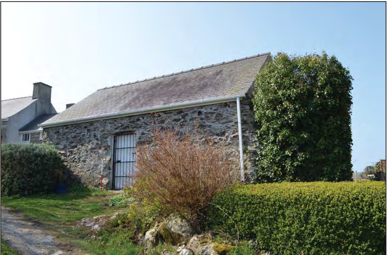
Plate 218: Asset 243, remains of Melin Ty'n y Felin, viewed from the NE..