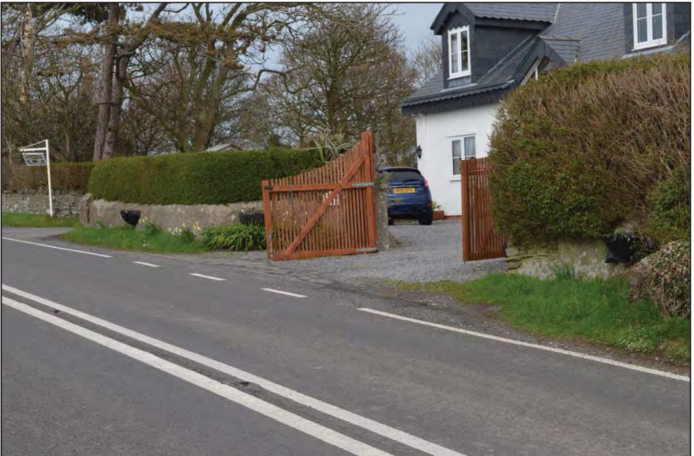
Plate 126: Asset 138, site of Bryntirion-uchaf, viewed from the SW.