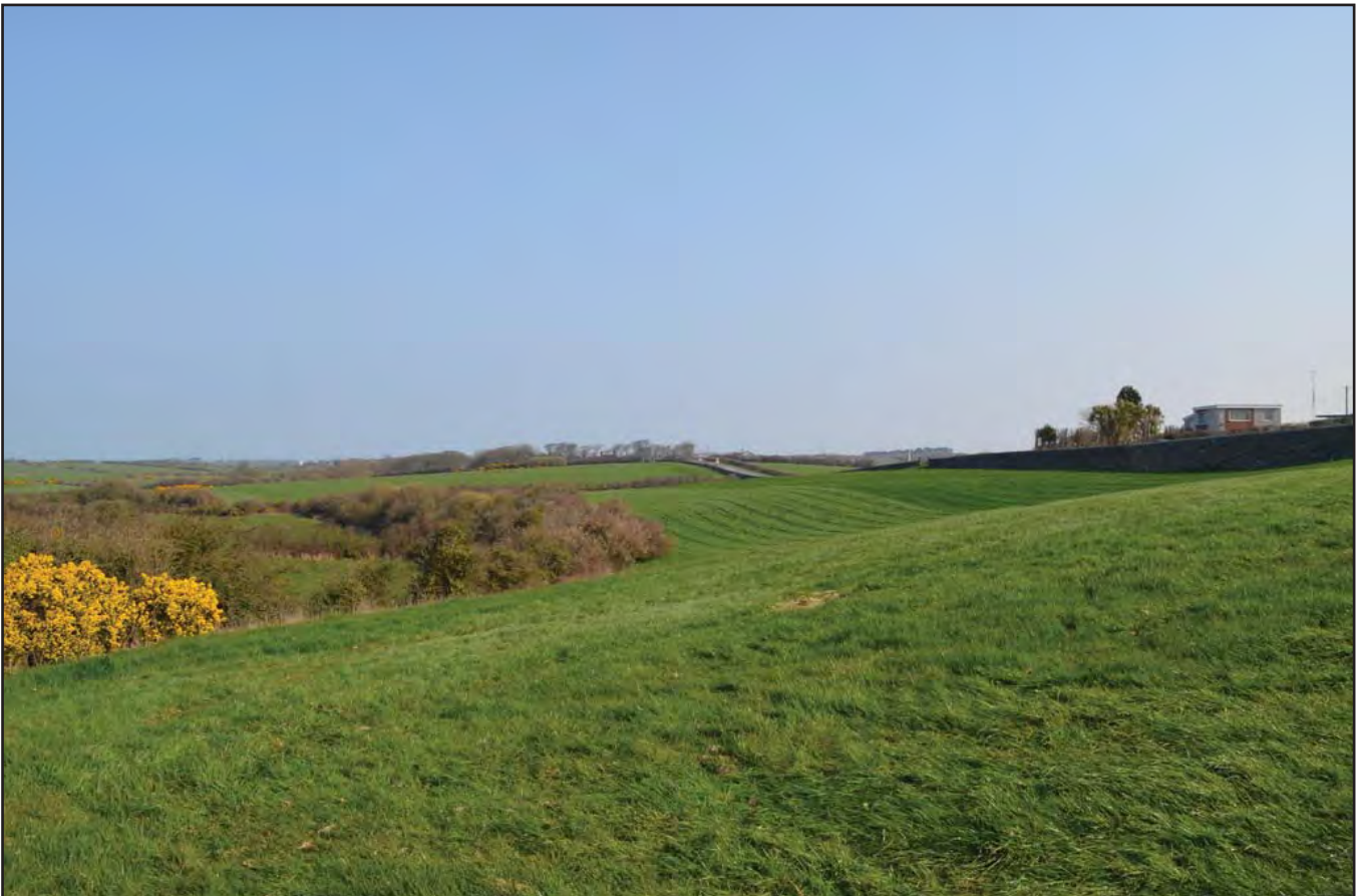
Plate 326: Route of proposed road improvement, looking from SW to NE, viewed from W of junction of A5025 and Llanfairynghornwy Rd.