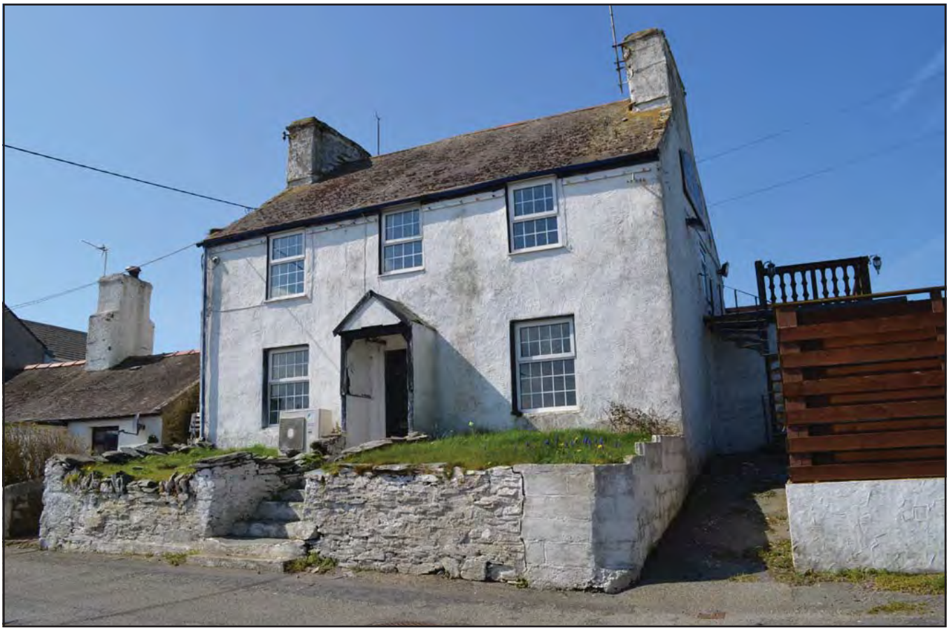
Plate 277: Asset 305, Smithy 2 (The Bungalow) , viewed from the SE.