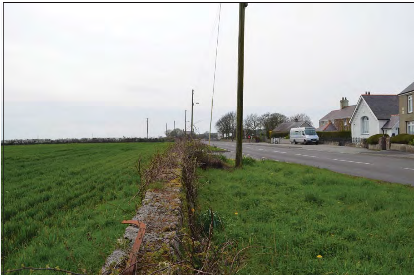
Plate 295: Route of proposed road improvement, viewed from the NE looking SW across fields E of Hermon Chapel.