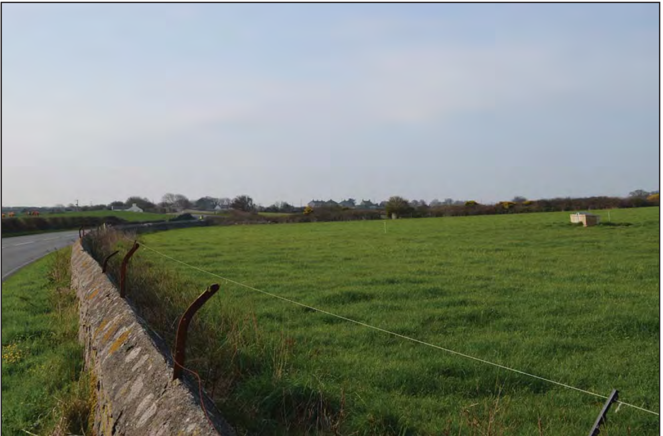
Plate 300: Route of proposed road improvement, viewed from the SSW looking NNE from the junction opposite Shop Farm.