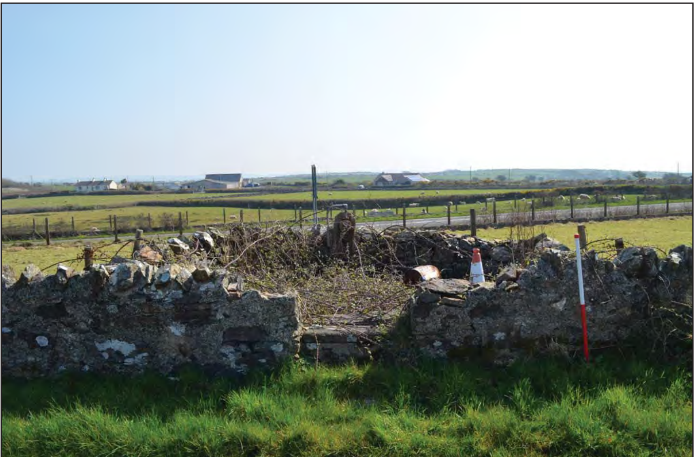
Plate 208: Asset 231, Pump W of Bethel-hen, viewed from the NW.