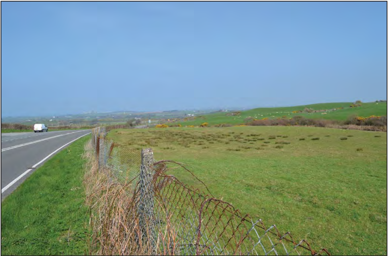
Plate 319: Route of proposed road improvement through fields E of A5025, looking from SW to NE, viewed from SE of Asset 237.