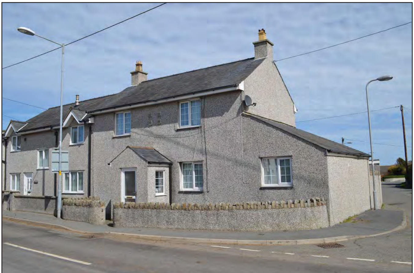
Plate 060: Asset 069, Ty Gwyn original house, viewed from the SW.