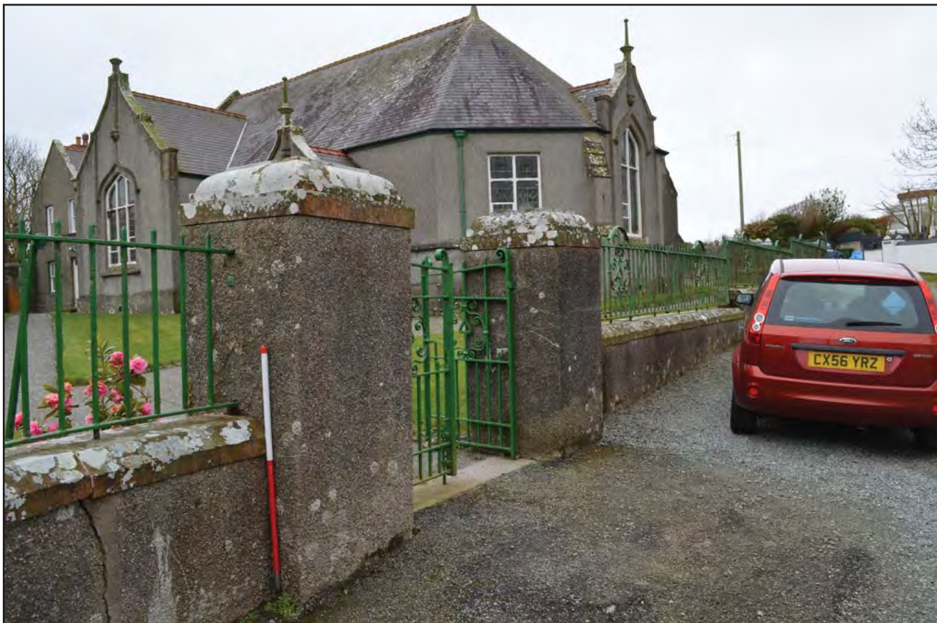
Plate 149: Asset 164, gateposts wall and railings, Capel Ebenezer, viewed from the NE.