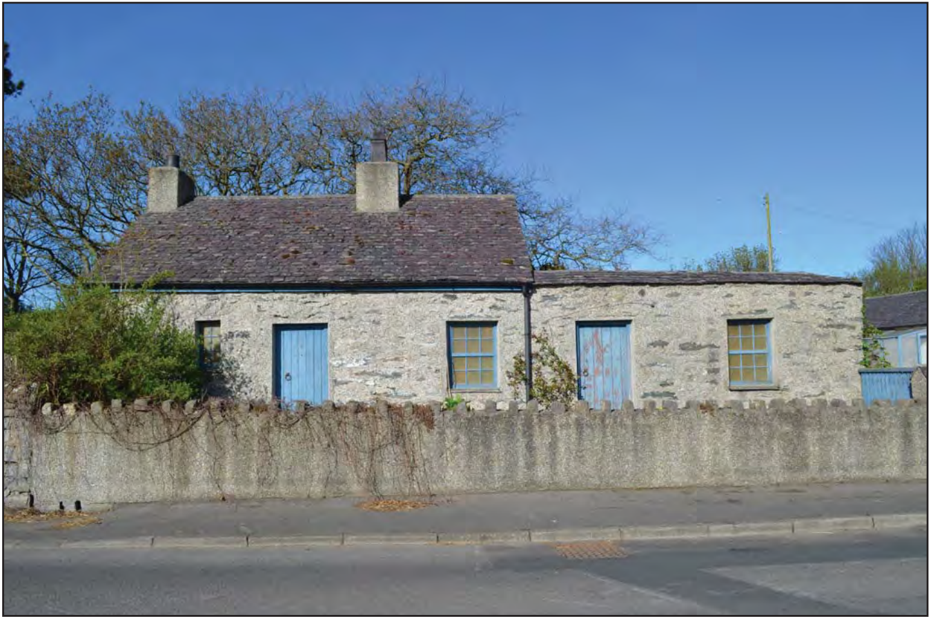
Plate 093: Asset 106, Tan y Felin, viewed from the E.