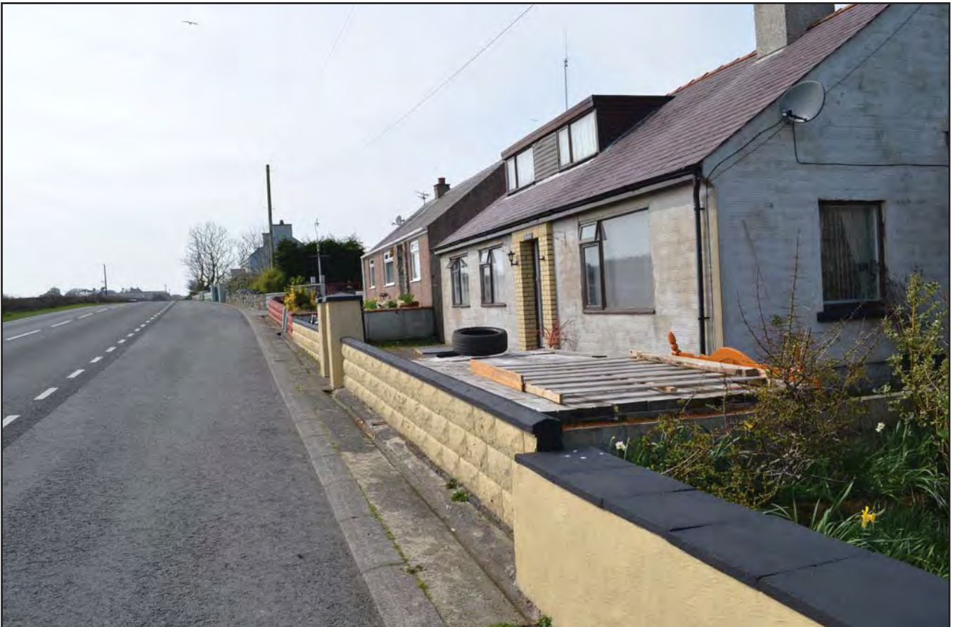
Plate 230: Asset 256, Fferm-Wyllt, viewed from the SW.