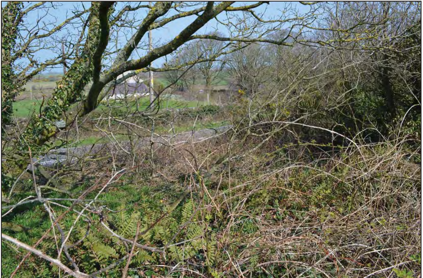
Plate 216: Asset 240, site of Building S of Melin Ty'n-y-felin, viewed from the SW.