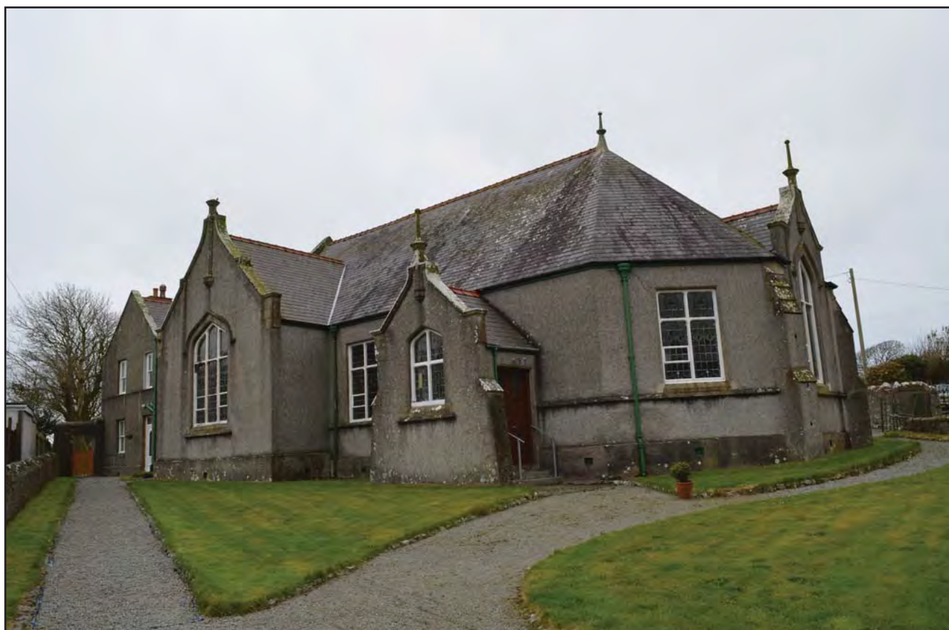
Plate 150: Asset 165 Capel Ebenezer, Llanfaethlu, viewed from the NE.