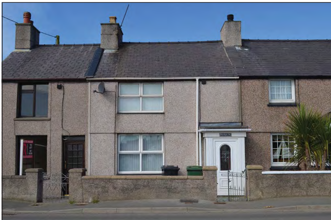
Plate 076: Asset 089, Bwthyn Ni, viewed from the E.