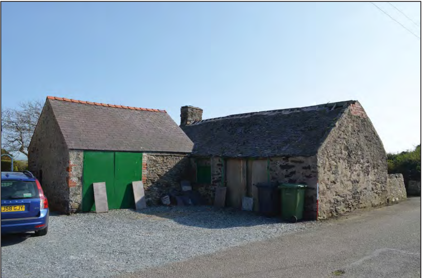
Plate 200: Asset 223, Hen Efail (smithy), viewed from the NW.