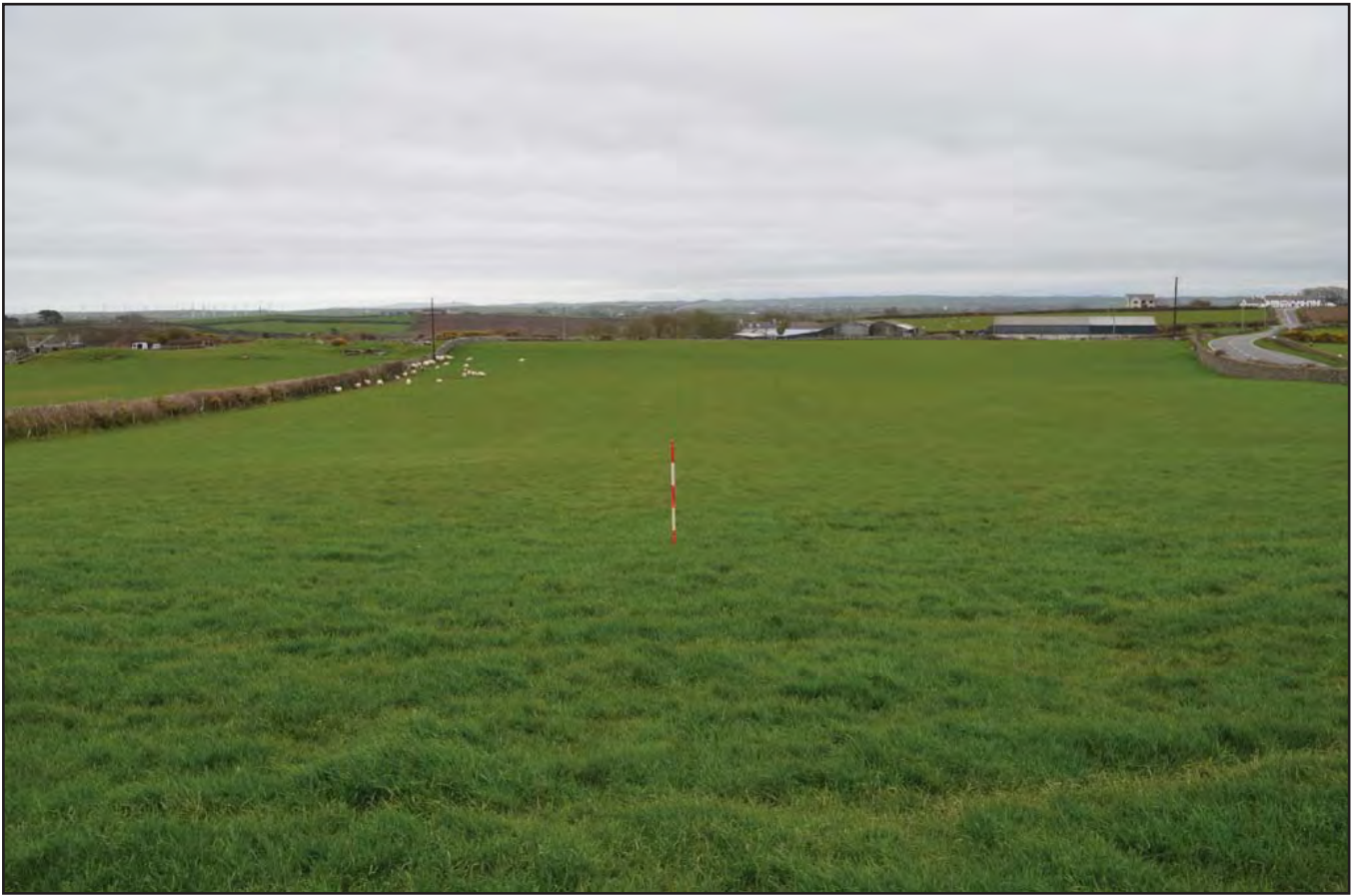
Plate 147: Asset 162, linear feature, possible relict field boundary SE of Rhos-ty-maw, viewed from the WNW.