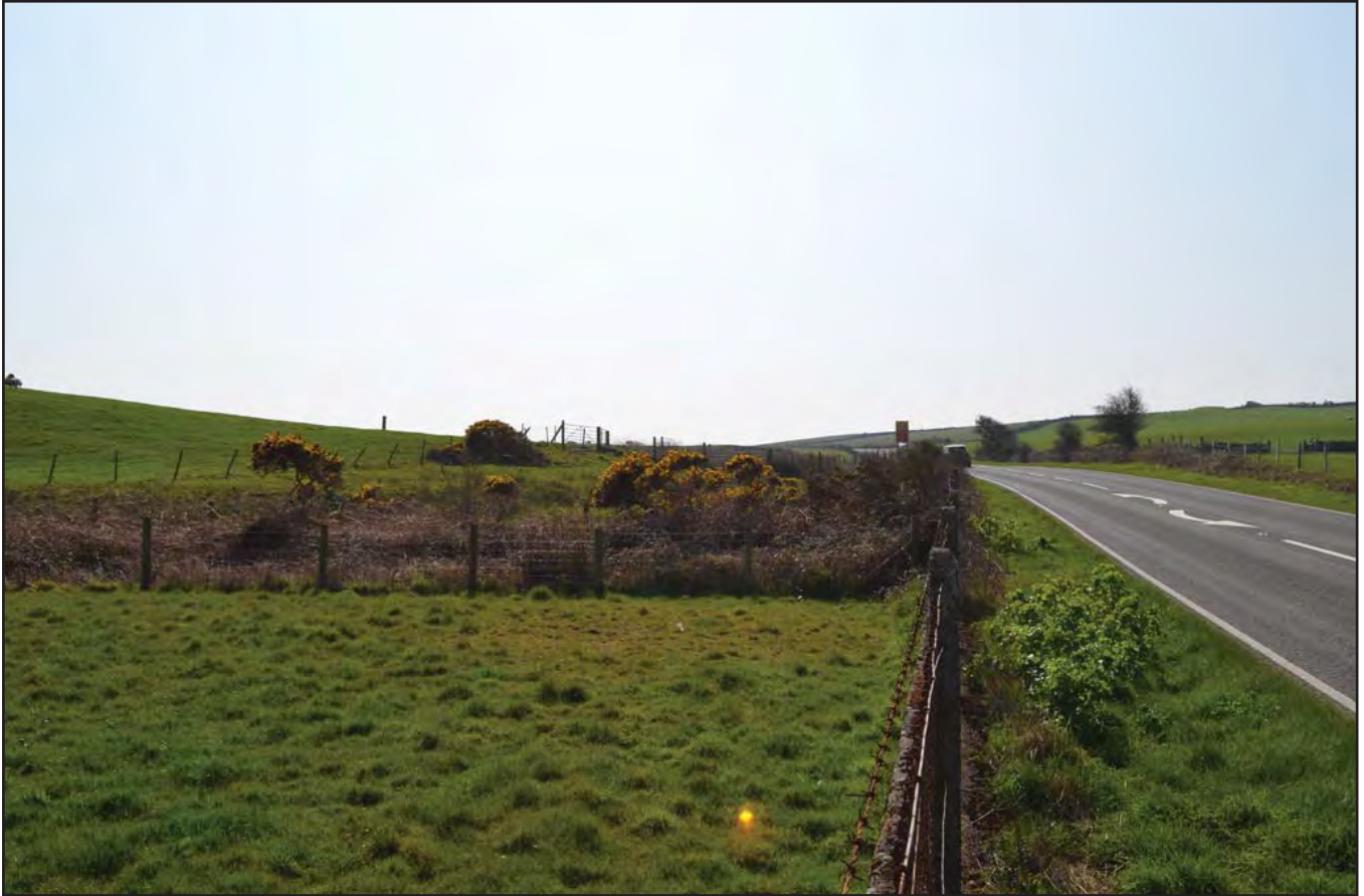
Plate 321: Route of proposed road improvement, from NE to SW through fields on E side of A5025, viewed from E of Asset 237.