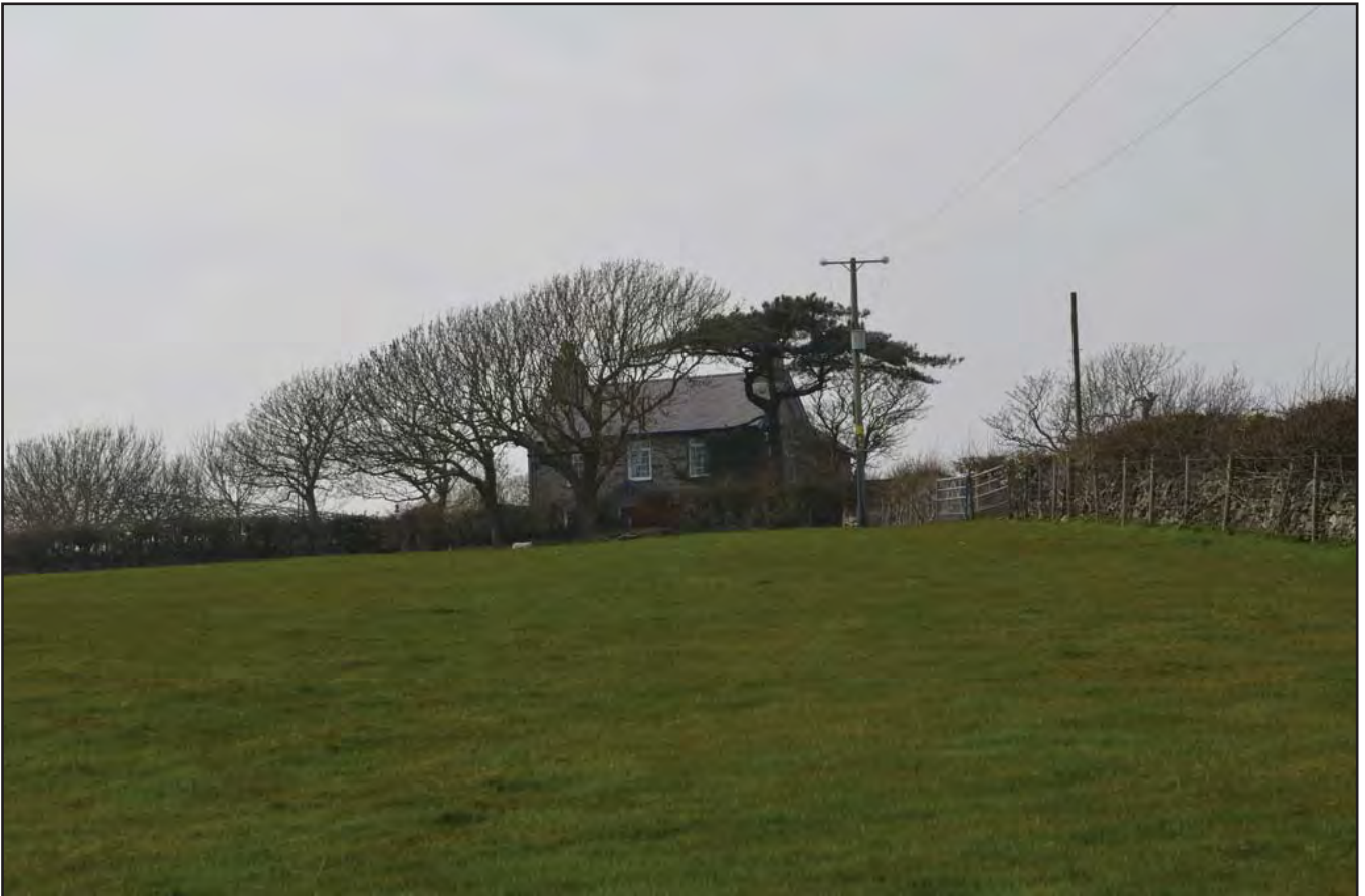
Plate 176: Asset 194, Bryn Maethlu, viewed from the E..