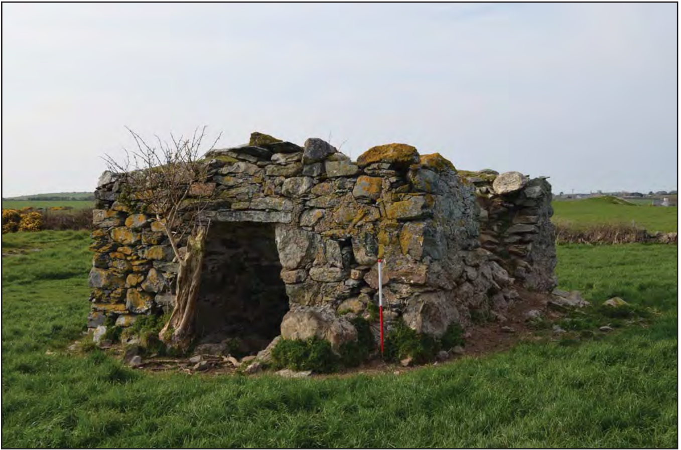
Plate 243: Asset 271, lime kiln E of Tyn-yr-odyn, viewed from the NE.