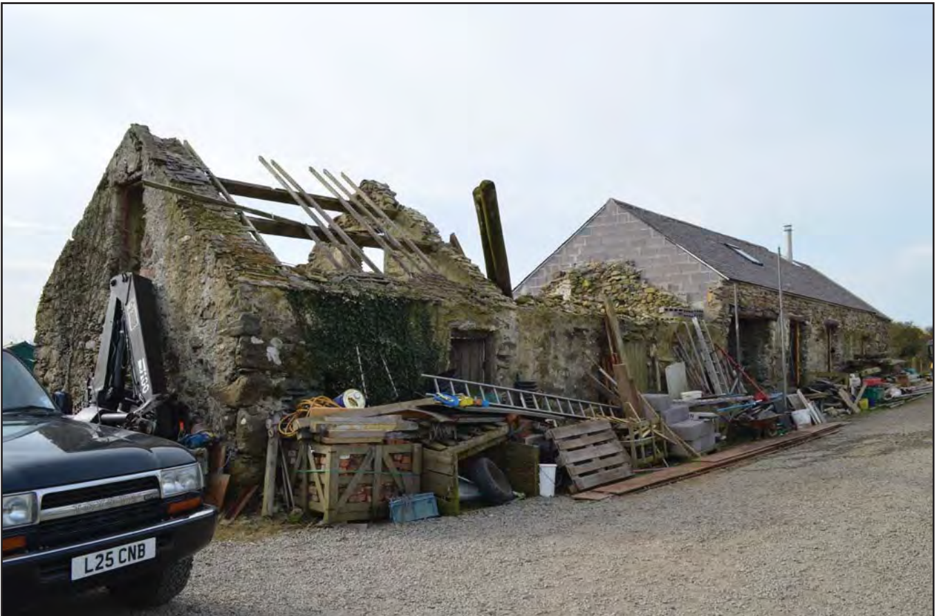
Plate 194: Asset 217, agricultural range at Tyddyn Waen, viewed from the NE.