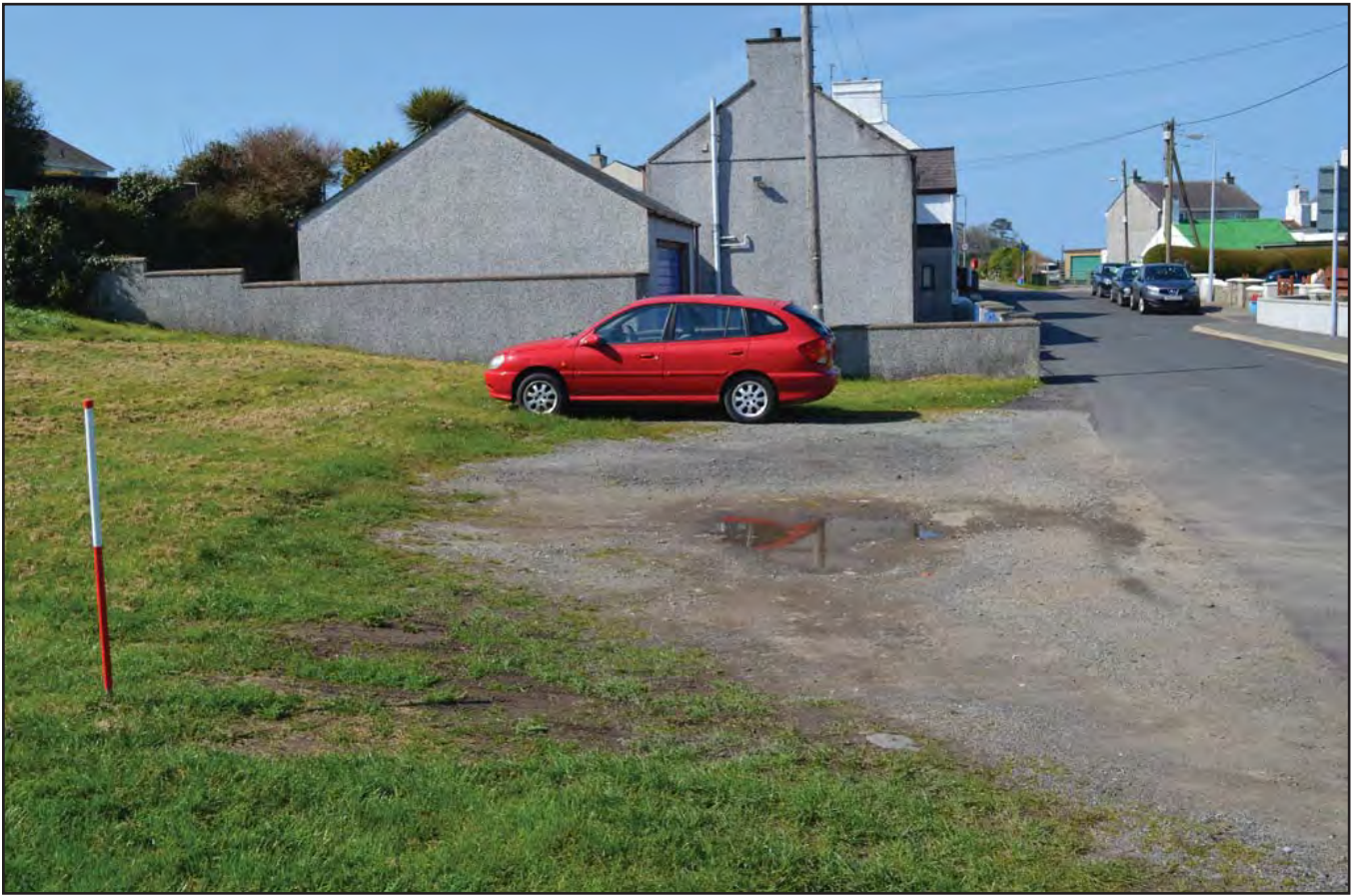
Plate 269: Asset 299, site of Building W of Cae Gors, viewed from the SE.