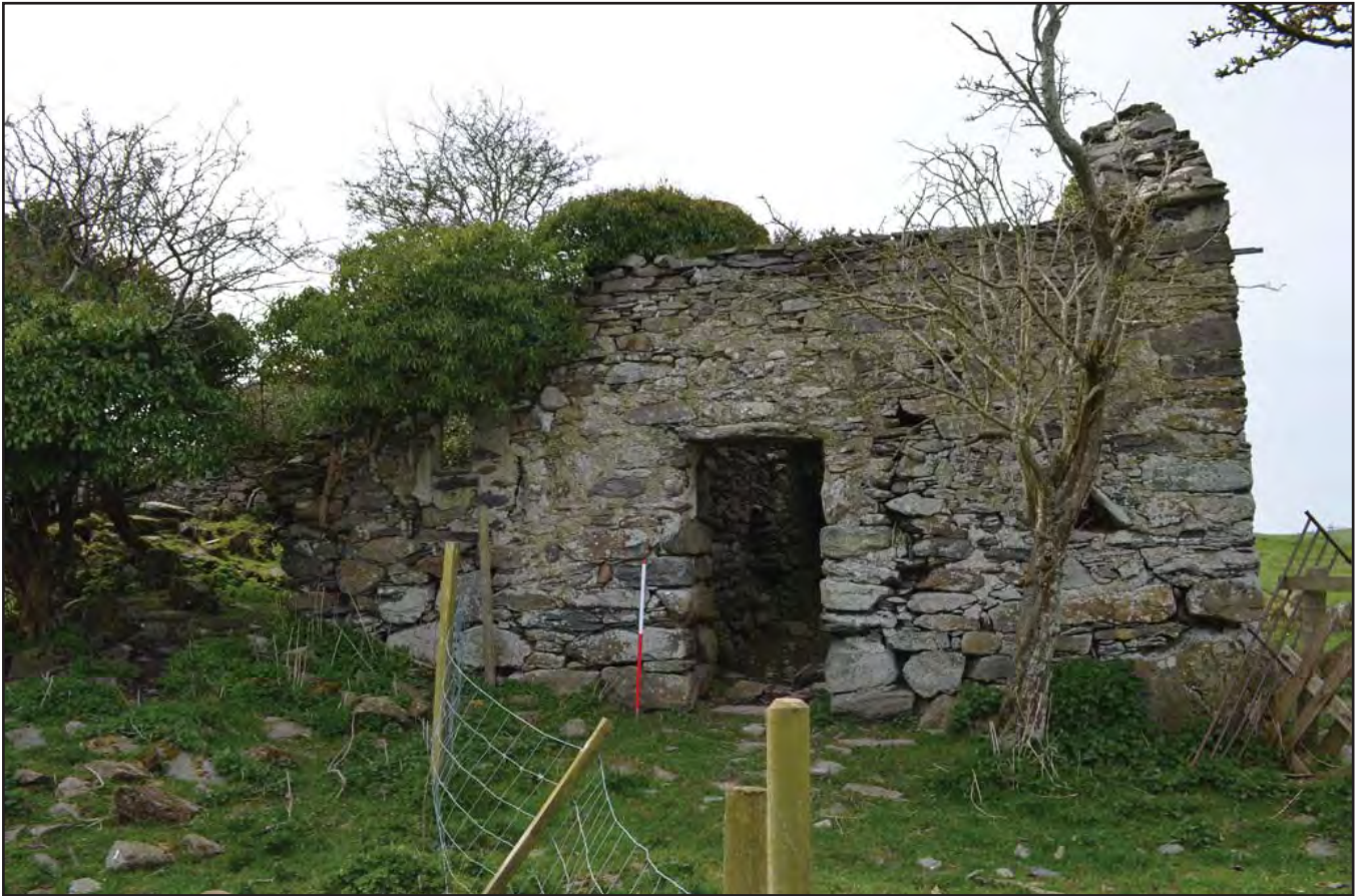
Plate 249: Asset 277, N end of Building NW of Felin Cefn Coch, viewed from the E.