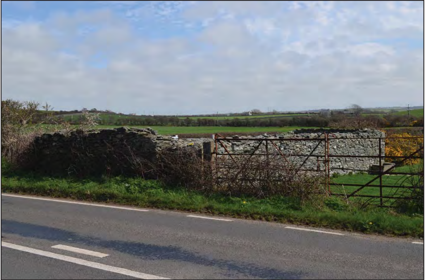
Plate 105: Asset 118, ruined barn, viewed from the W.