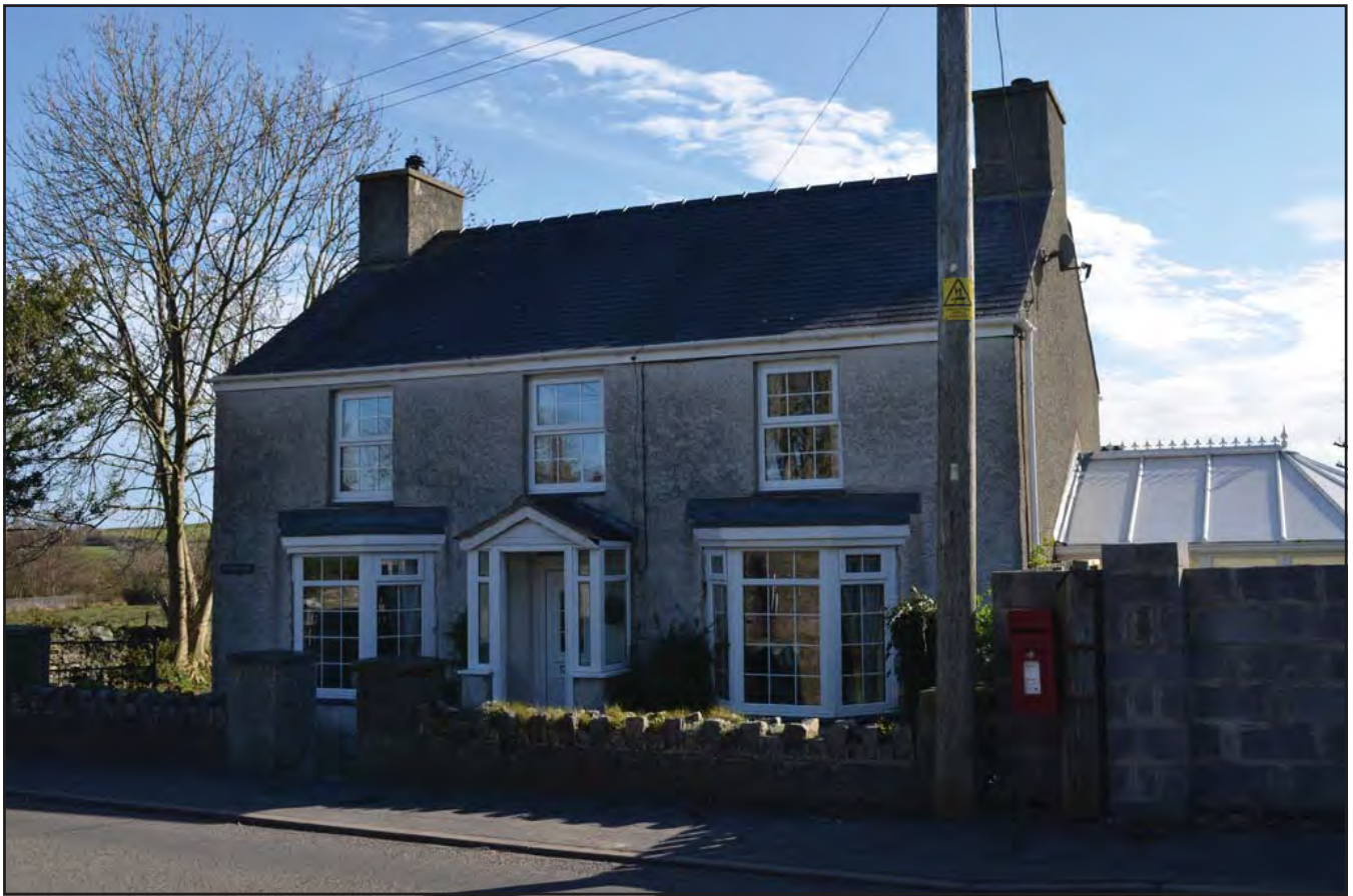
Plate 091: Asset 104, former King's head Public House, now Trygarn House, viewed from the SW.