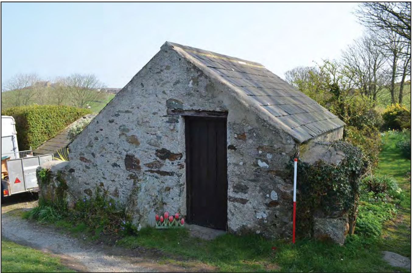
Plate 219: Asset 244, larger outbuilding NE of Ty'n Felin, viewed from the SW.