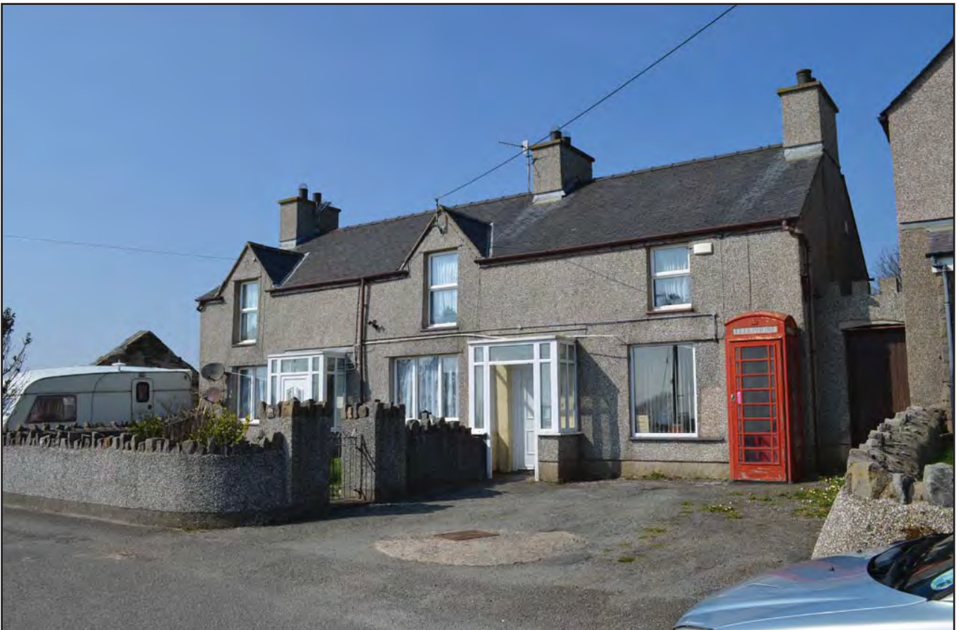
Plate 202: Asset 225, Cae Crin, viewed from the SE.