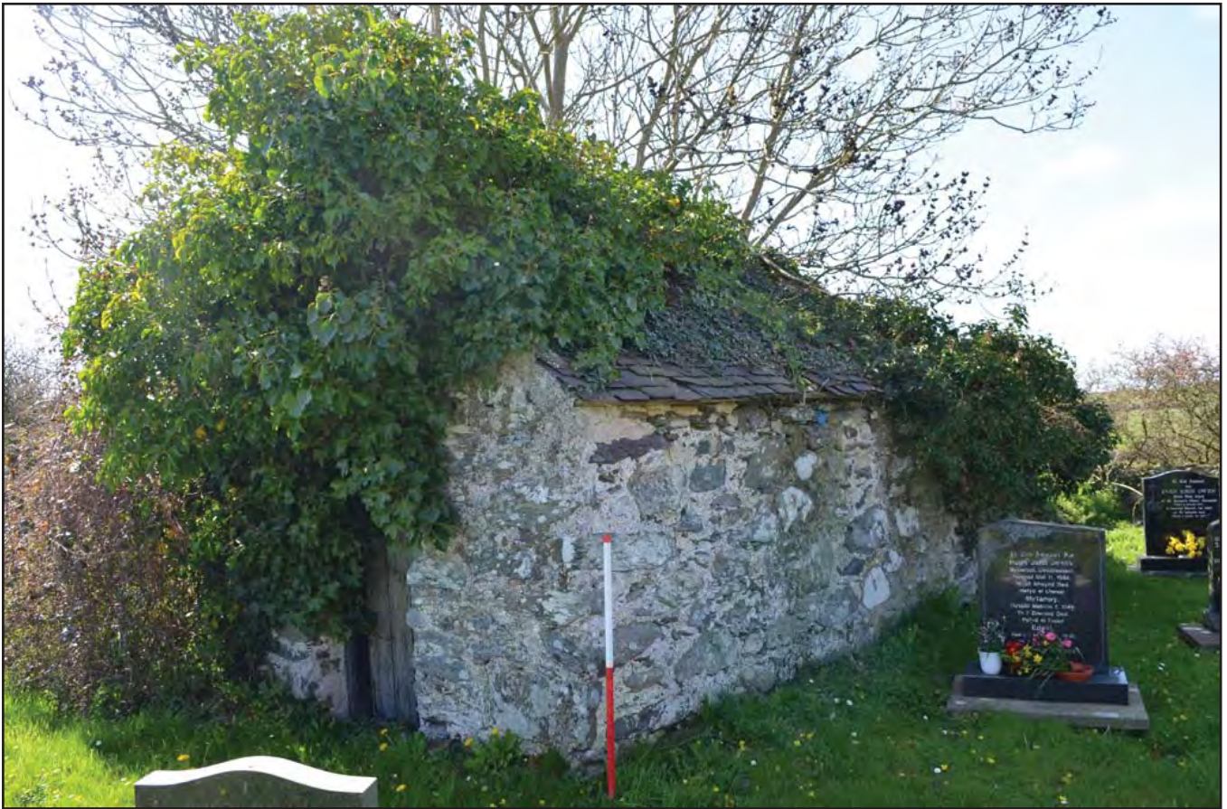
Plate 099: Asset 112, outbuilding to the SW of St Machraeth's Church, viewed from the NW.