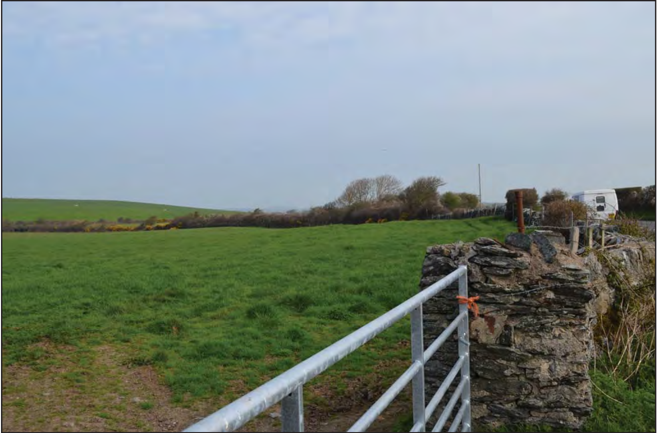
Plate 299: Route of proposed road improvement, viewed from the SSW looking NNE from the junction opposite Shop Farm.