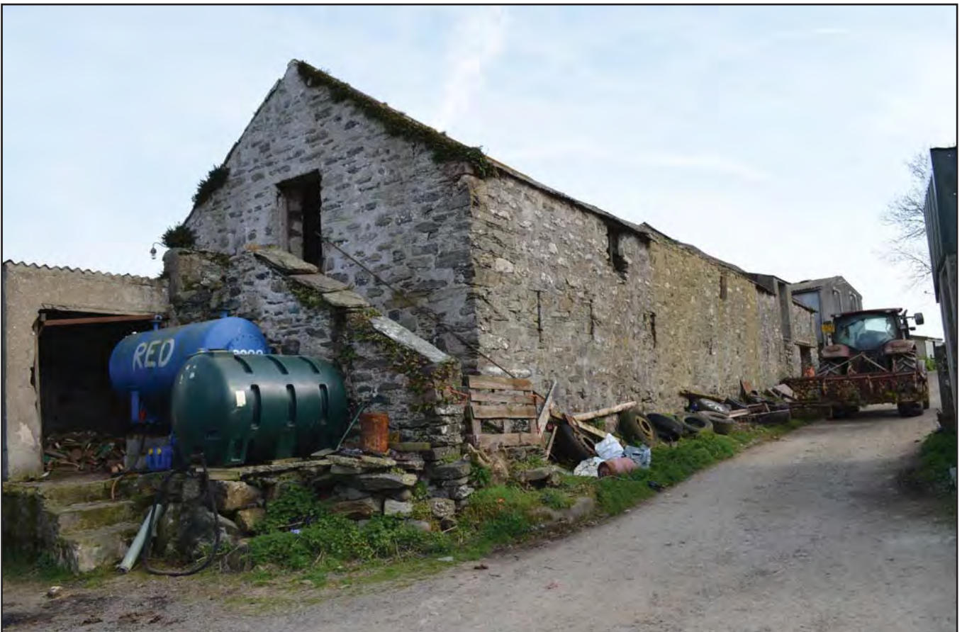
Plate 234: Asset 260, N gable end and W side of barn, Cefn Coch, viewed from the NW.