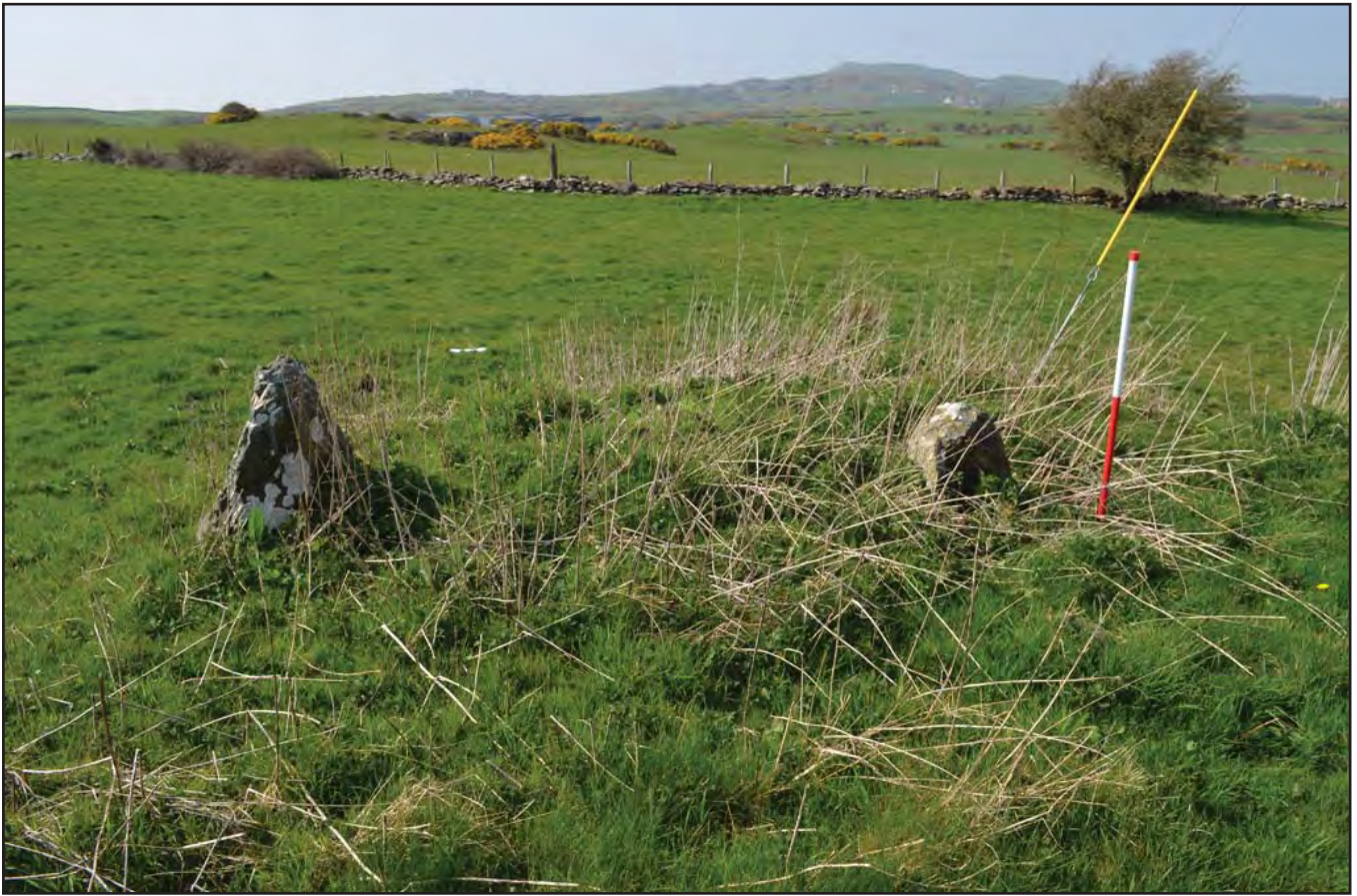
Plate 143: Asset 158, two small orthostatic stones on a slight mound S of Ty'n y Felin, viewed from the NW.