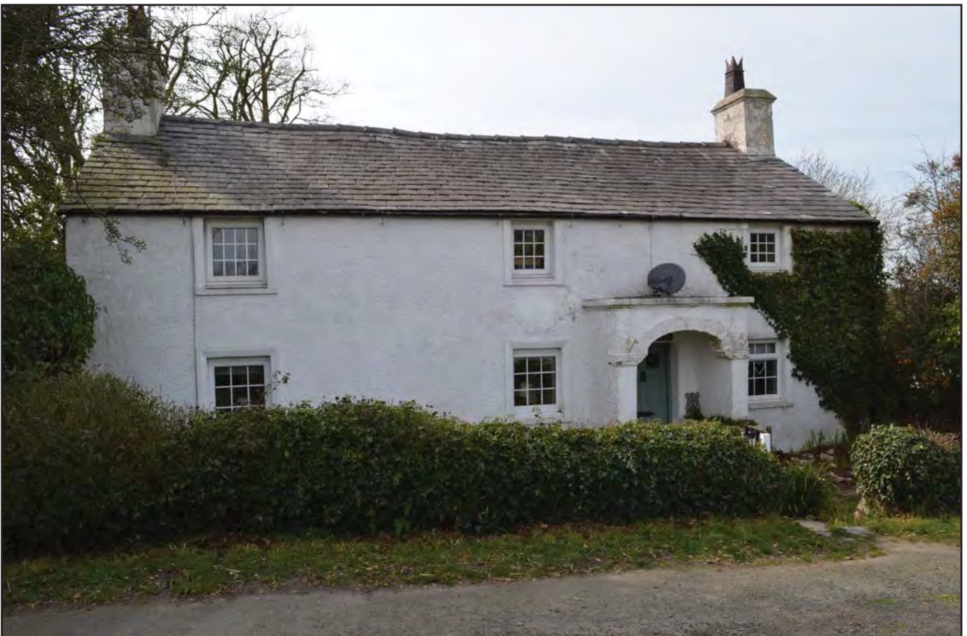
Plate 238: Asset 264, Pandy Cefn Coch, viewed from the ESE.