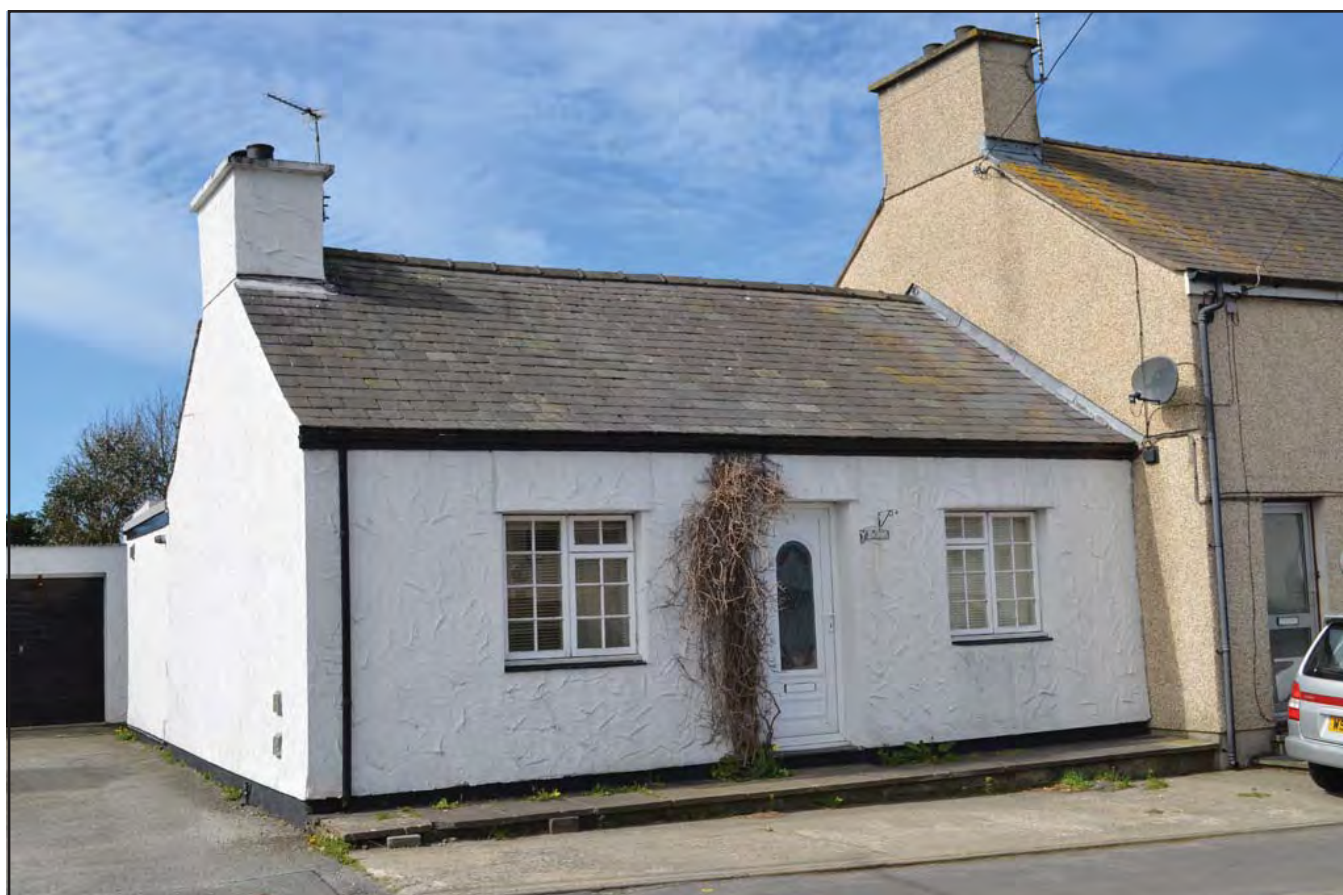
Plate 068: Asset 079, Y Bwthyn, viewed from the E.