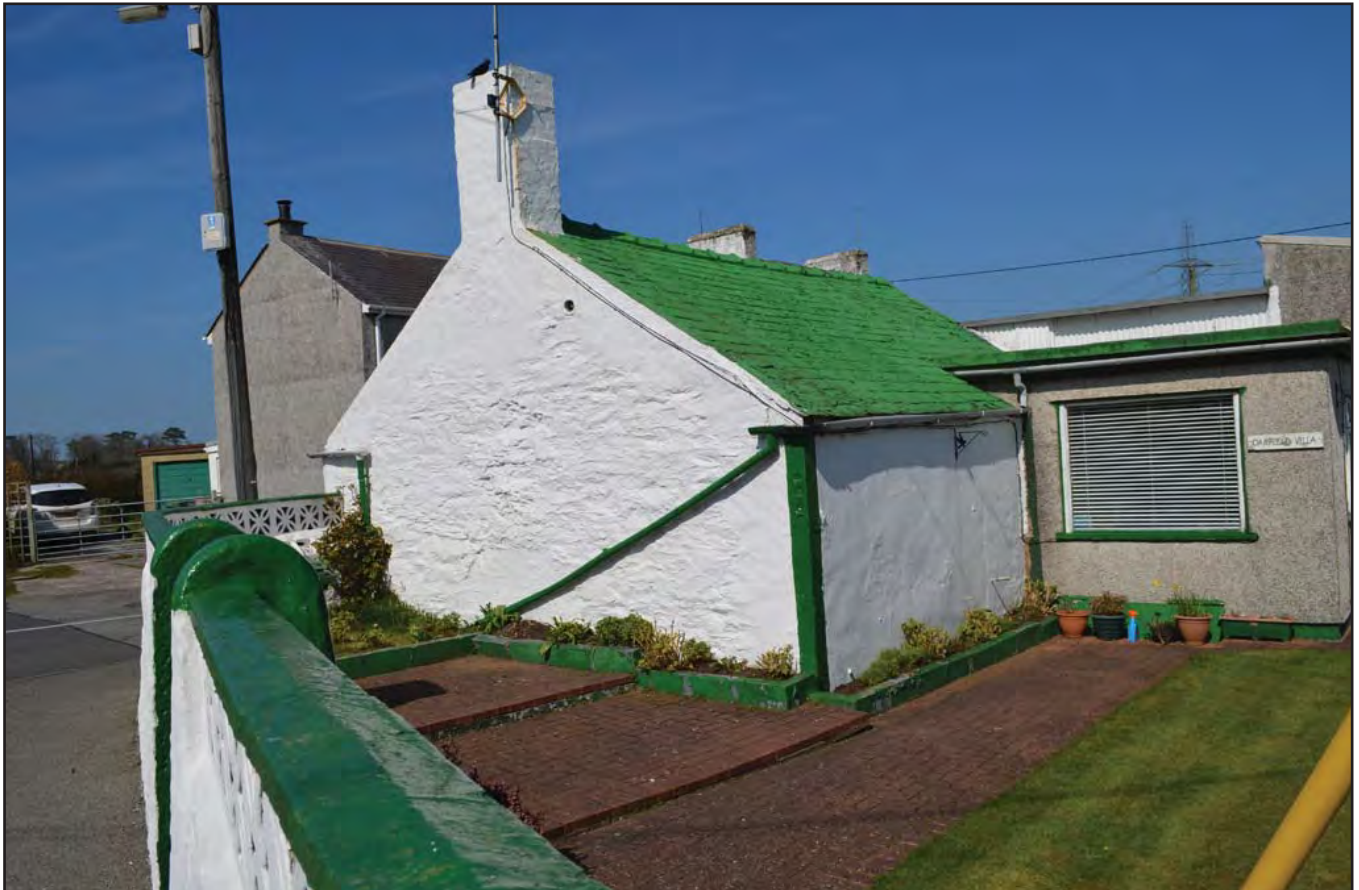
Plate 274: Asset 303, Smithy 1, Treglele, viewed from the SE.