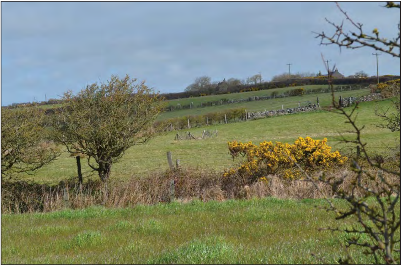
Plate 119: Asset 132, well NE of Rhos-y-gaer, viewed from the SW.