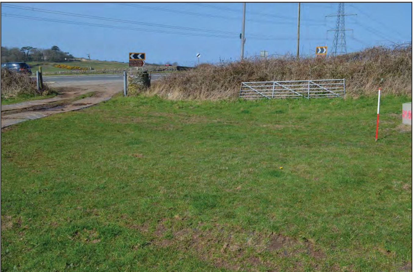
Plate 282: Asset 311, site of Building S of Pen-lon, viewed from the SE.