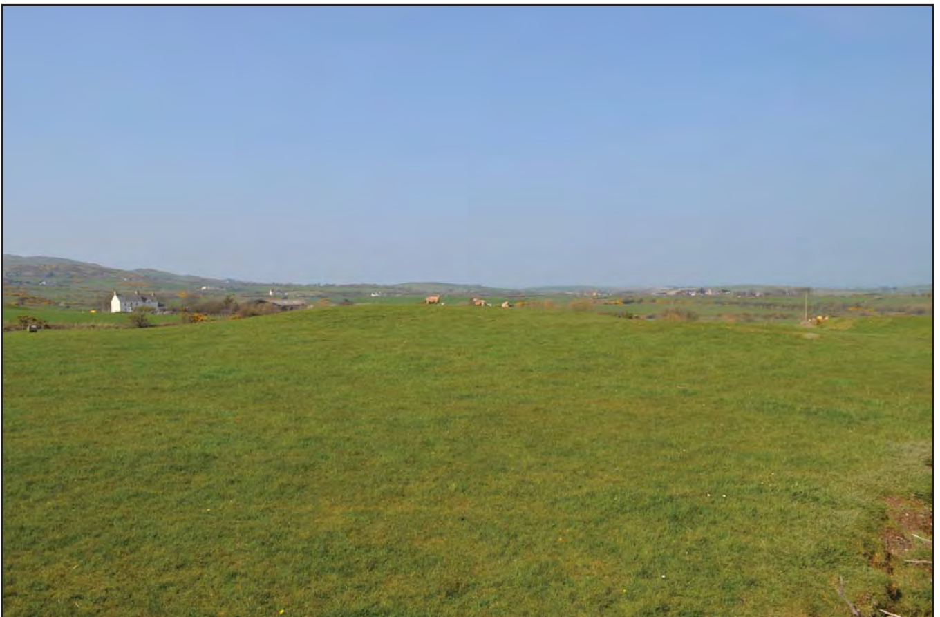
Plate 214: Asset 237, site of Building SE of Bod-hedd, viewed from the SE.