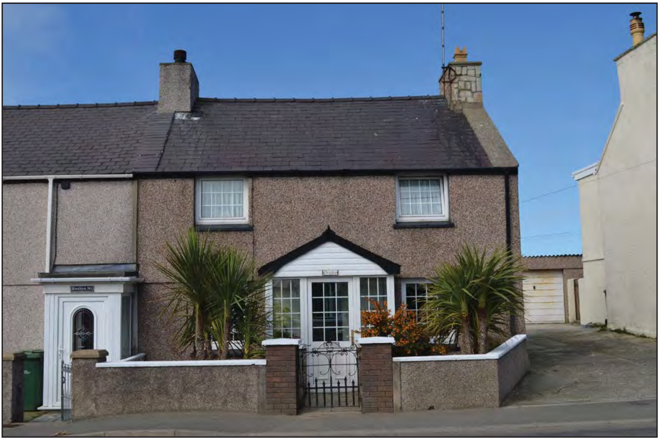
Plate 077: Asset 090, Trigfa, viewed from the E.