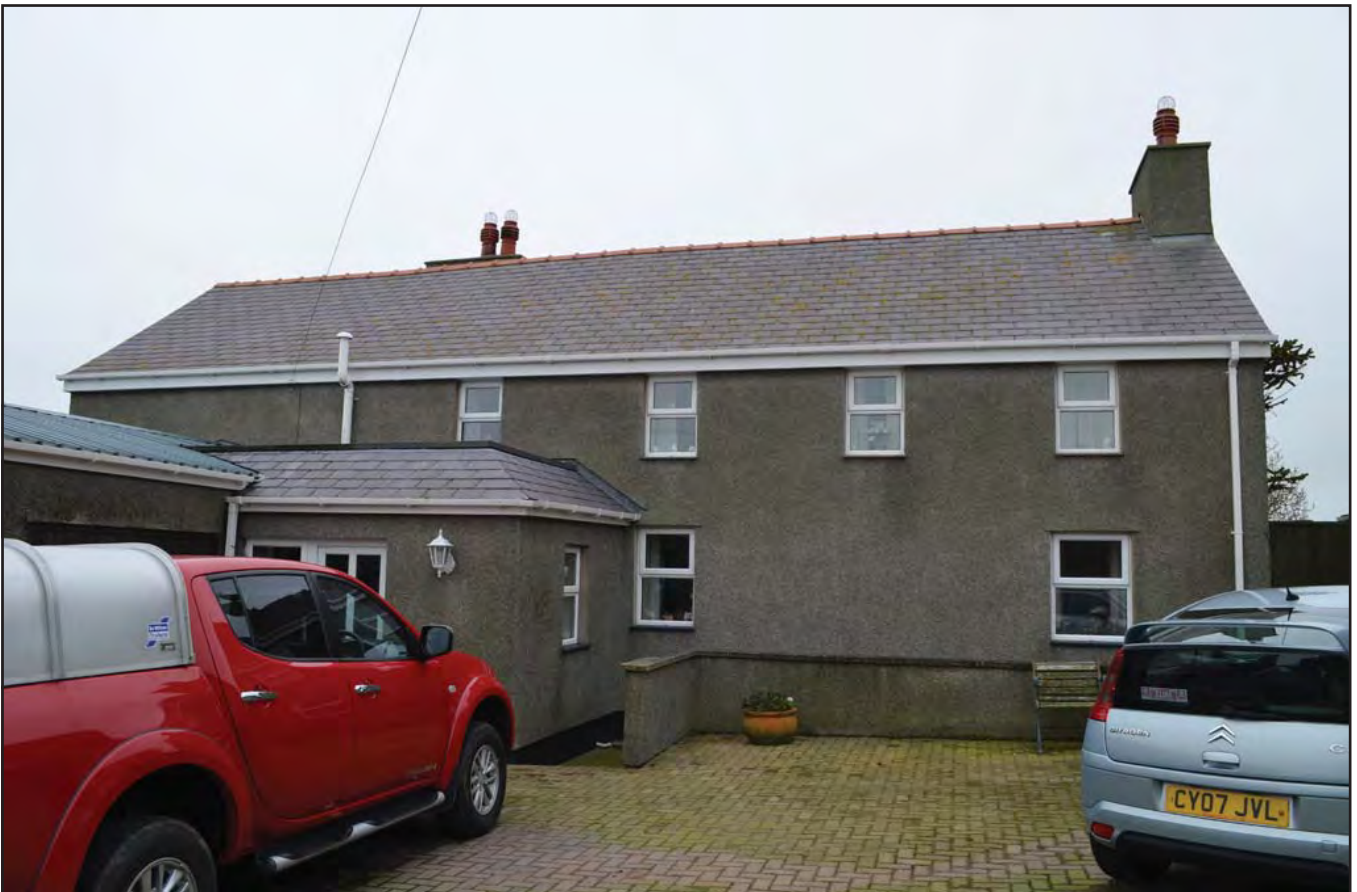
Plate 158: Asset 173, Rhos-Ty-Mawr, viewed from the WNW.