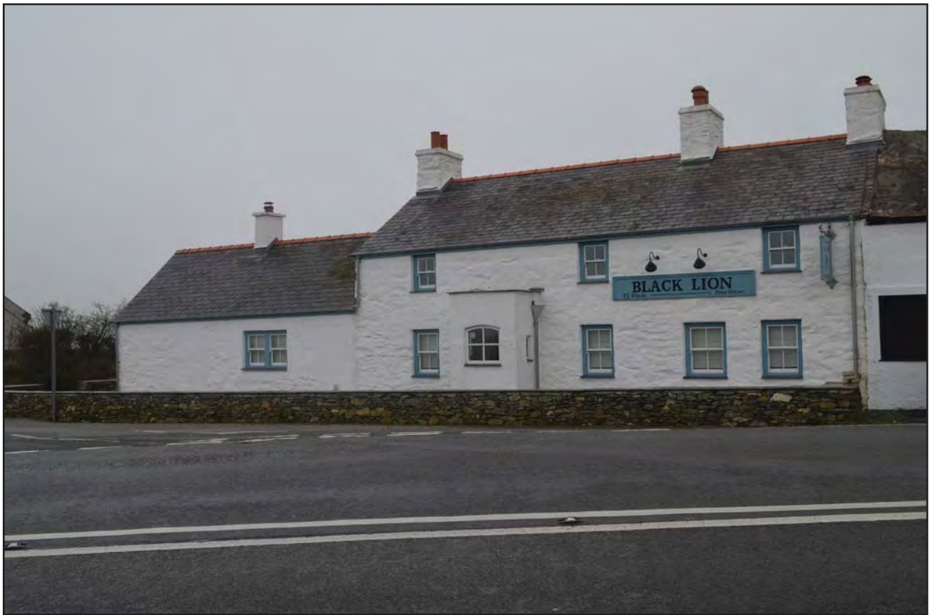
Plate 135: Asset 150, the Black Lion Inn, viewed from opposite side of A5025 to the W.