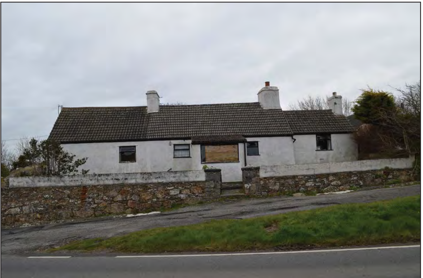
Plate 162: Asset 178, Ty'n-y-buarth, viewed from the NW.