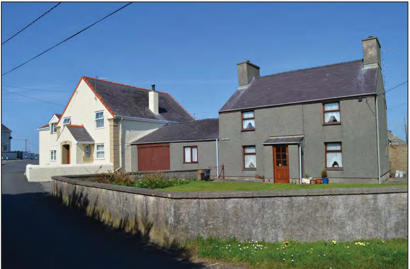
Plate 268: Asset 298, Gorphwysfa, viewed from the SE.