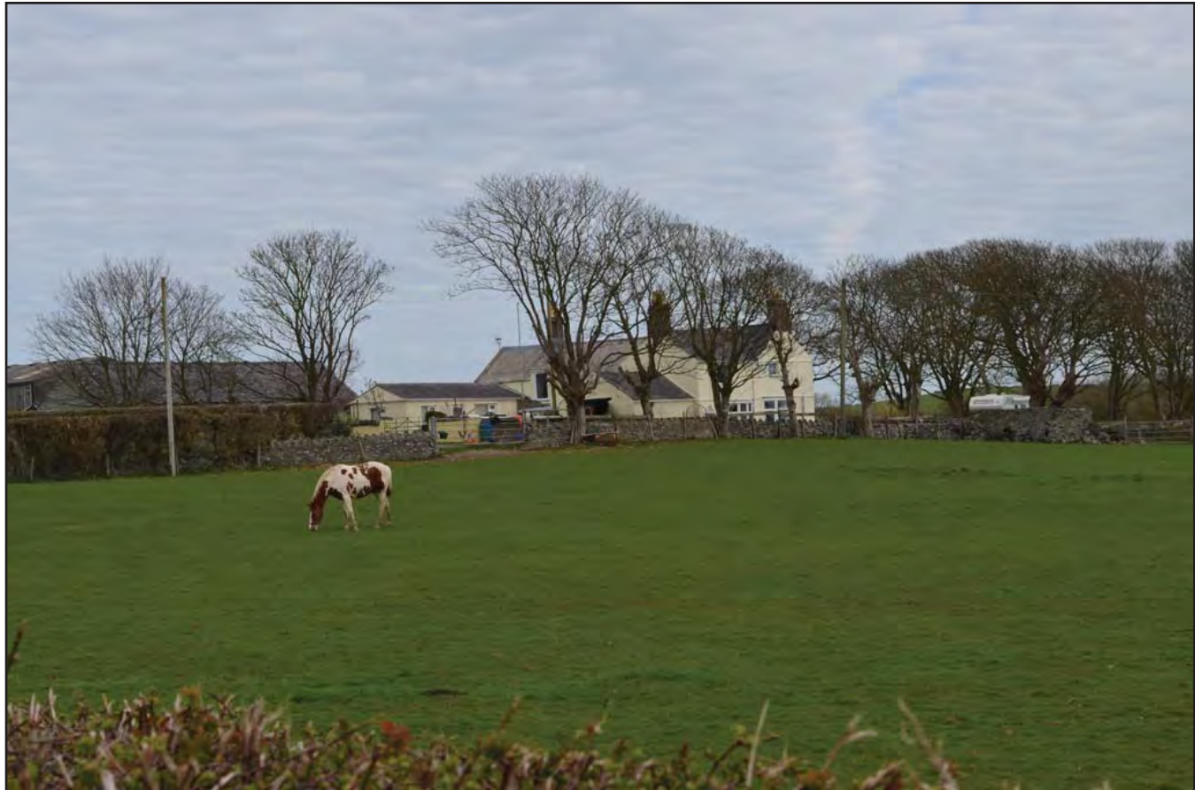
Plate 072: Asset 085, Bryn, viewed from the W.