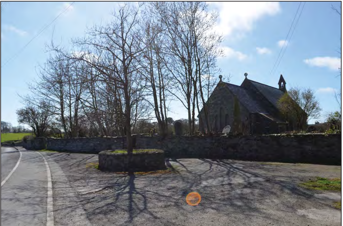
Plate 100: Asset 113, St Machraeth's Church Graveyard, viewed from the NE.