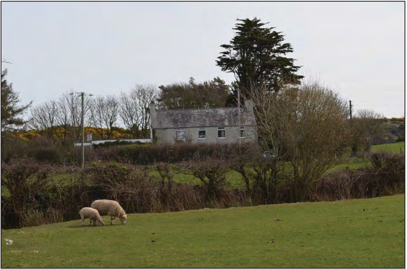
Plate 255: Asset 282, Cae Gwin, viewed from the WNW.