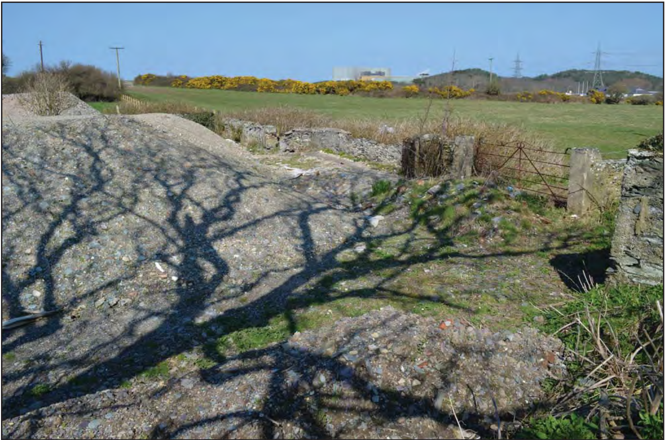
Plate 281: Asset 310, site of Tyddyn Du and Pen y Groes Isaf, viewed from the SE.