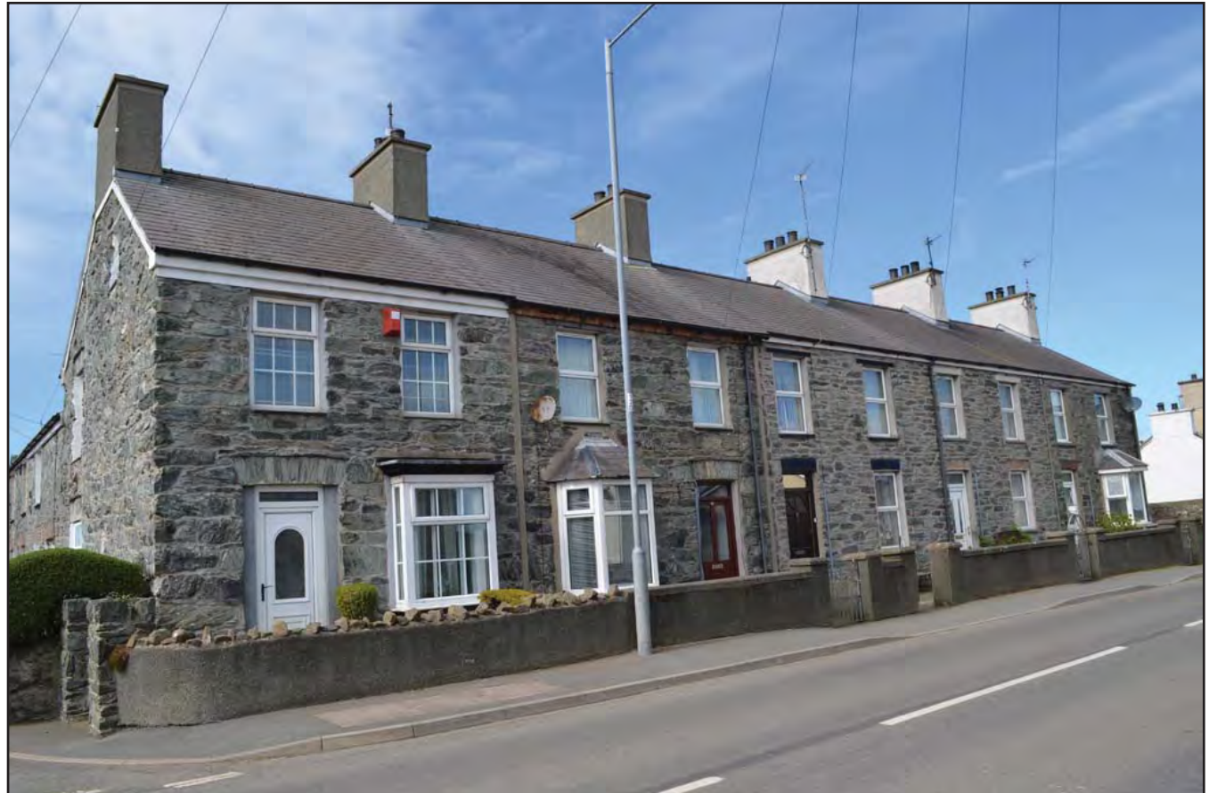
Plate 066: Asset 076, Mona Terrace, viewed from the SE.