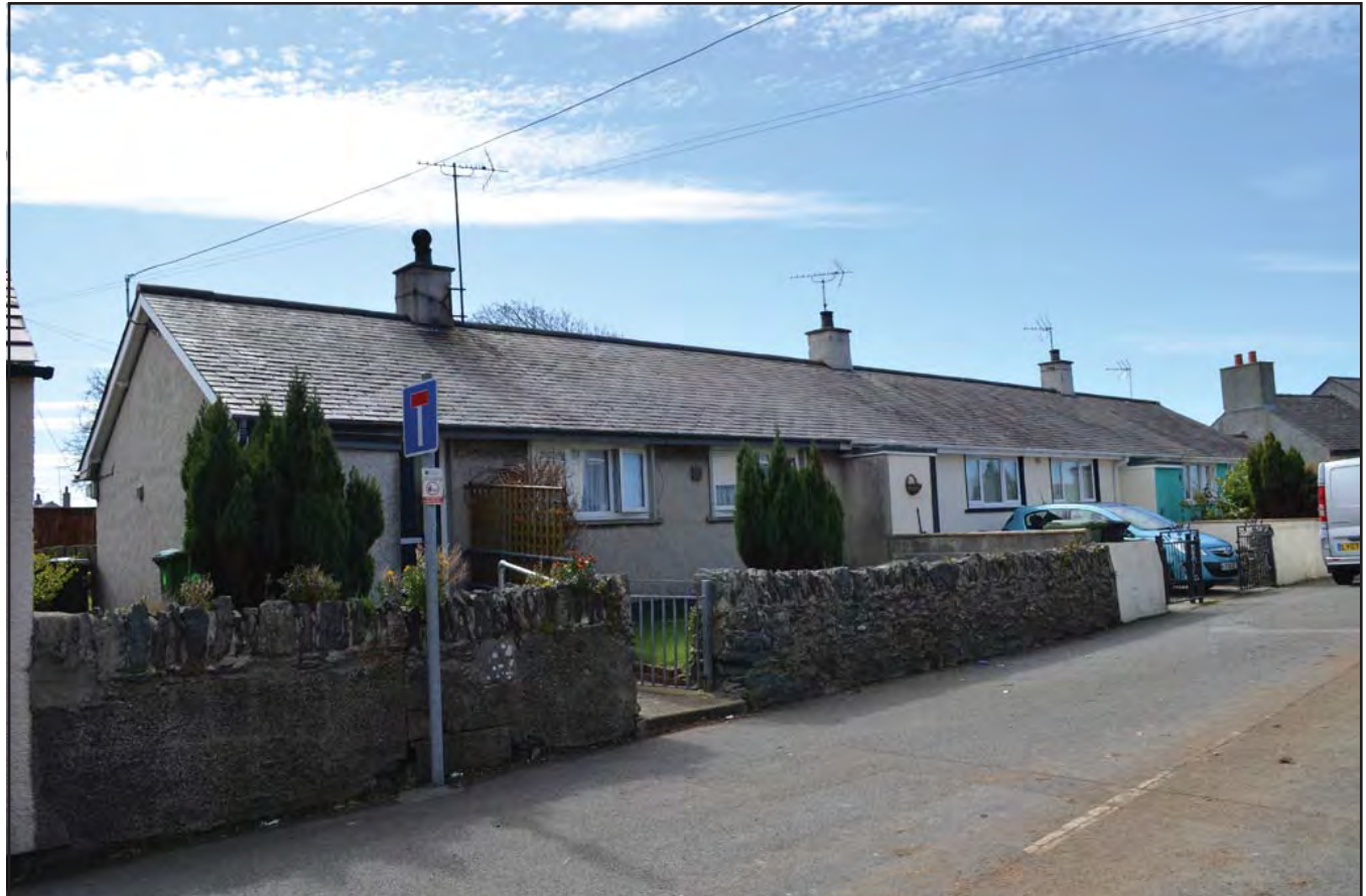
Plate 058: Asset 067, Mona Cottages, site of buildings to SW of Holland Hotel, viewed from the SW.