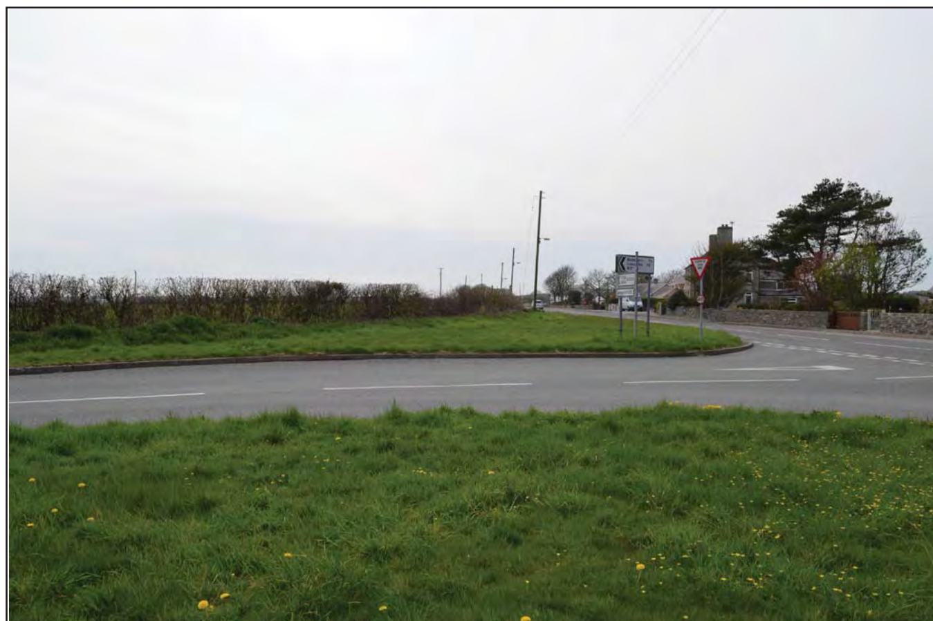
Plate 296: Route of proposed road improvement, viewed from the NE looking SW as it leaves Llanynghenedl.