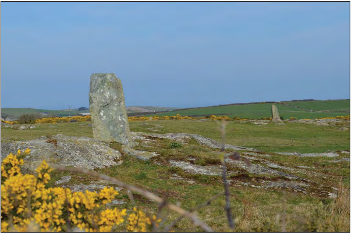
Plate 257: Asset 285, three orthostatic standing stones, viewed from layby to the SE.