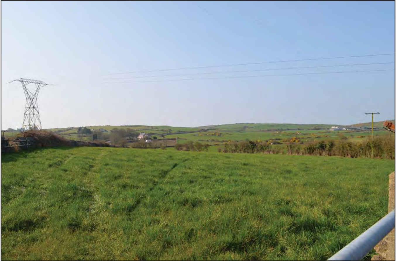
Plate 325: Route of proposed road improvement, looking from NE to SW, viewed from W of junction of A5025 and Llanfairynghornwy Rd.