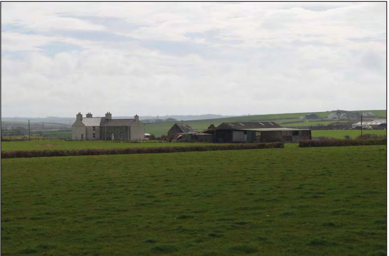
Plate 120: Asset 133, Bottan Fawr, viewed from the NW.