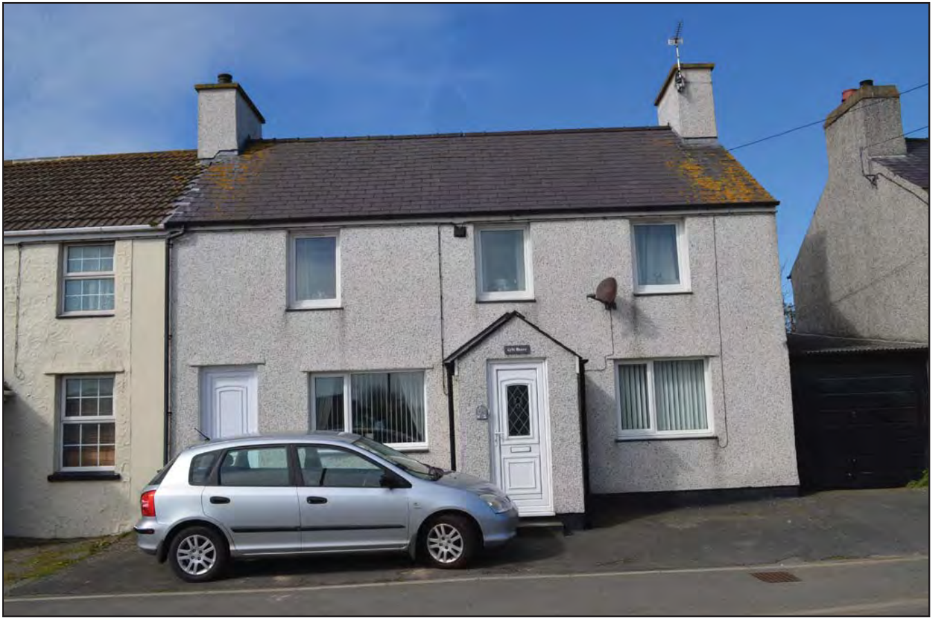
Plate 079: Asset 092, Cybi House, viewed from the E.