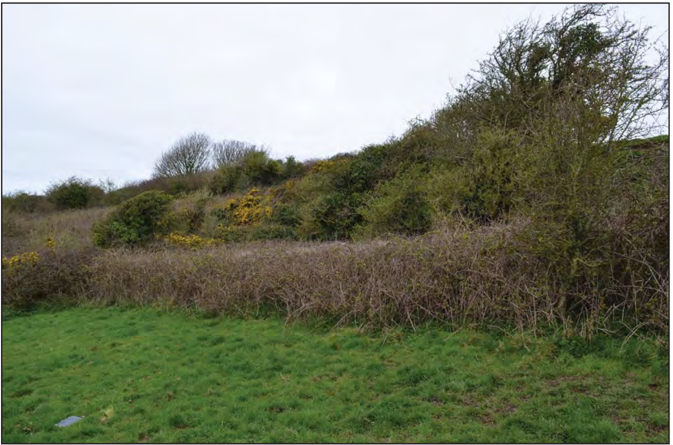
Plate 167: Asset 183, 'Old Quarry' SW of Bryn Maethlu, viewed from the SE.