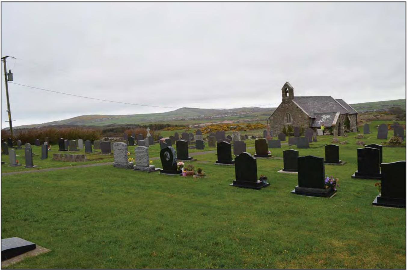
Plate 159: Asset 175, St Maethlu's Church Graveyard, viewed from the S.