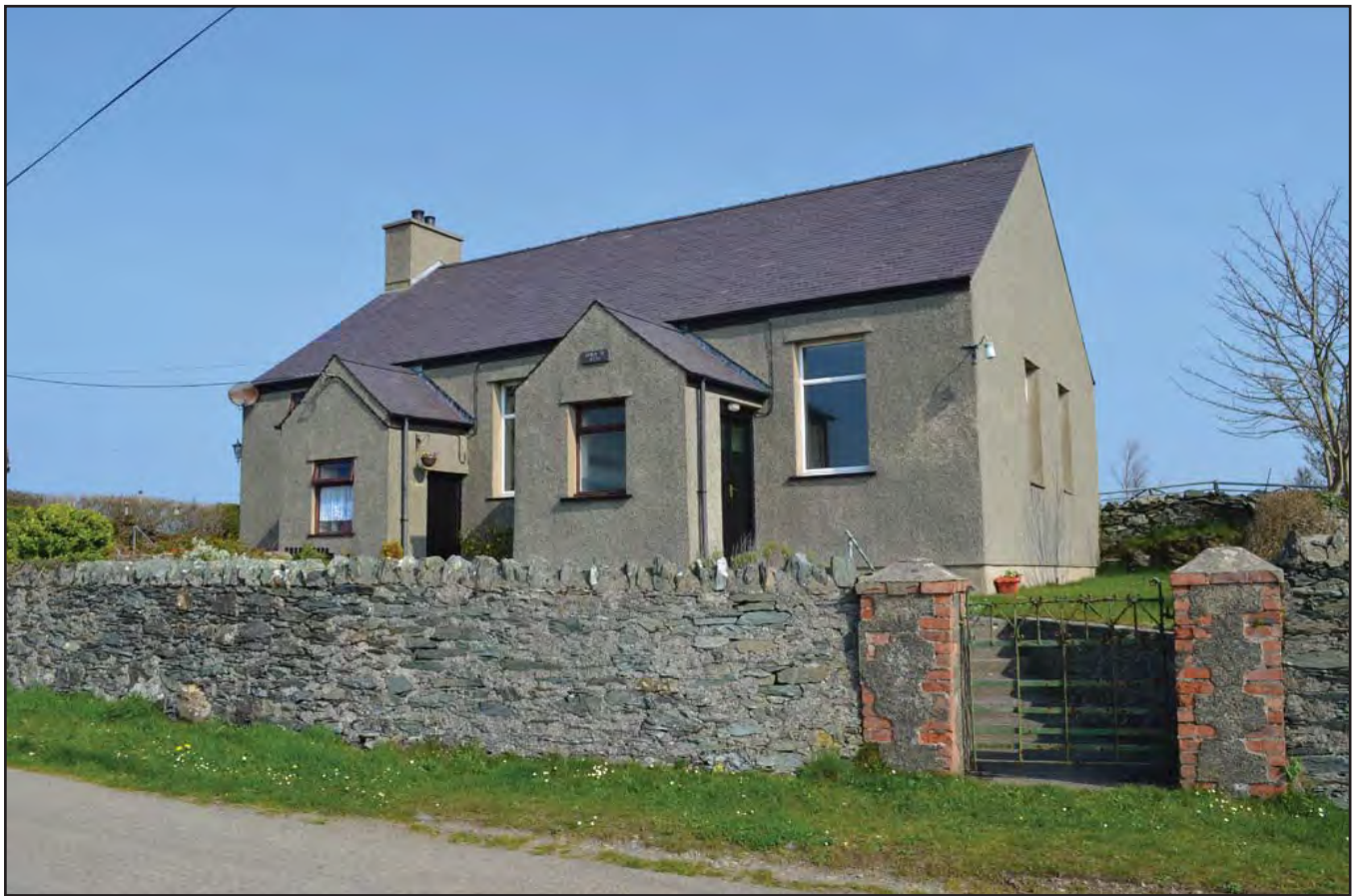
Plate 227: Asset 252, Capel Seilio, viewed from the SE.