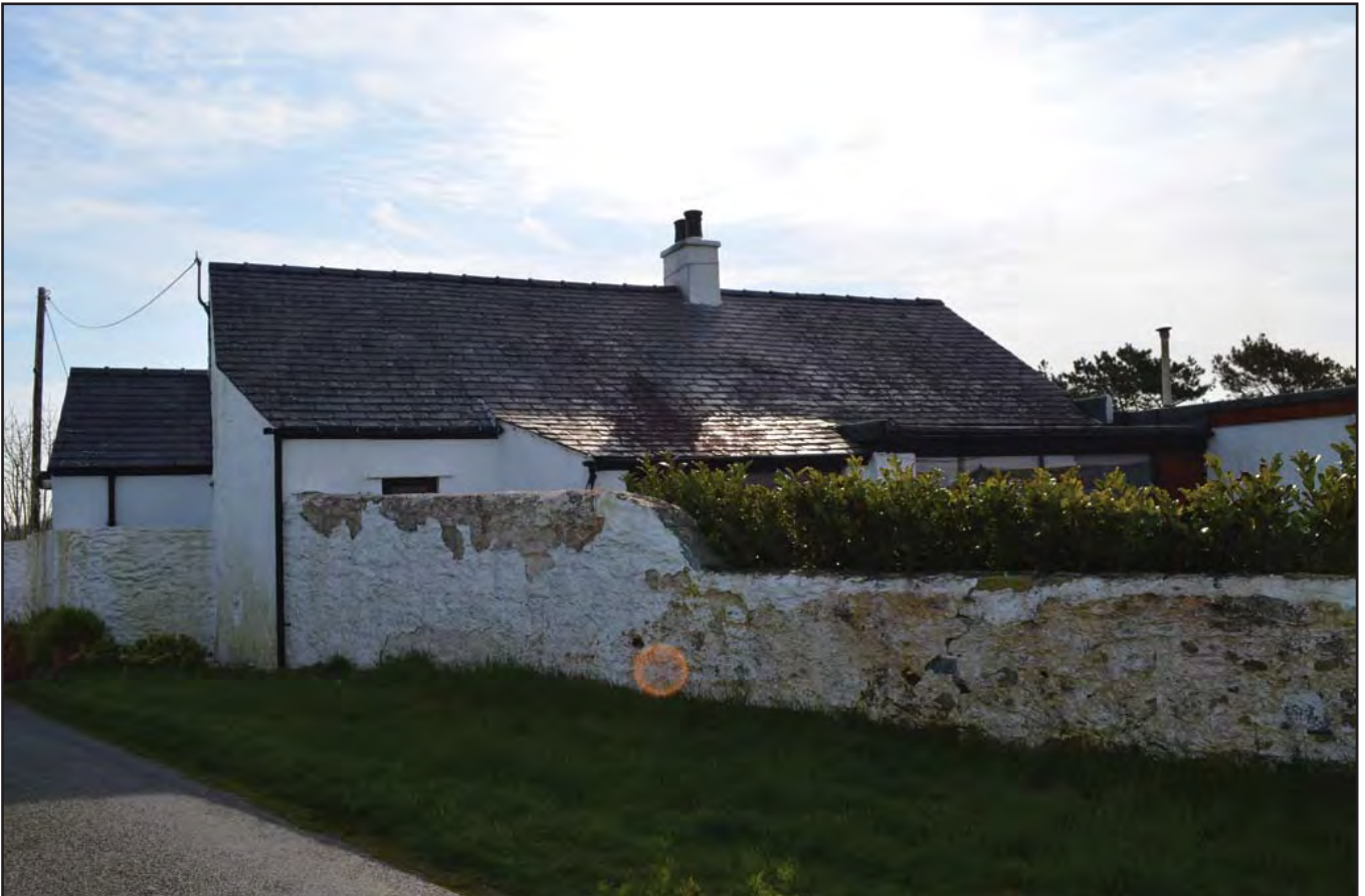
Plate 258: Asset 286, earliest part of Myndd-groes, viewed from the NW.