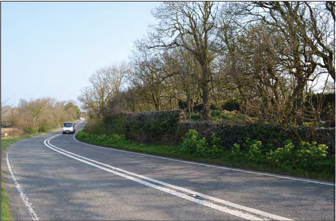
Plate 330: Route of proposed road improvement through woodland NW of Cefn Coch. Viewed from S to N.