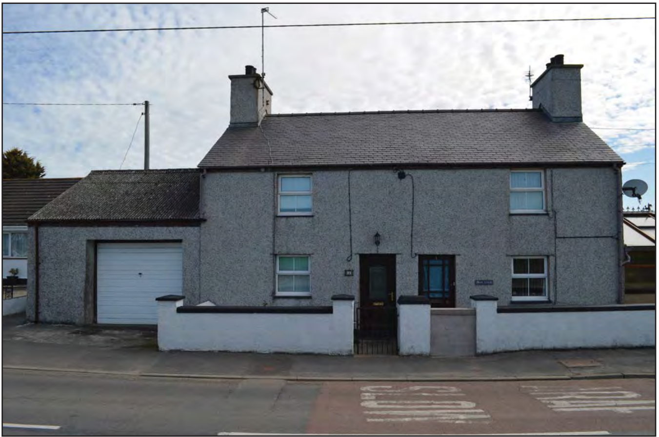
Plate 073: Asset 086, 1 & 2 Bont Llwyd, viewed from the W.