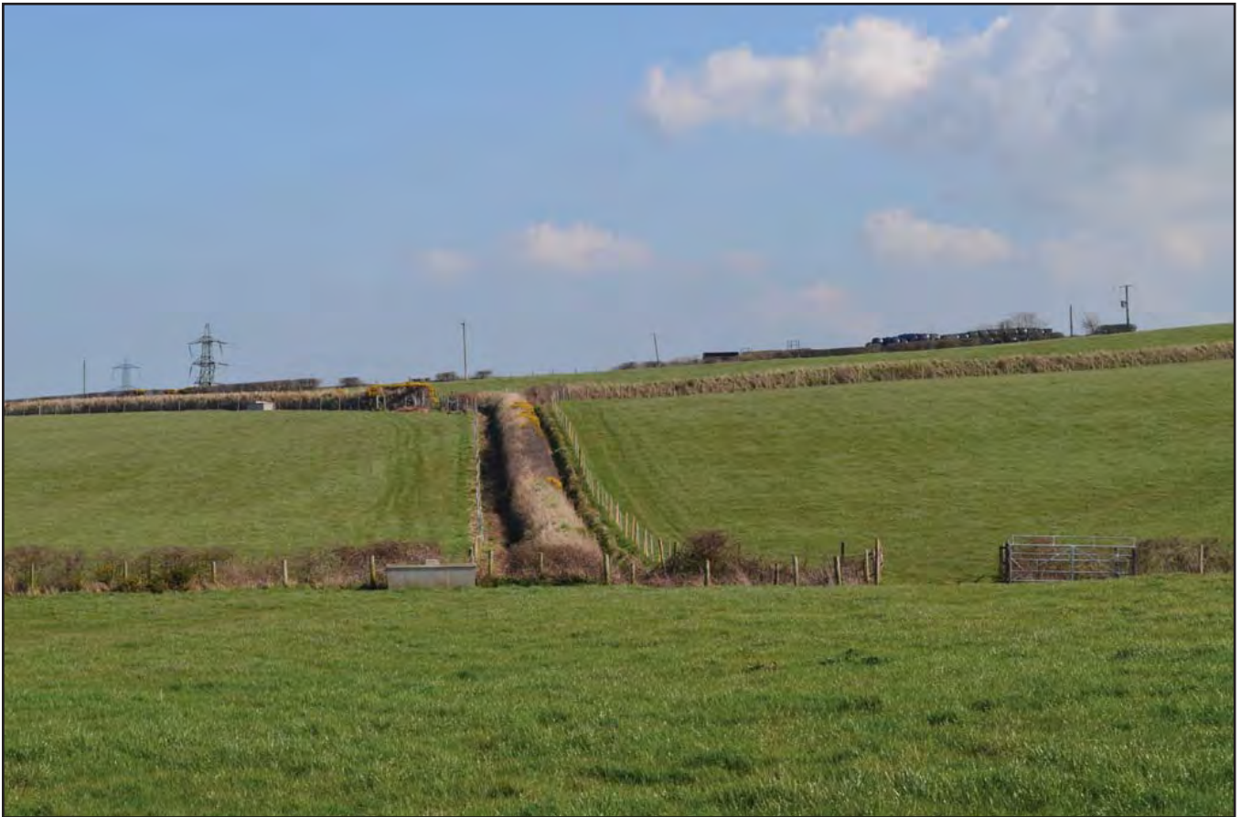
Plate 263: Asset 291, site of Building NW of Foel-fawr, viewed from the NW.