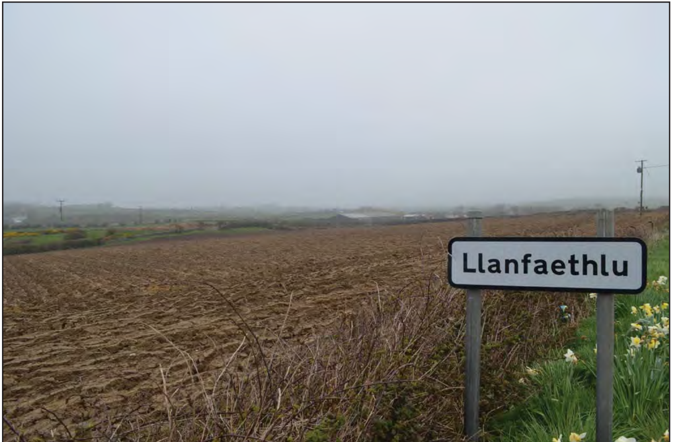
Plate 307: Route of proposed road improvement, viewed from the SSE, across fields W of Black Lion Inn corner.