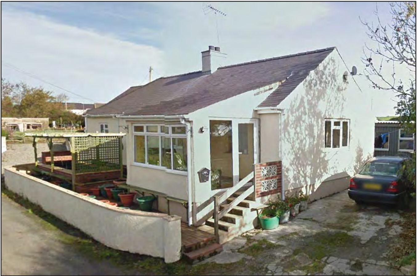
Plate 111: Asset 124, dwelling SE of Tan-yr-Allt, viewed from the SW.