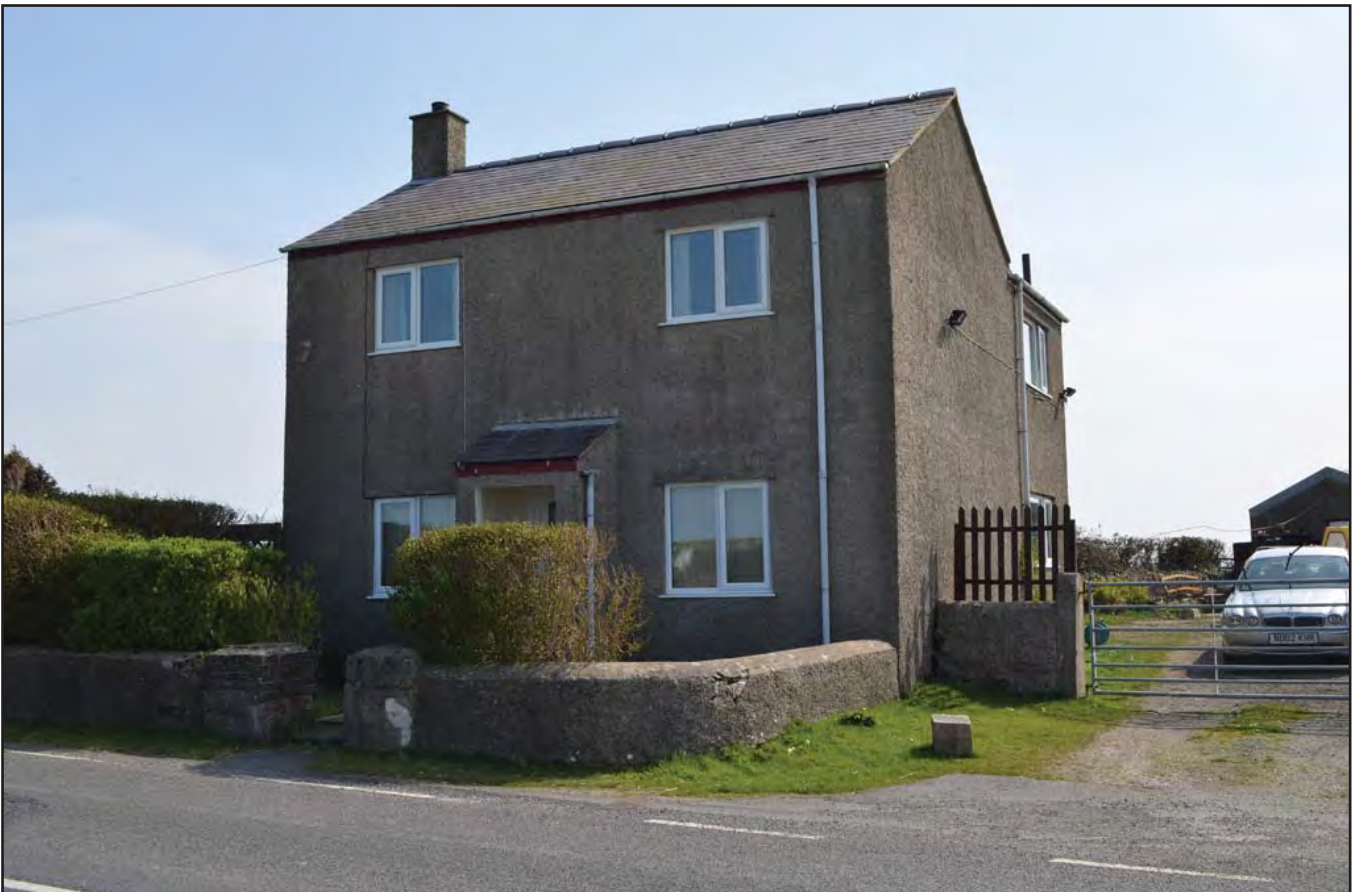
Plate 182: Asset 204, Ty Newydd, viewed from the W.