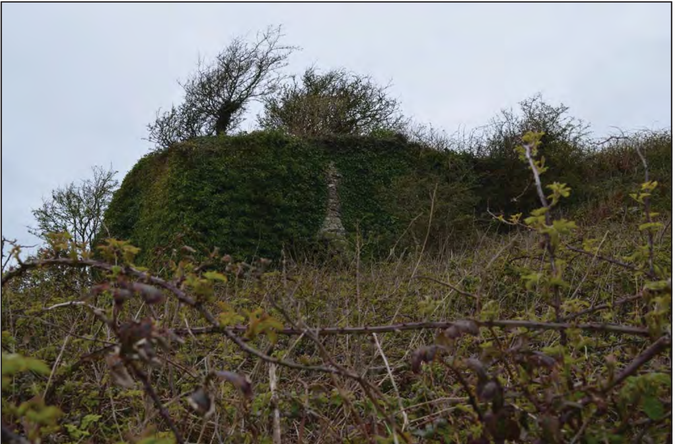
Plate 166: Asset 182, lime kiln, Carreglwyd, viewed from the E.