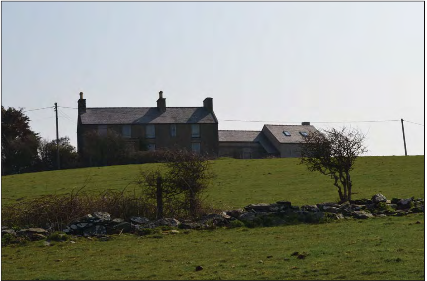
Plate 225: Asset 250, Pen-y-groes Arthur, viewed from the NW.