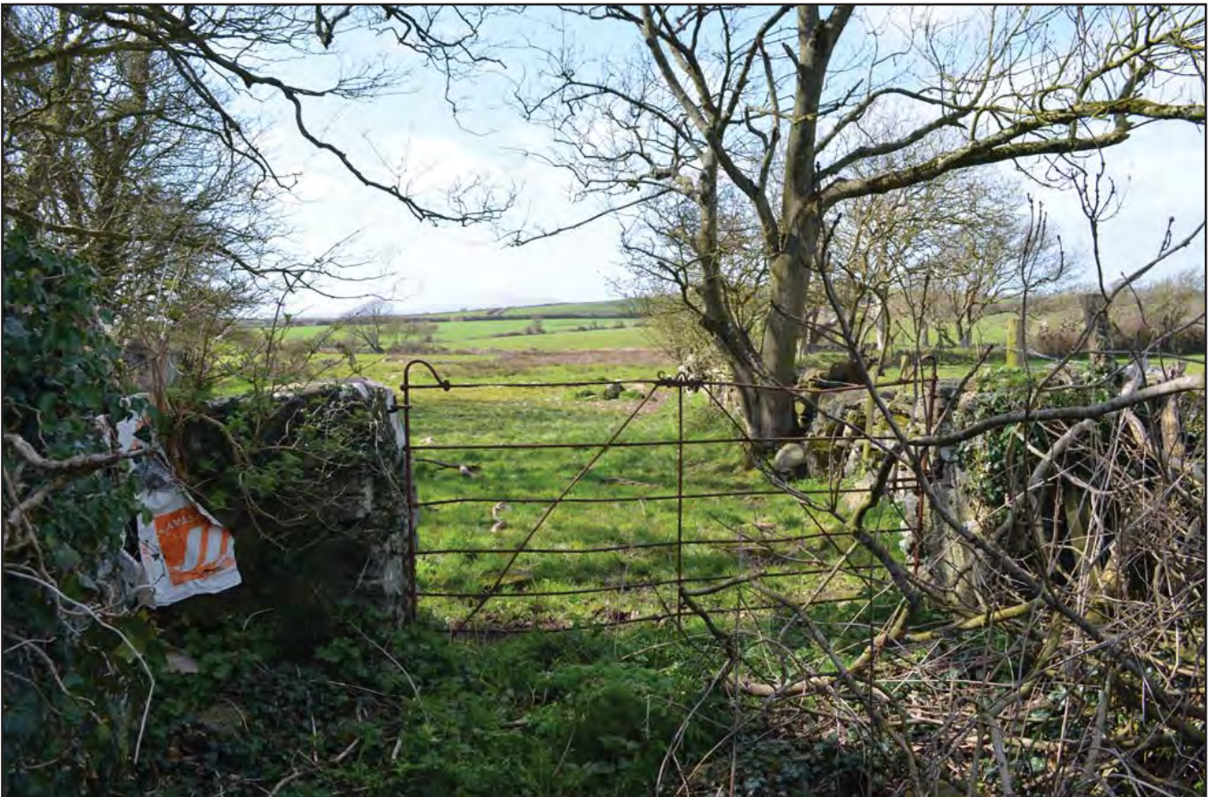
Plate 104: Asset 117, site of Tyddyn-y-waen, no visible remains, viewed from the NE.