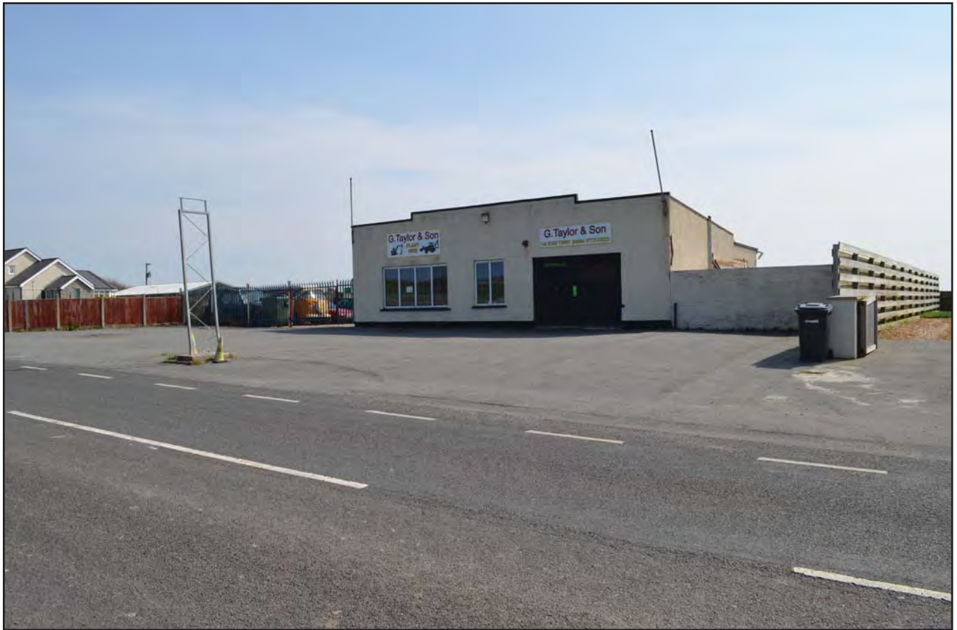
Plate 183: Asset 205, site of building NW of Ty Newydd under garage forecourt, viewed from the W.