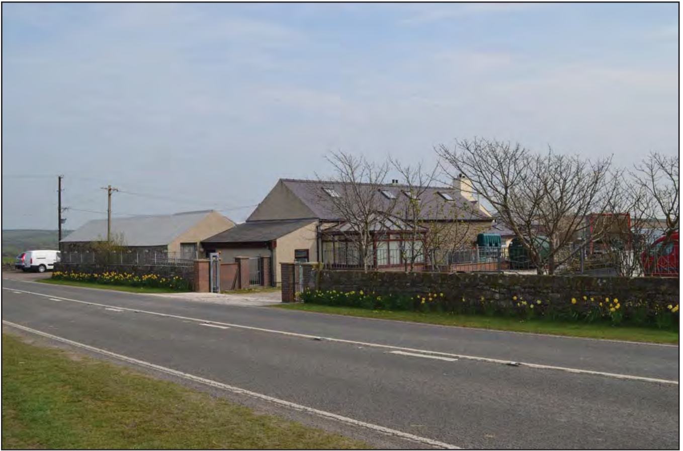
Plate 179: Asset 199, Bodowen, viewed from the W.