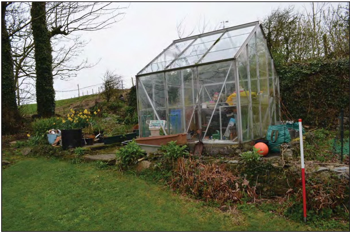
Plate 145: Asset 159, site of NE-SW outbuilding W of Tan-y-Bryn, viewed from the NE.