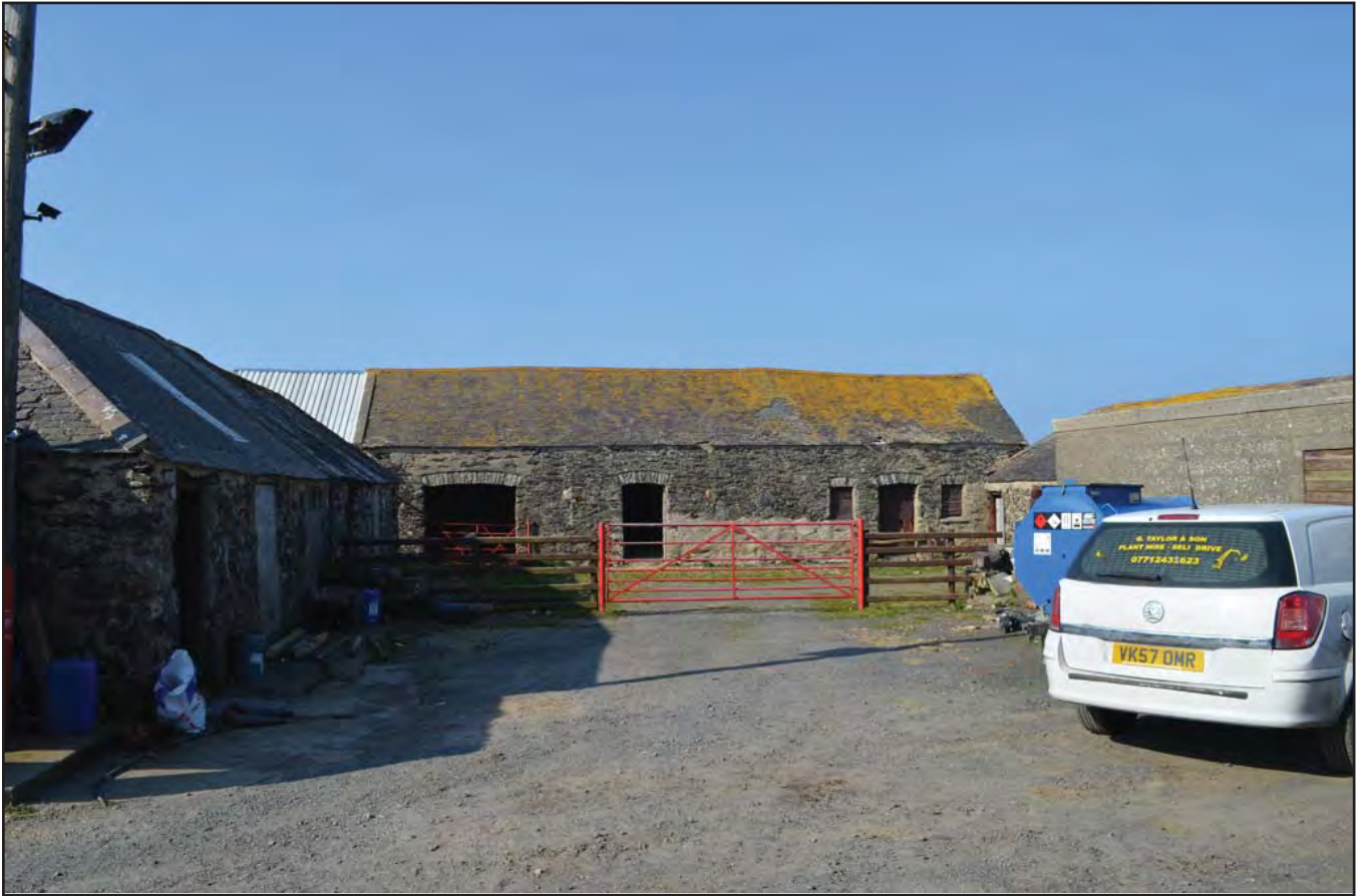
Plate 201: Asset 224, Bryn-Glas outbuildings, viewed from the S.