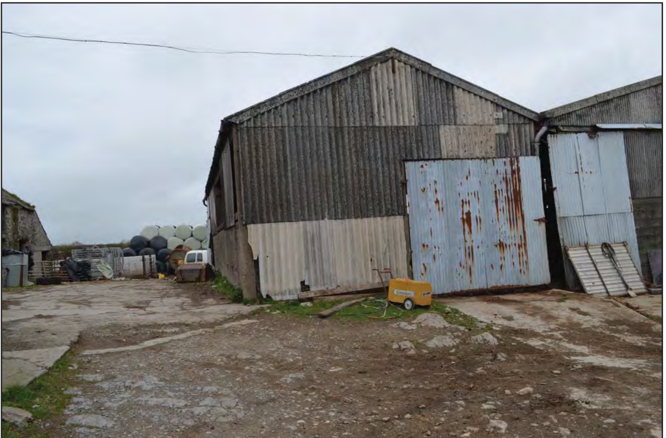
Plate 128: Asset 143, site of Building 2 Fadog-lwyd, viewed from the SSW.