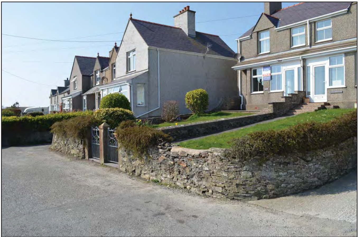
Plate 203: Asset 226, site of Building SW of Bethel-hen, viewed from the SE.