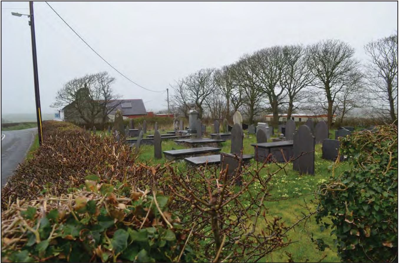
Plate 133: Asset 148, Capel Soar Burial ground, viewed from the SW.