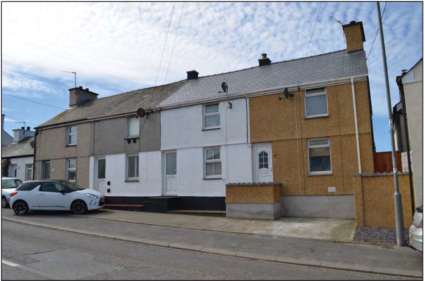
Plate 069: Asset 080, Rose Place, viewed from the NE.