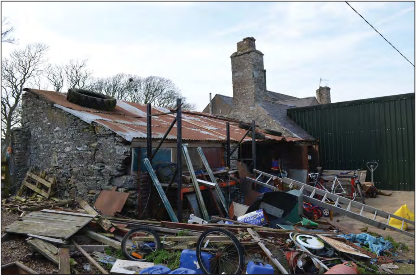
Plate 233: Asset 259, N-S wing of L shaped outbuilding, Cefn Coch. Includes old smithy, viewed from the SE.