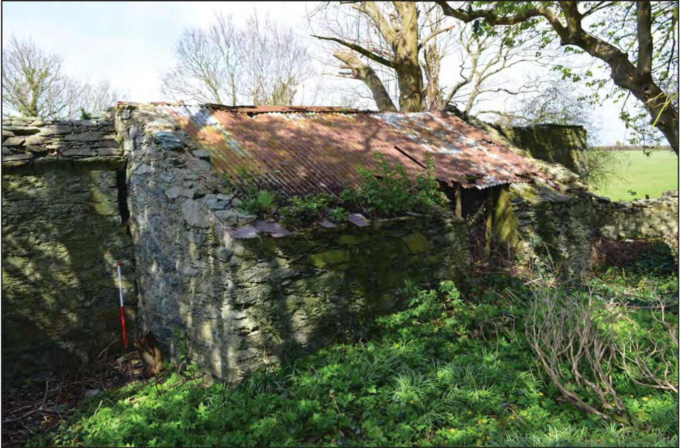
Plate 103: Asset 116, outbuilding NE of the rectory, viewed from the S.