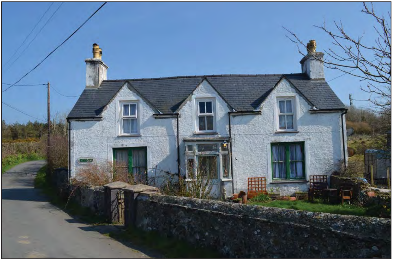
Plate 211: Asset 234, Penrhyd, viewed from the NW.