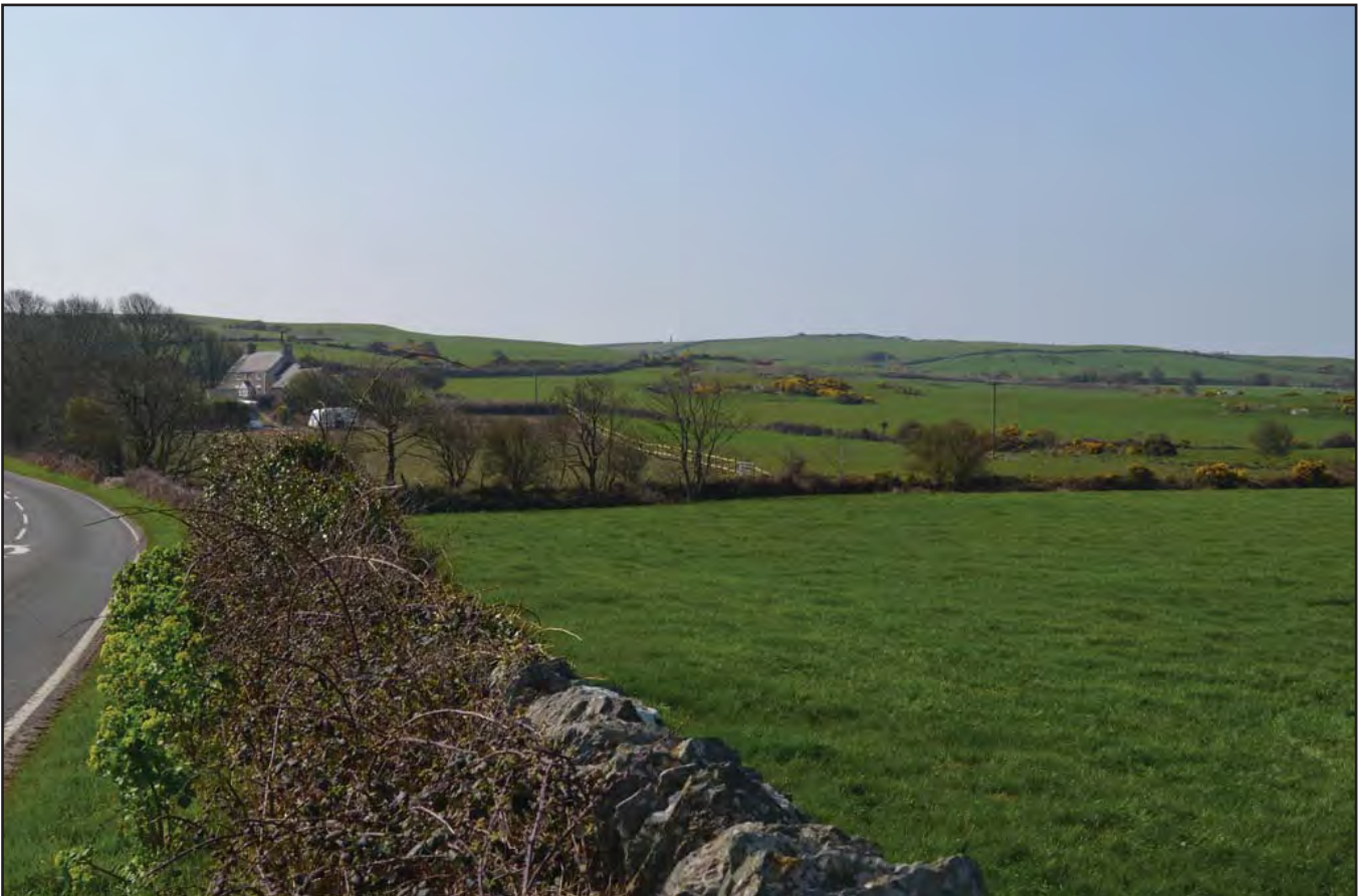
Plate 324: Route of proposed road improvement W of Ty'n y Felin. Viewed from NE to SW from A5025.