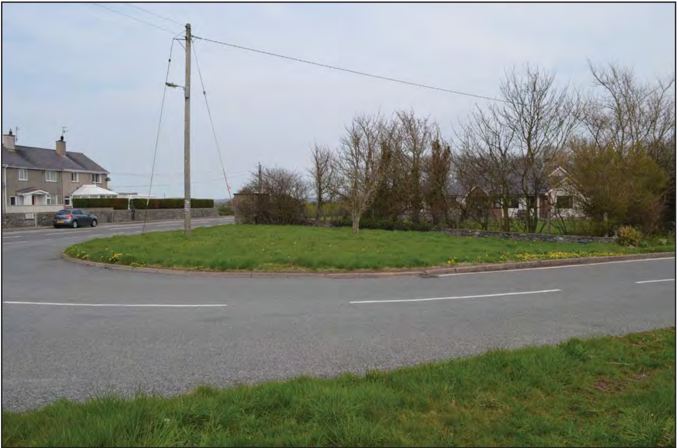
Plate 297: Route of proposed road improvement, viewed from the SW looking NE as it crosses the junction at Llanynghenedl.