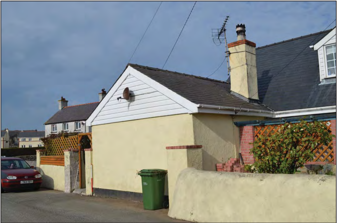
Plate 191: Asset 214, surviving NW-SE building from Ty-Mawr, incorporated into modern house Bwythyn, viewed from the E.