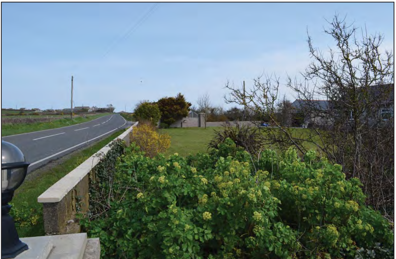
Plate 184: Asset 206, site of Lon-las under modern garden, viewed from the NE.