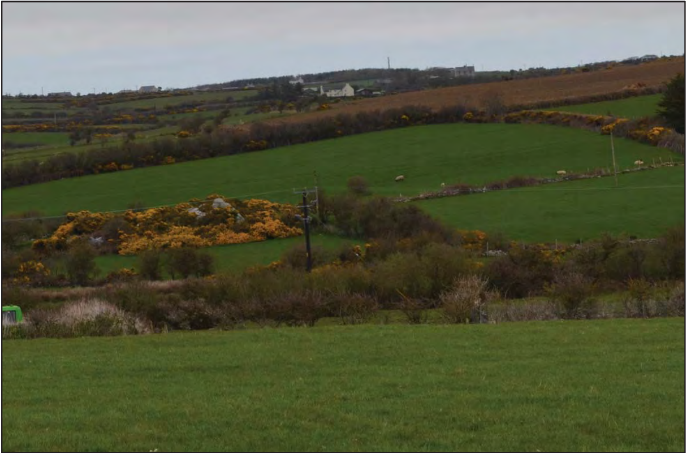
Plate 169: Asset 186, site of Early Christian Burial Ground, Hen Shop, viewed from the NE.