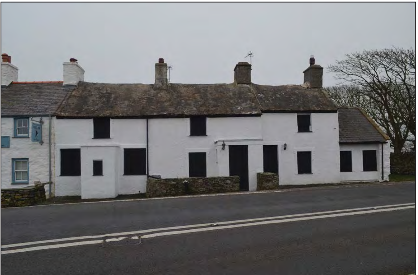
Plate 134: Asset 149, Siop Soar, viewed from opposite side of A5025 to the WNW.