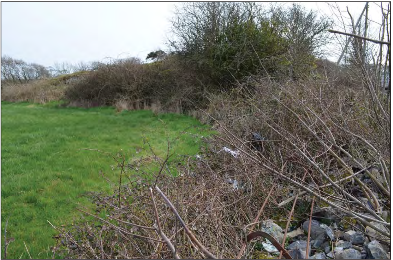
Asset 268, site of Building NW of Pandy Cefn-coch, viewed from the NW.