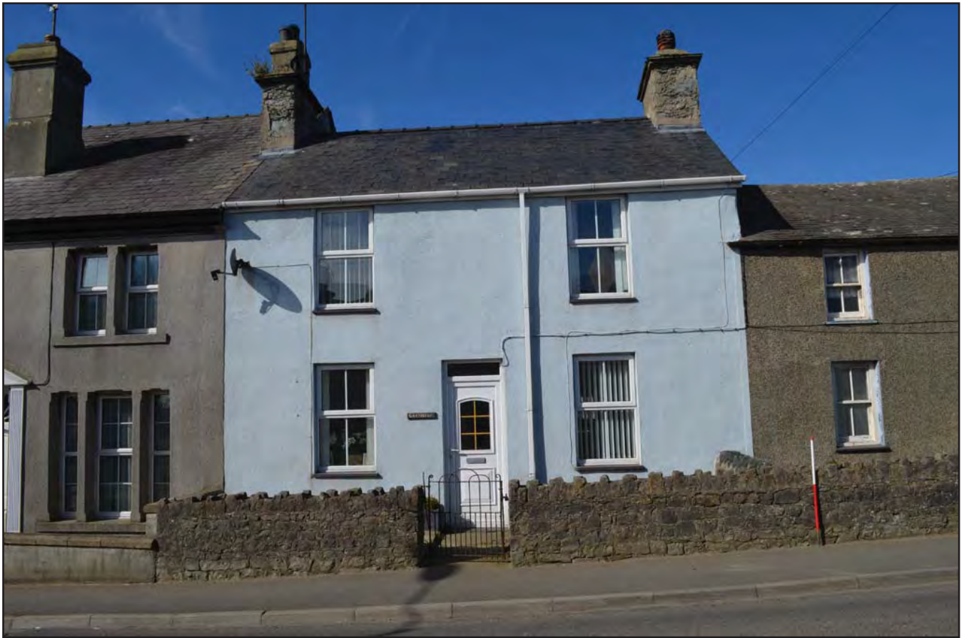
Plate 083: Asset 096, Cartrefle, viewed from the E.