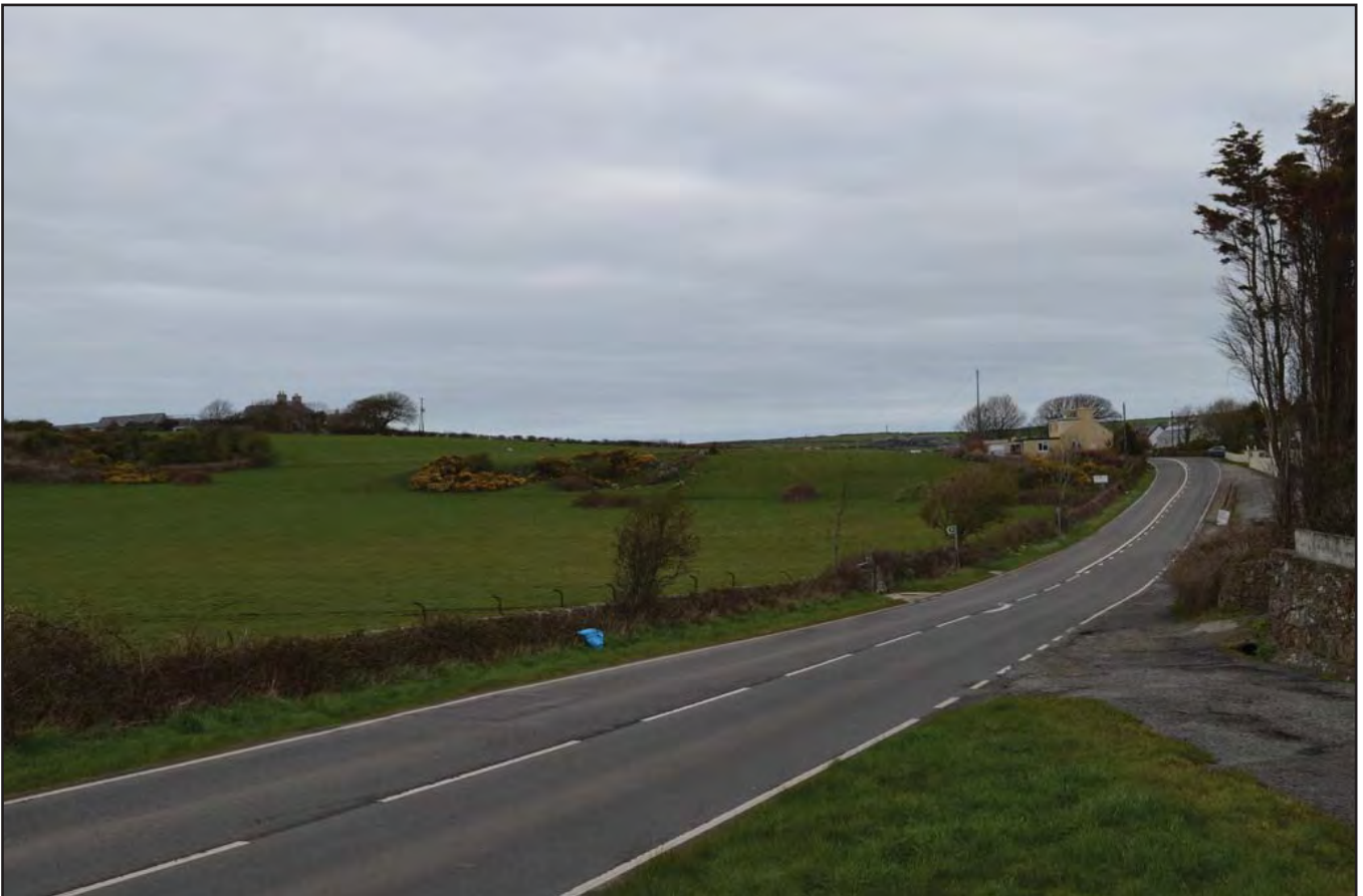
Plate 312: Route of proposed road improvement, looking from SSW to NNE across fields, viewed from laybay at Ty'n-y-buarth.