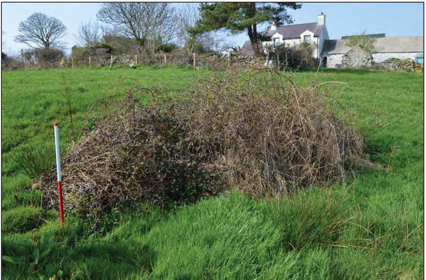
Plate 228: Asset 254, well E of Carreg Cam, viewed from the NE.