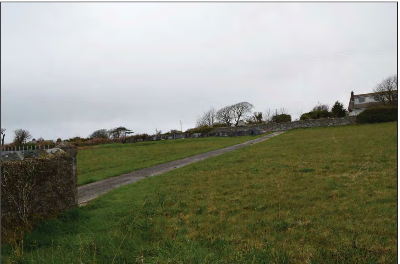
Plate 152: Asset 167, Capel Ebenezer Cemetery, viewed from the E.