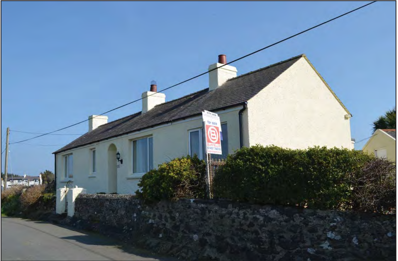
Plate 209: Asset 232, Erw, viewed from the NW.