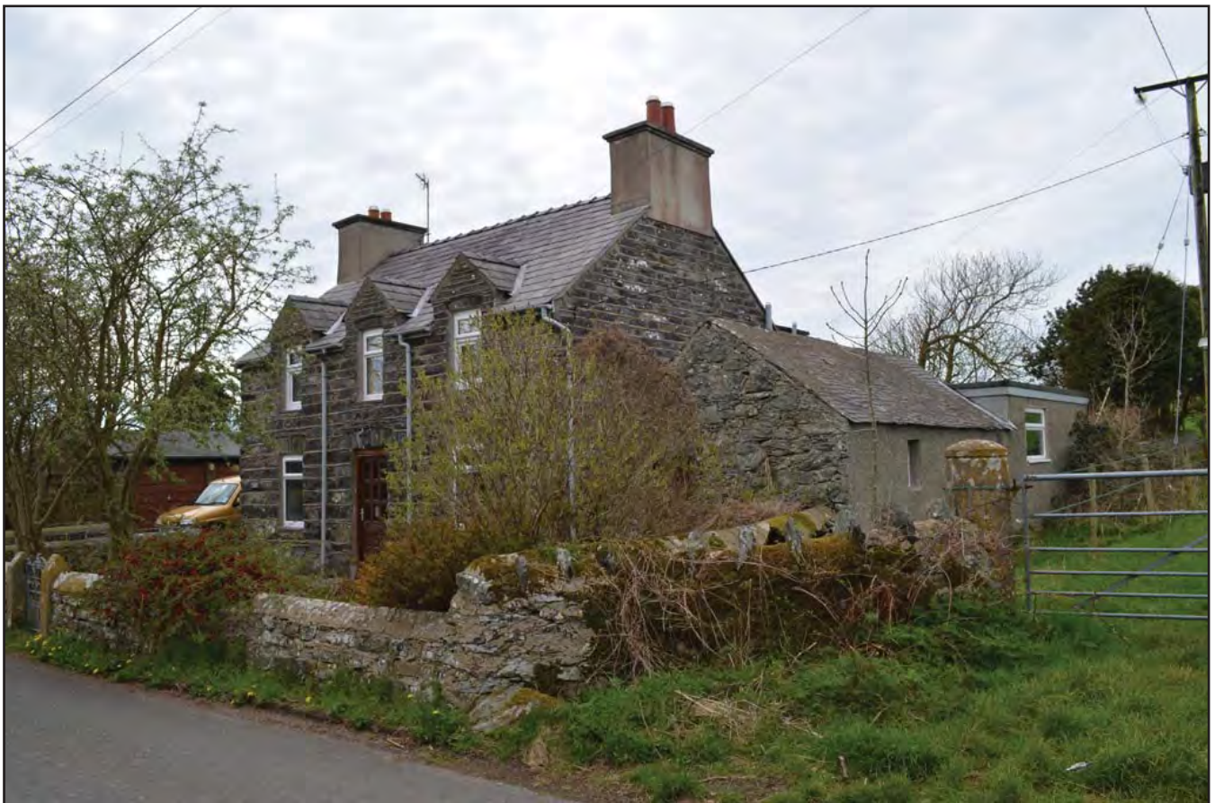
Plate 090: Asset 103, Frondeg, viewed from the E.