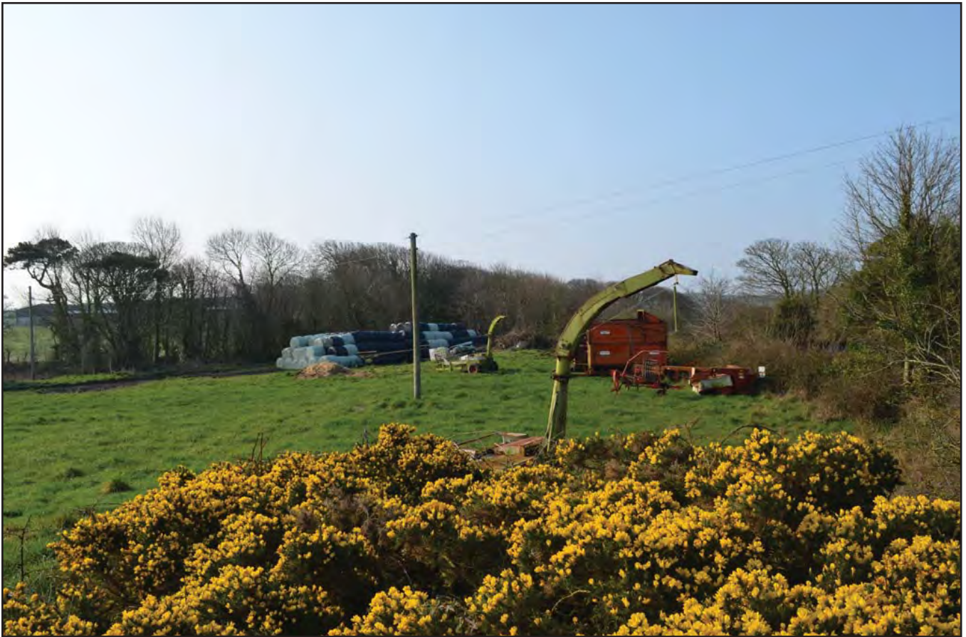
Plate 331: Route of proposed road improvement, looking from N to S towards Cefn Coch, viewed from outcrop E of Pandy.