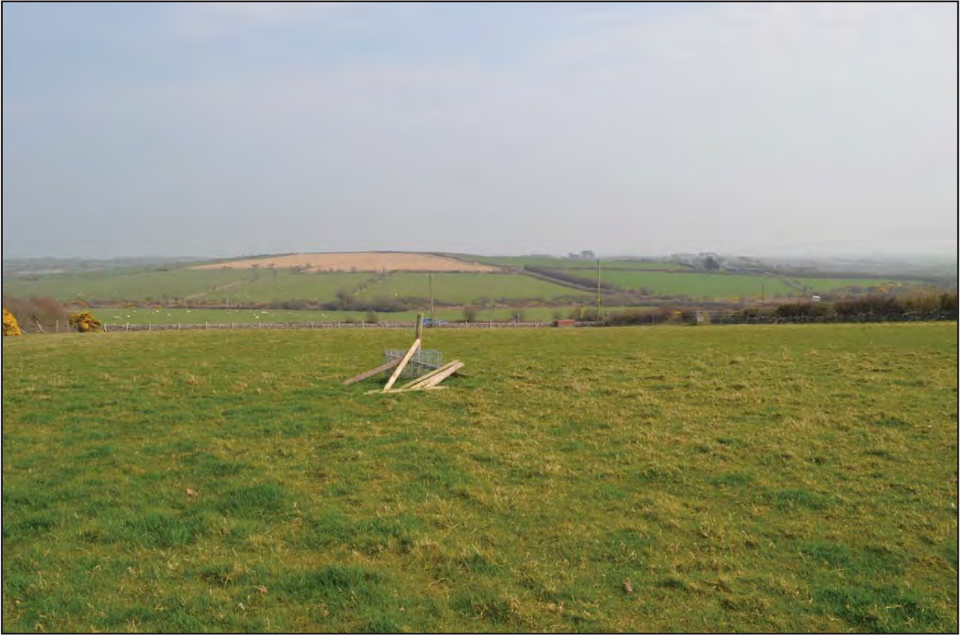
Plate 314: Route of proposed road improvement, looking from W to E across field E of Bryn Gwyn.