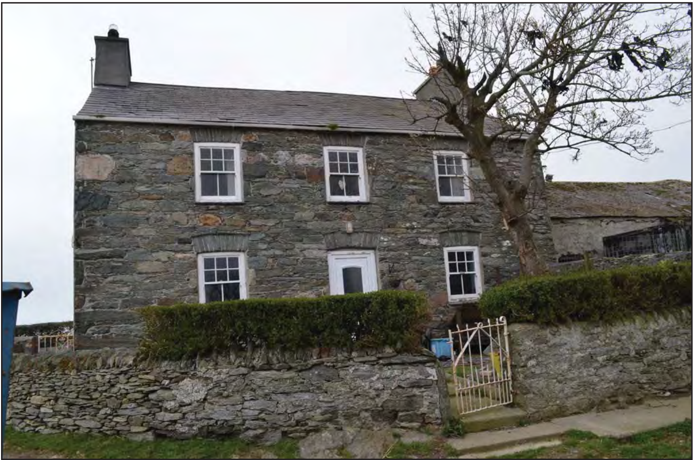
Plate 127: Asset 142, Fadog-Lwyd, viewed from the E.