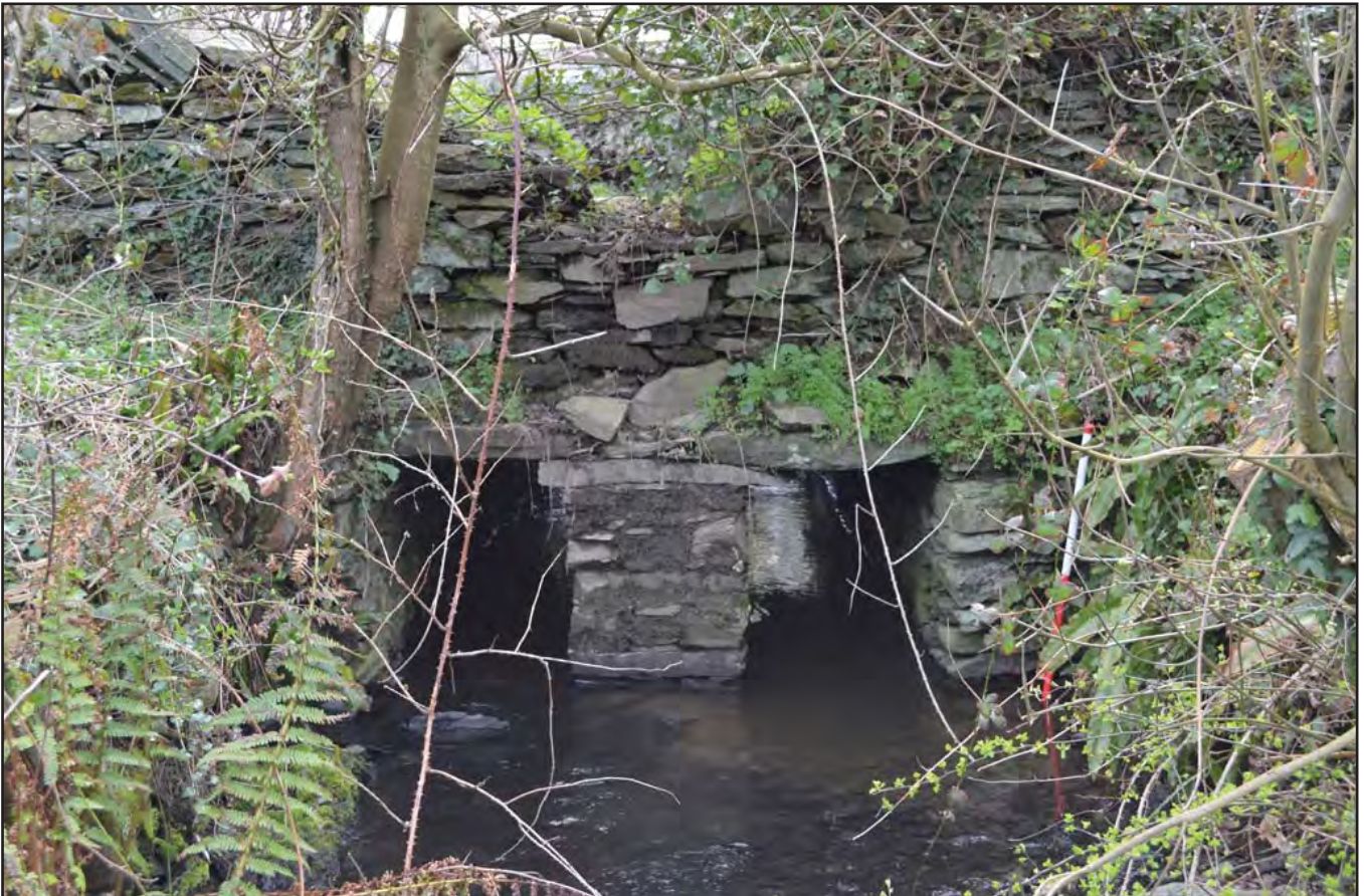
Plate 244: Asset 272, bridge / culvert under road for mill race, Melin Cefn Goch, viewed from the S.