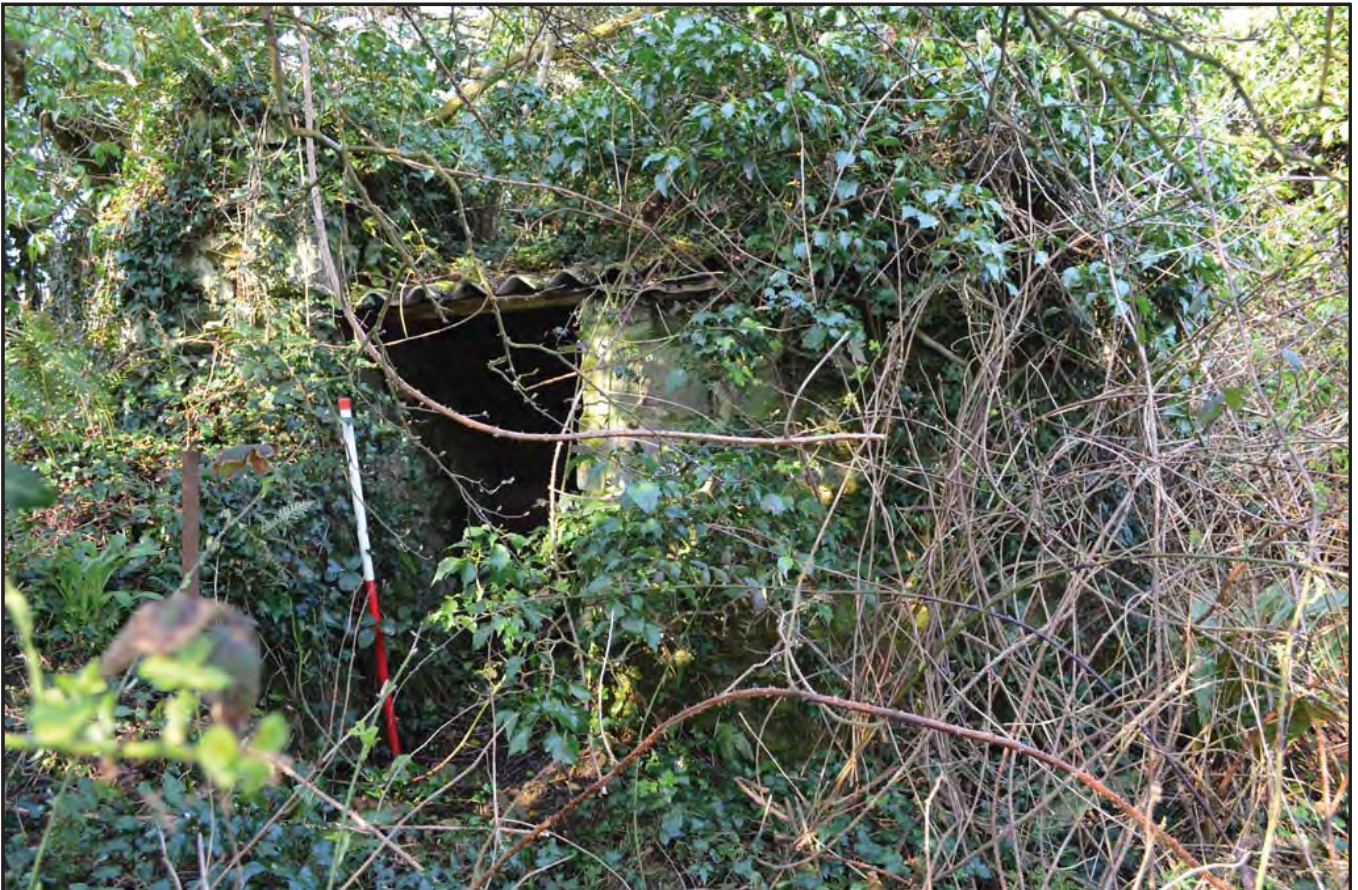
Plate 226: Asset 251, Melin Bodronyn (former site of Cylch y Garn), viewed from the SE.