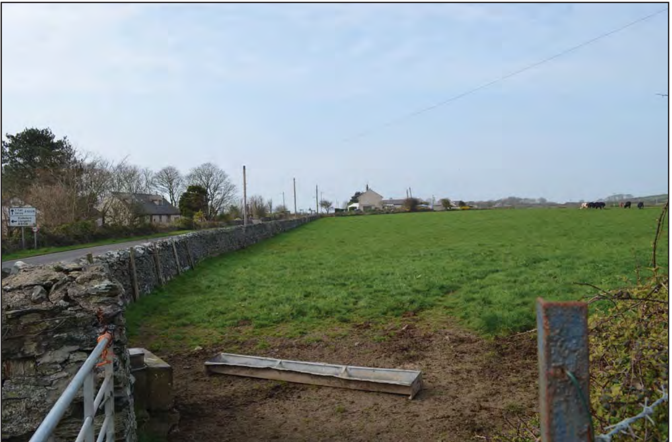
Plate 298: Route of proposed road improvement, viewed from the NE looking SW as it enters Llanynghenedl.