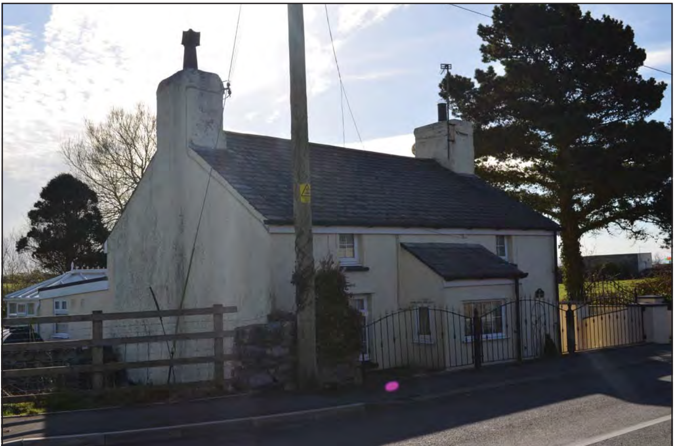
Plate 094: Asset 107, Cartref, viewed from the NW.