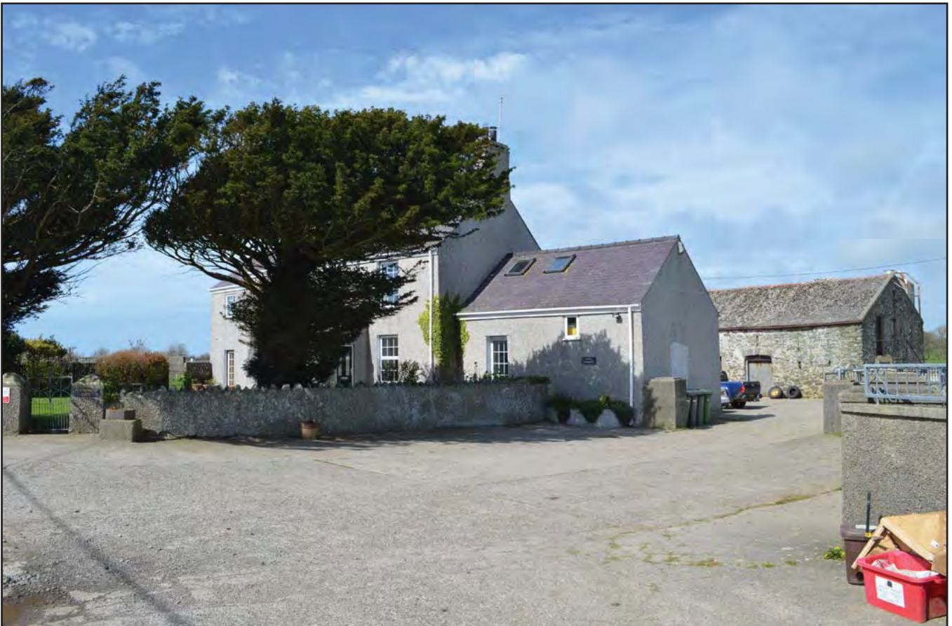
Plate 106: Asset 119, Pen-yr-Orsedd, viewed from the SE.