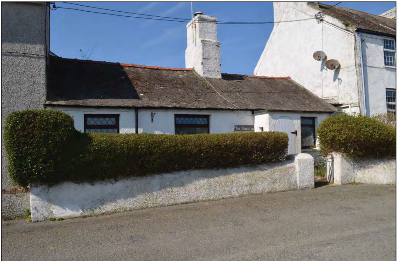
Plate 276: Asset 305, Smithy 2 (The Bungalow) , viewed from the SE.