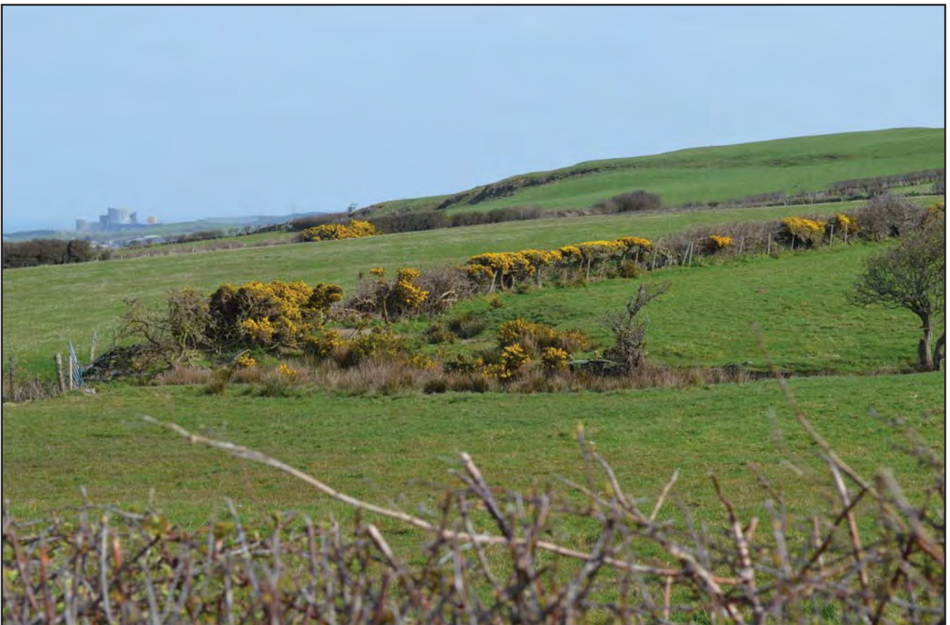
Plate 198: Asset 221, site of Spring N of Swn-y-nant, viewed from the SW.