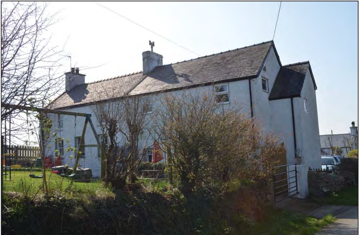
Plate 212: Asset 235, Grimpan, viewed from the NE.