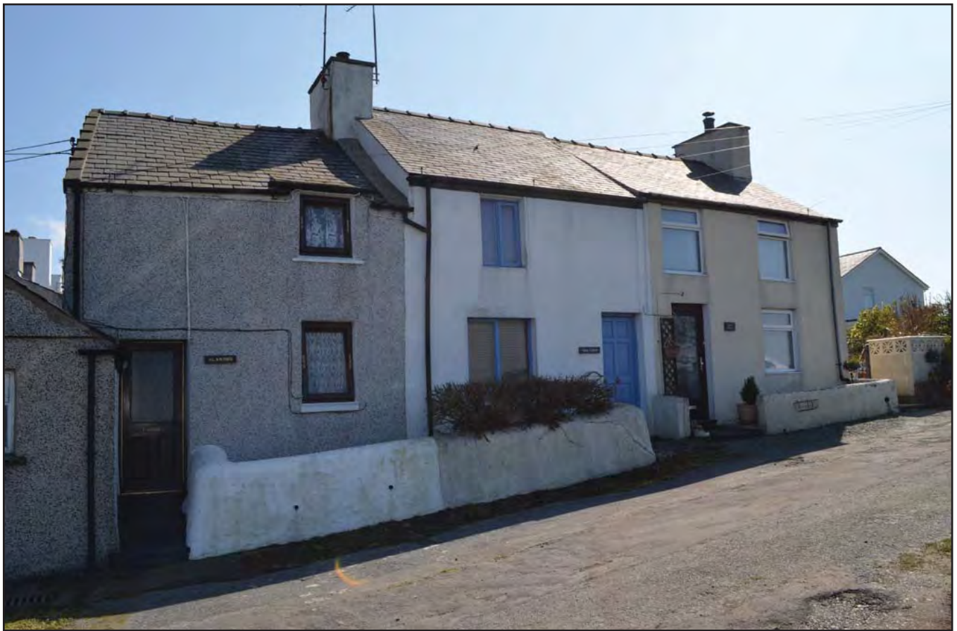
Plate 273: Asset 302, Glandwr, Siop Uchaf and Glan Eifion, viewed from the NNW.