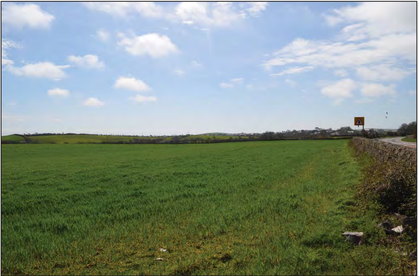
Plate 305: Route of proposed Llanfachraeth bypass, viewed from the NNE, viewed from A5025 SE of Pen-y-groes.