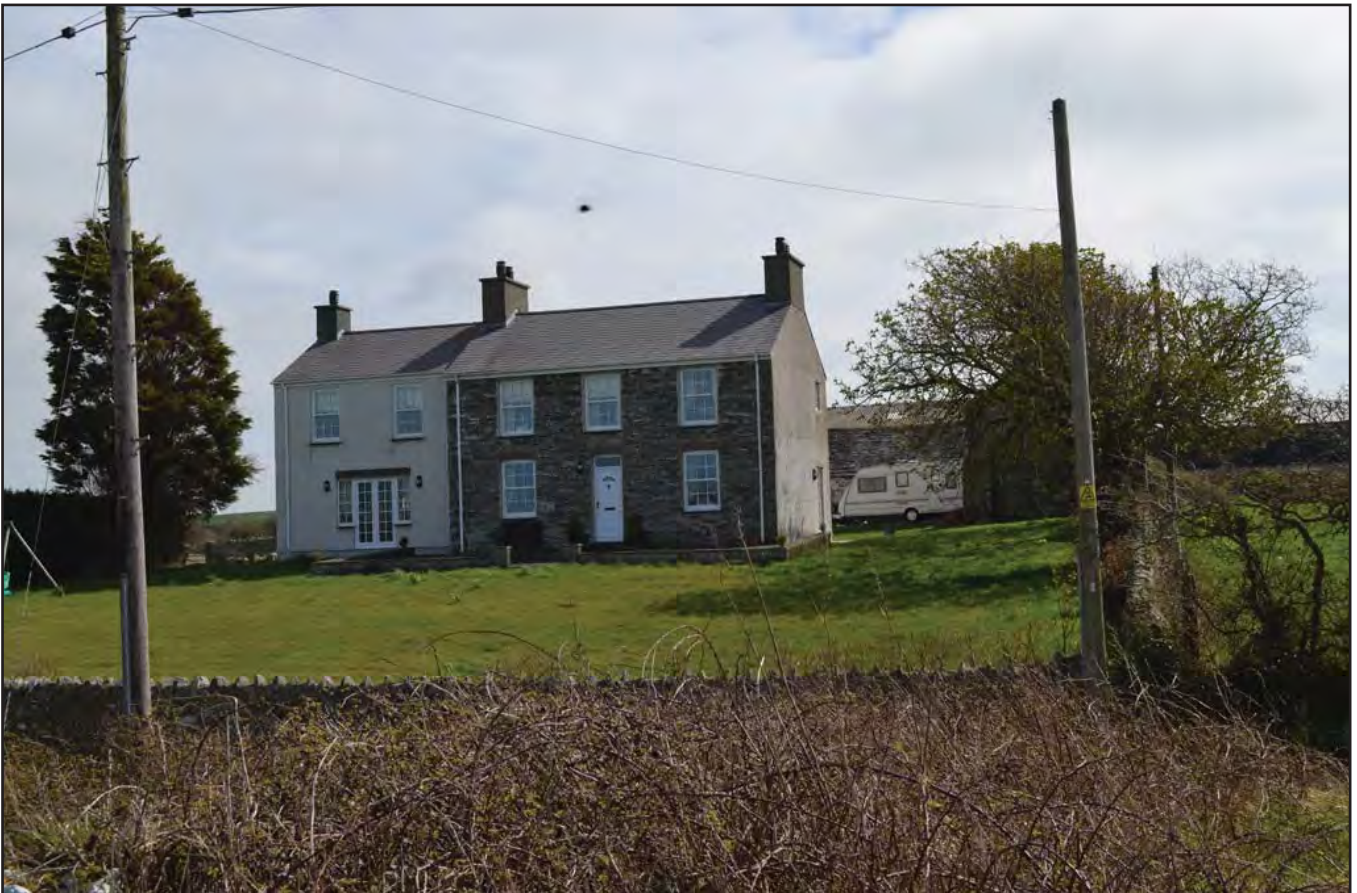
Plate 112: Asset 125, Tan-yr-Allt, viewed from the W.