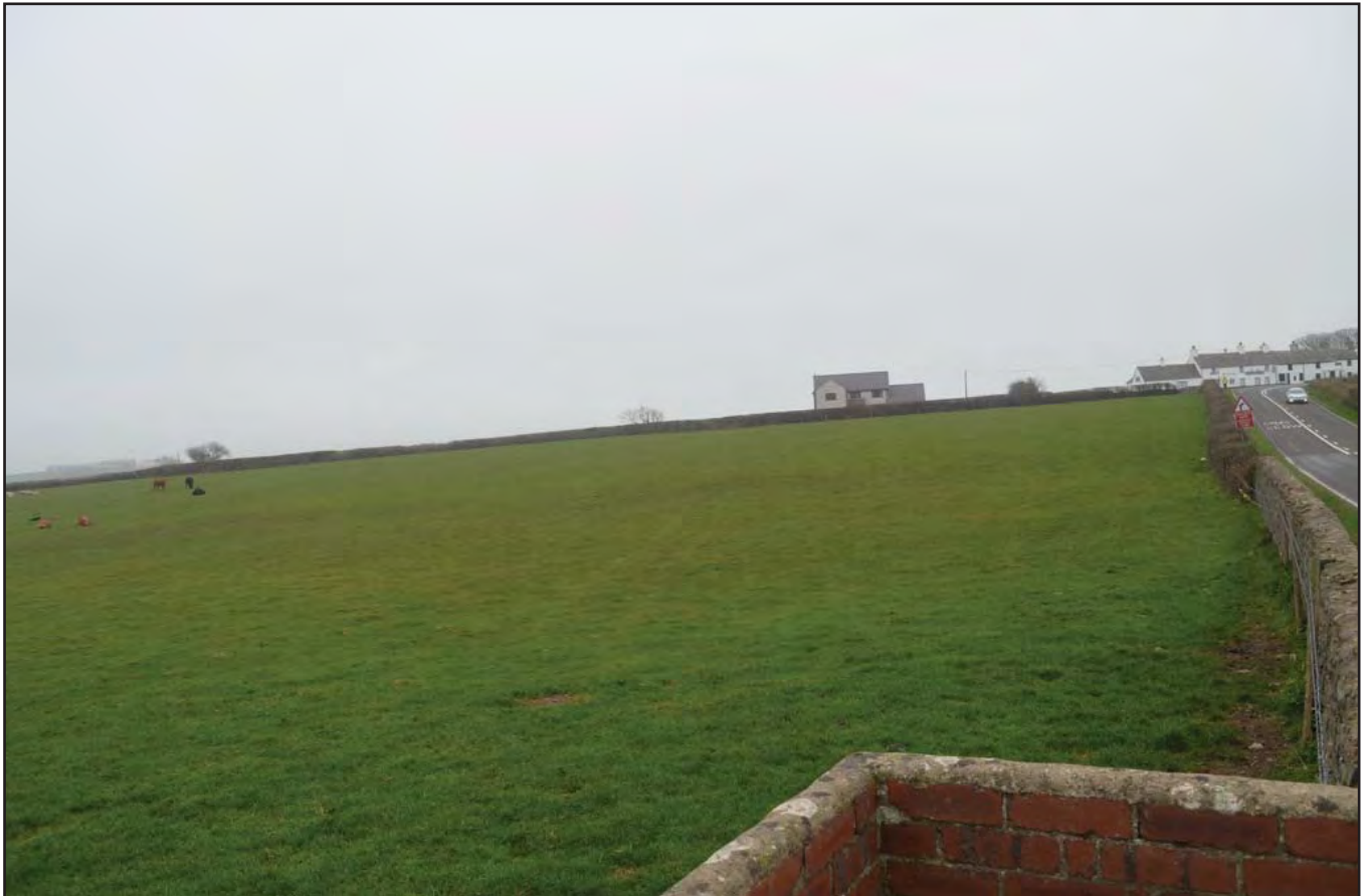
Plate 136: Asset 152, route of N fork of trackway through field SE of Fadoch Frech, viewed from the NW.