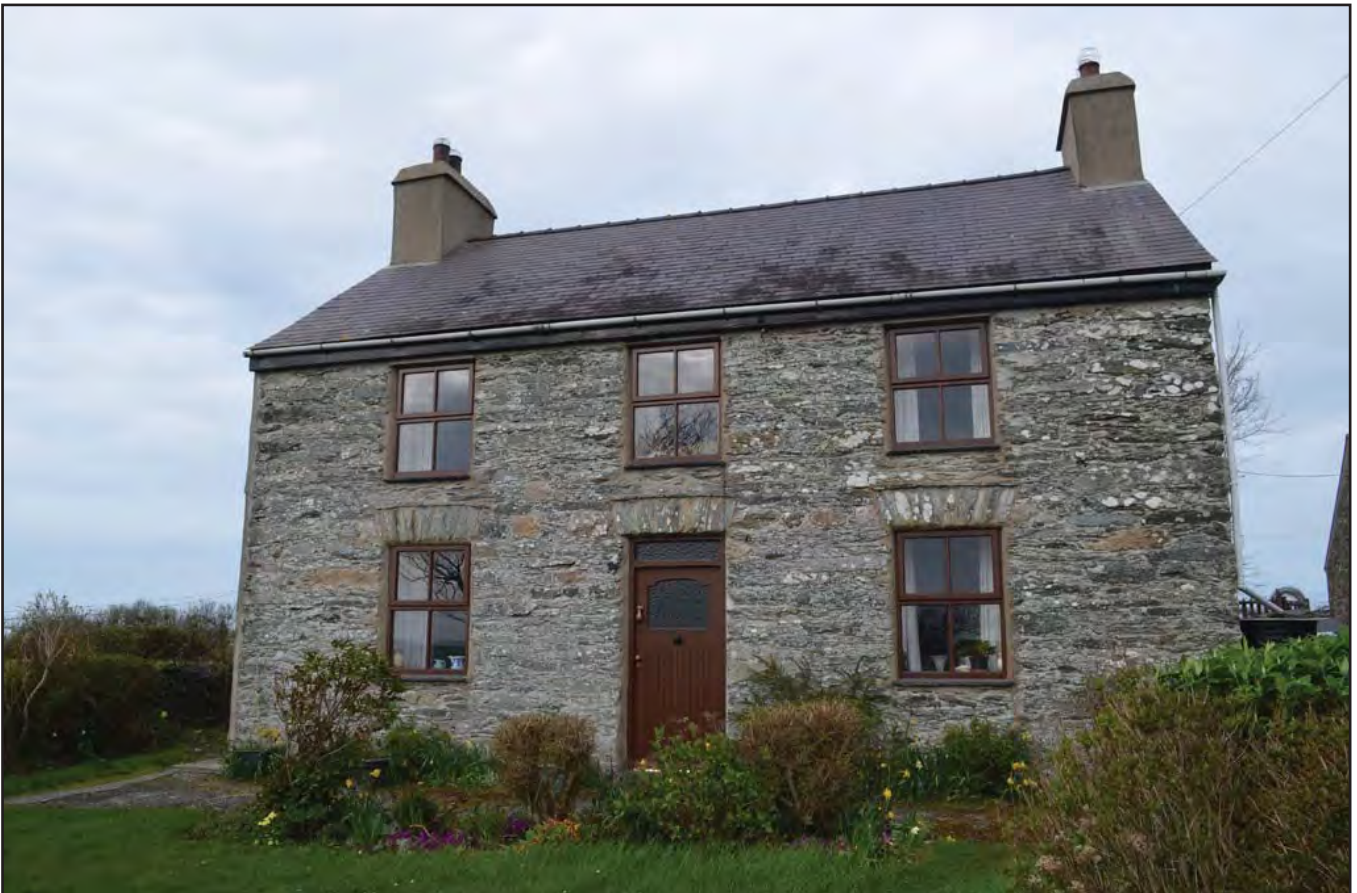
Plate 122: Asset 135, Bodarddfen-Wen farmhouse, viewed from the E.