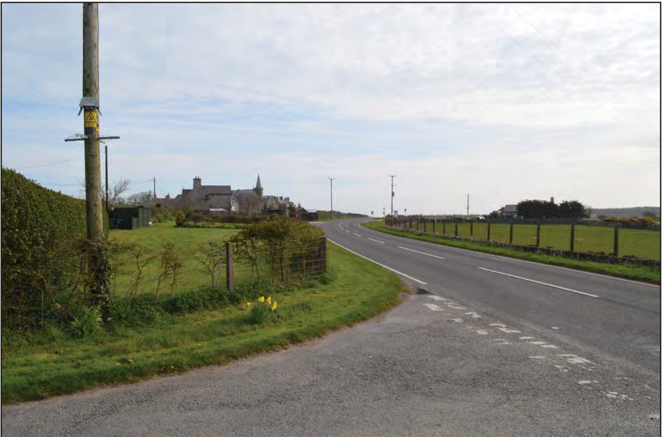
Plate 318: Route of proposed road improvement, looking from SW to NE, viewed from S of Bryn y Gongl Bach, Llanrhyddlad.