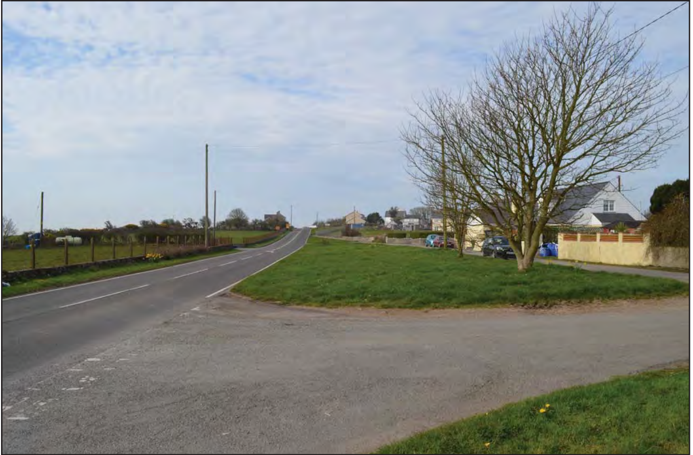
Plate 317: Route of proposed road improvement, junction of A5025 and road to Rhydwyn, viewed from the SE.