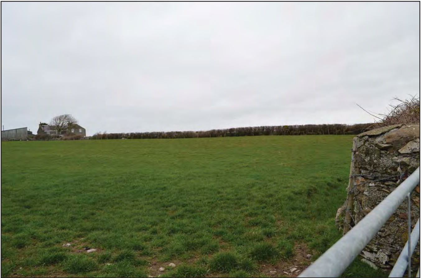
Plate 309: Route of proposed Llanfaethlu bypass, looking from SE to NW, viewed from field immediately SE of Rhos-ty-mawr.