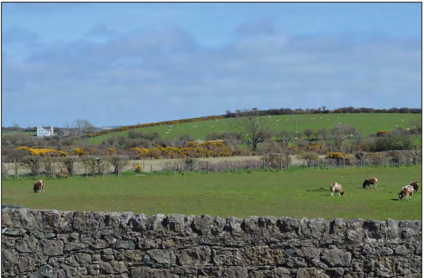
Plate 098: Asset 111, site of quarry, viewed from the W.