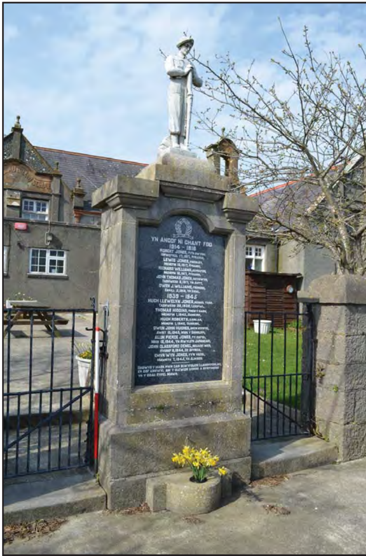
Plate 189: Asset 211, War Memorial at Pedair, viewed from the SSW.