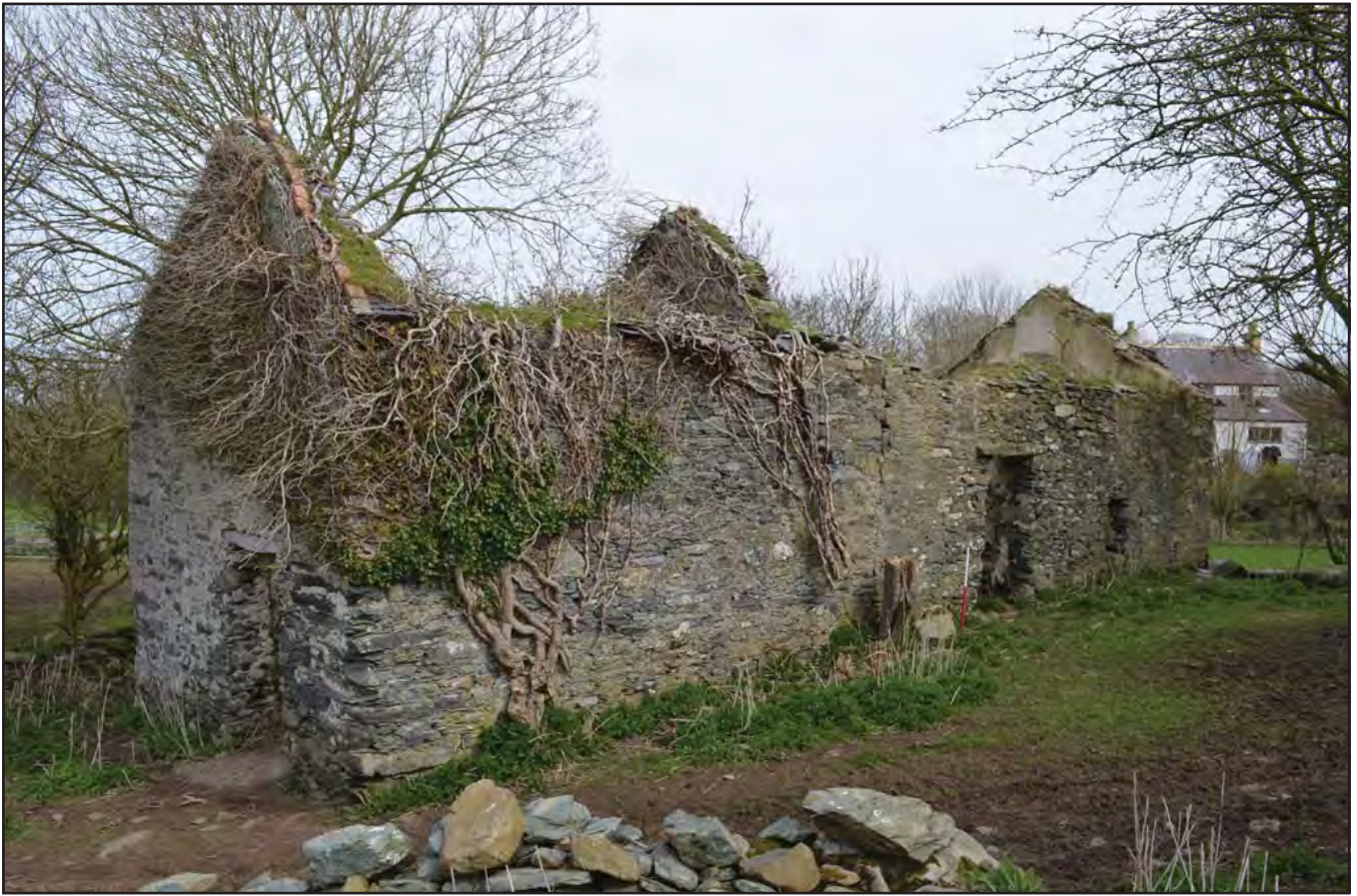
Plate 247: Asset 275, watermill Felin Cefn Coch, viewed from the W.