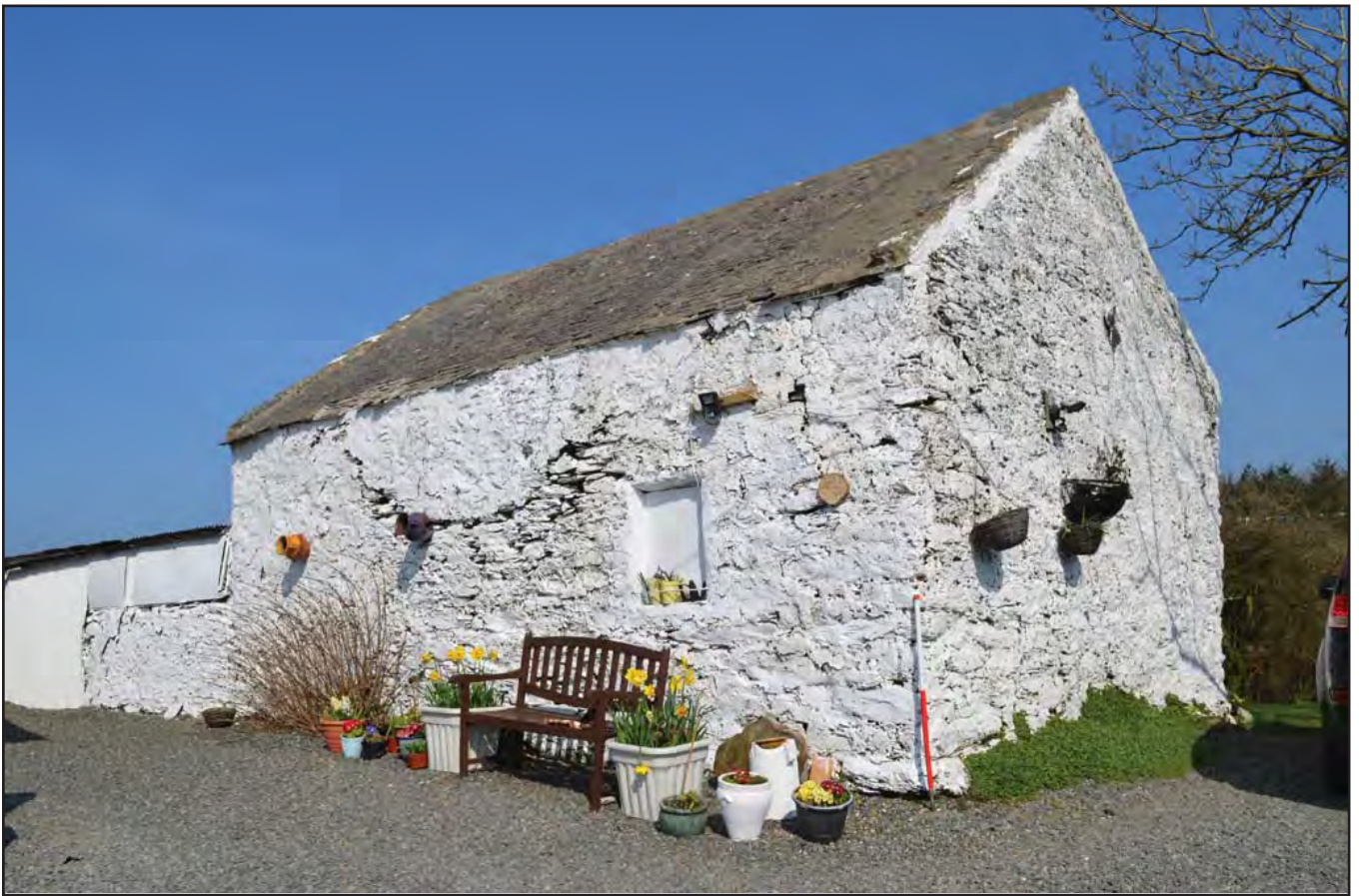
Plate 213: Asset 236, Gwelfor, viewed from the S.