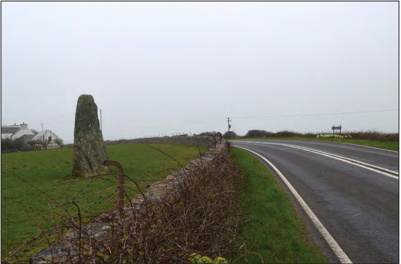
Plate 131: Asset 146, Capel Soar Standing Stone, viewed from side of road to the N showing proximity to A5025.