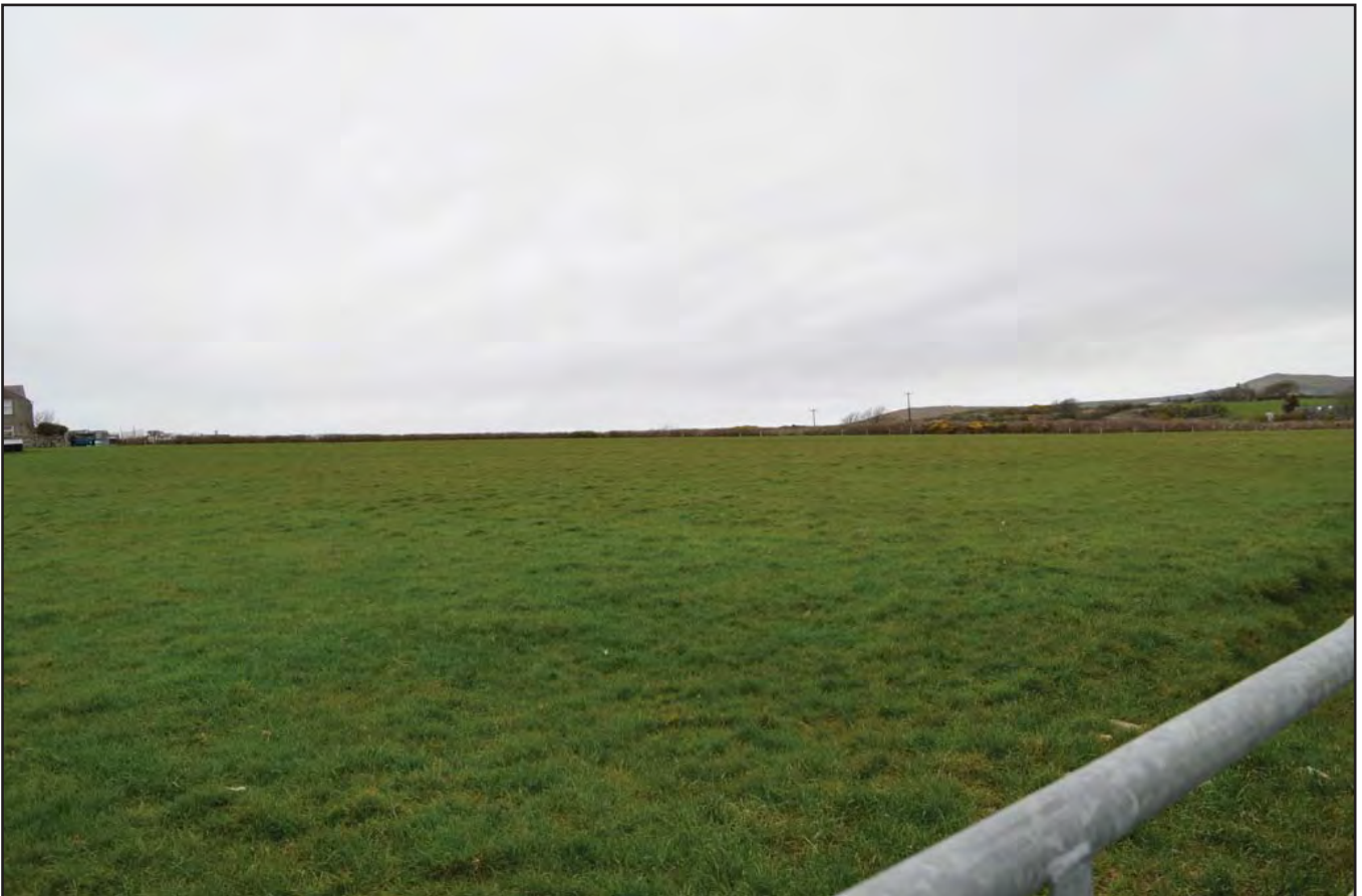
Plate 310: Route of proposed Llanfaethlu bypass, looking from SE to NW, viewed from SE field corner immediately E of Rhos-ty-mawr.