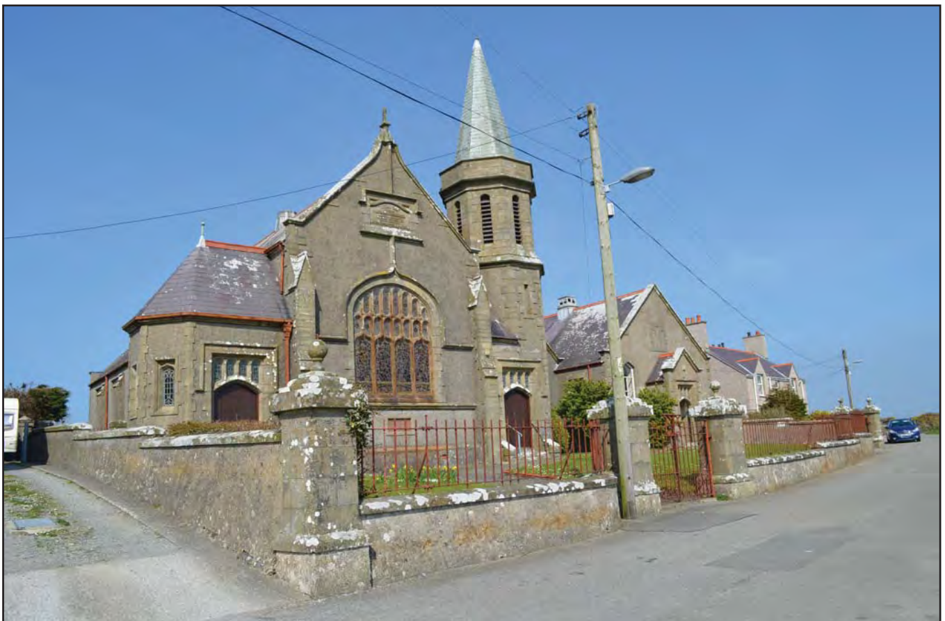
Plate 204: Asset 227, Capel Bethel-hen, Llanrhyddlad, viewed from the SW.