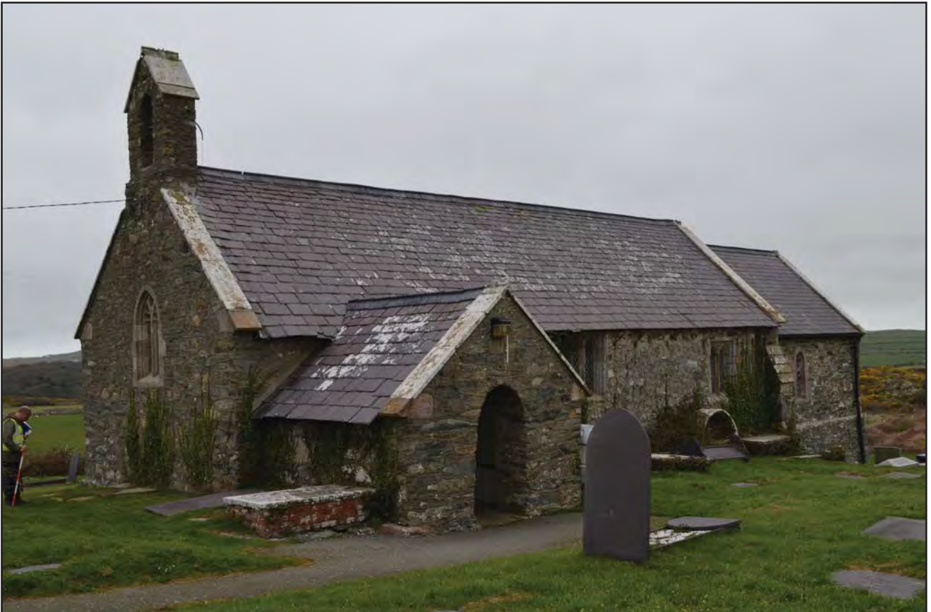
Plate 160: Asset 176, St Maethlu Church, viewed from the N.