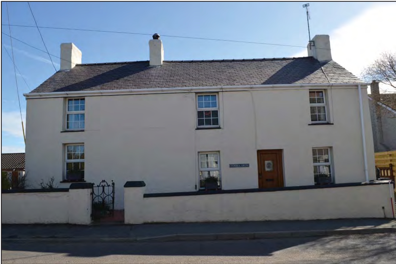
Plate 085: Asset 098, Goeden Gron, viewed from the W.