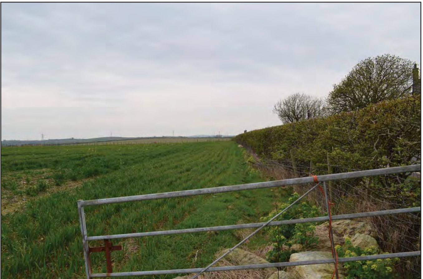
Plate 294: Route of proposed road improvement, viewed from the NE, from gateway