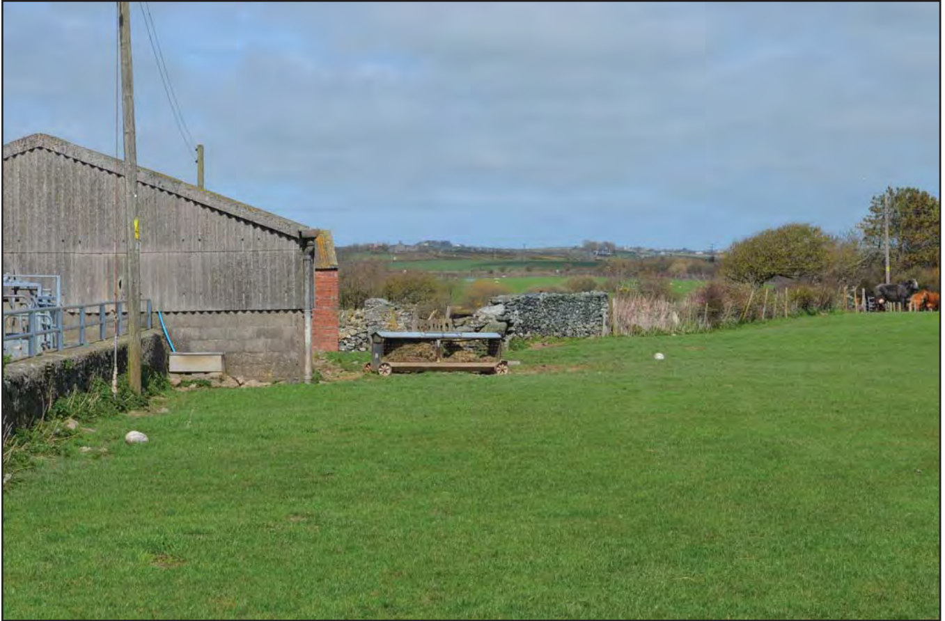
Plate 107: Asset 120, ruined outbuilding NE Pen-yr-orsedd, viewed from the S.