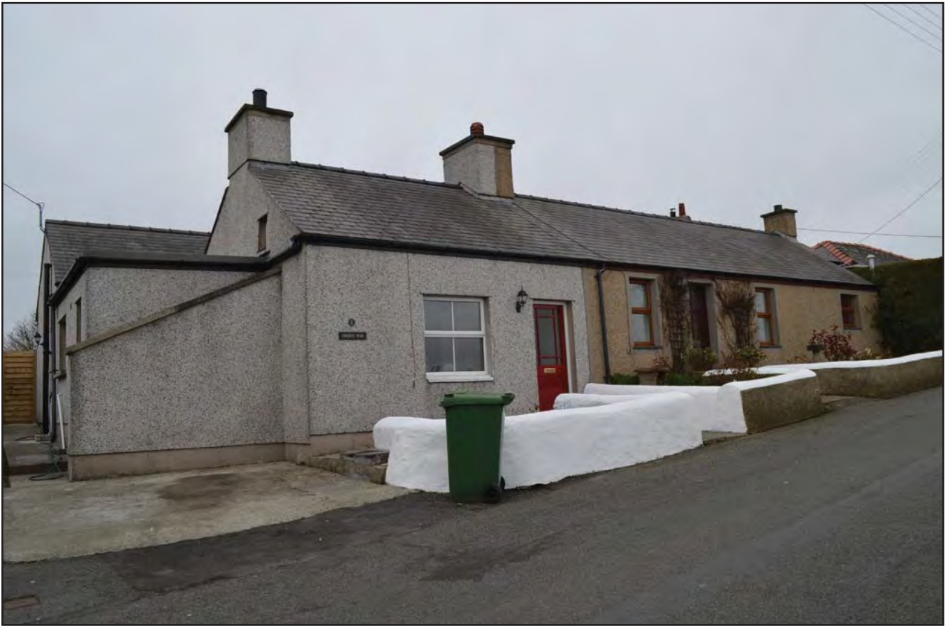
Plate 155: Asset 170, Smidda Wen, viewed from the SE.