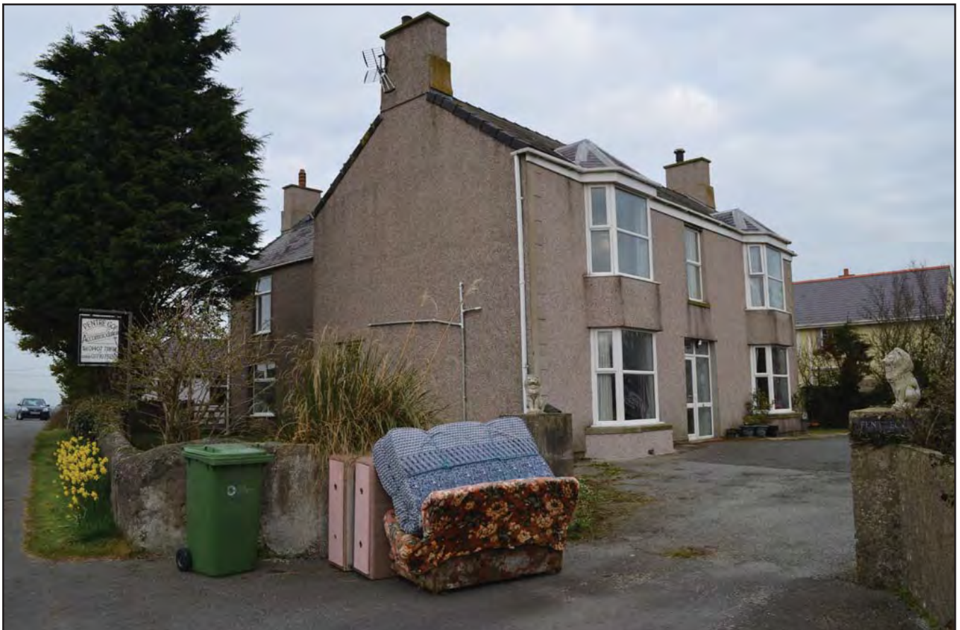
Plate 290: Asset 320, Pentregof, viewed from the SE.