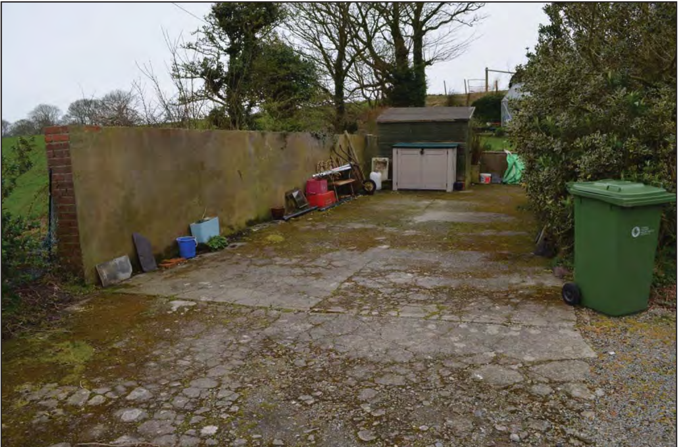
Plate 144: Asset 159, site of E-W outbuilding W of Tan-y-Bryn, viewed from the E.