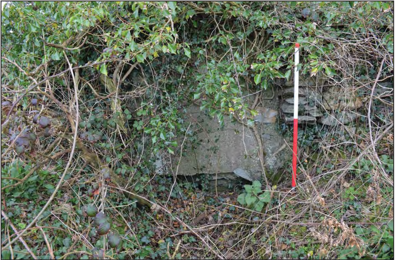
Plate 237: Asset 263, well SW of Pandy Cefn-coch, viewed from the NE.