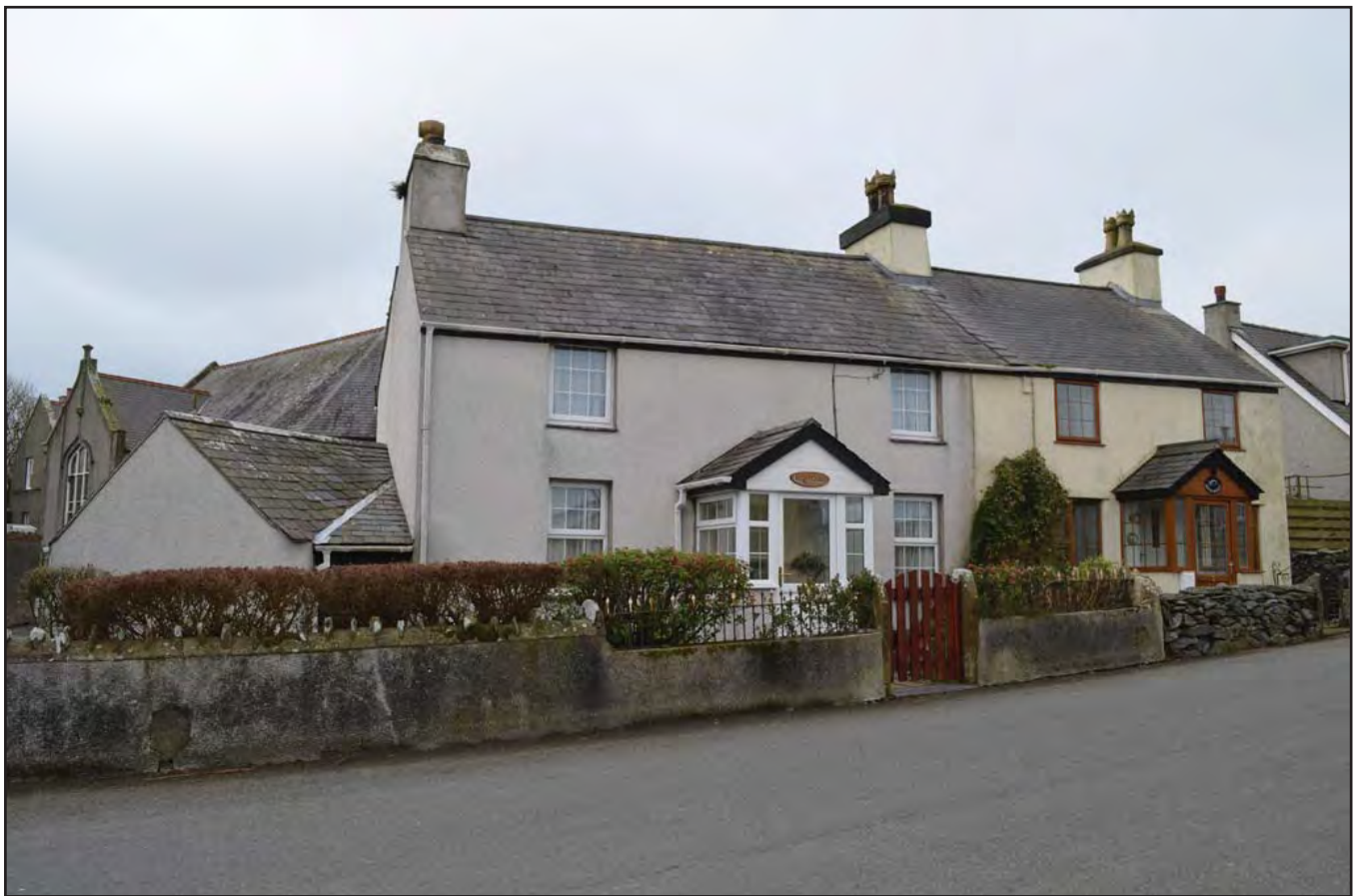
Plate 153: Asset 168, Bryn Goleu Post Office and adjacent house, viewed from the E.