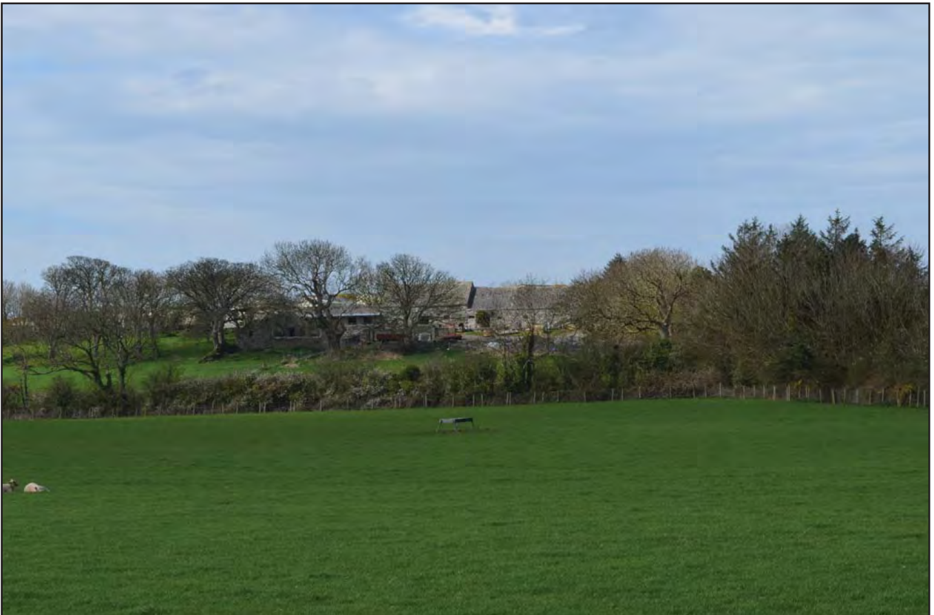
Plate 114: Asset 127, Dronwy, viewed from the ENE.