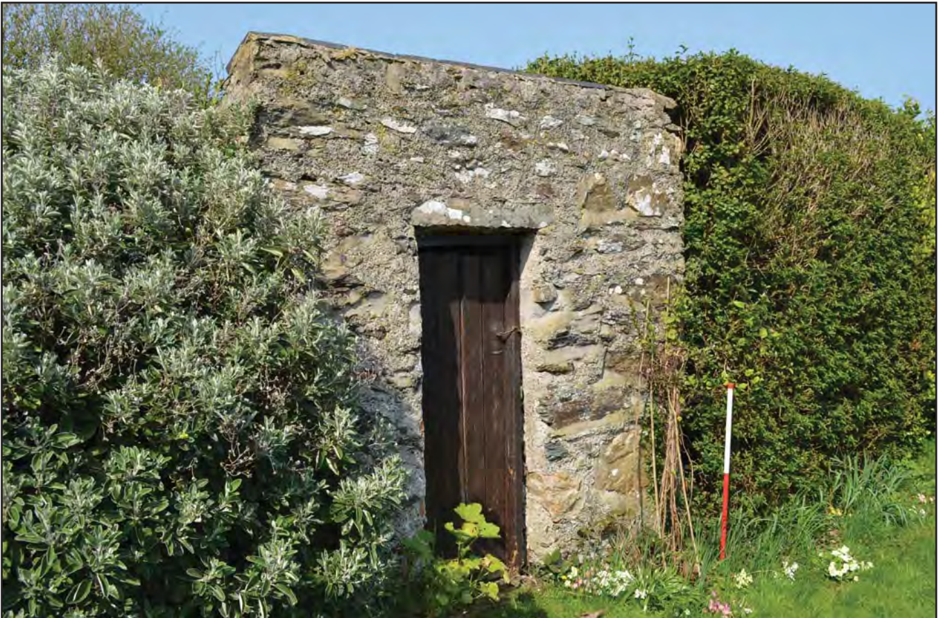
Plate 220: Asset 244, smaller outbuilding NE of Ty'n Felin, viewed from the ESE.