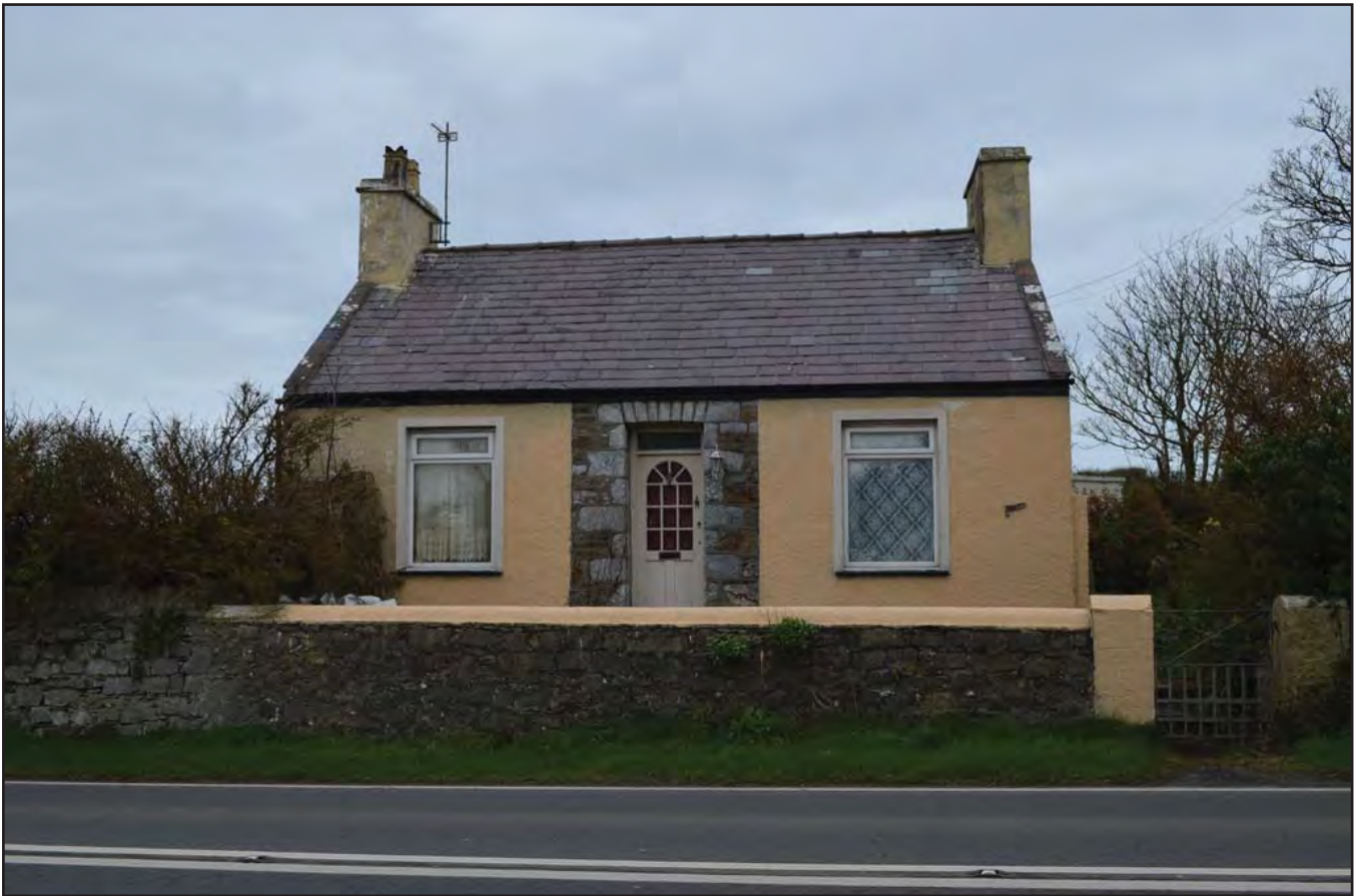
Plate 171: Asset 188, Pant, viewed from the ESE.