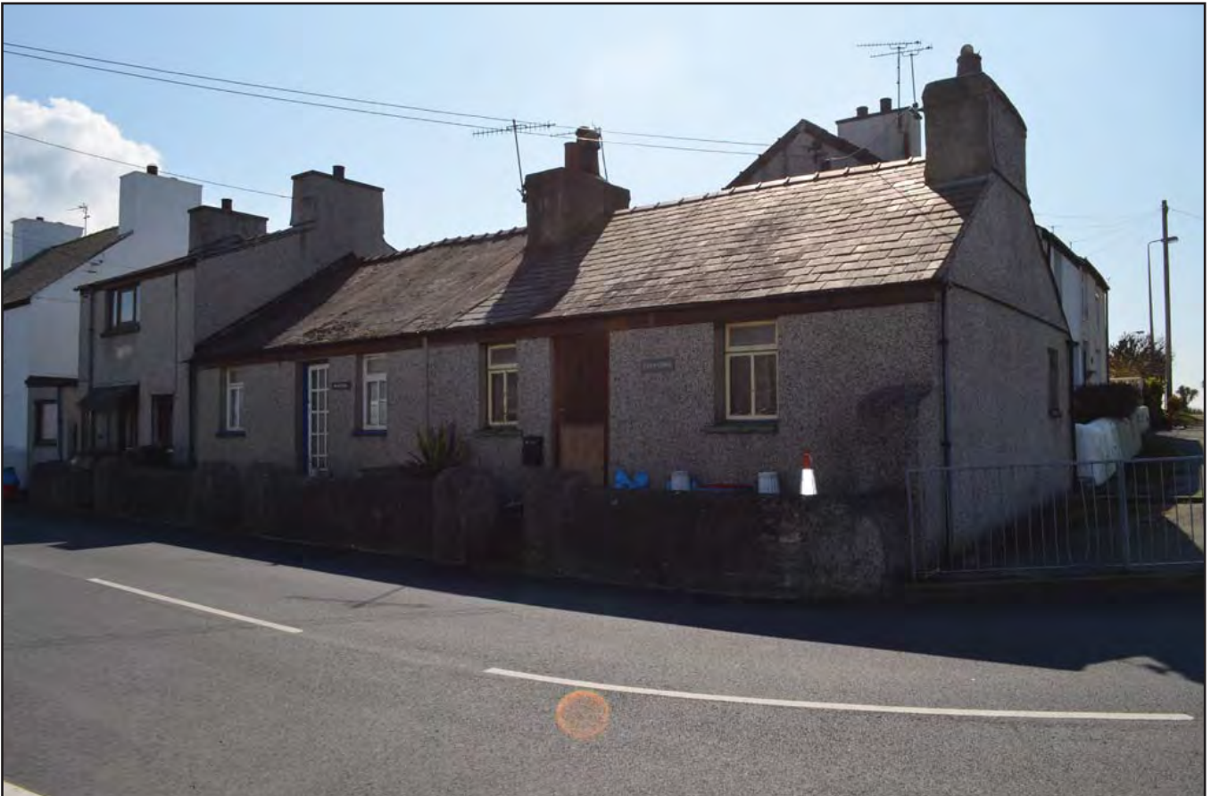
Plate 272: Asset 301, Tyn-y-Gongl Merionfa and two story cottage at Tregele, viewed from the NW.