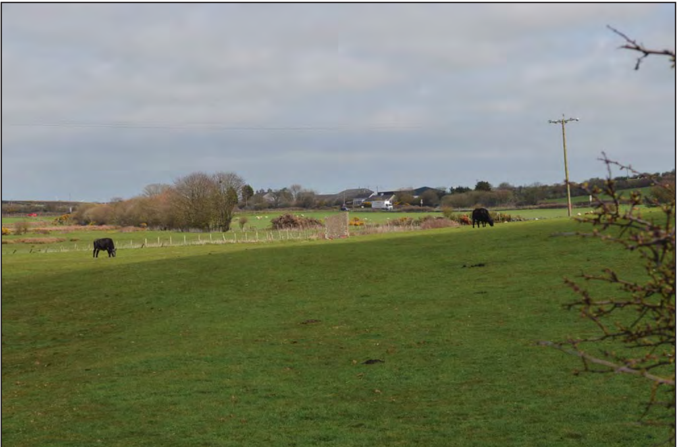
Plate 108: Asset 121, spring / well NW of Pen-yr-orsedd, viewed from the SW.