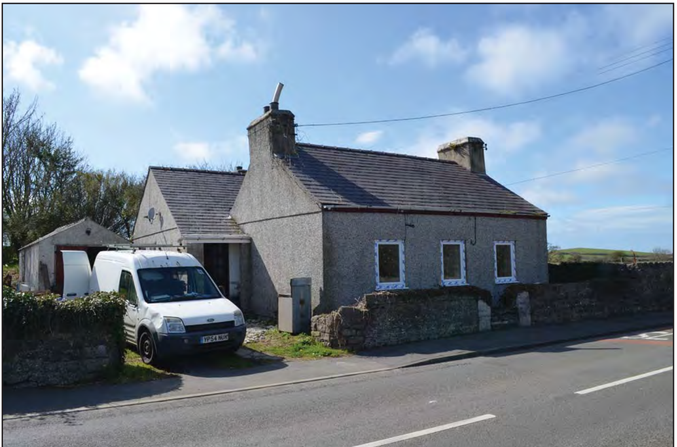
Plate 096: Asset 109, Ty Newydd, viewed from the SE.