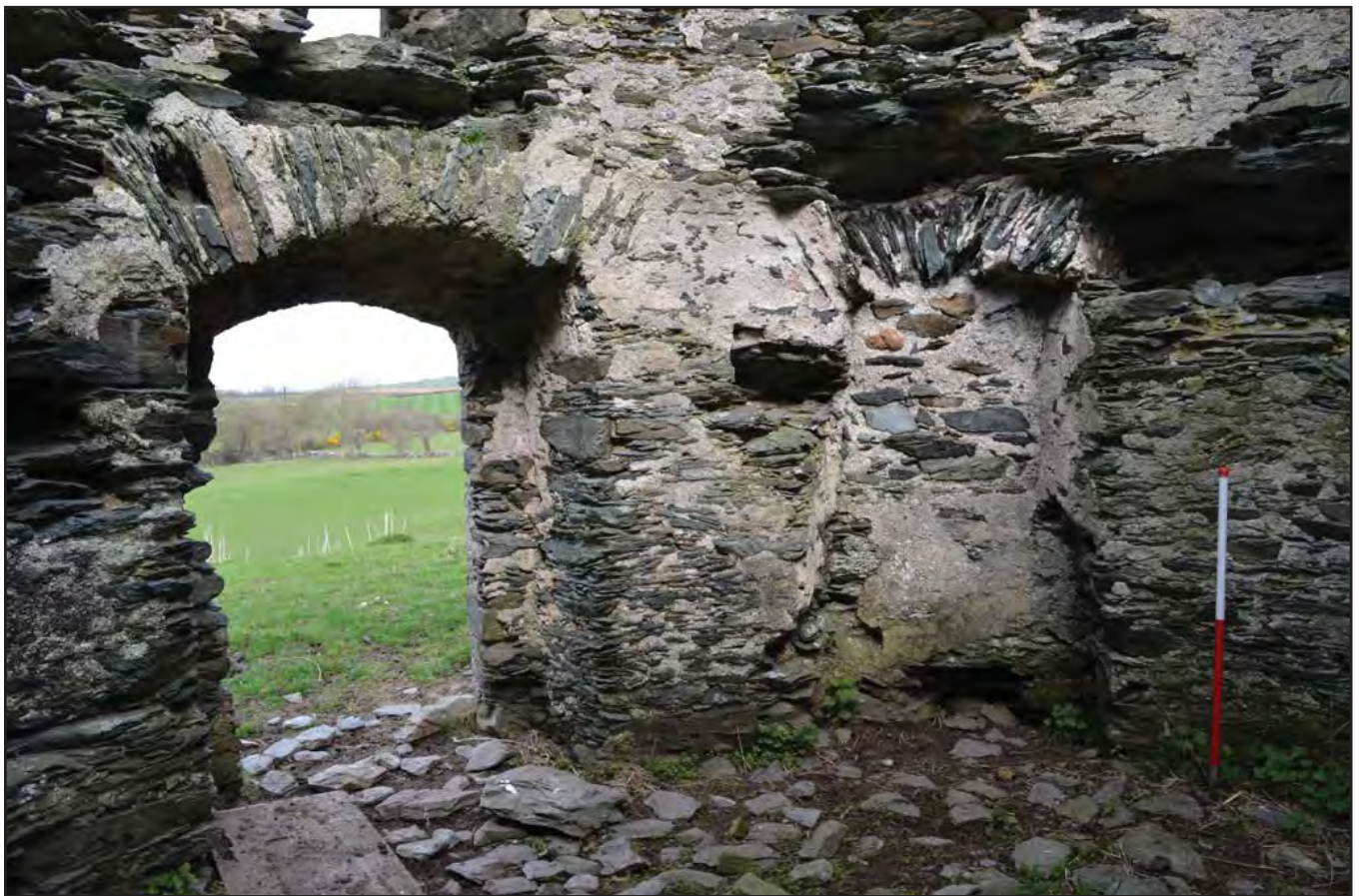
Plate 251: Asset 279, Ty'n y Felin windmill base interior. Shows W doorway and blocked door/window, viewed from the SE.