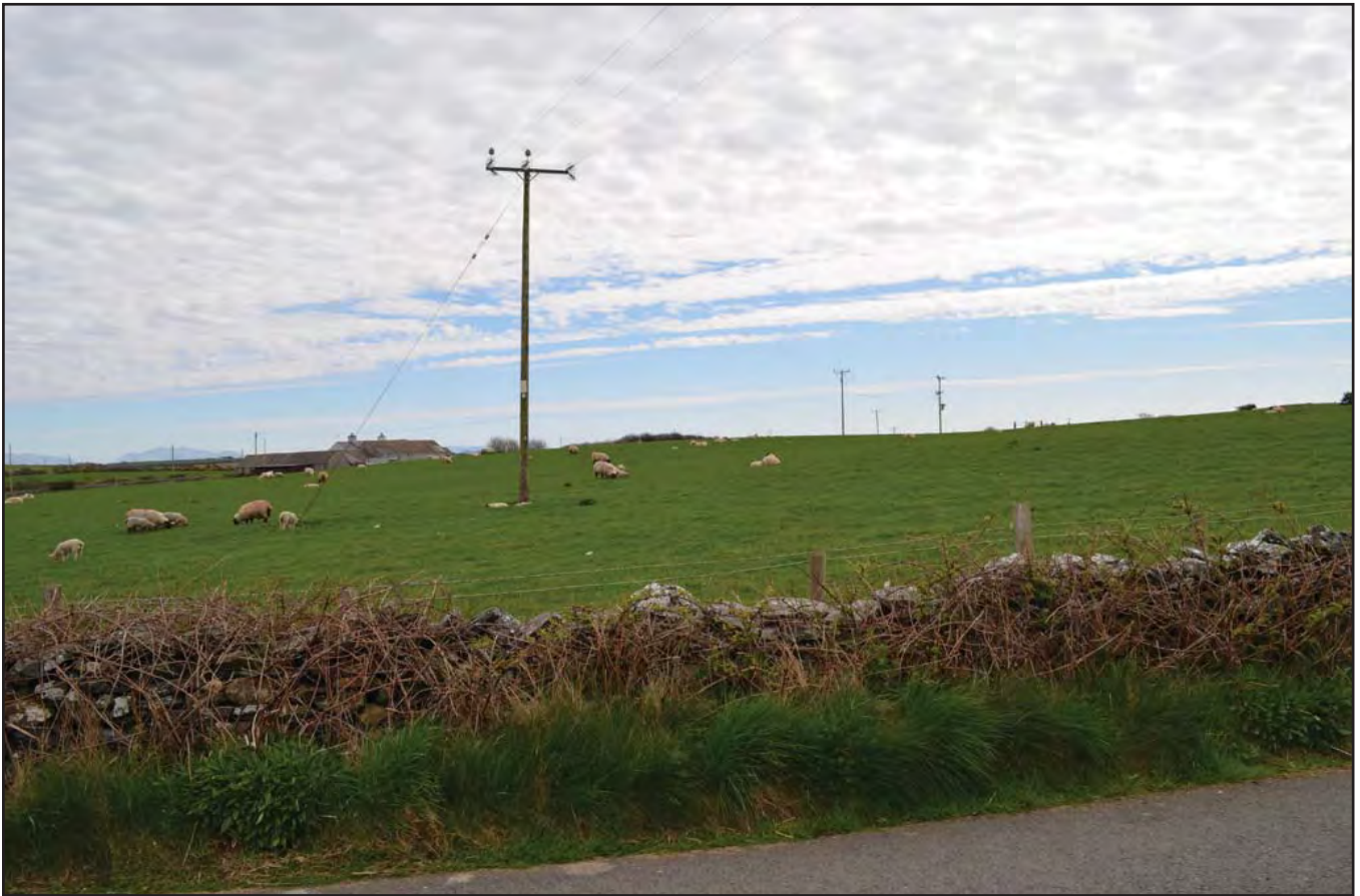
Plate 303: Route of proposed Llanfachraeth bypass E of the village, viewed from the NNW as it crosses lane NW of Bedo..