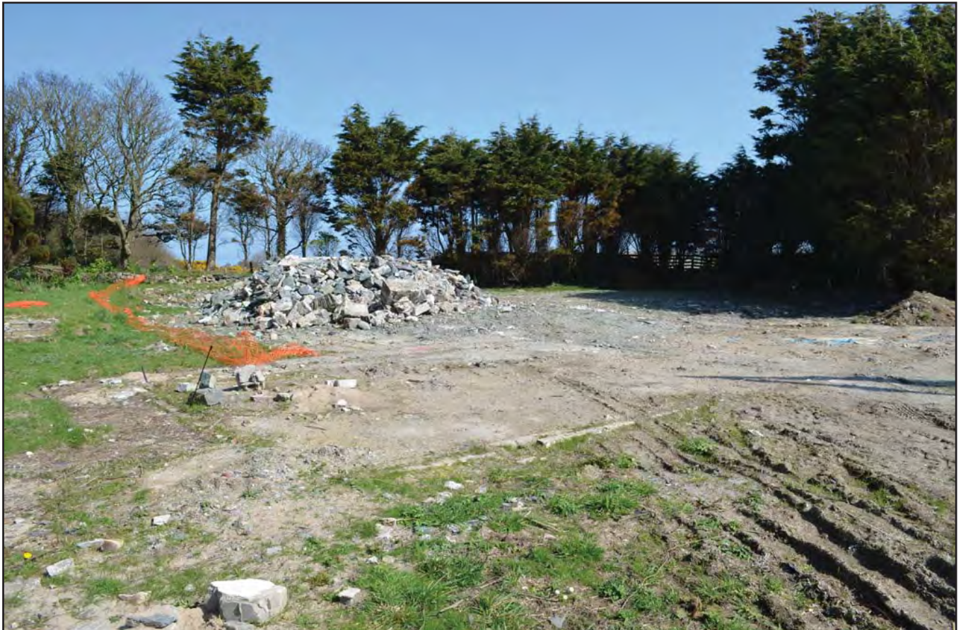
Plate 280: Asset 309, site of building at Clonmel, viewed from the S.