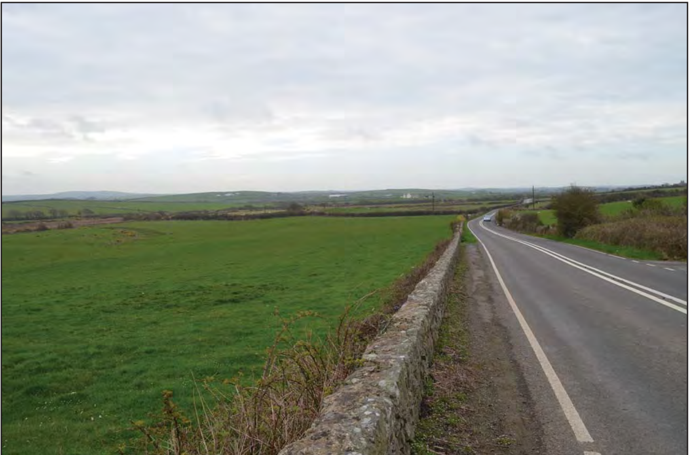
Plate 306: Route of proposed road improvement across fields S of Bryn Tirion, viewed from the N.