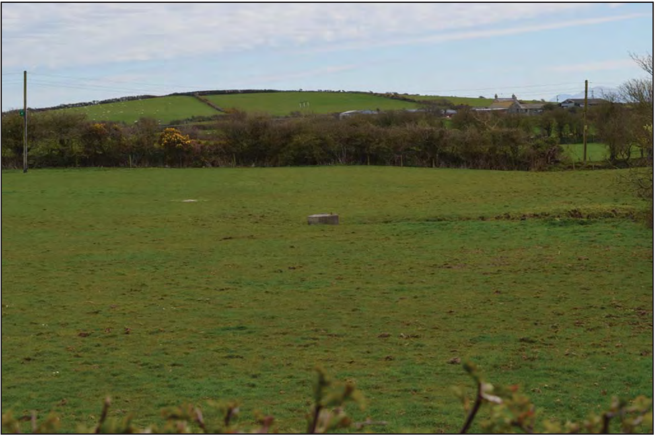
Plate 071: Asset 084, well SW of Bryn, viewed from the NW.