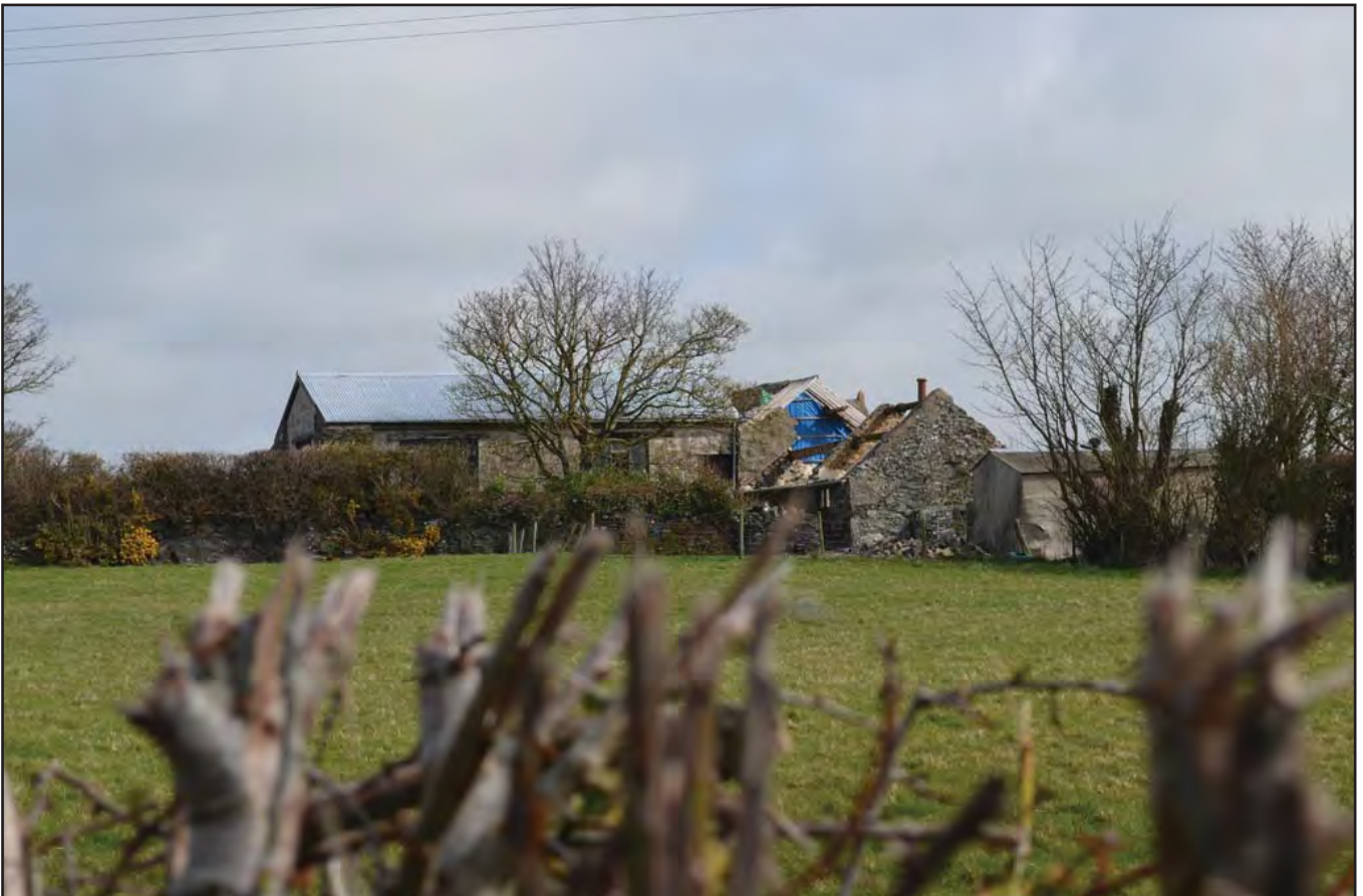
Plate 118: Asset 131, buildings on W side of Bytheicws, viewed from the SW.