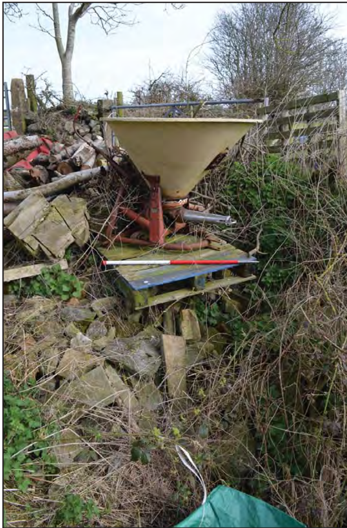
Plate 195: Asset 218, well NE of Tyddyn Waen (exact location obscured but stream visible), viewed from the SW.