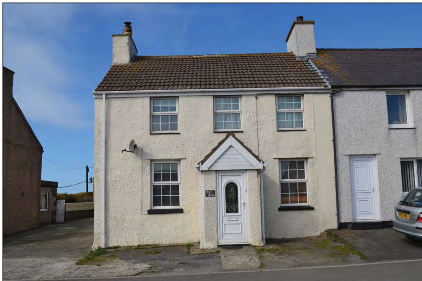
Plate 078: Asset 091, Ty'r Ardd, viewed from the E.