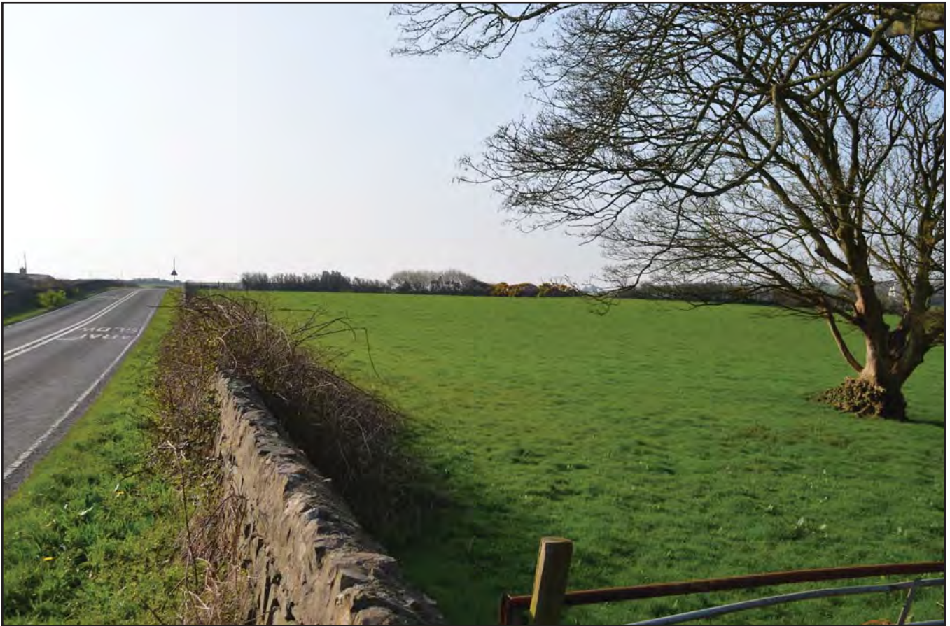
Plate 329: Route of proposed road improvement, looking from N to S, viewed from roadside W of Cefn Coch.