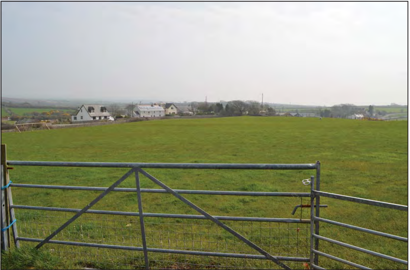
Plate 313: Route of proposed road improvement, looking from N to S across fields, viewed from access road to Bryn Maethlu.