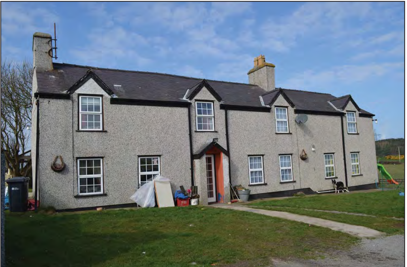
Plate 286: Asset 315, Tyddyn-Goronwy, viewed from the SW.