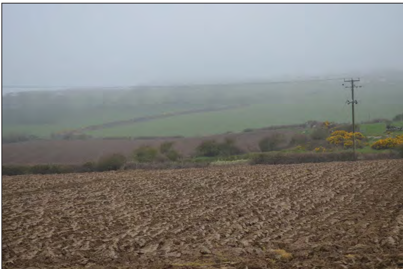
Plate 130: Asset 145, site of Ty Bach, viewed from the E