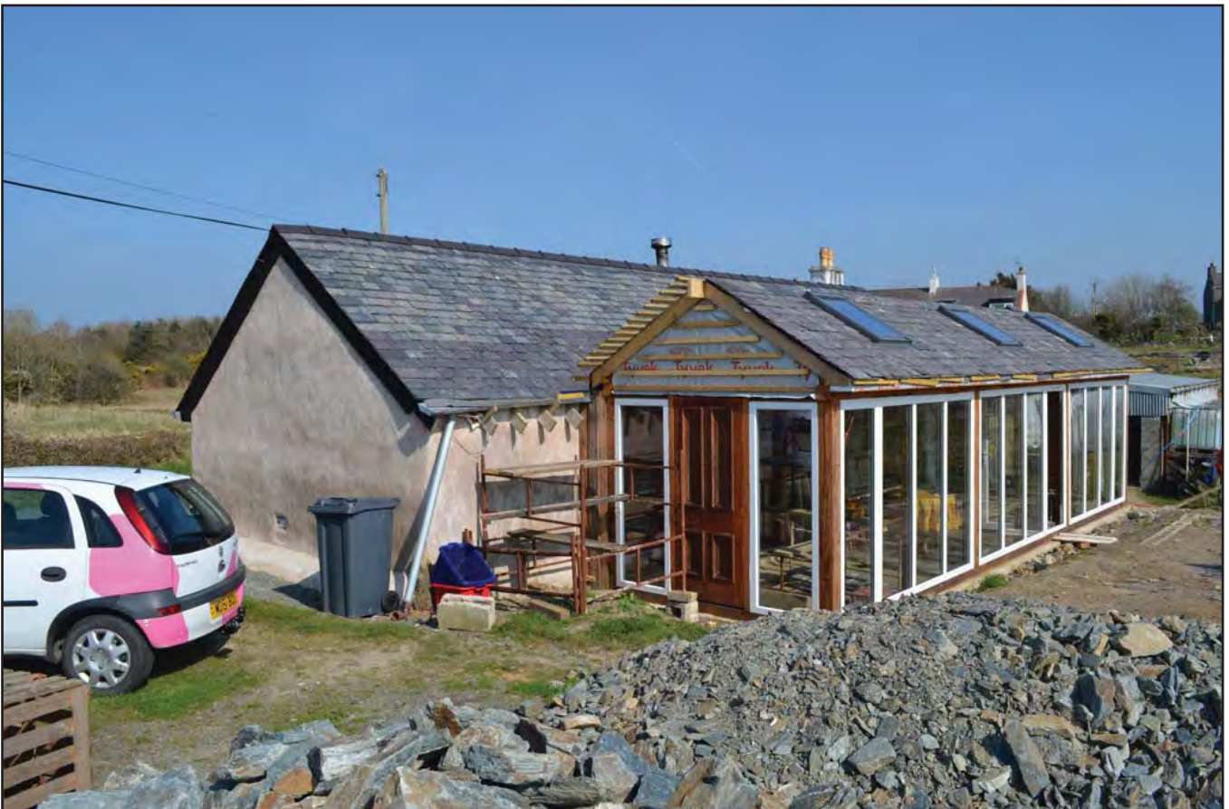
Plate 210: Asset 233, Building W of Penrhyd, viewed from the W.