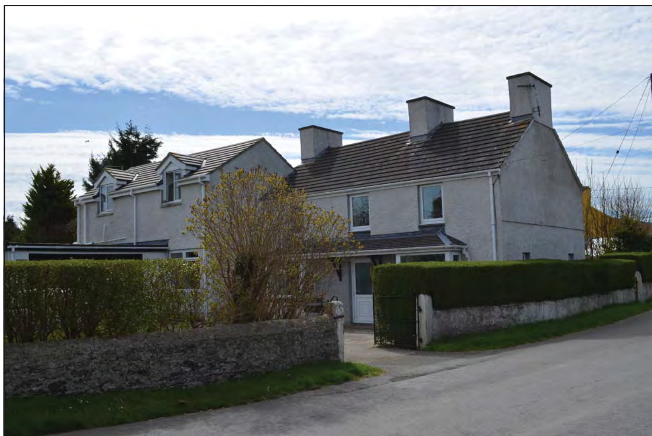
Plate 062: Asset 071, Craig Arnedd, viewed from the N.