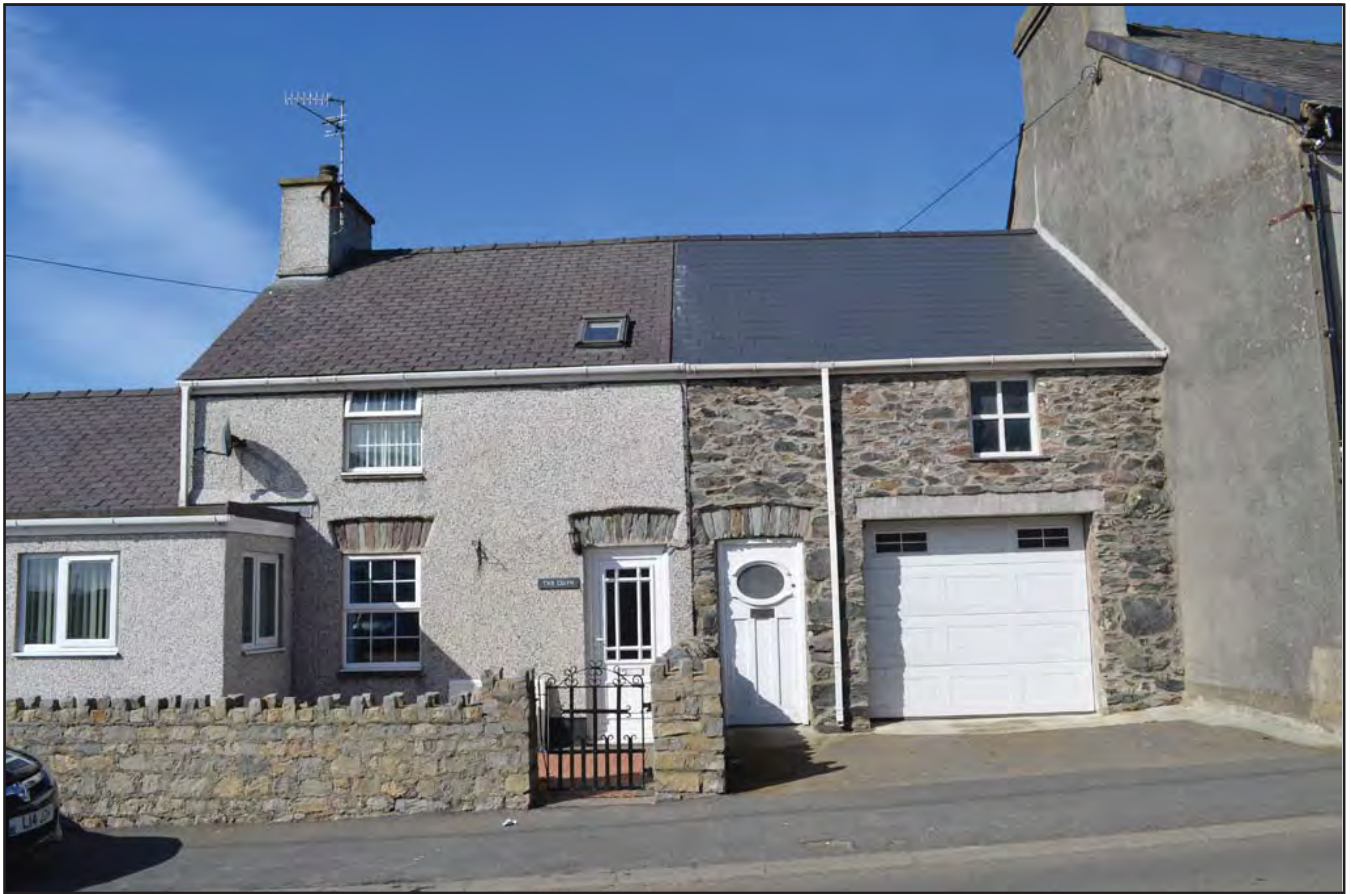
Plate 081: Asset 094, Twr Celyn, viewed from the E.