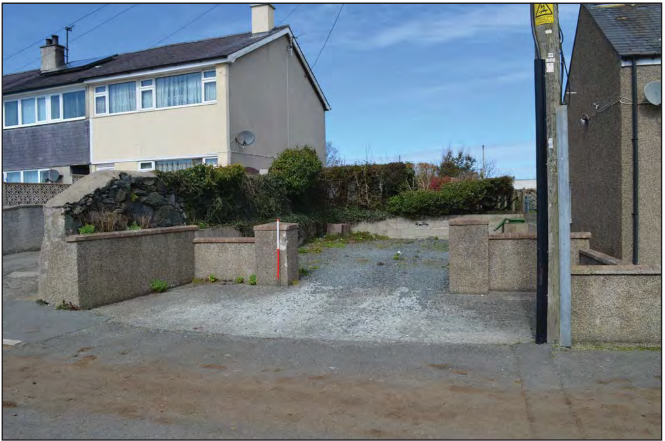
Plate 065: Asset 074, Ardro and SE end of Mona Terrace, viewed from the S.