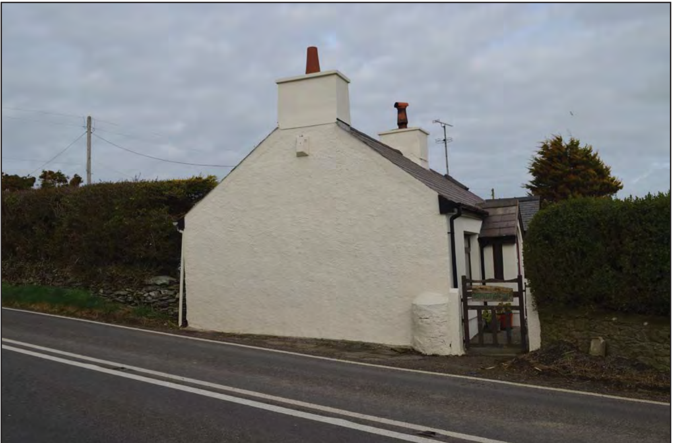
Plate 124: Asset 136, Bryn Tirion, viewed from the W.