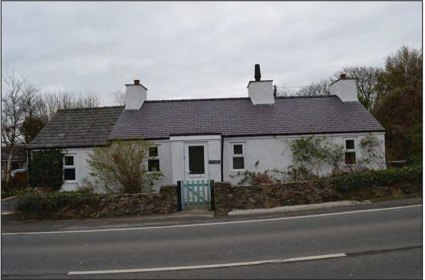
Plate 163: Asset 179, Ty'n-yr-ardd, viewed from the NW.