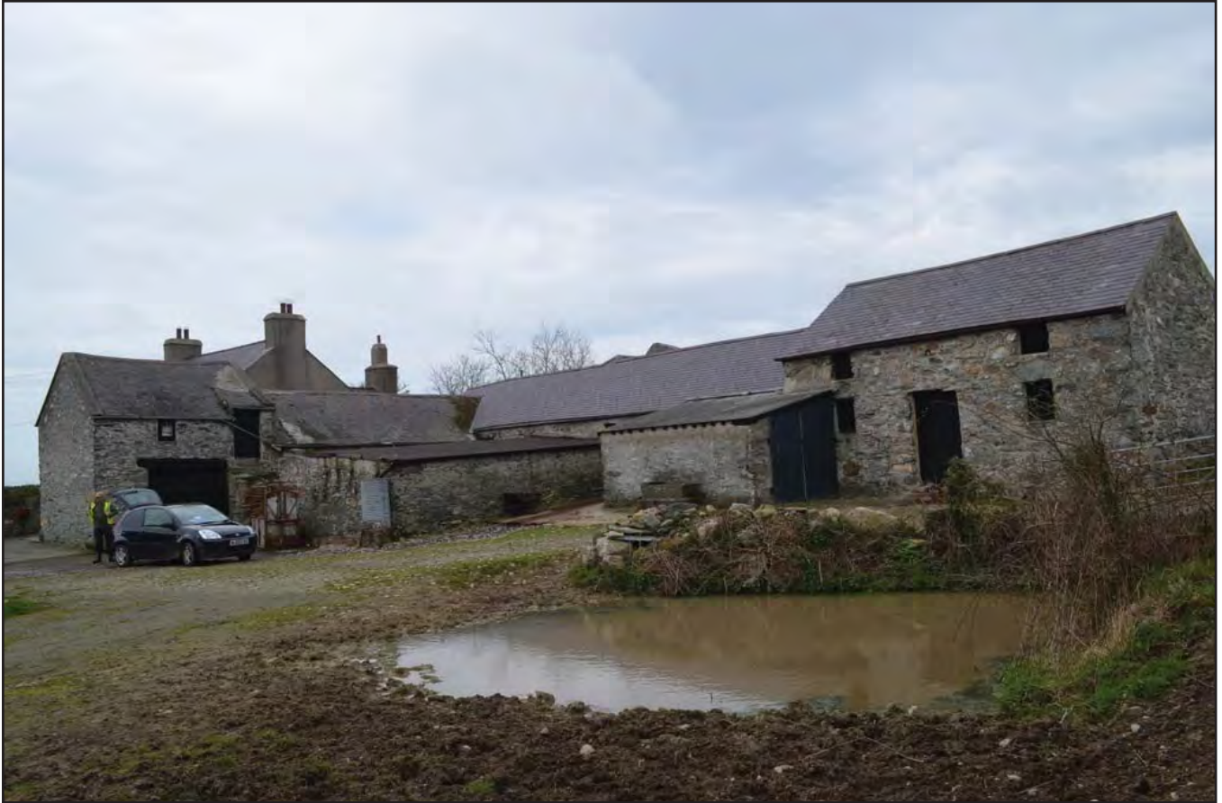
Plate 123: Asset 135, Bodfardden-Wen outbuildings, viewed from the ENE.