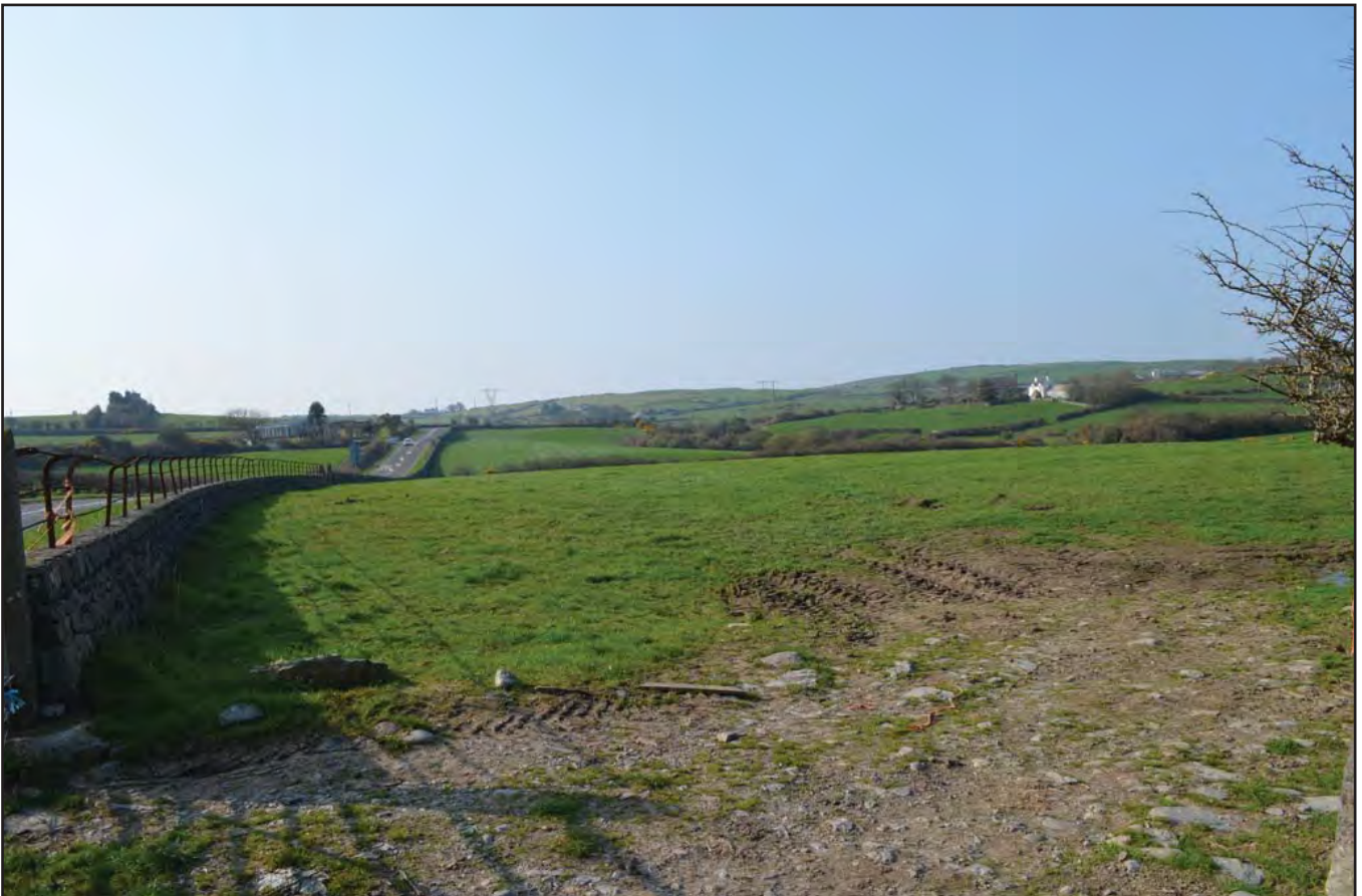
Plate 328: Route of proposed road improvement, looking from N to S, viewed from field SSW of Cefn Coch.