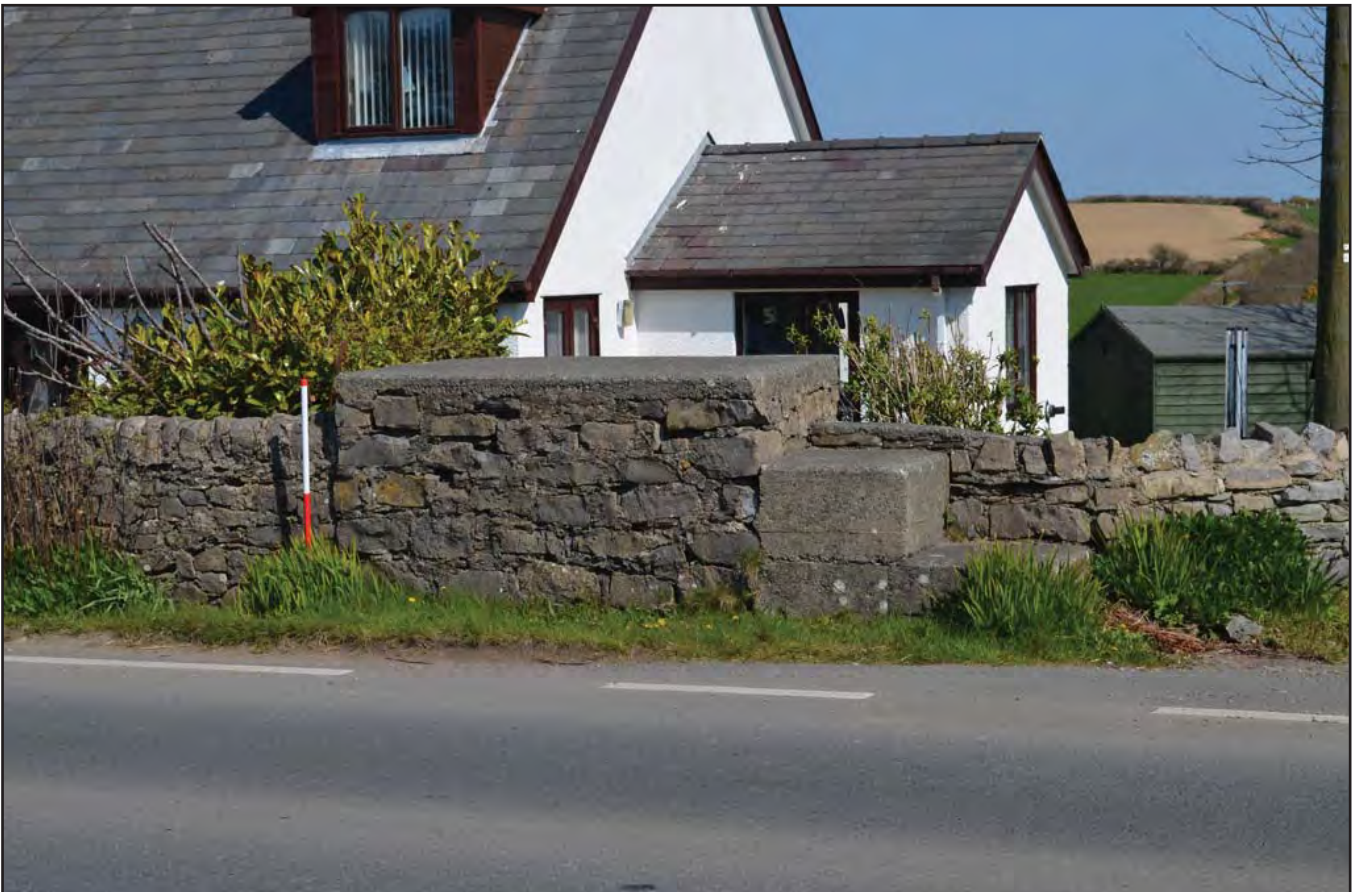
Plate 174: Asset 191, roadside milk churn stand NW of Bodhelen Farmhouse, viewed from the NNW.