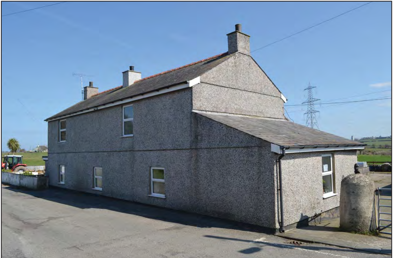
Plate 278: Asset 307, Tros y Ffordd, viewed from the SW.