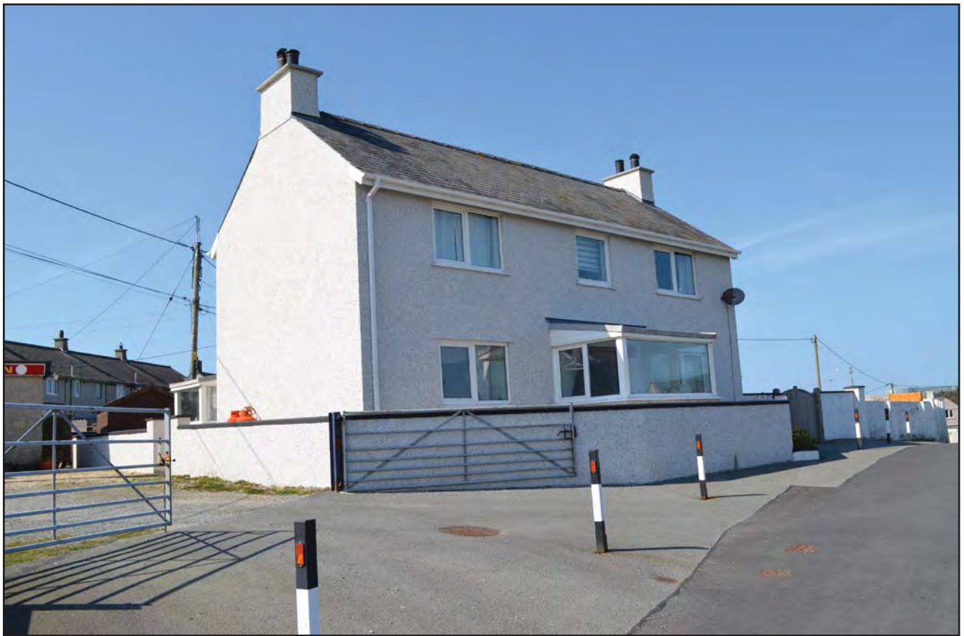
Plate 265: Asset 295, house NW of Bethania Chapel, viewed from the SE.