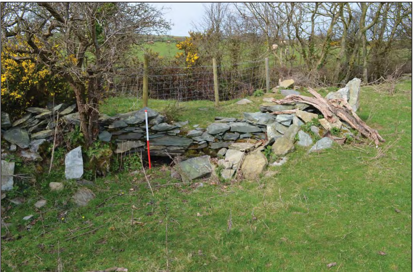
Plate 250: Asset 278, bridge/culvert N of Ty-n-felin farmhouse, viewed from the S.