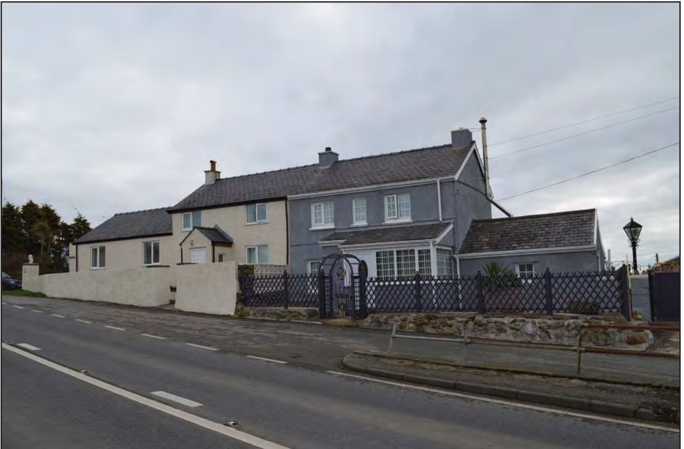
Plate 168: Asset 184, 1 & 2 Pen-y-craig, viewed from the SW.