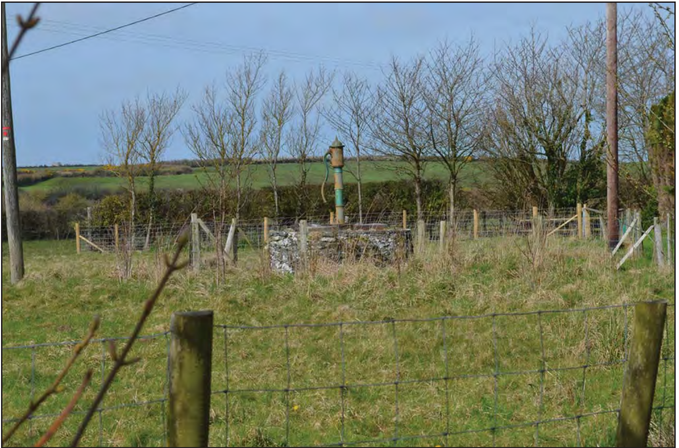
Plate 117: Asset 130, well S of Bytheicws, viewed from the ESE.