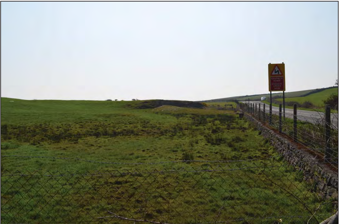
Plate 320: Route of proposed road improvement through fields E of A5025, looking from NE to SW, viewed from SE of Asset 237.