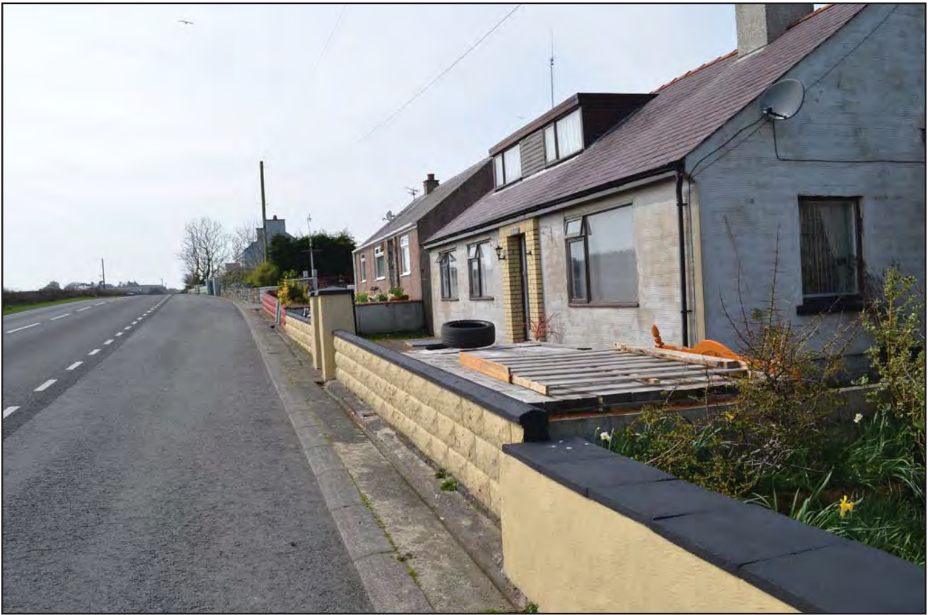
Plate 181: Asset 201, site of Ty'n-Cae, viewed from the NE..