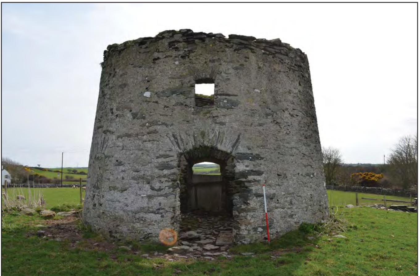
Plate 252: Asset 279, Ty'n y Felin windmill base. Shows W doorway and blocked door/window, viewed from the W.