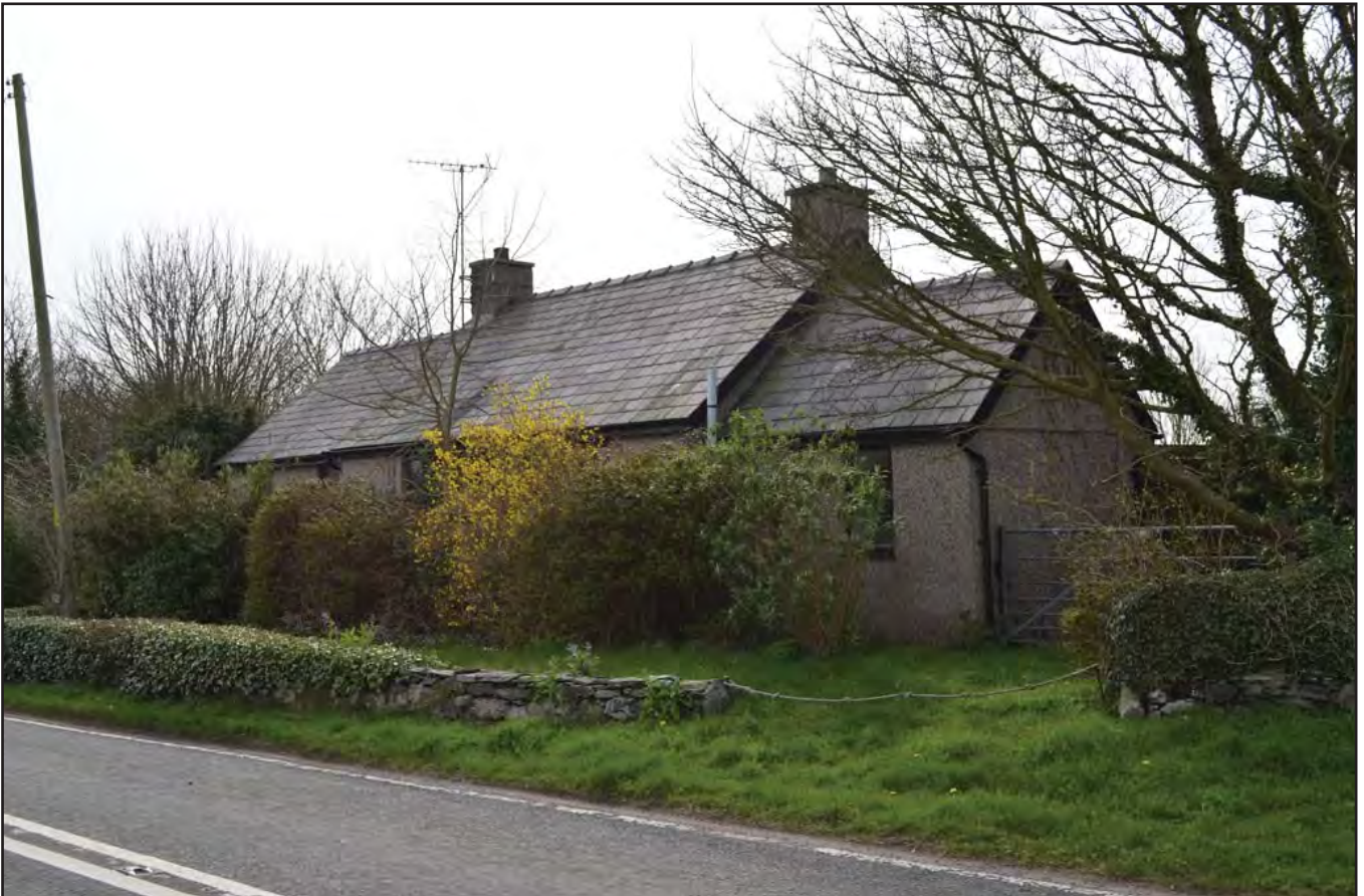
Plate 242: Asset 269, Ty'n-yr-odyn, viewed from the NE.