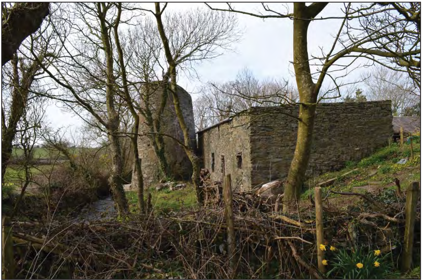
Plate 239: Asset 265, drying tower and outbuilding, E of Pandy Cefn Coch, viewed from the SE.