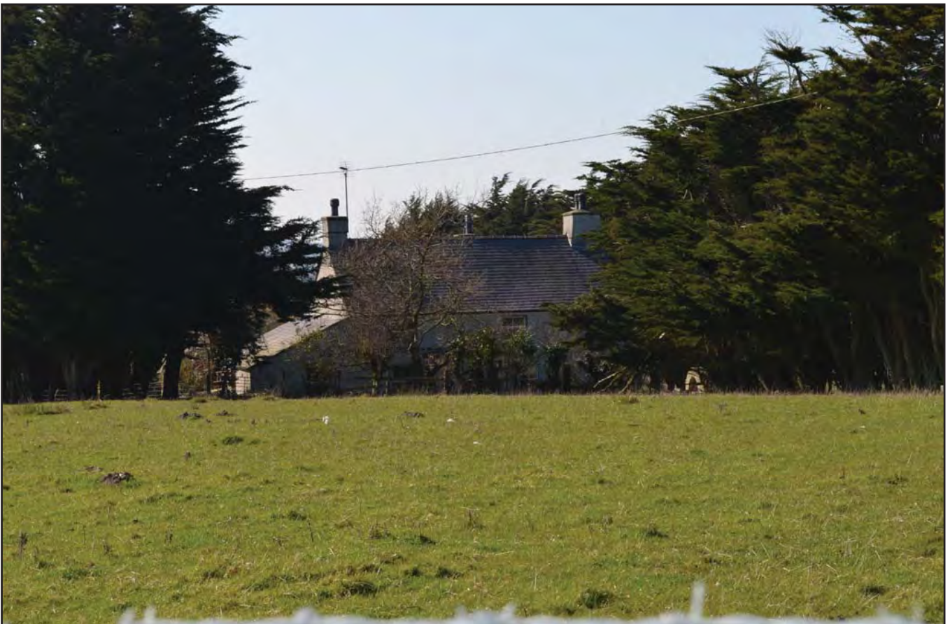
Plate 260: Asset 288, Groes, viewed from roadside to the E.