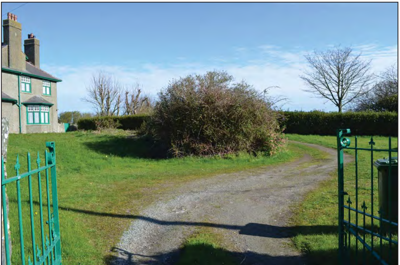
Plate 092: Asset 105, original Site of windmill base, viewed from the S.