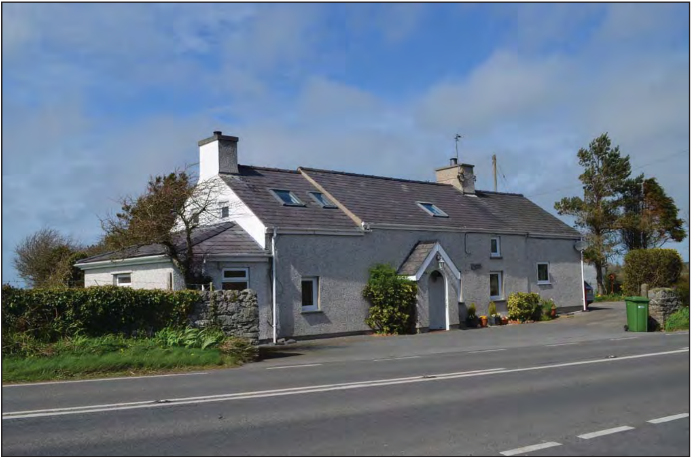
Plate 109: Asset 122, Pen-y-groes, viewed from the SE.