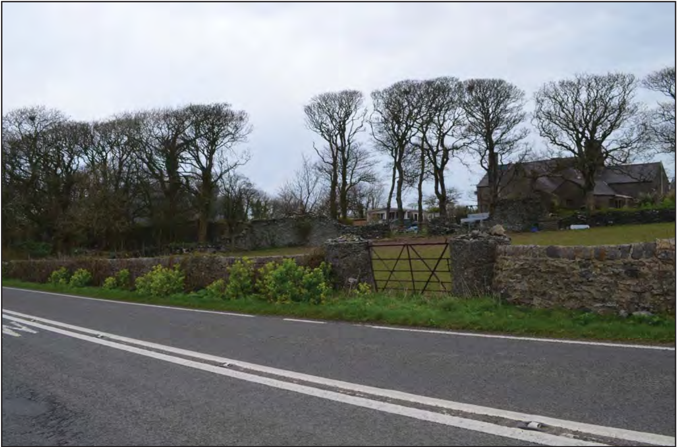
Plate 231: Asset 257, perimeter wall, Cefn Coch, viewed from the SW.