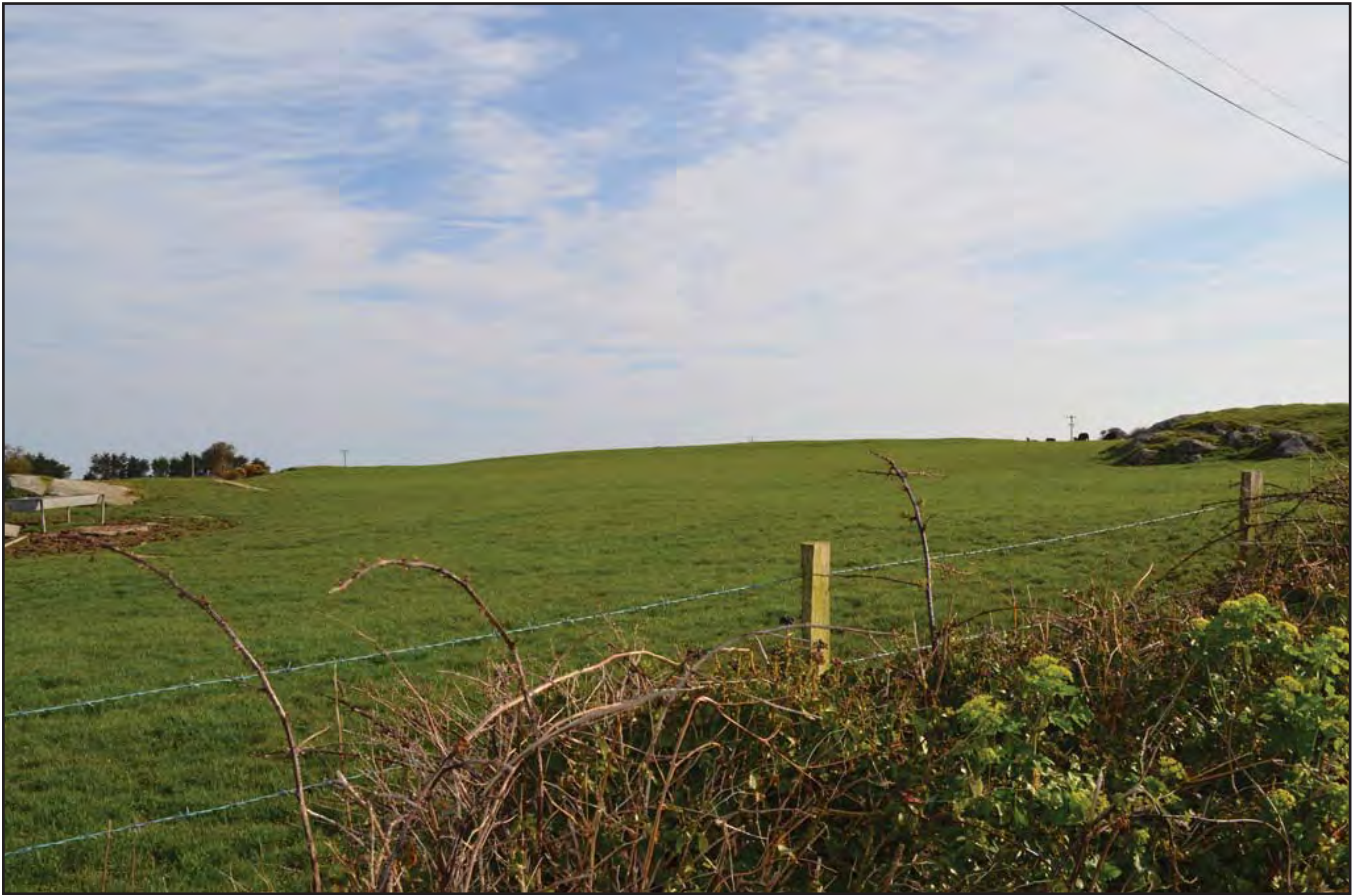
Plate 259: Asset 287, SW end of Hilltop enclosure, viewed from lane to SW.