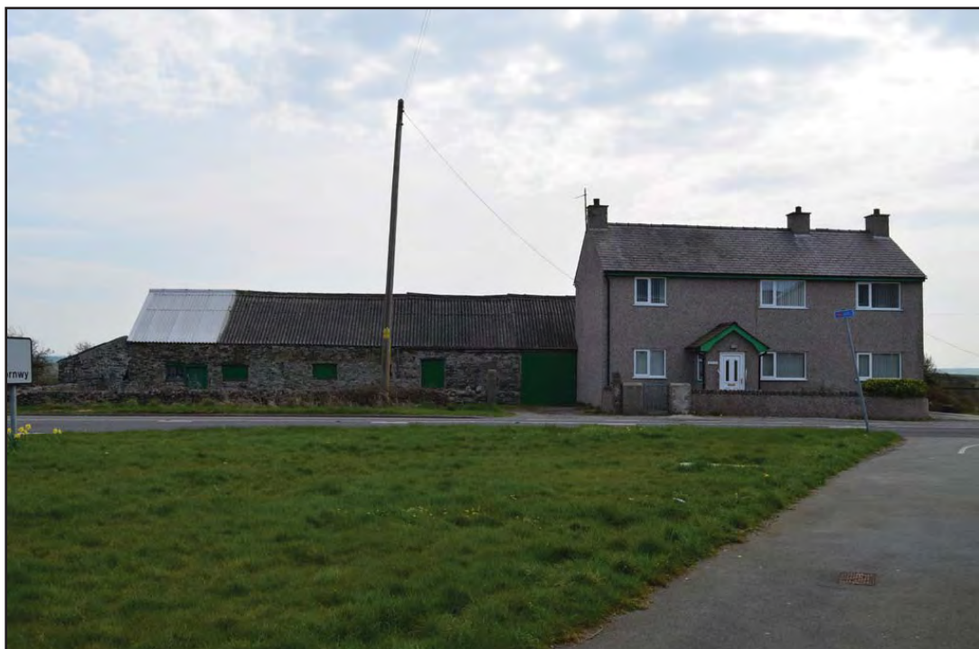
Plate 190: Asset 212, Pedair, viewed from the NW.