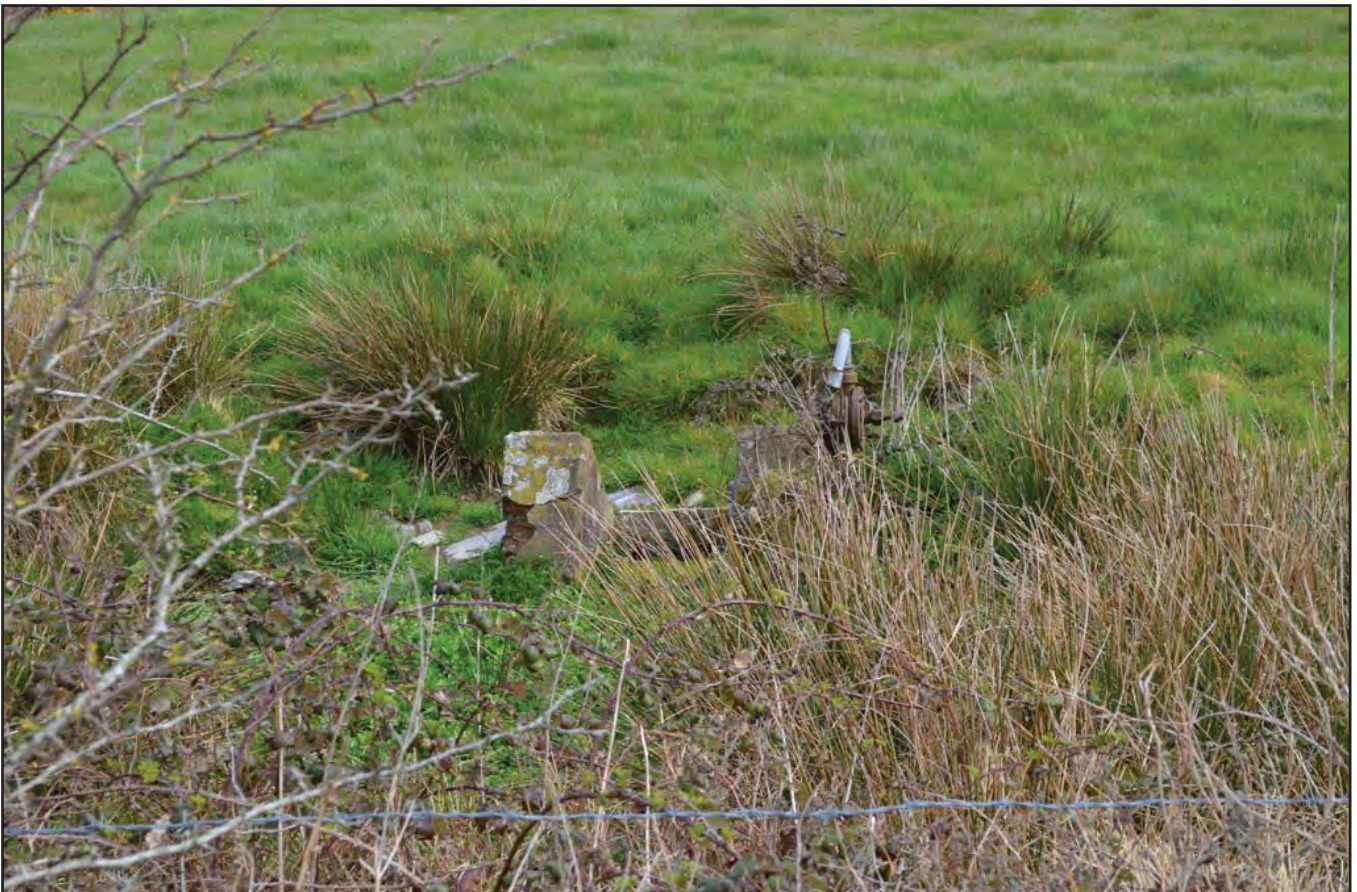
Plate 254: Asset 281, well and pump mechanism W of Cae Gwin, viewed from the W.