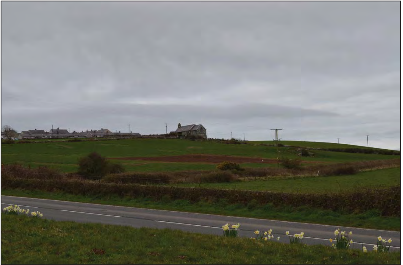
Plate 161: Asset 177, recently excavated prehistoric settlement, viewed from layby at side of A5025 to the ENE.