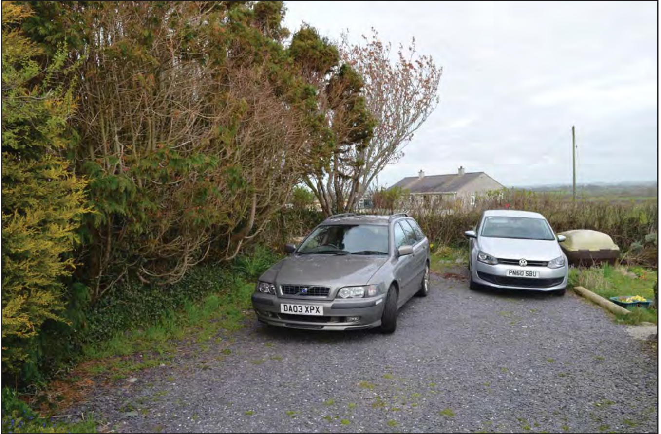
Plate 125: Asset 137, site of Building N of Bryn Tirion, viewed from the W.