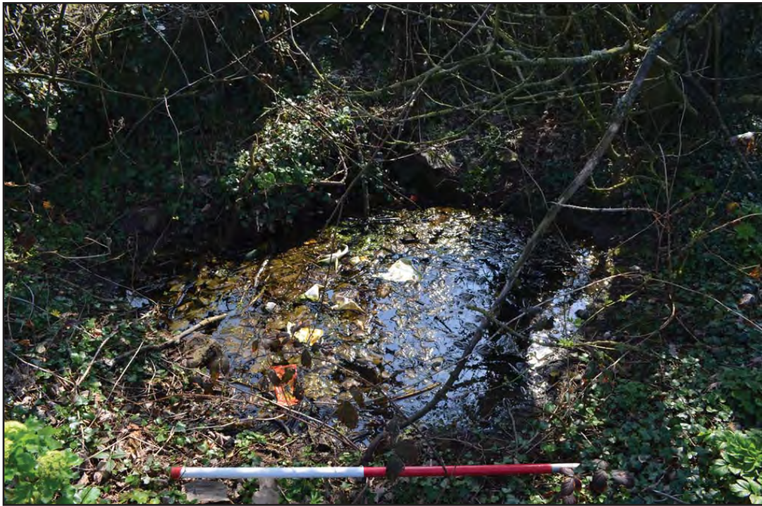
Plate 221: Asset 245, well E of Melin Ty'n y Felin, viewed from the NW.