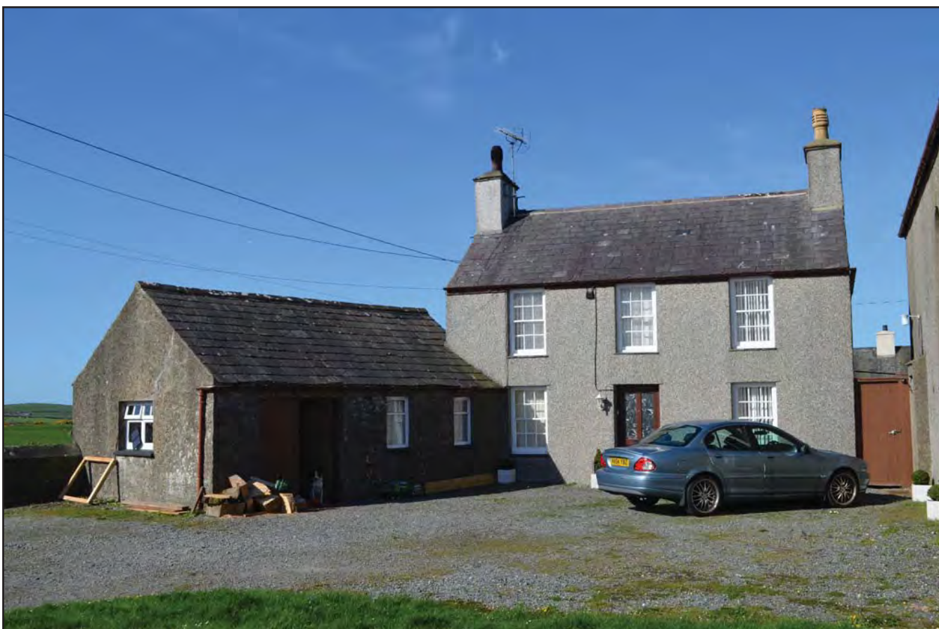
Plate 086: Asset 099, Ty Capel and outbuilding, viewed from the E.