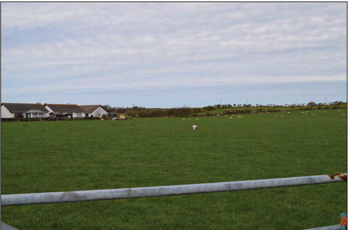
Plate 304: Route of proposed Llanfachraeth bypass E of the village, viewed from the SSE as it crosses lane NW of Bedo.