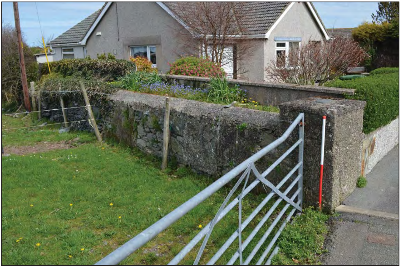
Plate 063: Asset 072, remains of N-S wall, to SW of Arosfa, viewed from the SW.