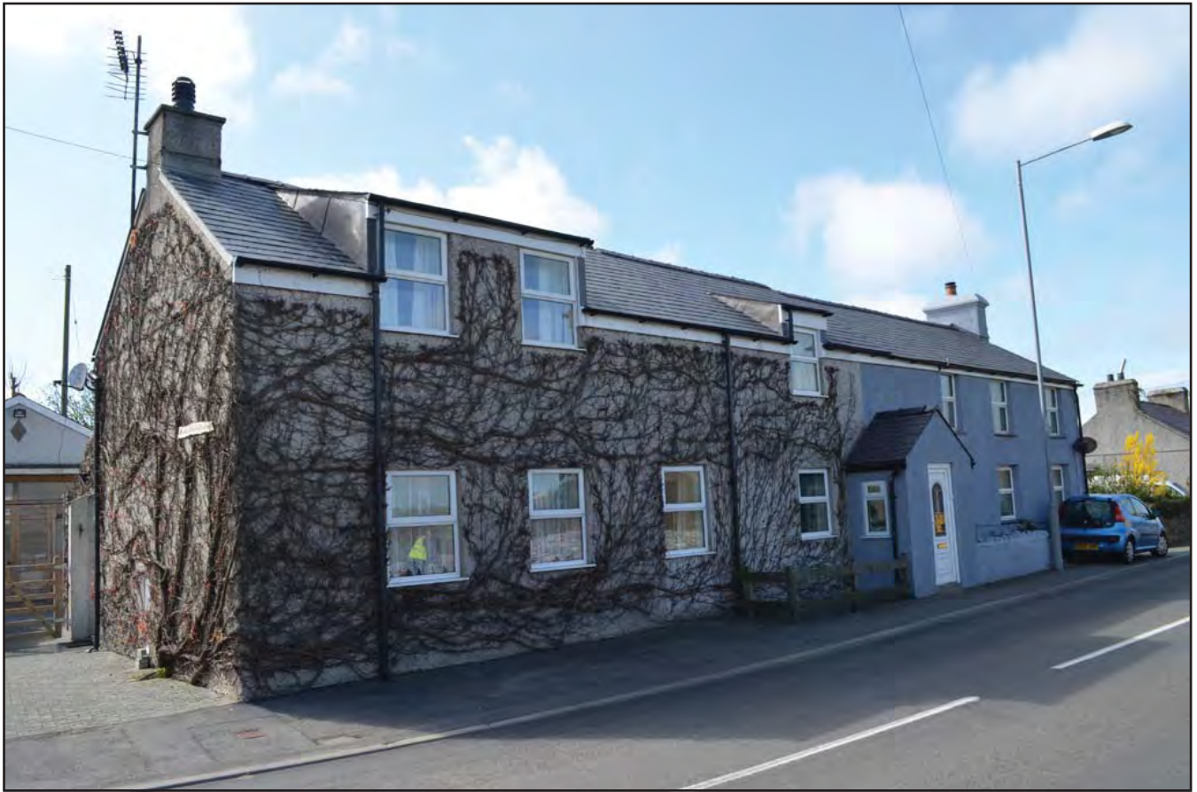
Plate 095: Asset 108, Mona Stores with later addition, viewed from the SE.