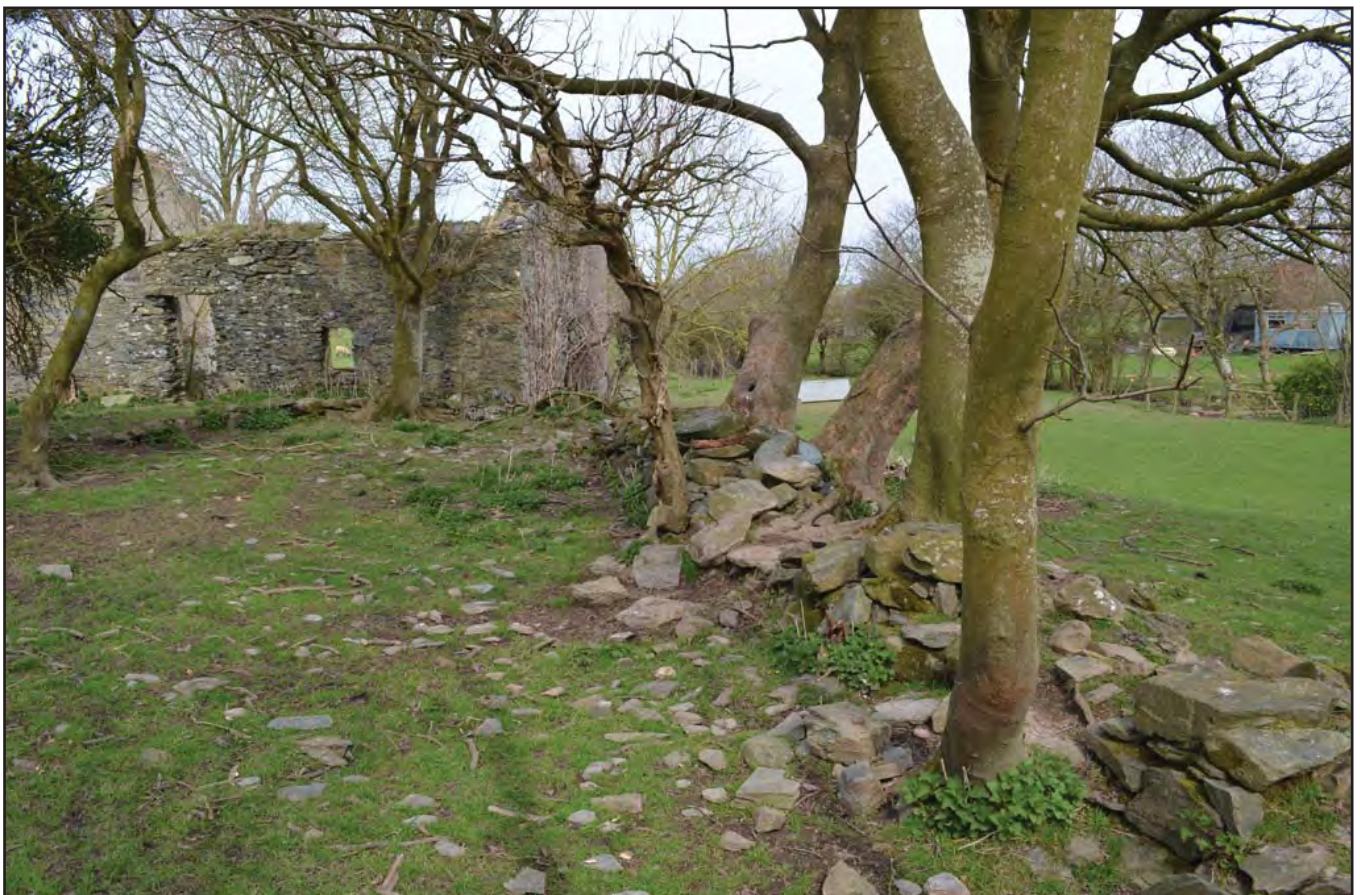
Plate 246: Asset 274, path of Mill Race for watermill Felin Cefn Coch, viewed from the S.