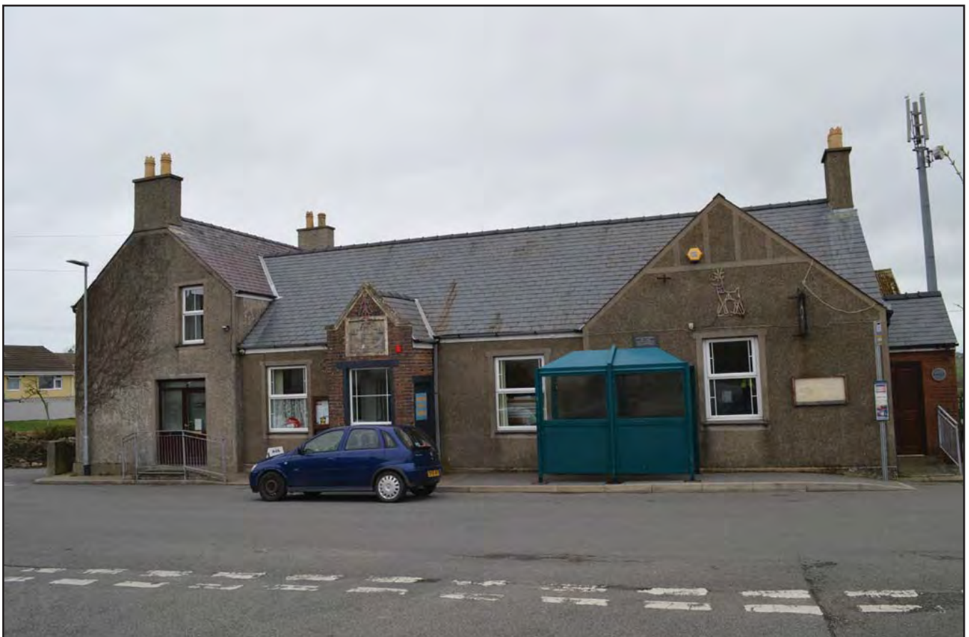
Plate 154: Asset 169, Llanfaethlu Coffee House, viewed from the S.