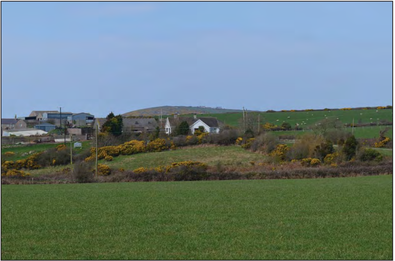
Plate 185: Asset 207, Bod-wyn, viewed from the SE.