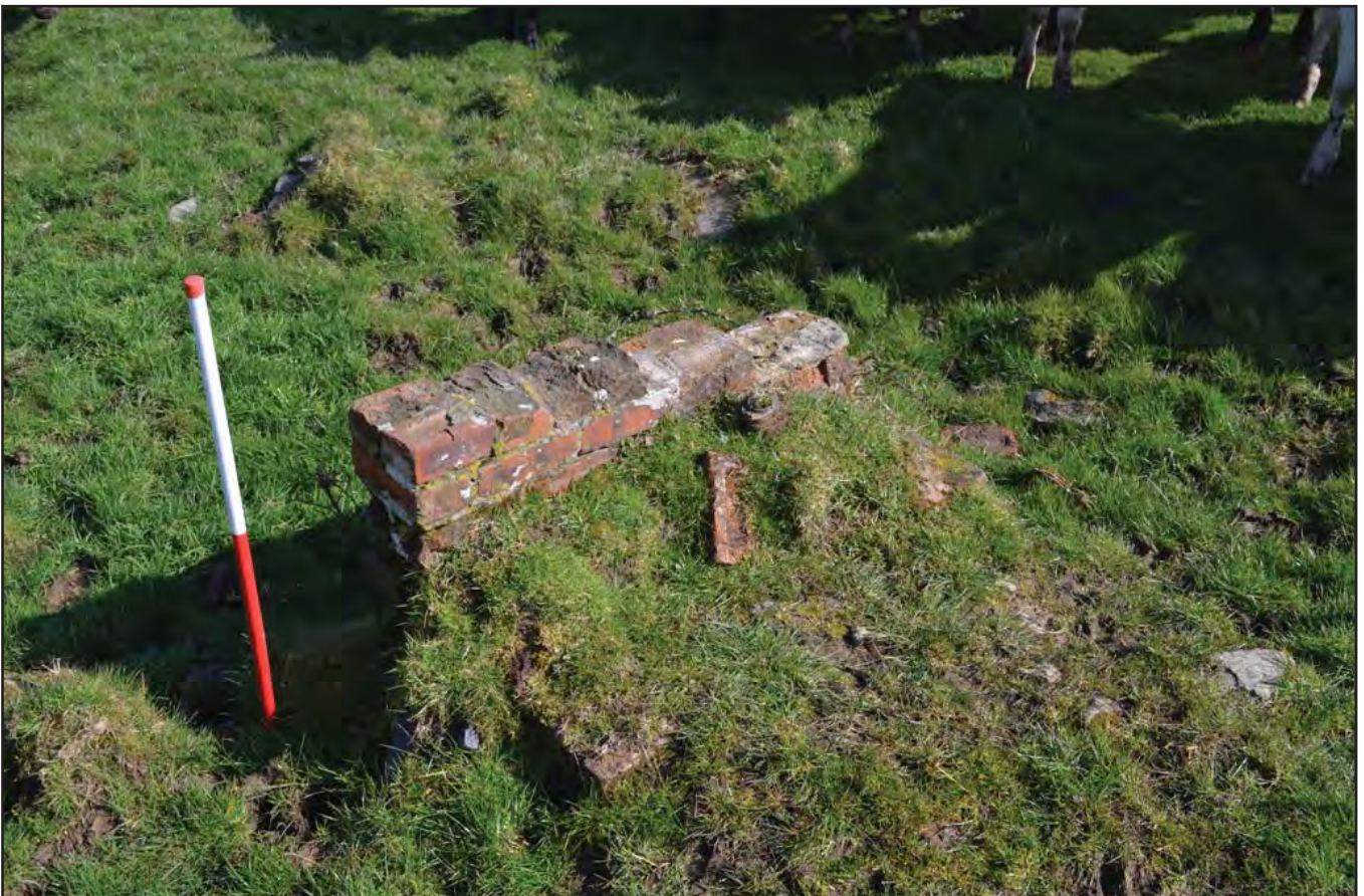
Plate 288: Asset 317, Well E of Tyddyn-Goronwy, viewed from the S.