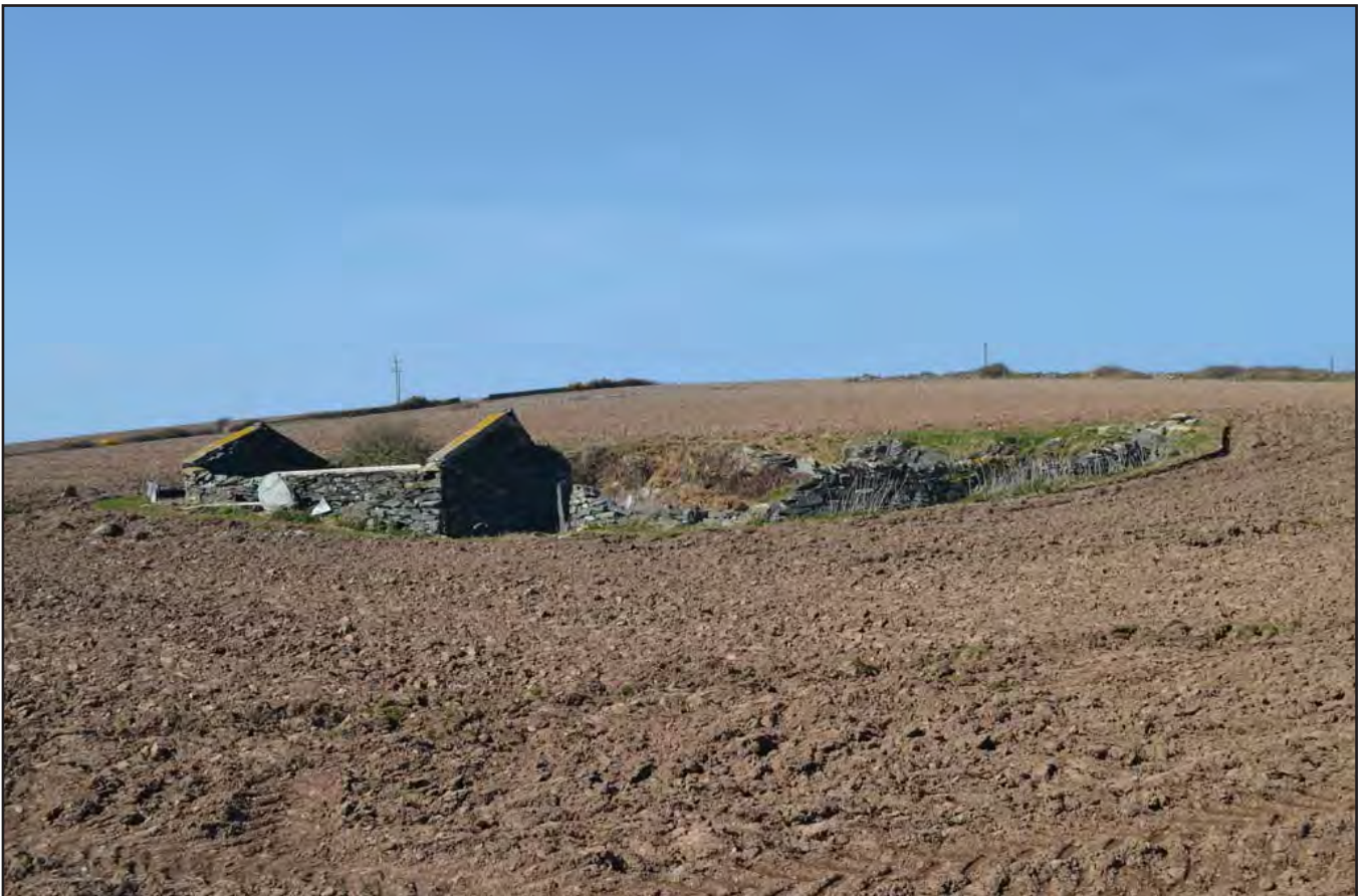
Plate 262: Asset 290, ruined building in quarry, viewed from the SE.