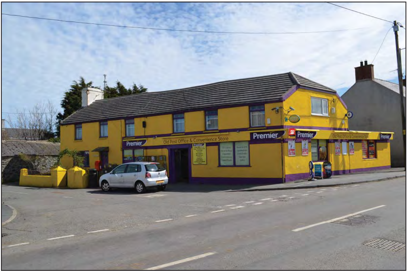
Plate 057: Asset 066, Old post office, Llanfachraeth, viewed from the NW.