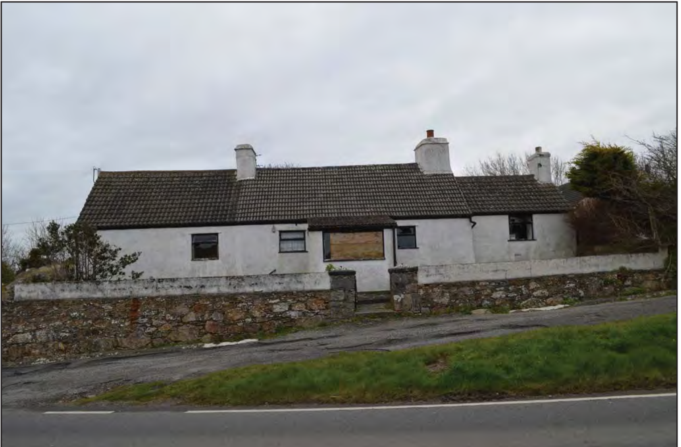
Plate 224: Asset 249, two buildings south of Pen y Groes Arthur, viewed from the SW.