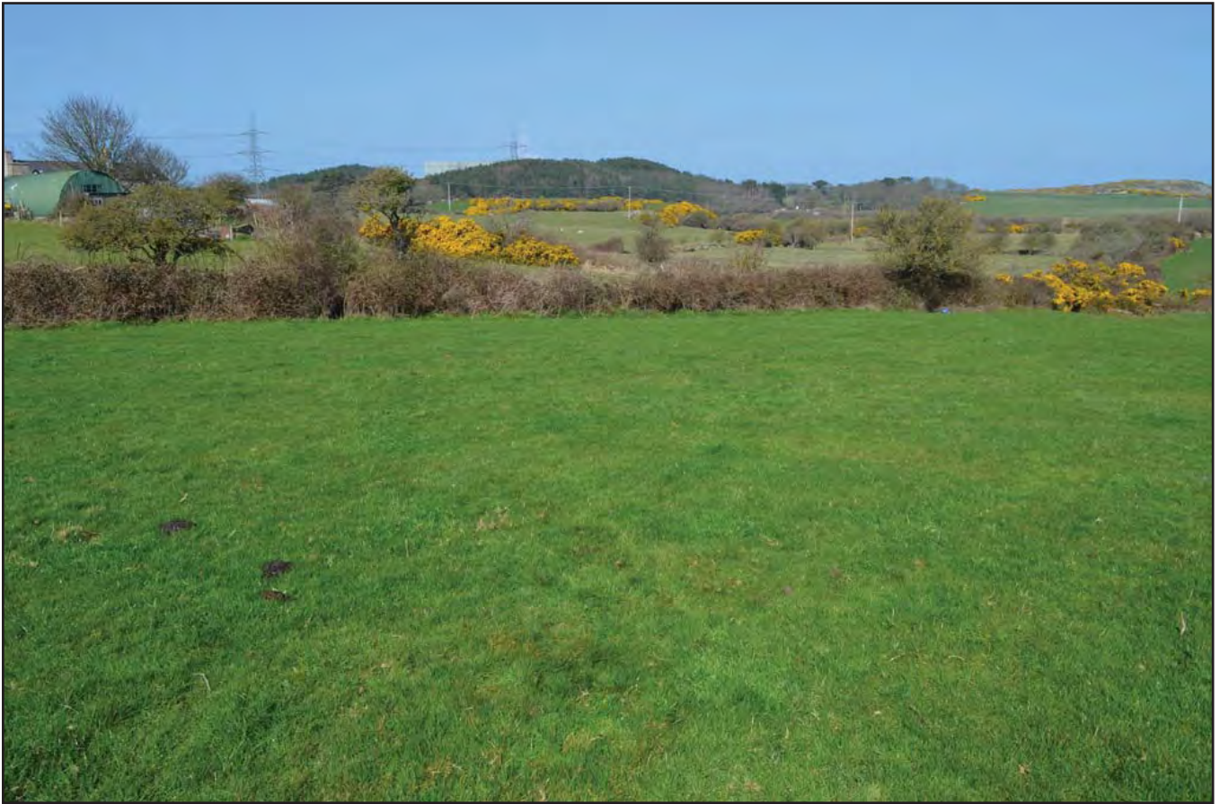
Plate 287: Asset 316, site of Building E of Tyddyn-Goronwy, viewed from the SE.