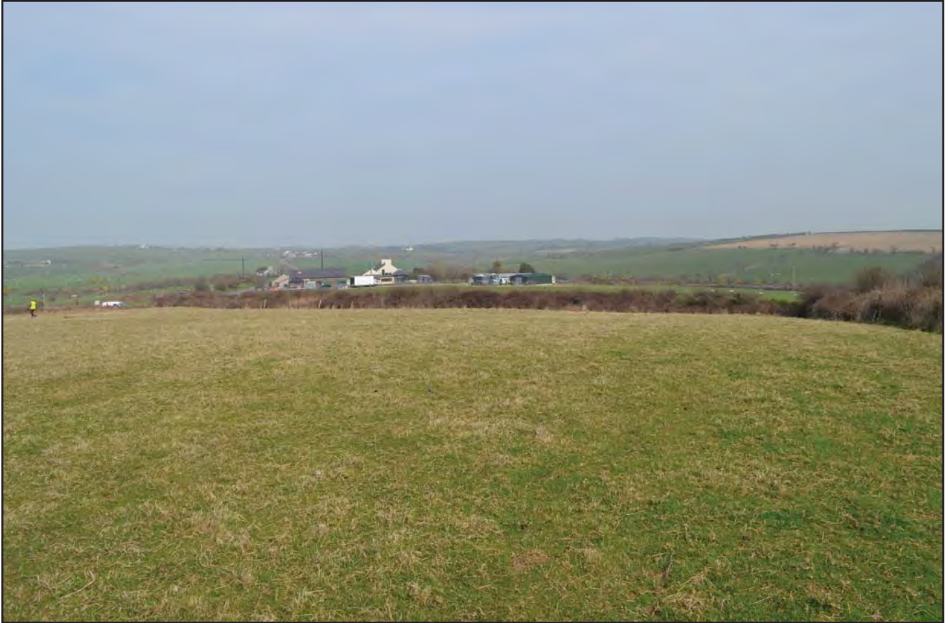
Plate 315: Route of proposed road improvement, looking from SW to NE across field NE of Bryn Gwyn to road junction.