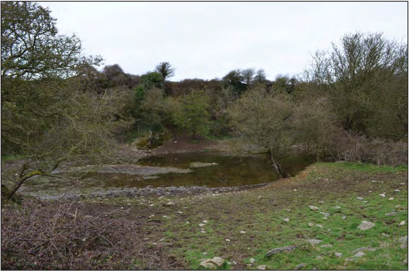
Plate 165: Asset 181, 'Old Quarry' to the southwest of Pant, viewed from the SE.