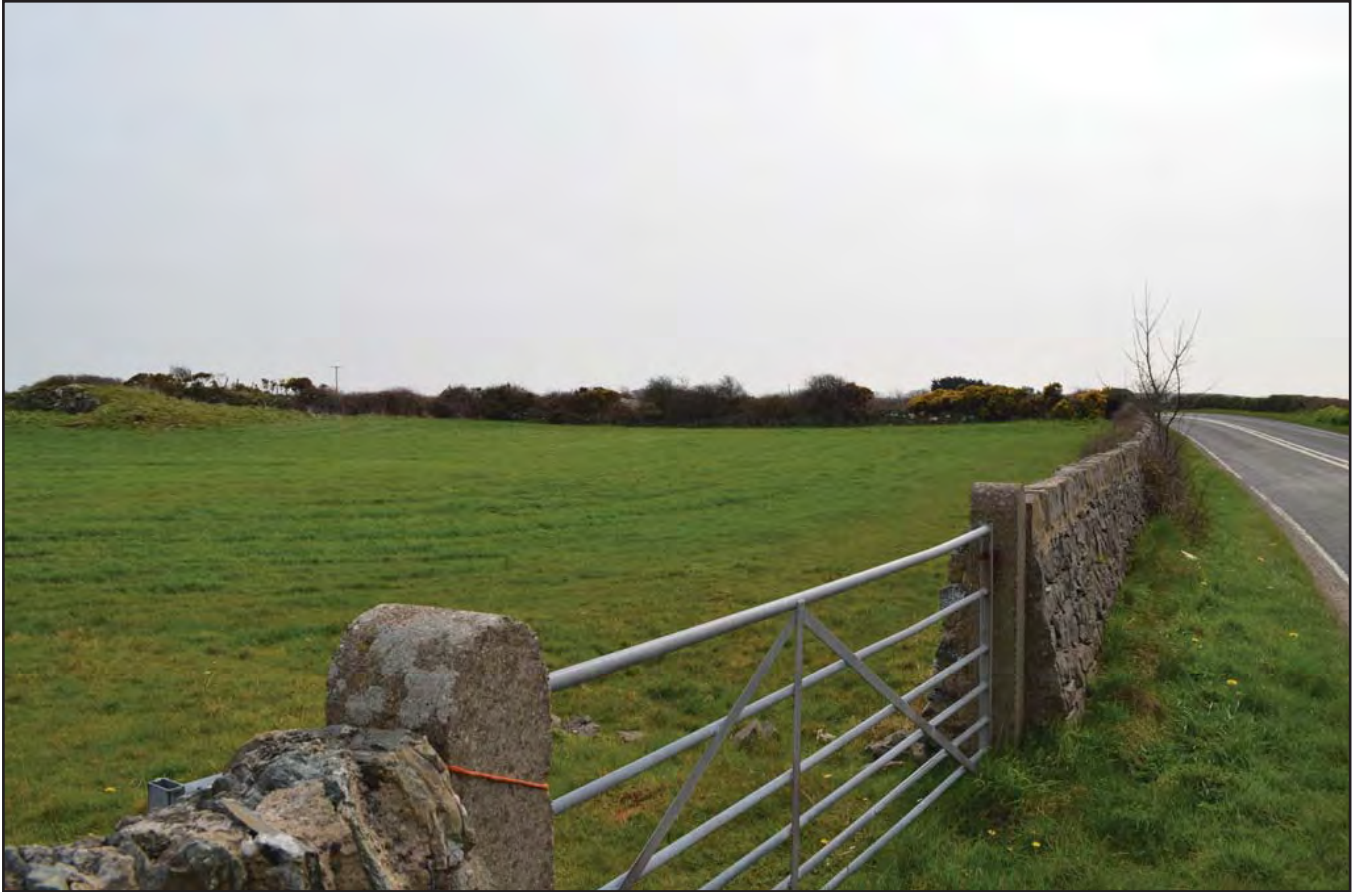
Plate 333: Route of proposed road improvement, viewed from the N looking S across fields SE of Nanner Road.