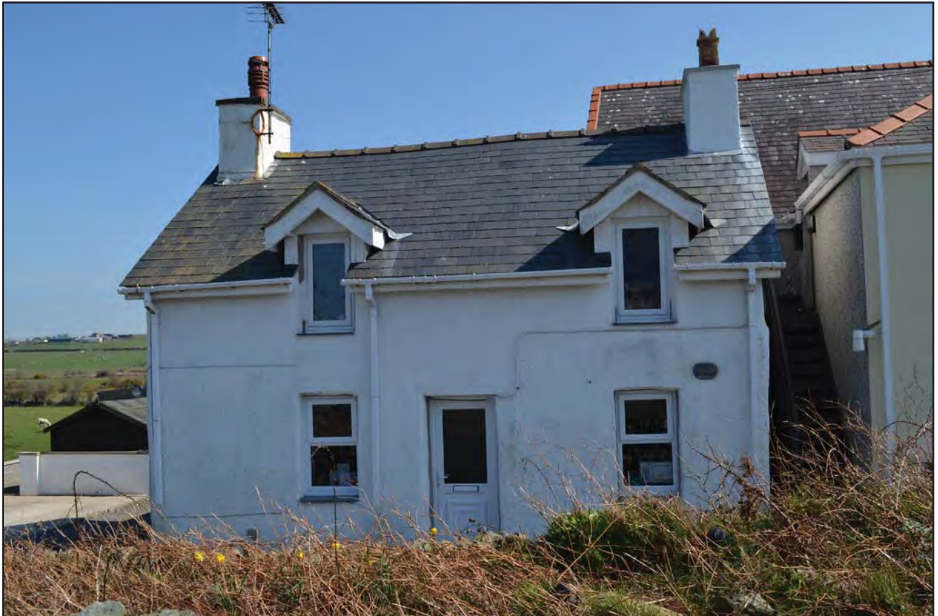
Plate 266: Asset 296, Tyn Llidiart, viewed from the NW.