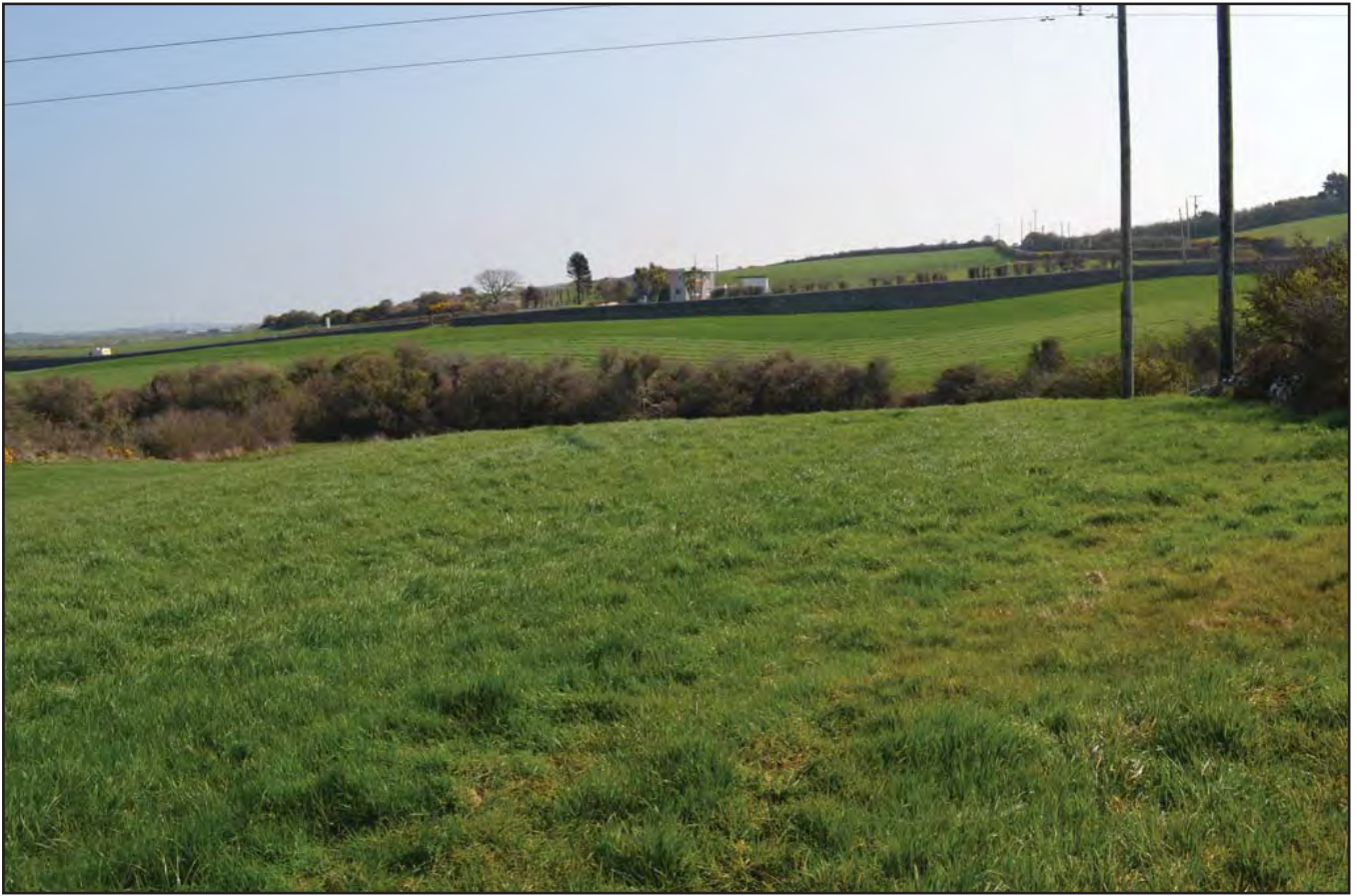
Plate 229: Asset 255, site of building E of Carreg Cam, viewed from the SW.