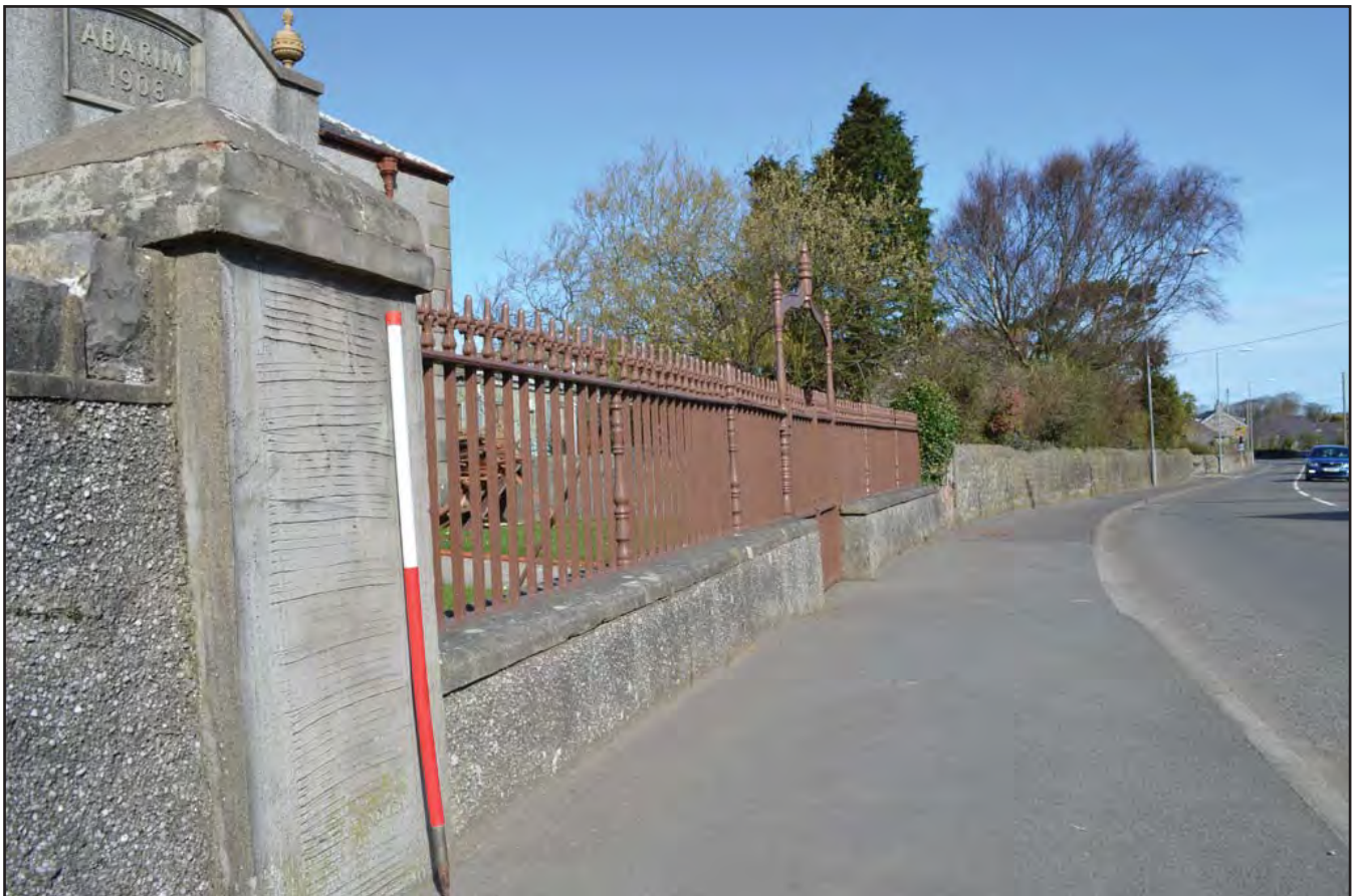
Plate 088: Asset 101, wall, railings and gate at Capel Abarim, viewed from the SE.