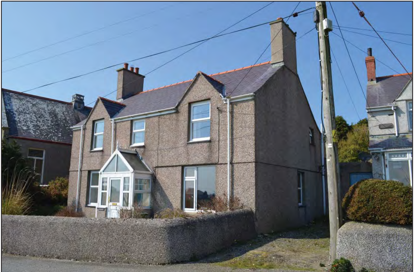
Plate 206: Asset 229, Capel Bethel Hen Schoolhouse, viewed from the SE.