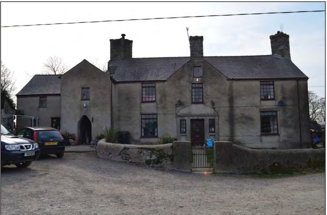
Plate 232: Asset 258, Cefn-coch House, viewed from the E.