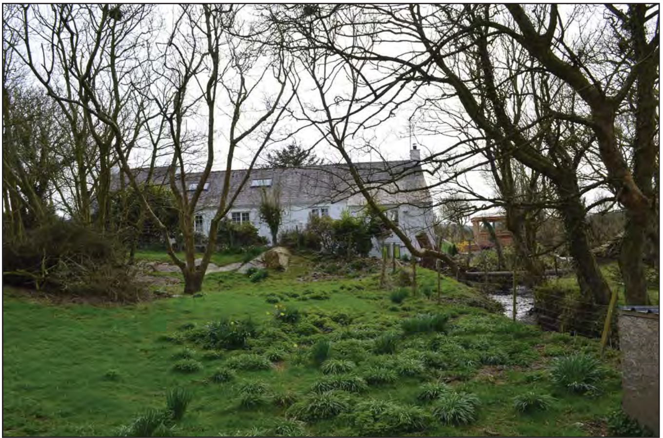
Plate 245: Asset 273, Melin Cefn Goch and tail race, viewed from the N.