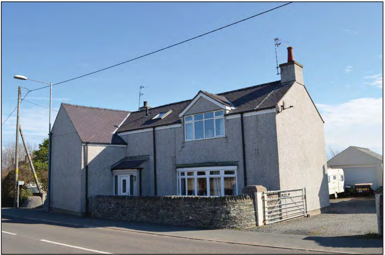
Plate 089: Asset 102, Graig Llwyd, viewed from the SW.