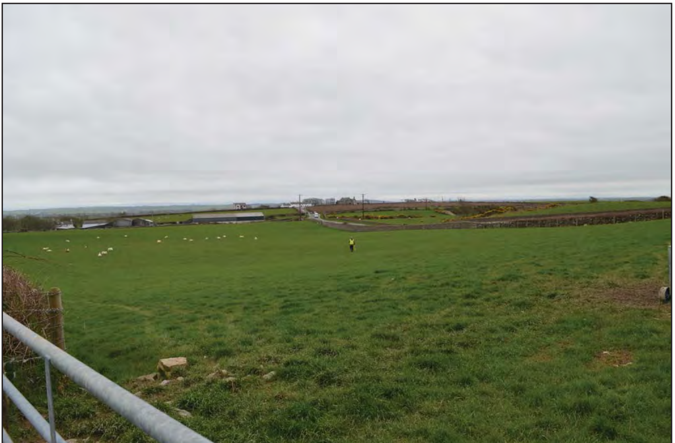
Plate 308: Route of proposed Llanfaethlu bypass through fields E of Rhos-ty-mawr, viewed from the NW towards Black Lion Inn.