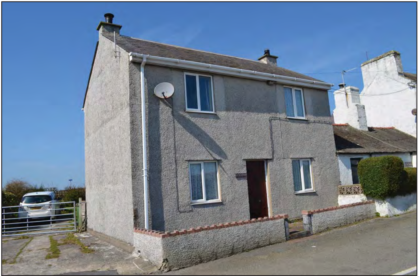
Plate 275: Asset 304, Ty'n Refail, viewed from the SE.