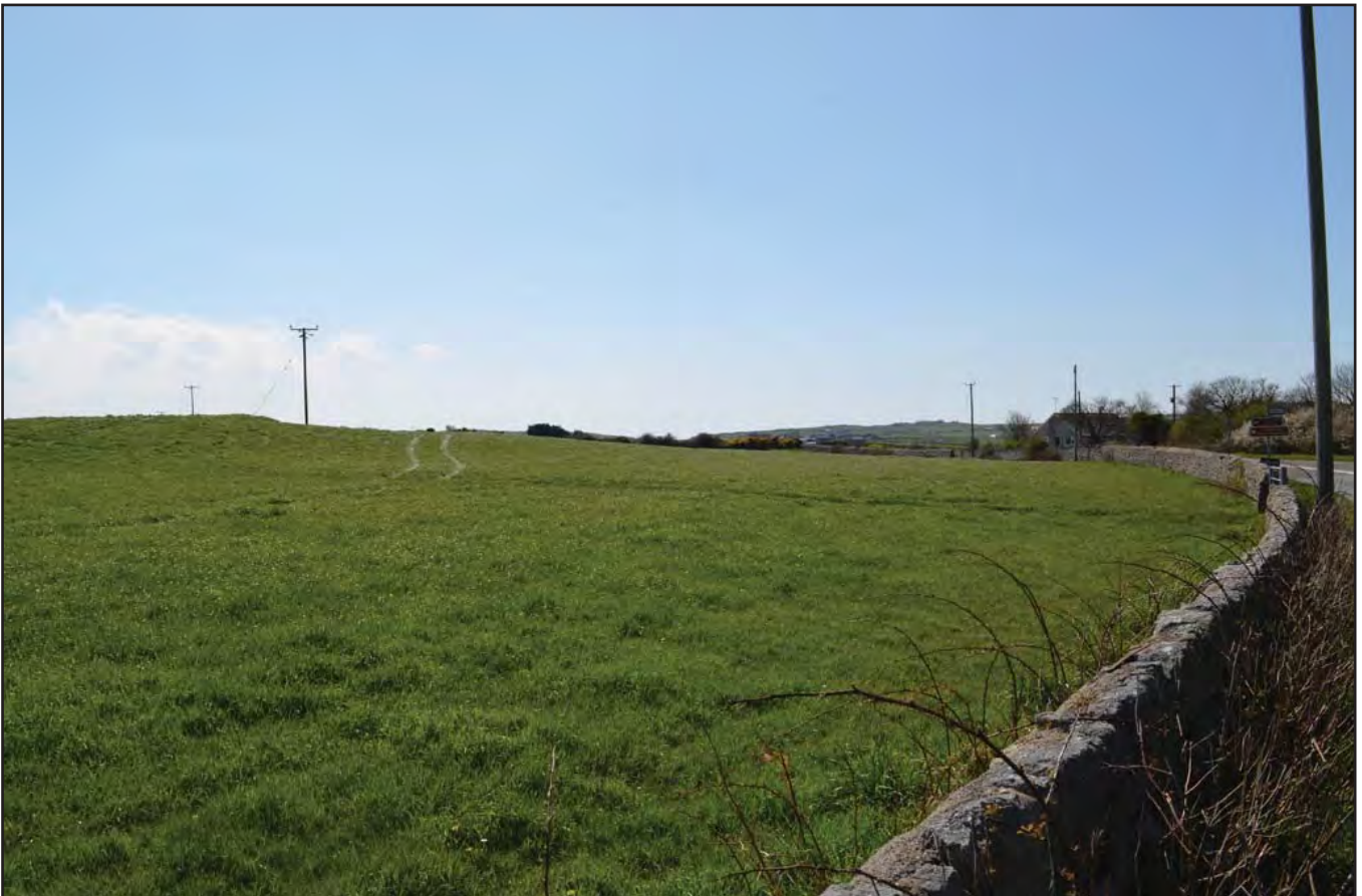
Plate 334: Route of proposed road improvement, viewed from the NE looking SW across fields E of Nanner Road.