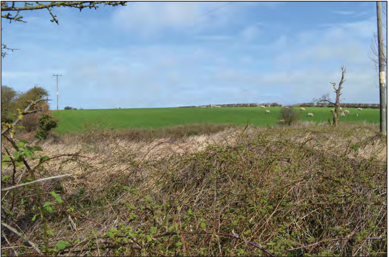
Plate 113: Asset 126, site of footbridge NE of Tan-yr-allt, viewed from the S.