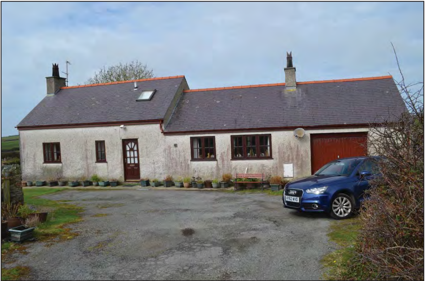
Plate 121: Asset 134, Gorsedd Tefyn, viewed from the NE.