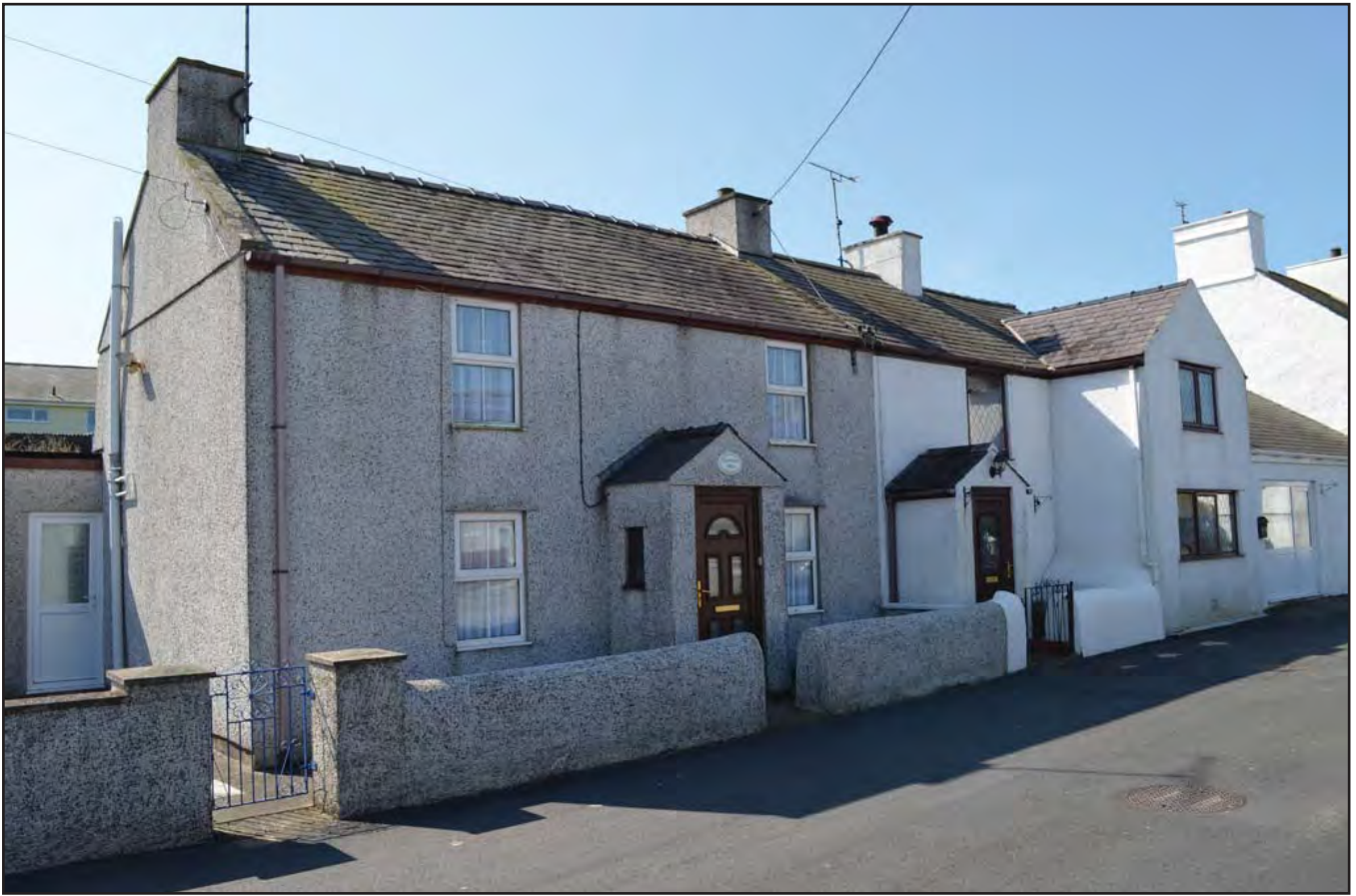
Plate 271: Asset 300, Meadow View, SE end of four building terrace at Tregele, viewed from the ENE.