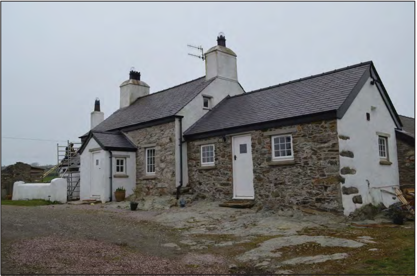
Plate 148: Asset 163, Caer-Bryniau, viewed from the ESE.