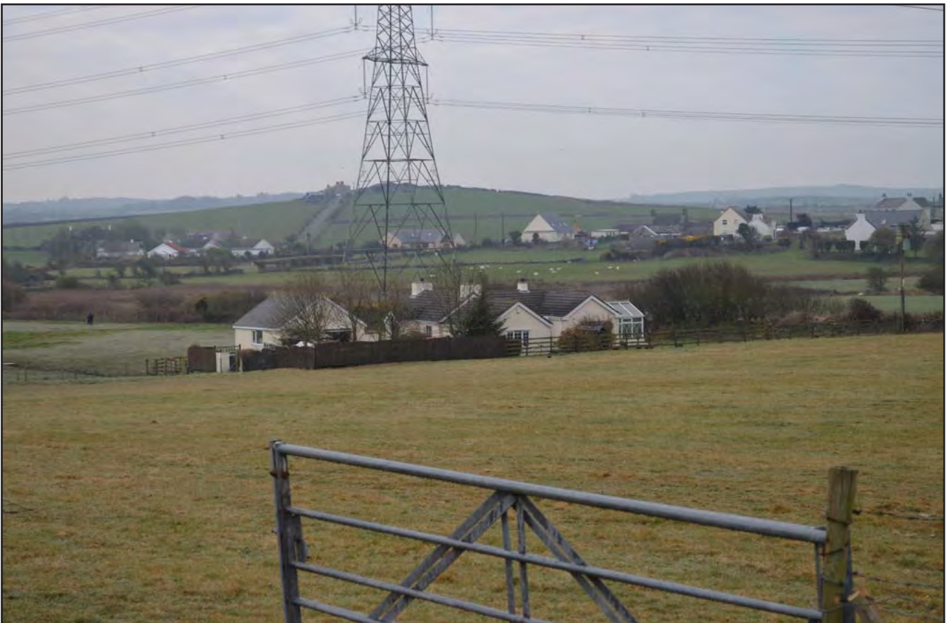
Plate 284: Asset 313, Llety, viewed from the NE.