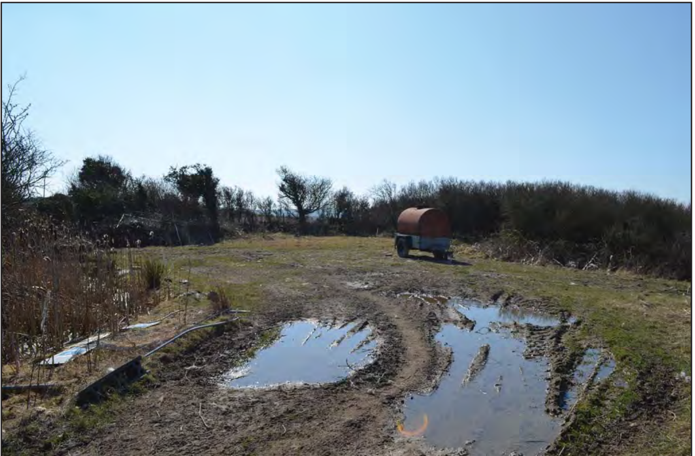
Plate 264: Asset 293, site of demolished buildings at Penrallt, viewed from the NE.