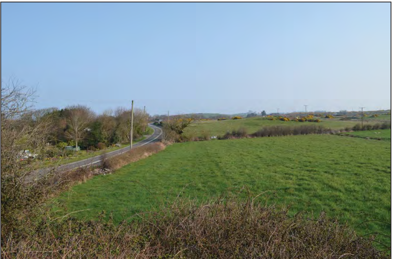
Plate 332: Route of proposed road improvement, looking from S to N across fields, viewed from outcrop E of Pandy.