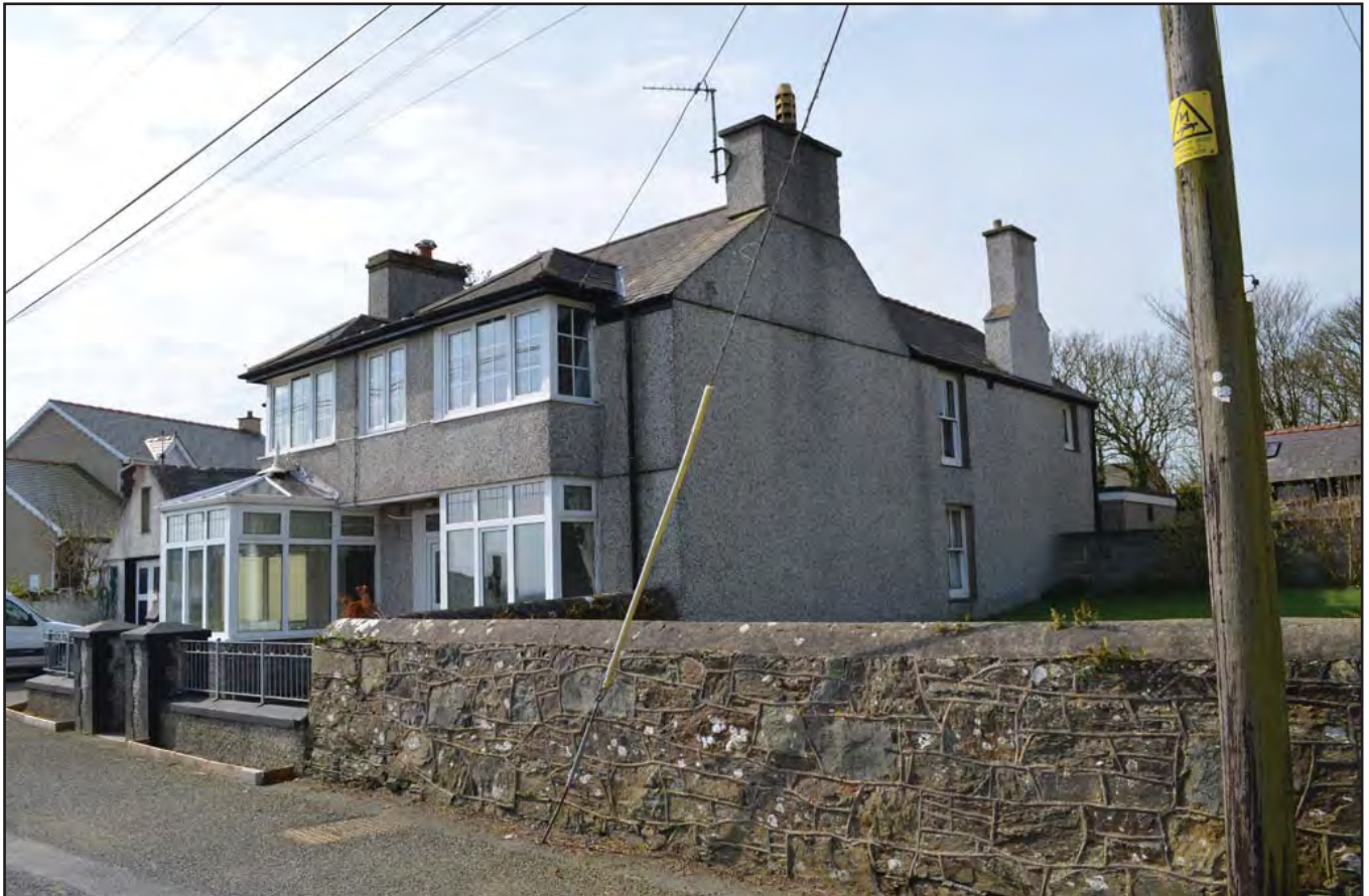
Plate 188: Asset 210, Fron Deg, viewed from the NE.