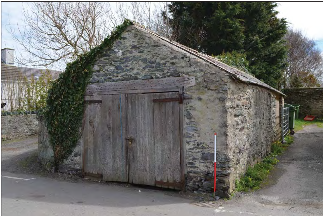
Plate 061: Asset 070, outbuilding N of old post office, viewed from the NW