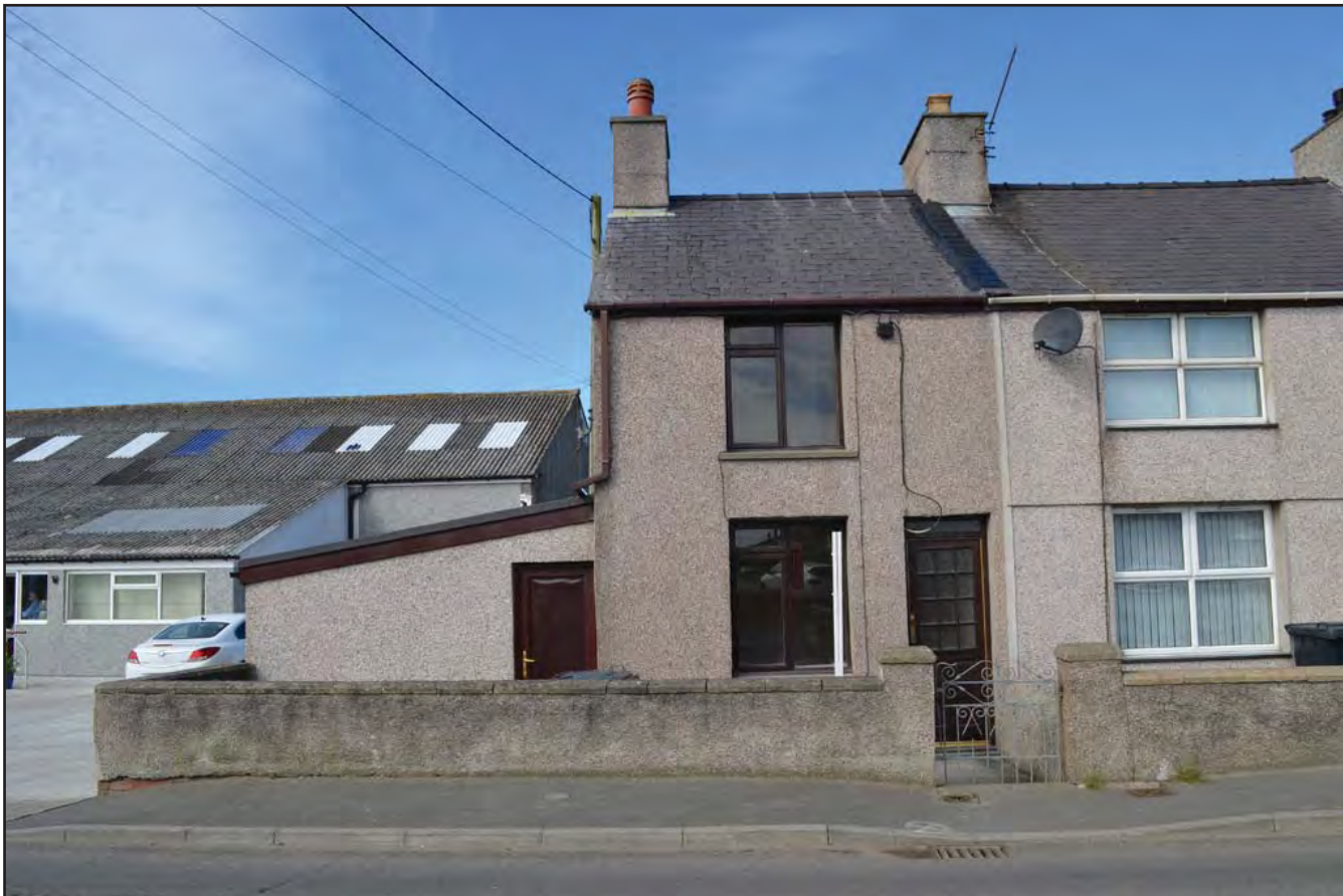
Plate 075: Asset 088, Glasfryn, viewed from the E.