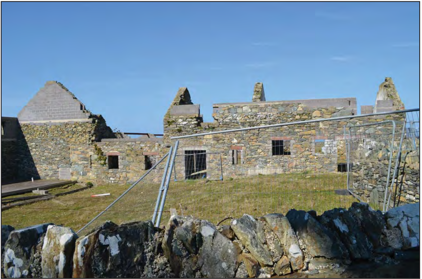
Plate 261: Asset 289, NW-SE wing of Groes-fechan, viewed from the SSW.