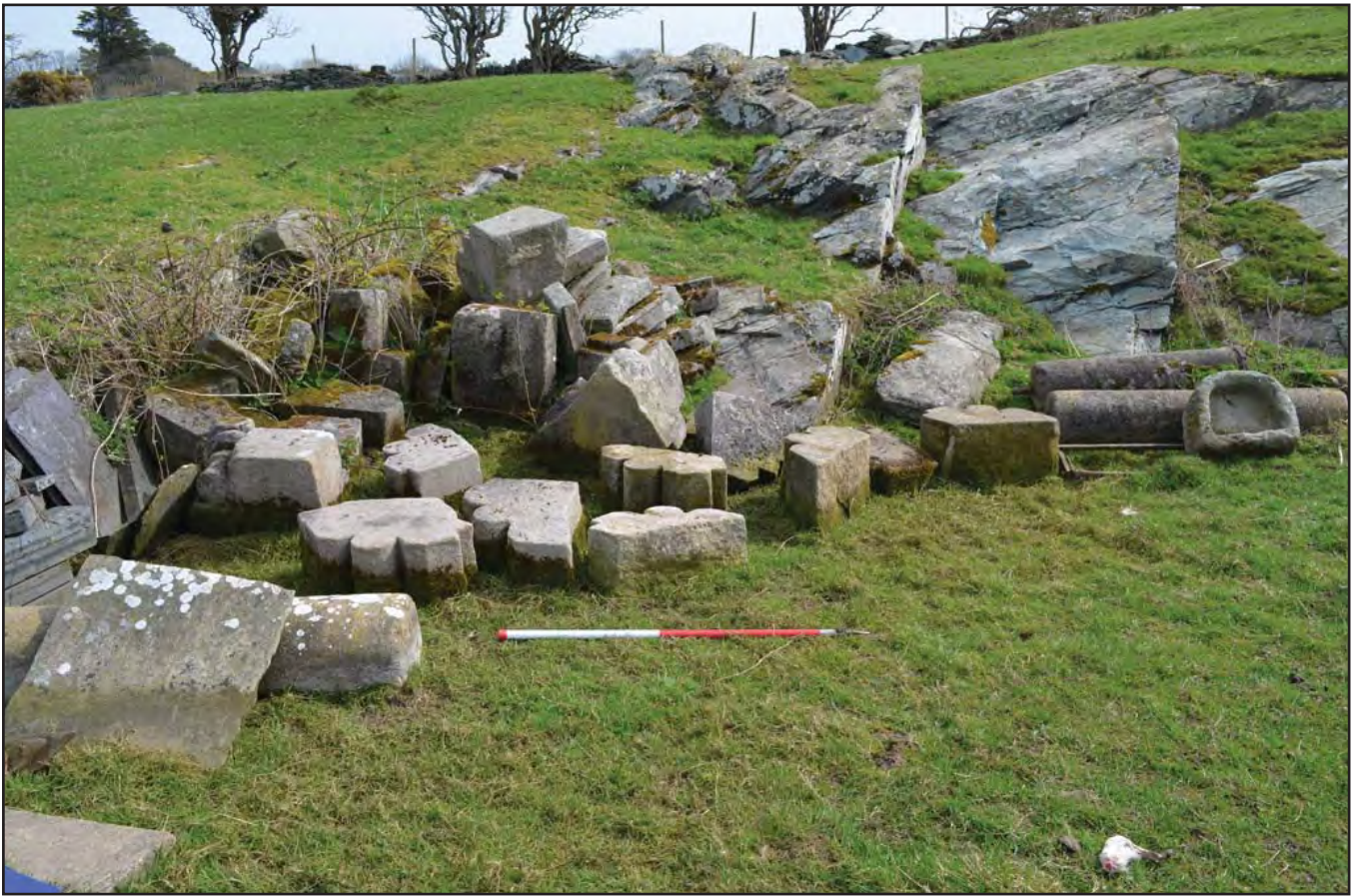
Plate 253: Asset 280, quarry containing masonry dump NW of Ty'n y Felin windmill, viewed from the W.