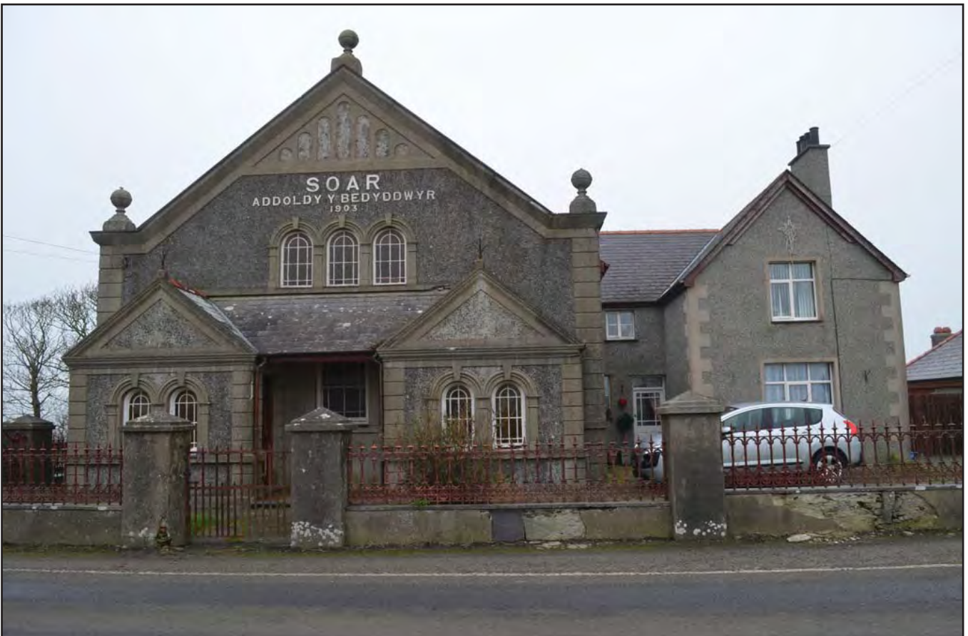
Plate 132: Asset 147, Capel Soar, viewed from the NW.