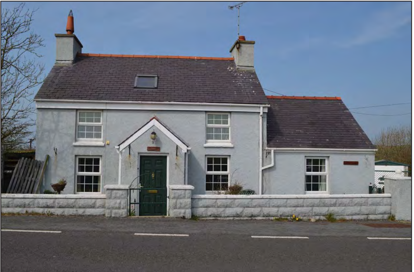
Plate 180: Asset 200, Pen-y-cae, viewed from the SE.