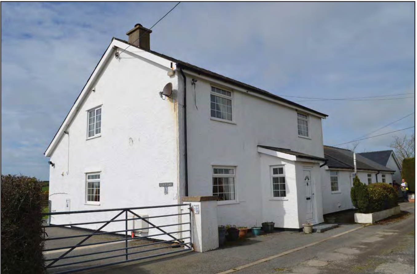
Plate 116: Asset 129, Rhos-y-gaer, viewed from the E.