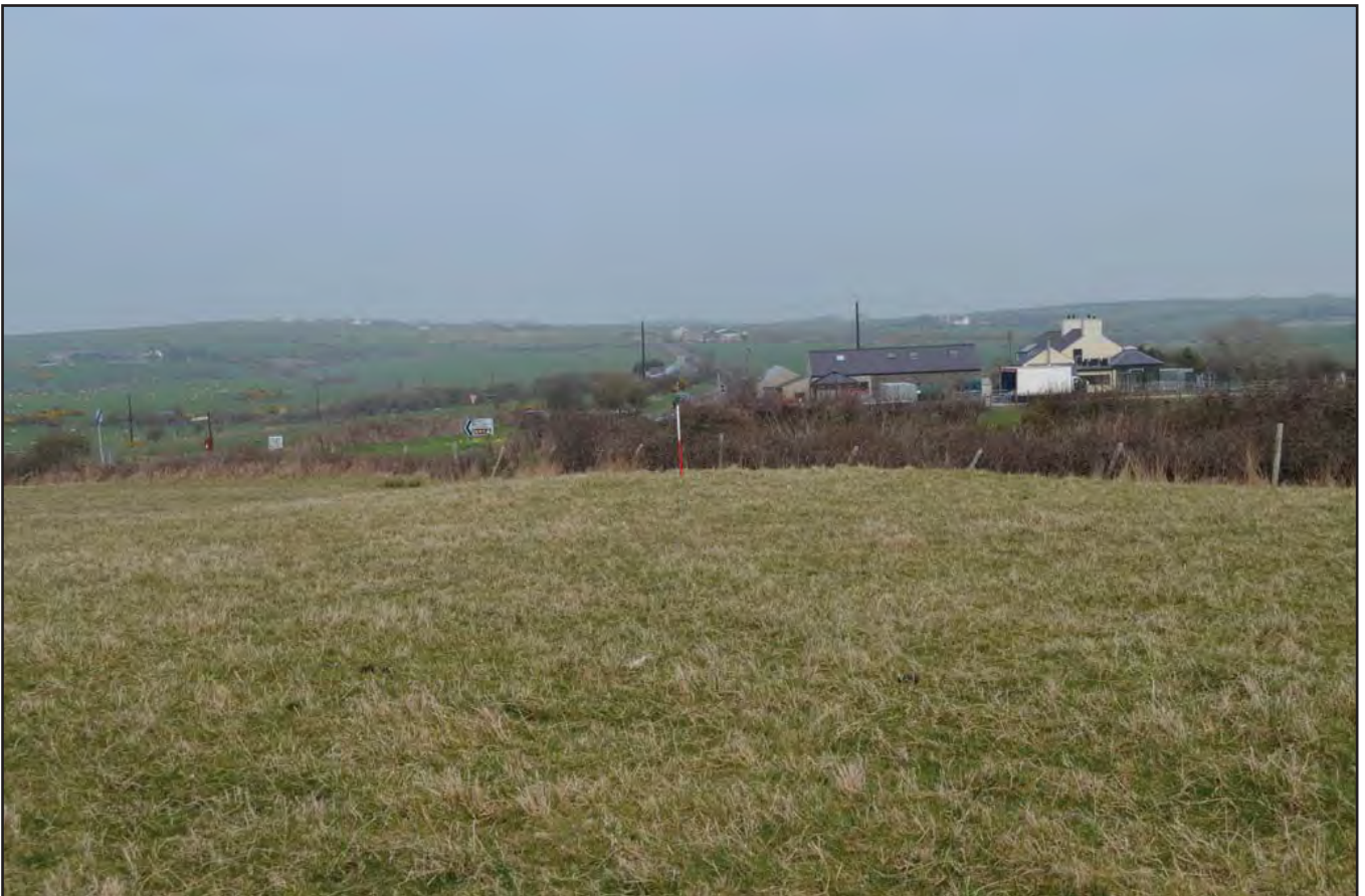
Plate 178: Asset 198, oval mound (possible barrow), viewed from the SW.