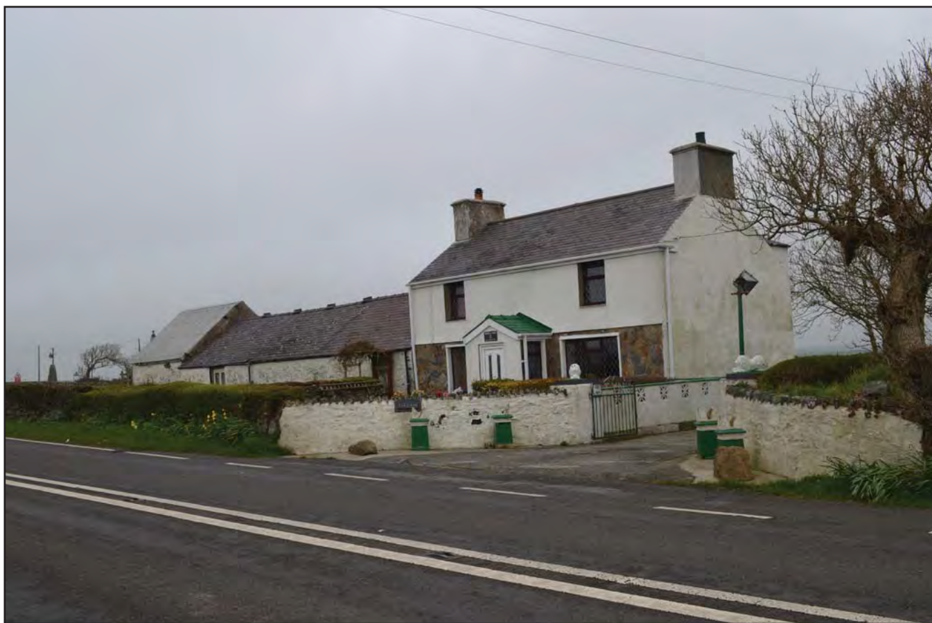
Plate 129: Asset 144, Ty'n-Llech, taken from the SW.