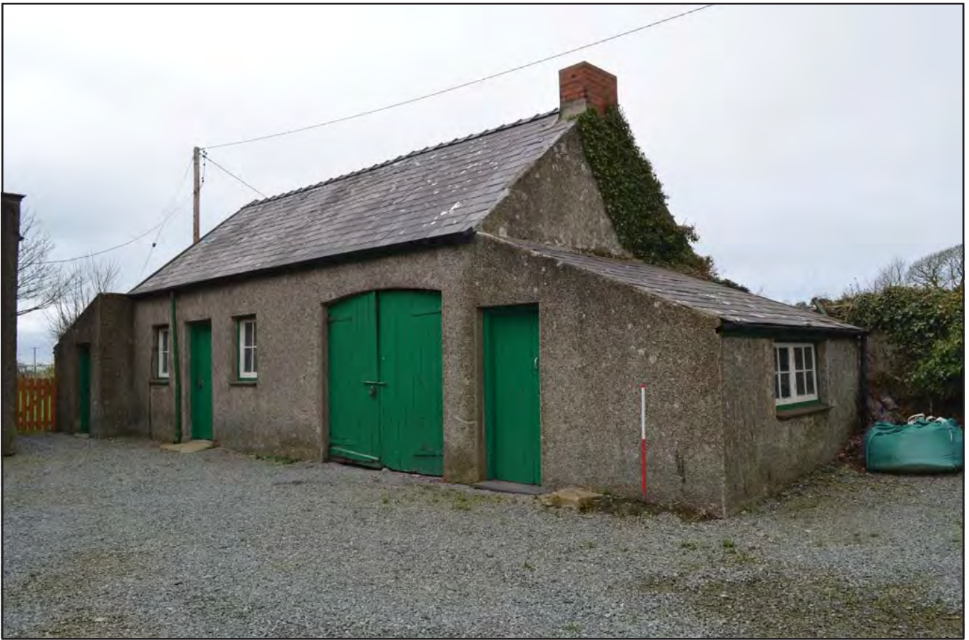
Plate 151: Asset 166, outbuilding at Ebenezer Chapel, viewed from the NE.