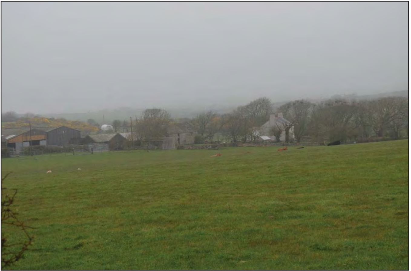
Plate 141: Asset 157, Fadog Frech farm, viewed from the Black Lion Inn junction.