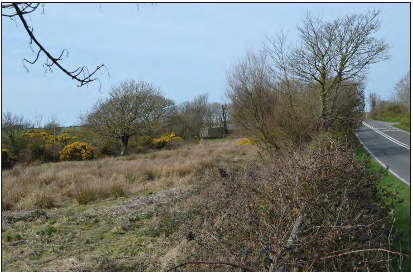
Plate 236: Asset 262, site of Mill Pond and Leat to the S of Pandy Cefn Coch, viewed from the SE.