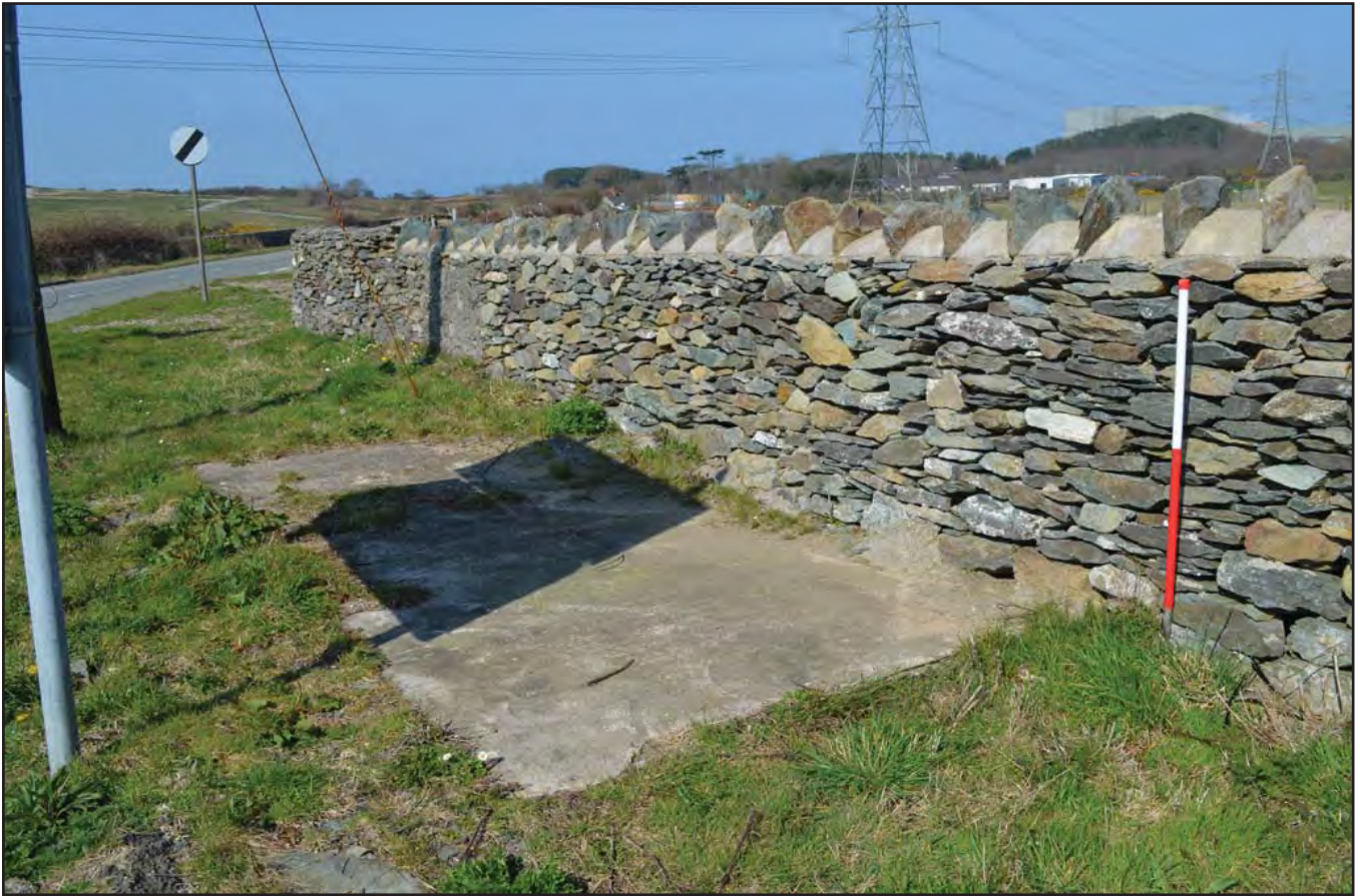
Plate 283: Asset 312, surviving concrete floor of outbuilding at Pen-lon, viewed from the SE.